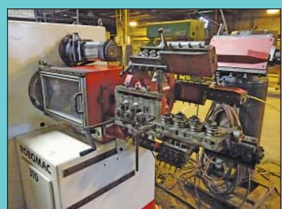
6-Station Straightening Turret