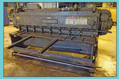
10 Ga. X 8' Cincinnati Model 1008 Mechanical Shear