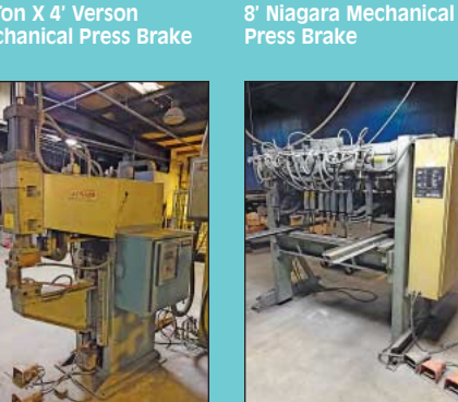
Special Ten-Head Ram Type Spot Welder Spot Welder