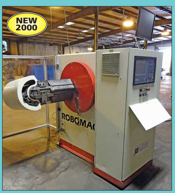
Latour Robomac Model 310 CNC 3D Wire Former