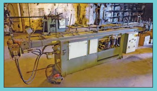
1" Bema Model G1AD Hydraulic Tube Bender