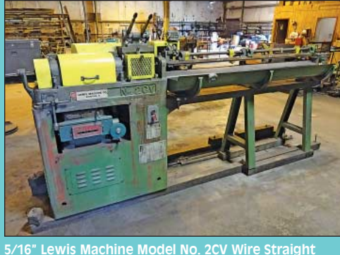
5/16" Lewis Machine Model No. 2CV Wire Straight