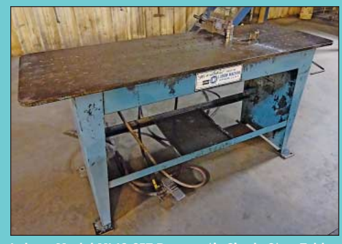
Lubow Model ML10-25T Pneumatic Single Stop Table