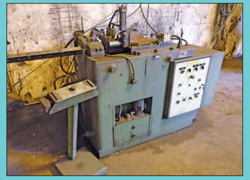
3/4" - 1.25" Bema Model PAN 5/2 Size and Swaging