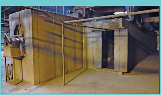
25' Wide X 75' Long X 10' High Natural Gas Pass Thru Cure