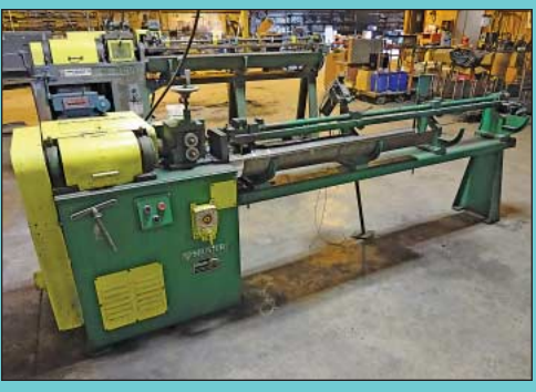
1/4" Shuster Model 1AVS Wire Straight and Cut Machine