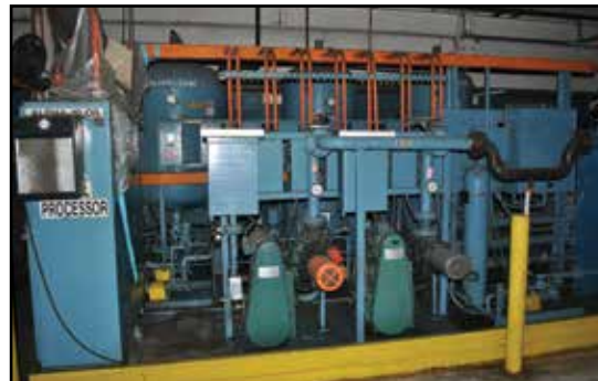
(3) Oil Processing Stations for Alpha 10 Oil w/Storage Tanks