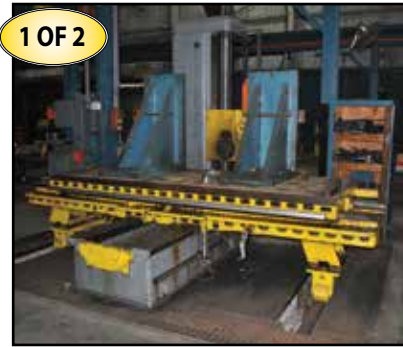
1 OF 2 (2) GIDDINGS & LEWIS 340T Horizontal Boring Mills