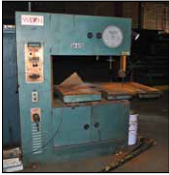
WILTON 36" Vertical Band