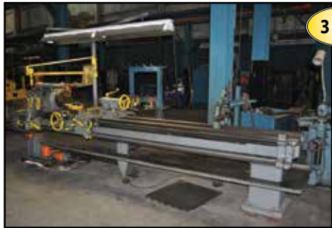
3 OF 7