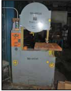
TANNEWITZ Di-Saw 22" Vertical Band Saw