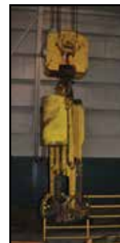
P&H Coil / Sheet Lifter