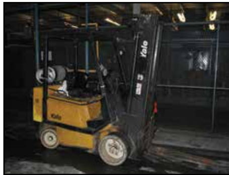
YALE 5,000-lb. Forklift