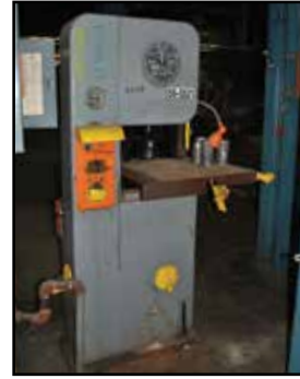
DOALL 15" Metalmaster Vertical Band Saw