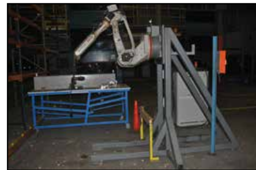
MOTOMAN SK16 6-Axis Robot