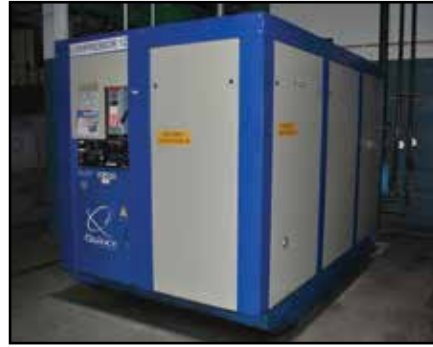
QUINCY Q51-1500 Rotary Screw Air Compressor