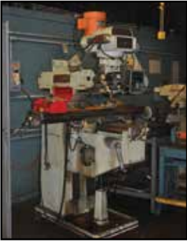
INGERSOLL RAND XLE Compressor Station