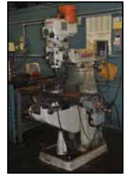
BRIDGEPORT 9' x 42' Vertical Mill