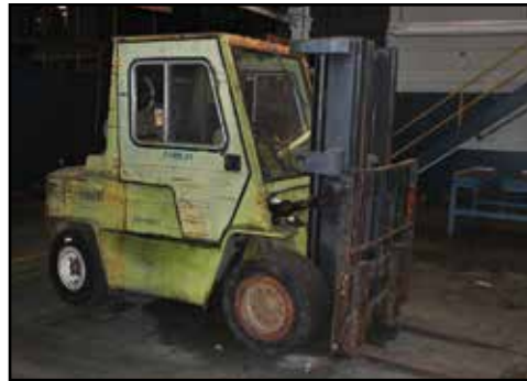
CLARK C500Y5100 10,000-lb. Forklift