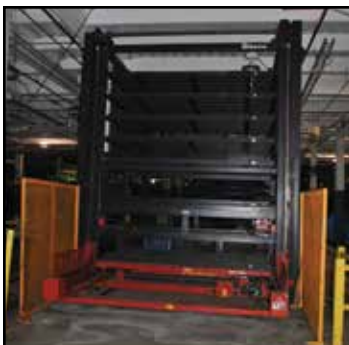
AMADA Sheet Stock Storage System