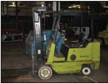
(2) CLARK GC52MC 5,000-lb. Forklifts