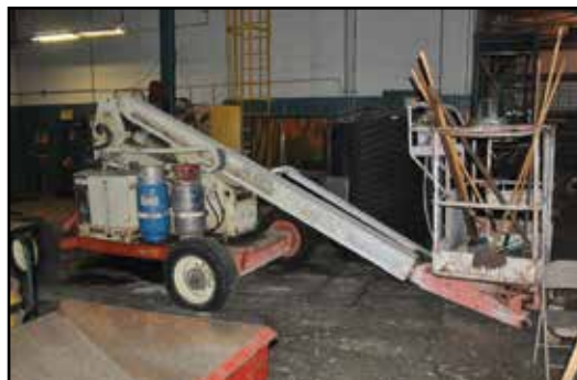
JLG Top Gun 45HA Snorkel Lift