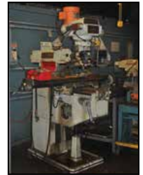
ACER 10' x 54' ULTIMA Vertical Mill