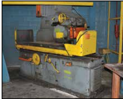
THOMPSON 4C Hydraulic Surface Grinder