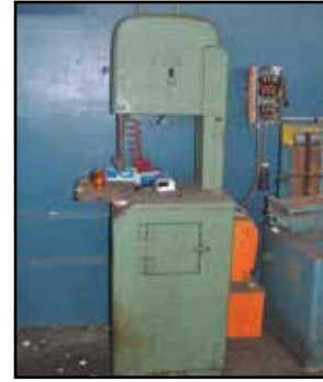
DOALL 16" Vertical Band Saw