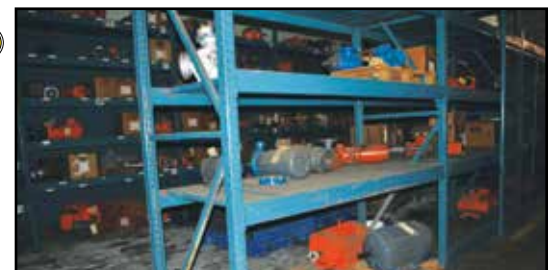
Large Parts Inventory – Motors, Valves, Belts, Electrical & Maintenance Supplies