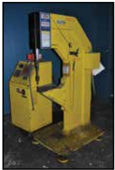
BTM Tog-L-Loc C-Frame Toggle Lock Machine