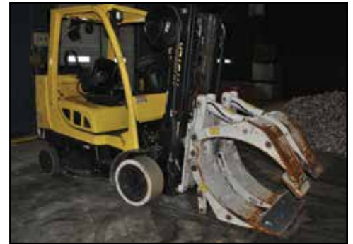
(4) HYSTER 580FTBCS 8,000-lb. Forklifts