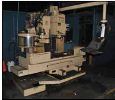
CINCINNATI Cintimatic 7VC-750 CNC Vertical Machining Center