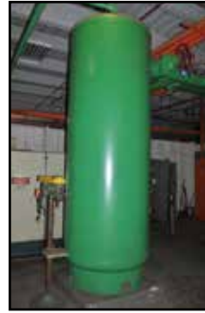
4' x 12' Air Receiver Tank