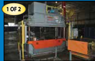
(2) JARECKI 150-Ton Up-acting Hydraulic Presses