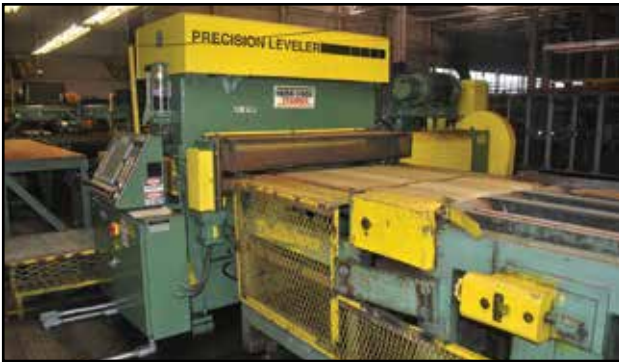
DAHLSTROM CUT-TO-LENGTH LINE w/HERR VOSS PRECISION LEVELER

INSPECTION: Day Prior to Auction from 9AM - 4PM