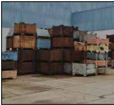
(40) 3' x 4' Corrugated Stackable Tubs