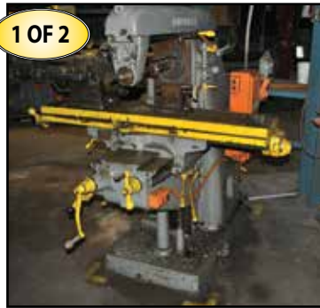
1 OF 2 (2) CINCINNATI 10' x 50' & 12' x 54' #2M Horizontal Mills