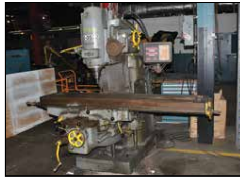
CINCINNATI 14' x 72' #4 Vertical Mill