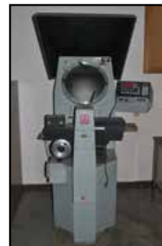
J&L Classic 14F Optical Comparator