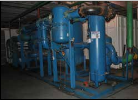
SILVAN SYSTEMS Mist Eliminator Dryer System