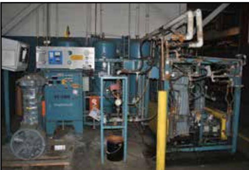
VACUUM INSTRUMENT Helium System