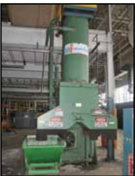
MAYFRAN Vacuum System