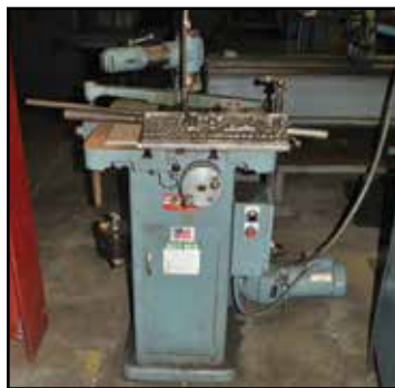
DC MORRISON 1-1/4" Key Seater