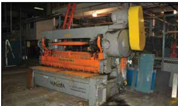
NIAGARA 8' x 1/4" Squaring Shear