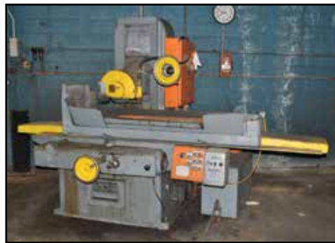
GALLMEYER & LIVINGSTON Hydraulic Surface Grinder