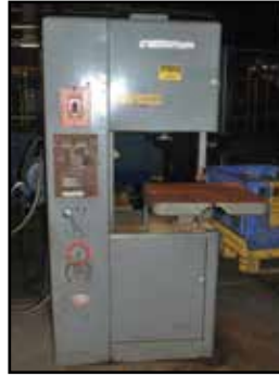
POWERMATIC 20" Vertical Band Saw