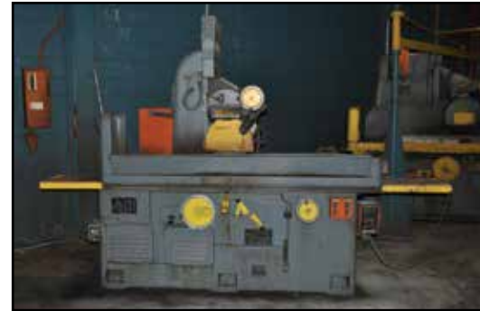
THOMPSON 3B Hydraulic Surface Grinder