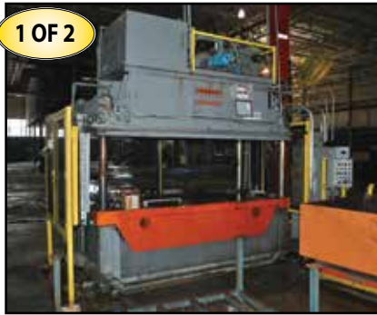
1 OF 2 (2) JARECKI 150-Ton Up-acting Hydraulic Presses