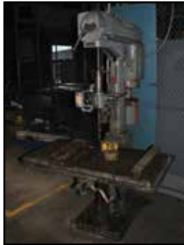
(2) FOSDICK 25" & 20" Drills