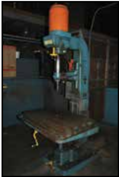
LELAND GIFFORD 25" Drill