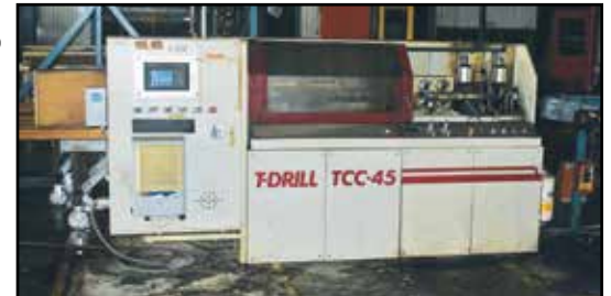
T-Drill TCC-45 Tube Cutting Machine