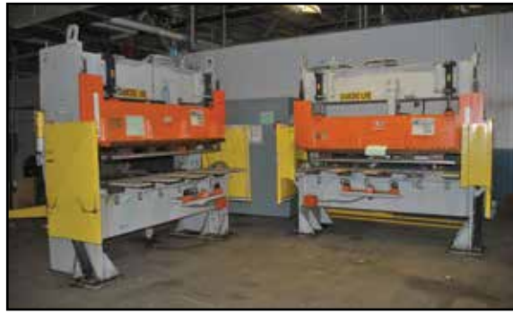
(2) Radius Bender Presses