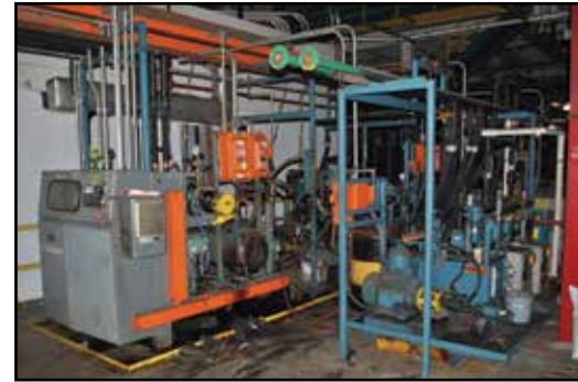
Chilled Water Plant