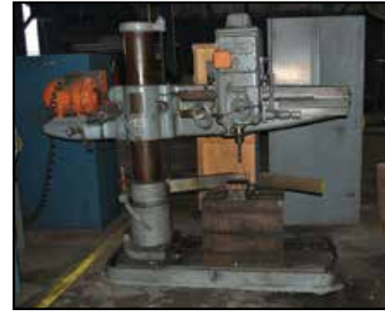
CINCINNATI BICKFORD 3' x 9" Radial Arm Drill