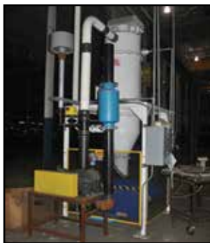
VECTOR 20-HP Vacuum System