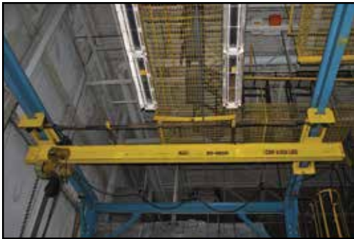
YALE 2-Ton x 15' Span Free-Standing Bridge Crane