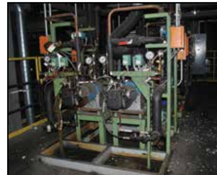
(2) Poly Metering Pump Units