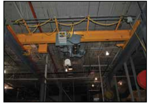
P&H 10-Ton x 18' Span Free-Standing Bridge Crane