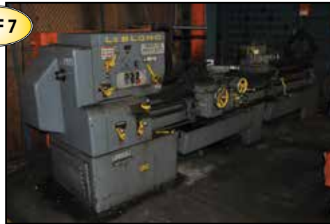
(7) LEBLOND, MONARCH, JET, AMERICAN PACEMAKER & CLAUSING Engine Lathes