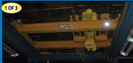
(3) P&H and CRANE SYSTEMS 20-Ton Bridge Cranes