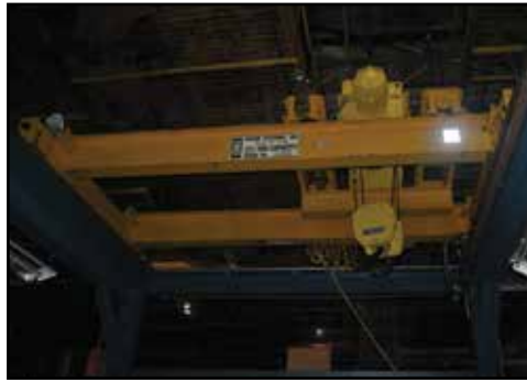
CRANE SYSTEMS 20-Ton x 16' Span Free-Standing Bridge Crane