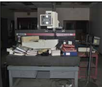
CORDAX 1808-M CMM