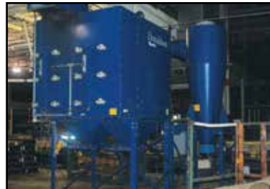
DONALDSON TORIT DFT3-24 Dust Collector