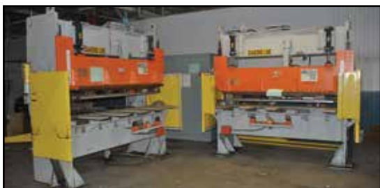
(2) Radius Bender Presses