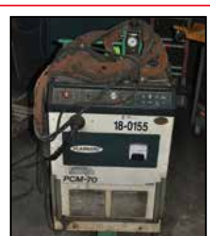
(9) MILLER, ESAB, LINCOLN & PLASMARC Welders & Plasma Cutter