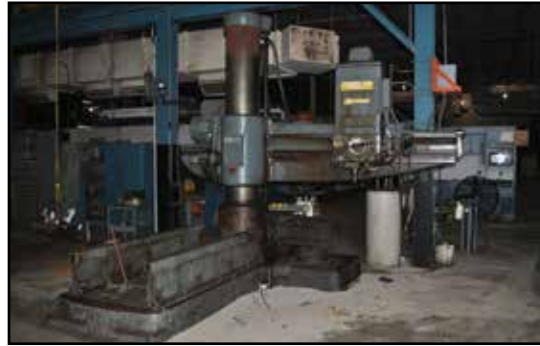
GIDDINGS & LEWIS BICKFORD 6' x 22" Radial Arm Drill