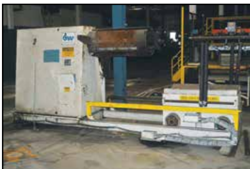
XWP 6R-36 Coil Reel & Car