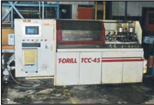
T-Drill TCC-45 Tube Cutting Machine