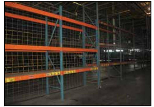
(300+) Sections of Pallet Racking