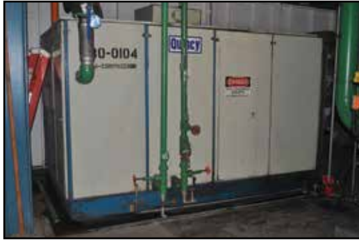
(2) QUINCY Q1500 Rotary Screw Air Compressors