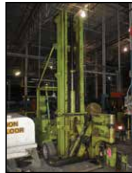
CLARK 5,000-lb. Forklift