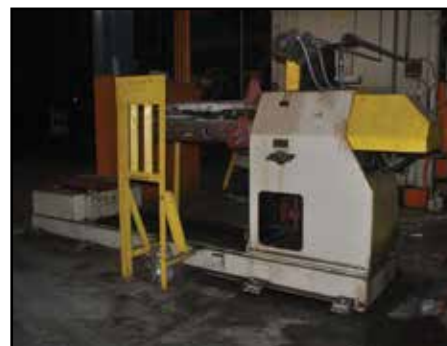
LITTELL 20,000-lb. Coil Reel w/Car