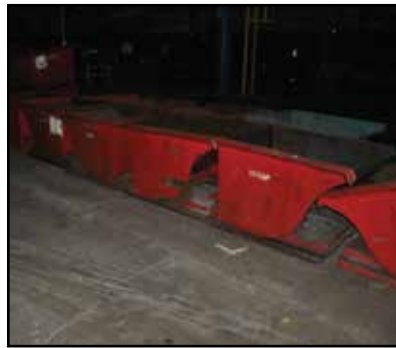
Large Quantity of Self-Dumping Hoppers & Bins