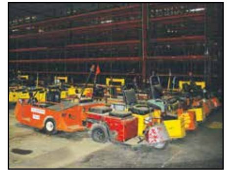
Large Assortment of TAYLOR DUNN Maintenance Carts