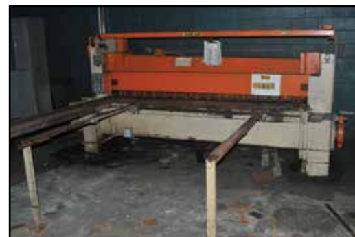
NIAGARA 8'x 10-Ga. Squaring Shear