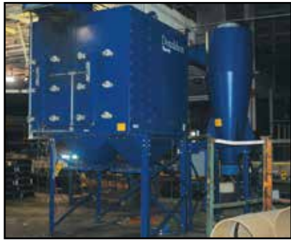
DONALDSON TORIT DFT3-24 Dust Collector