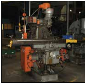
CLEVELAND 12' x 60' Universal Horizontal Mill