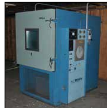
TENNY 40 6' x 6' x 6'H Electrical Oven