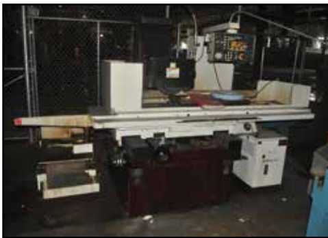
CHEVALIER FSG-1632ADII Surface Grinder