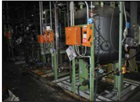
(2) Chilled Water Units w/300-Gallon Poly Day Tank