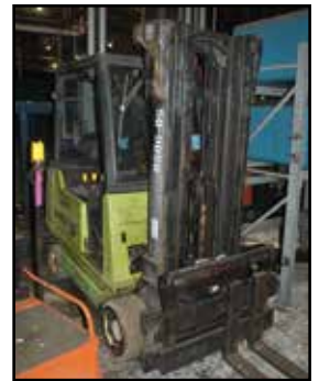
CLARK GLS25M 5,000-lb. Forklift