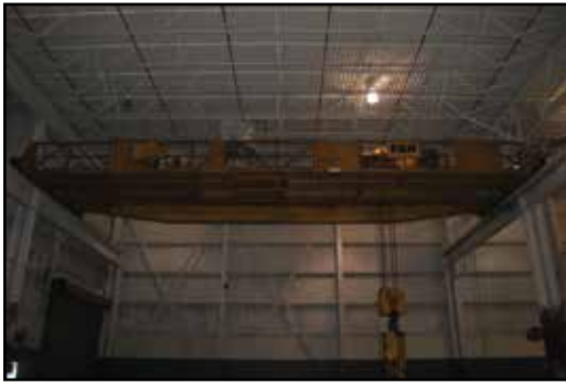
(2) P&H 20-Ton x 60' Span Bridge Cranes