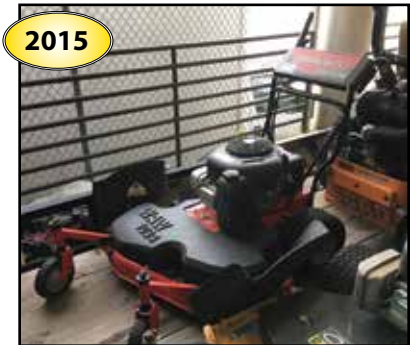
2015 GRAVELY 34" Commercial Mower