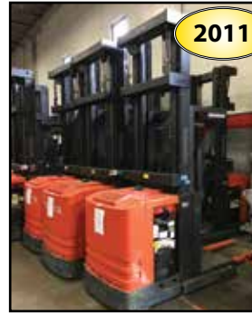
(5) 2011 TOYOTA 6BPU15 3,000-lb. Order Pickers