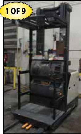
1 OF 9