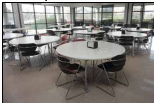
(20) 60" Dia. Breakroom Tables & (25) Stackable Chairs