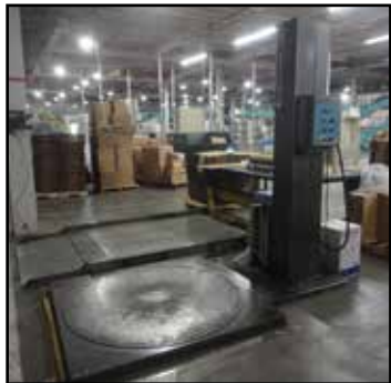
COUSINS LP2100X Automatic Shrink Wrapper