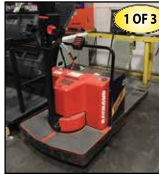
(3) RAYMOND Stand-Up Pallet Trucks