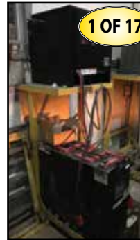
(17) 36-Volt Battery Chargers

$1,000s WORTH OF BRAND-NEW INVENTORY of Shirts, Bibles, Books, Sunday School Curriculum, Puppets, Fair-Trade Jewelry, Candles & More