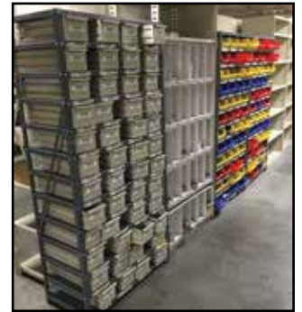
Several Sections Plastic Tote/Bin Shelving