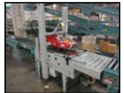
(4) Case Sealers