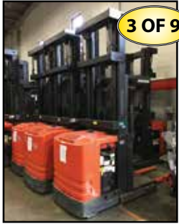
(9) TOYOTA, CROWN & Yale Order Pickers

Myron Bowling Auctioneers Inc. P.O. Box 369 ROSS, OHIO 45061