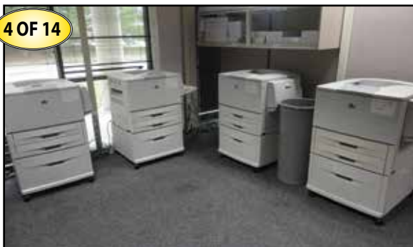
(14) HEWLETT-PACKARD Printers & Copiers