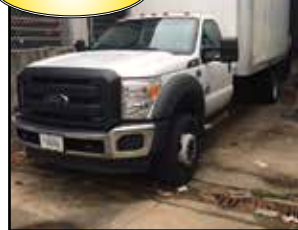
2015 FORD F550 20' Box Truck

(42) ZEBRA & SATO Label Printers (20) BETTER PAQK 5555 Tape Shooters (4) Semi-Automatic Case Sealers: 3M-MATIC 700R 3" • LITTLE DAVID LD2E • (2) LITTLE DAVID 2D HEAT SEAL HS-115 L-Bar Sealer w/Turbo Tunnel Heat Sealer, 6" x 14" Tunnel Entry & Exit, 16" x 20" L-Bar Seal Area