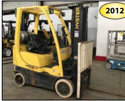
(2) 2012 HYSTER S30FT 3,000-lb. Forklifts