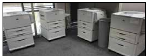
(14) HEWLETT-PACKARD Printers & Copiers