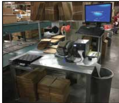
(20+) Work Stations