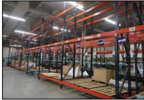
(32) Sections INTERLAKE Teardrop Pallet Rack, 36"D x 16'T x 120"