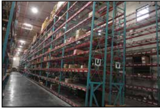
(650) Sections SPEEDRACK 36"D x 280"T Pallet Rack

THURSDAY, MAY 4TH AT 10AM CDT • INSPECTION: DAY PRIOR TO AUCTION FROM 9AM-4PM