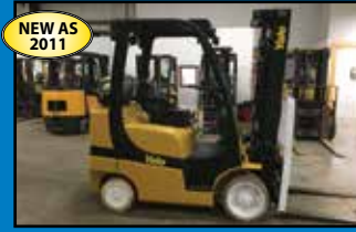
(2) YALE 5,000-lb. Forklifts

PRE-SORT FIRST CLASS U.S. POSTAGE PAID CINCINNATI, OHIO PERMIT NO. 5714