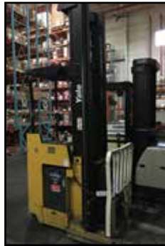
YALE 3,000-lb. Reach Truck