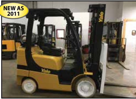
(2) YALE GLC050VX 5,000-lb. Forklifts