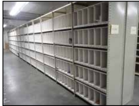
(1,500+/-) Sections HALLOWELL Clip Style Steel Shelving