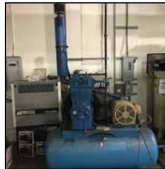
QUINCY 20-HP Air Compressor & AIRTEK Air Dryer

QUINCY 20-HP Horizontal Tank Air Compressor, Model 390 LANDIS & GYR Twin 3/4-HP Horizontal Tank Air Compressor HANKINSON 8010 Compressed Air Dryer • AIRTEK ES80 Refrigerated Air Dryer