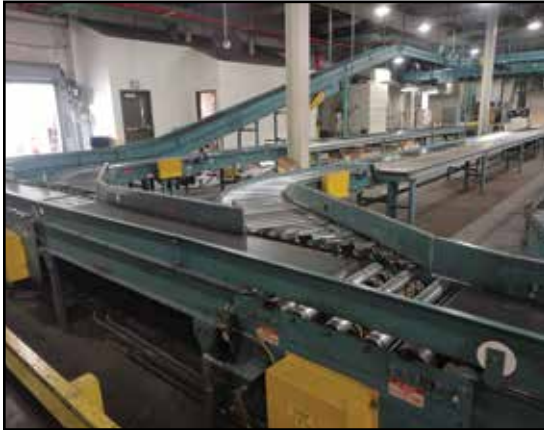
DESIGN CONVEYOR SYSTEMS Power Belt & Roller Conveyor