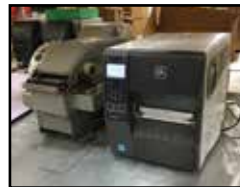
(62) Printers & Label Machines