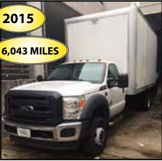
2015 FORD F550 20' Box Truck

THURSDAY, MAY 4th Starting at 10AM CDT INSPECTION: Day Prior to Auction from 9AM - 4PM