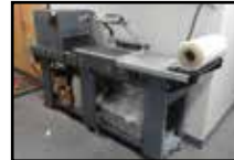
HEAT SEAL HS-115 L-Bar Sealer