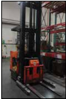
RAYMOND 3,000-lb. Deep-Reach Order Picker