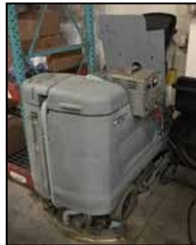
ADVANCE HR2800 Sit-Down Floor Scrubber