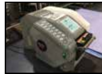
(20) BETTER PAQK 5555 Tape Shooters