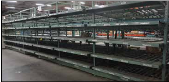
(24) Sections SPECTA-FLO 65" x 96" x 94"T Flow Rack