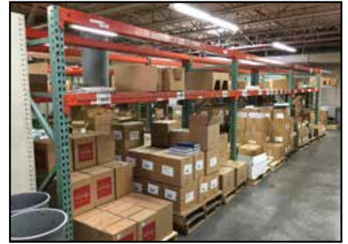
(32) Sections INTERLAKE Teardrop Pallet Rack, 36"D x 90'T x 120"