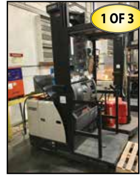
(3) CROWN 3,000-lb. Order Pickers