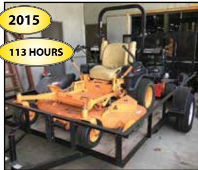
2015 SKAG WILDCAT 61" Commercial Riding Mower