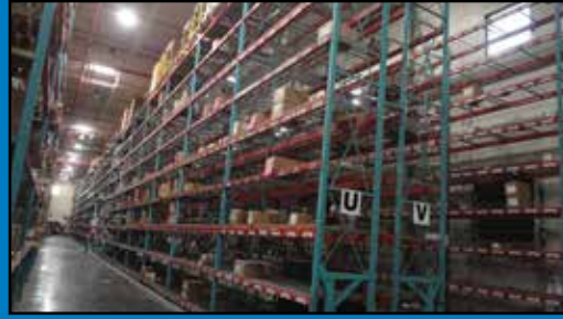
(650) Sections SPEEDRACK 36"D x 280"T Pallet Rack

Myron Bowling Auctioneers Inc. P.O. Box 369 ROSS, OHIO 45061