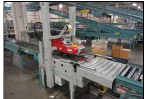
(4) 3M-MATIC & LITTLE DAVID Semi-Automatic Case Sealers