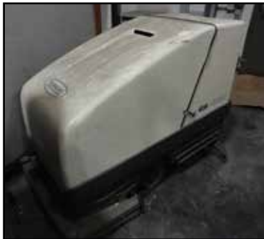
TENNANT ES480 Walk-Behind Floor Scrubber

$1,000s WORTH OF BRAND-NEW INVENTORY of Shirts, Bibles, Books, Sunday School Curriculum, Puppets, Fair-Trade Jewelry, Candles & More