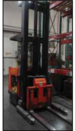
RAYMOND 3,000-lb. Deep Reach Order Picker