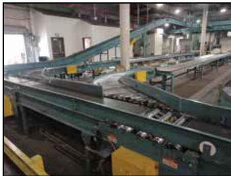
DESIGN CONVEYOR SYSTEMS Power Belt & Roller Conveyor

(110) 12" x 36" x 57"H Steel Book Carts (50) Wood Book Carts • (20) Metro Carts • (2,000) 16" x 24" x 9" Plastic Tubs