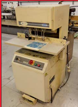
Challenge Model MS-5 Three-Spindle Paper Drill