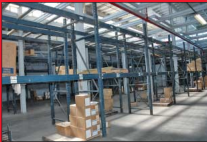
(90) Sections 42" D X 108" W X 8'-10'-12'-24' Heights High Clip Type Adjustable Beam Pallet Racks