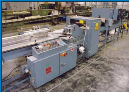
Shanklin Model F5A Wrapper/Sealing Machine