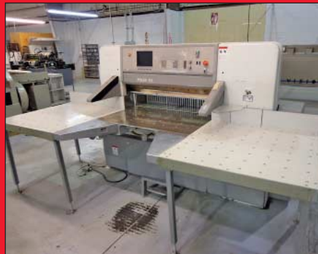
45.5" Polar Mohr Model 115ED Paper Cutter

Quadrel Model Q10 Labeling Machine w/ Zebra Printer