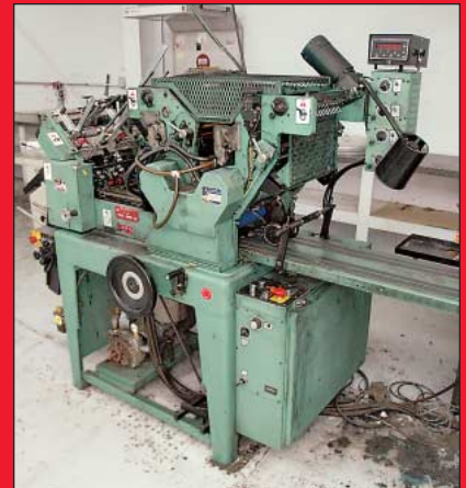
Halm 2-Color Envelope Printing Press Model JPTWOD-6D