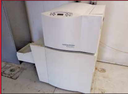
Heidelberg Model Quicksetter 2960 Image Setter