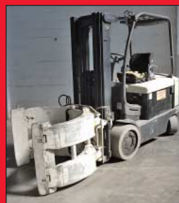
4,000 LB Crown FC4020-60TT180 Solid Tire Electric Lift Truck