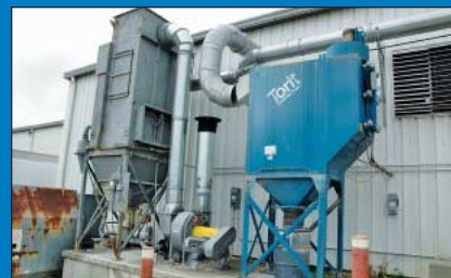
10 HP Torrit Model 03-12 Down Flow Cartridge Type Dust Collector