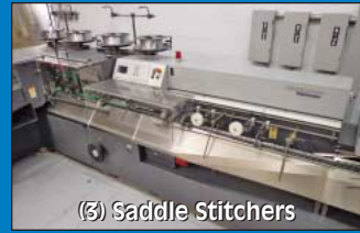
(3) Saddle Stitches