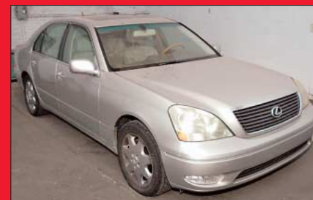
2002 Lexus LS430 Four-Door Sedan