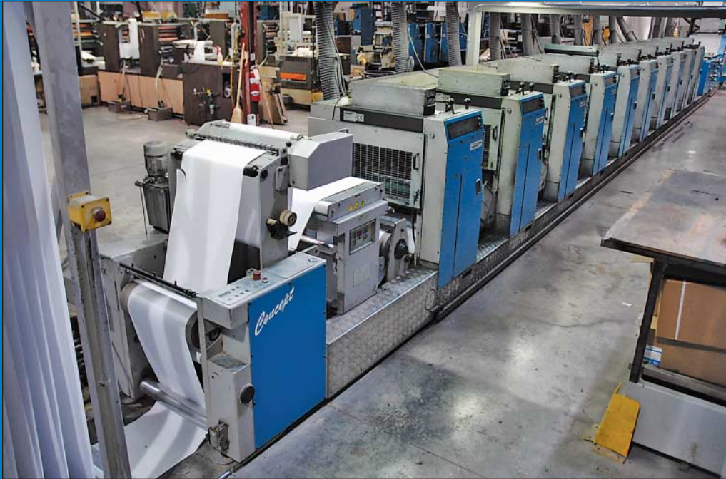
20.5" Wide Muller Martini Ten-Color Model Concept 10 Web Offset Forms Printing Press