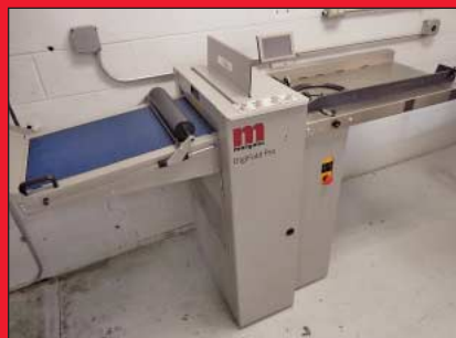
Morgana Model Digi-Fold Pro Folder w/ Programmable Control