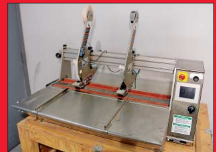
Straub Model J646Wi 2-Side Tape Machine From 1/4" to 1" - 2-Side Tape Application