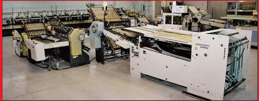
30" X 45.5" Heidelberg / Stahl USA Model BRD-30 Continuous Feed Folding Machine