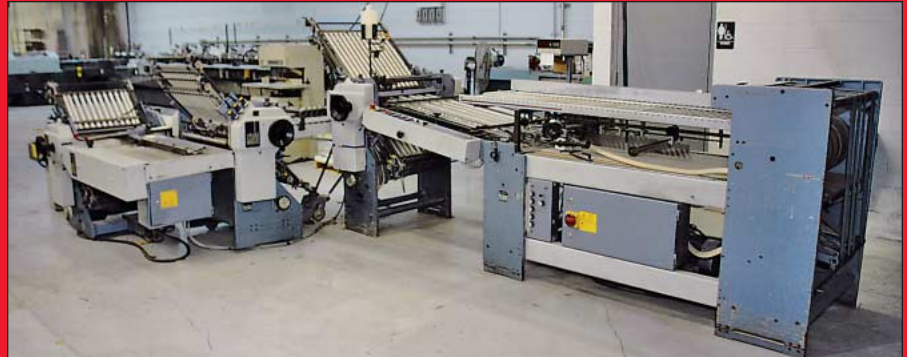
26" X 40" Heidelberg / Stahl Model RF66V-2 Continuous Feed Folding Machine