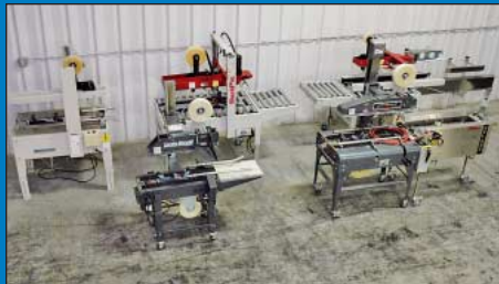
Bank View of Best Pack and Loveshaw Case Sealers