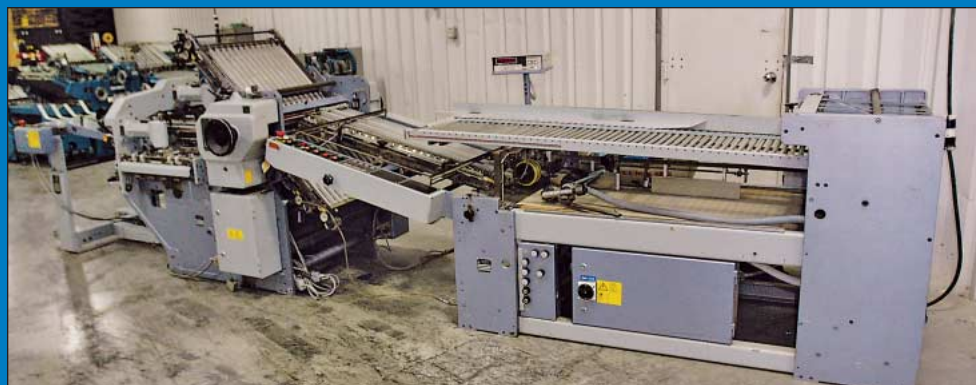
23" X 35" Stahl Model TD-56-4/4 8-Page Continuous Feed Folder