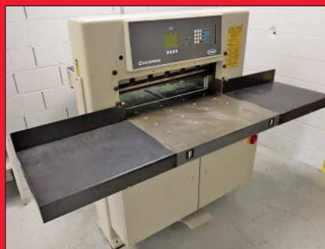
30" Challenge Model Champion 305XD Paper Cutter