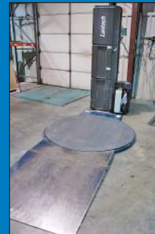
Lantech Automatic Pallet Wrapping System Q-Series