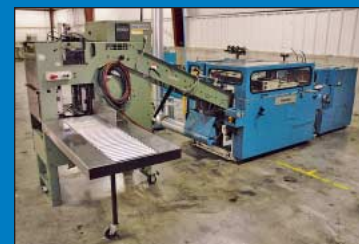
Sheridan "Pacesetter" Model SP705A Eight-Pocket Saddle Stitching System