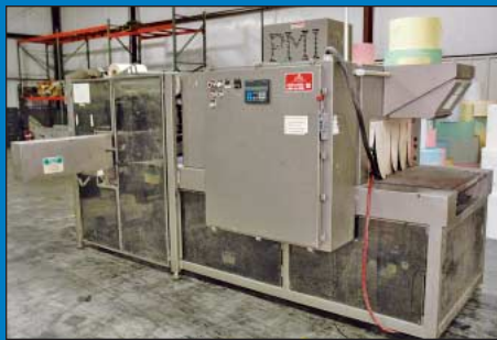
Packaging Machines International Model SIR-30 Heat Shrink Bundle Machine