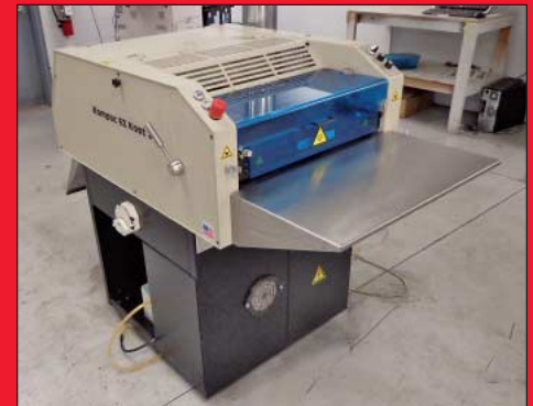
20" Kompac EZ Koat 20 Off-Line UV Coating & Curing System