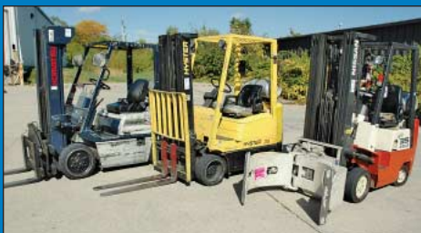
Bank View of Lift Trucks by Hyster, Komatsu, and Nissan