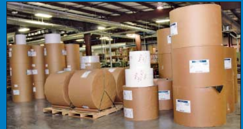
Paper Inventory Over (500) Full and Partial Rolls

Office Furniture Including; Desks, Chairs, Table, File Cabinets, Executive Office Set, Conference Set, Computers, Printers, Office Machines, Panasonic Telephone System