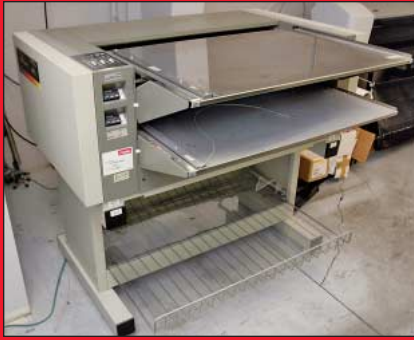
Imation Matchprint 447L Model EFLN Laser Proofing Lamination System