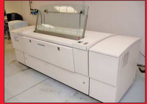
Heidelberg Model Trendsetter 3244 Spectrum CTP Platesetter