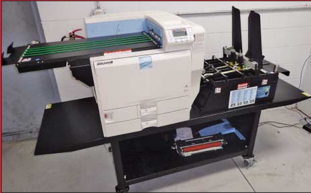
Xante Impressia Envelope Printer / Copier