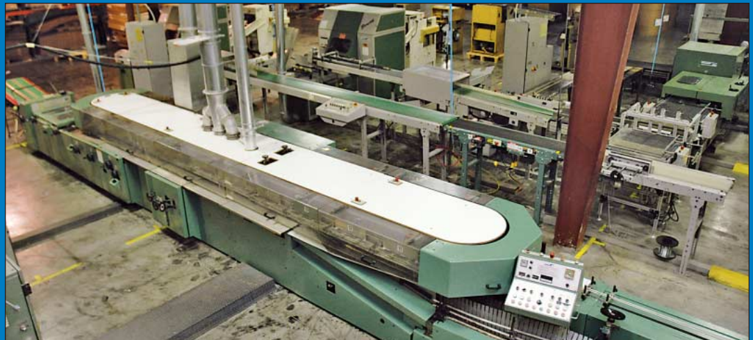
Mueller Martini Normbinder Model NB-3S Perfect Binding Line #1