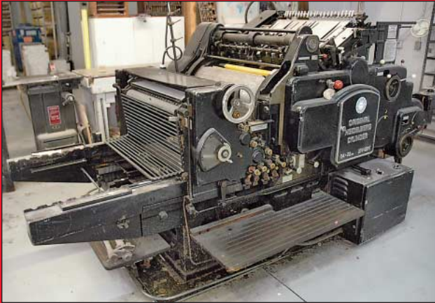
Heidelberg Original Cylinder Press