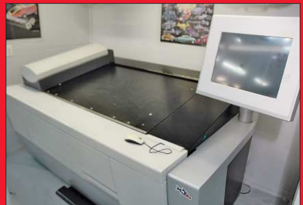
Heidelberg Prinect Image Control System