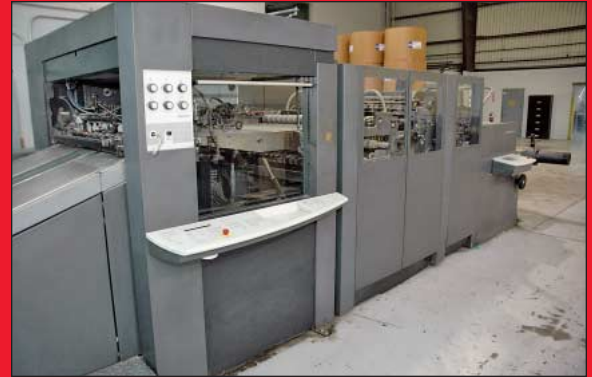
Beilomatic Model Cutstar Plus Roll to Sheet System on Heidelberg Speedmaster SM102 Press