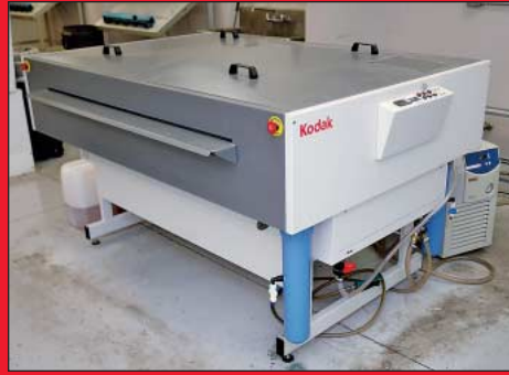
Kodak / NSE Model Sword 50 Plate Processor