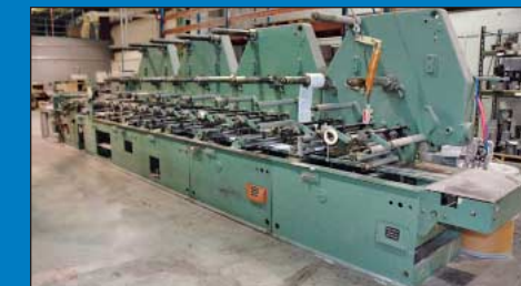
Hamilton Eight-Station Continuous Collator