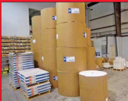
Partial View Paper Inventory