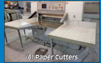
(6) Paper Cutters