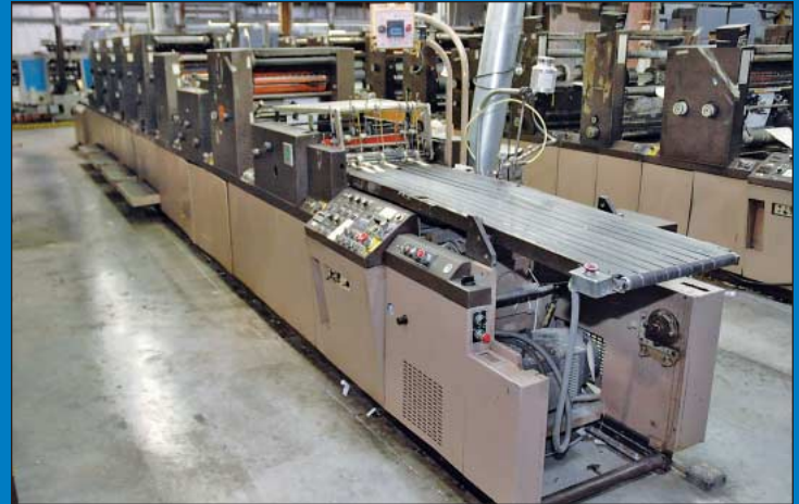
20" Didde Model 205-871 Four-Color Web Offset Forms Printing Press

20" Didde Model 205-871 Two-Color Web Offset Forms Printing Press; S/N 1471-0035, Didde Tensioner & Dancer, WTI Model EGS-2 Web Guide, (2) Print Towers, Marginal / Numbering Station, Hole Punch, Line Punch, (2) Perforating Stations, Didde VIP Roll Take-Out (R to R)