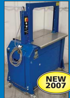
Mosca Model RO-M-P5 Automatic Strapping Machine