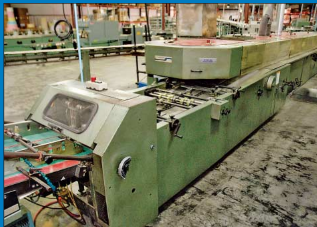
Mueller Martini Normbinder NB-3S Perfect Binding Line #2

Valco / Melton Model S-Drum / PUR Glue System; S/N 1212-0612, Valco / Melton Ultrasonic LC Controller (New 2012)