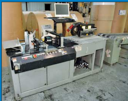
Kirk-Rudy Model 215AIB Two-Head Address Printing Machine