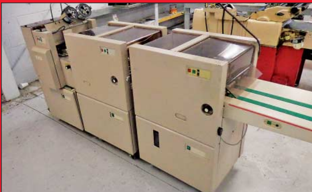
Xerox Stitching Machine w/ (2) Head Stitcher