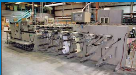
Didde Model CWK6-11 "Web-Klect II" Six-Station Continuous Collating Line

(32) Sections Interlake Type Pallet Racking; 4' Deep X 8' Wide X 12' High, Some w/ Wire Decking