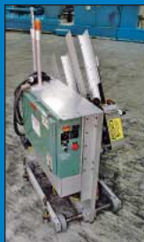
SIM Model CF550 Two-Pocket Card Inserter