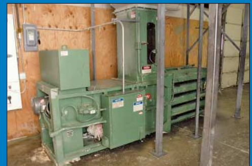
Economy Model 54A36 Automatic Horizontal Closed End Baler