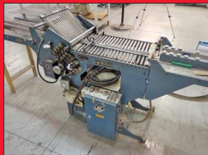
Herzog Heymann Model 118 Micro Folder w/ Tru-Count Digital Counter

Acme Steel Model N3A-3/4 Pedestal Stitcher; S/N 19516, Flat Saddle Stitching Bostitch Pedestal Wire Stitcher; S/N 3948V Baum Model ND5A-S-2 Series ND5A Five-Spindle Paper Drill; S/N 032JG003G Challenge Model MS-5 Three-Spindle Paper Drill; S/N D05327, w/ 3-Heads SEE PHOTO Challenge Model EH-3A Three-Spindle Paper Drill; S/N 63438 Challenge Model JF Single Spindle Paper Drill; S/N 55328 (2) US Paper Counters Model BAN-1 Type Bantam-1 Paper Counters; S/N 487074, Benchtop Unit (2004) PDI Electric Punch & Wire Closer Binders Hammond Gliden Model G-4B Trim-O-Saw Table Saws; S/N 5217 Rino Spiral Inserter & Punch w/ (3) Dies