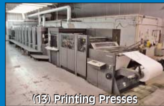
(13) Printing Presses

Contact Information 2020 Dunlap St. Cincinnati, Ohio 45214 Phone 513-241-9701 Fax 513-241-6760 www.cia-auction.com