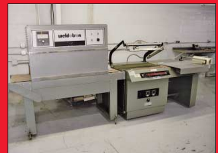
Weldotron Model 5212 Shrink Wrap Line