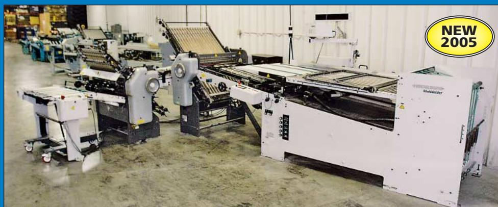
30" X 50" Stahl Model B-30-4/4 8-Page Continuous Feed Folder

SIM Model CF550 Two-Pocket Card Inserter; S/N 97.2856 SEE PHOTO