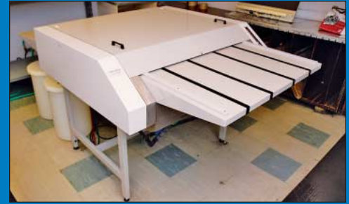
Fuji Model PS-850-NB Film Developer

HP DIGITAL PRESS 12.5" X 17.5" H.P. Indigo Model 5500R Five-Color Digital Printing Press; S/N IL-3000-5580, (5) Inkjet Cartridges, Up to (2) More Cartridges can be Installed, Print Speeds: 68 PPM Color, 272 PPM Monochrome, Paper Format: 13" X 19", (4) Paper Drawers (Installed 2012) SEE PHOTO