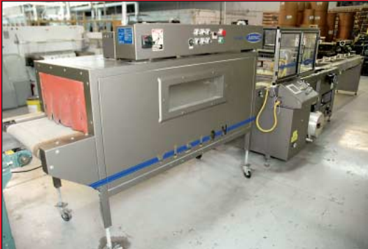
Shrink Tunnel on Arpac Automatic Shrinkwrap Line