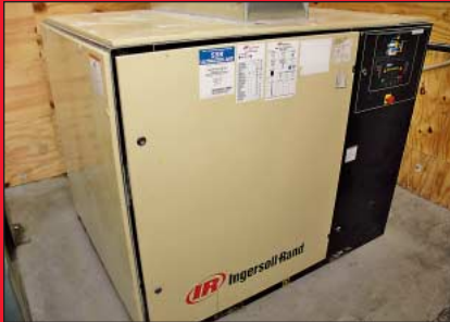
50 HP Ingersoll Rand Model EP50-PE 125-PSI Cabinet Type Rotary Screw Air Compressor