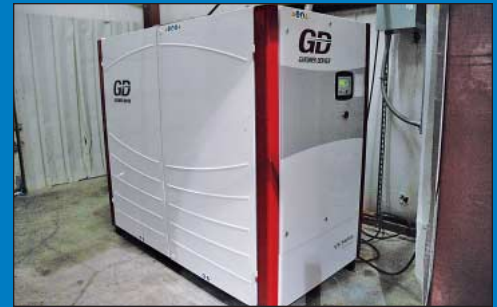
100 HP Gardner Denver Model VS45-70A Series Rotary Screw Air Compressor