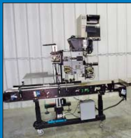
Label-Aire Model 2114-ML Automatic Label Printer / Applicator