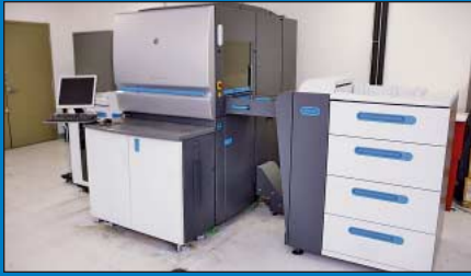
12.5" X 17.5" H.P. Indigo Model 5500R Five-Color Digital Printing Press