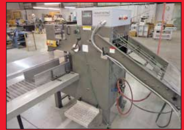
Heidelberg Model Stitch 270A Master Six-Pocket Saddle Stitching Line