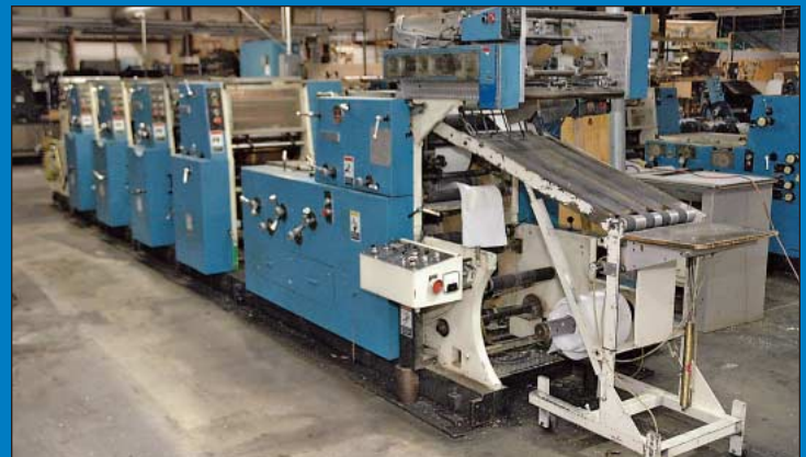
17.5" Harris Model 500T Three-Color Offset Forms Printing Press