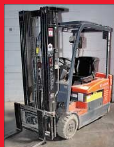
3,500 LB Toyota Model 7FBEU20 Solid Tire Electric Lift Truck

Storage, Zebra ZP450 Label Printer, 150 LB Mettler-Toledo Model PS60 Digital Scale, (3) 8' Lunch Tables, GE Profile Refrigerator, GE Electric Oven, (3) Microwave Ovens, Kyocera Model FS-3640MFP Multi-Function Copier