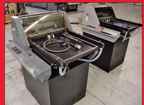
(2) 20" Wide Pierce Equipment Model PS-10-22 Numbering / Perforating Machines

15% ONSITE BUYERS PREMIUM 18% ONLINE BUYERS PREMIUM