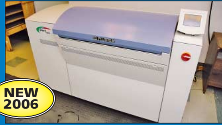
Fuji / Dainippon-Screen Model Dart PT4300S Computer to Plate System