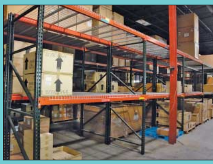
(600+) Sections Various Sizes Adjustable Beam Pallet Racking w/ Wire Decking