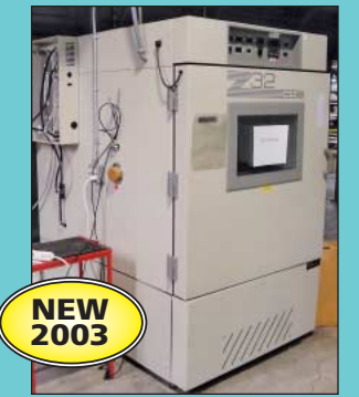
Cincinnati Sub-Zero Model ZH-32-305-SCT/ Environmental Test Chamber