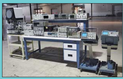
Large Quantity of Television Test Equipment