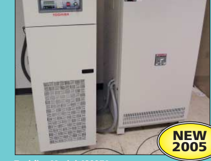
Toshiba Model 4200FA Uninterruptible Power System