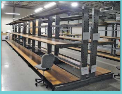
(46) Sections 3'Arm X 8' W X 8'H Single Sided Cantilever Rack W/ Cross Beam And Decking