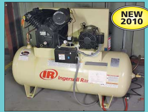
Horizontal Tank Air Compressor