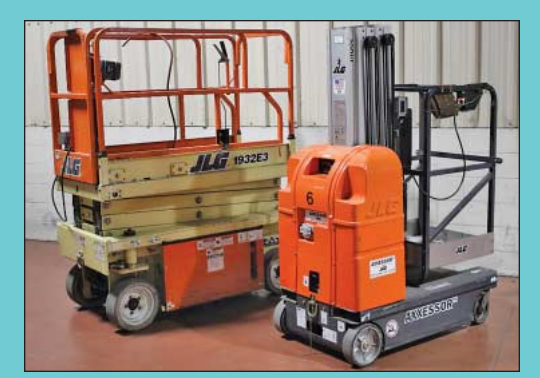
Bank View Electric Manlifts