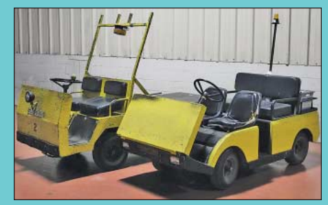
(2) Cushman Electric Maintenance Carts