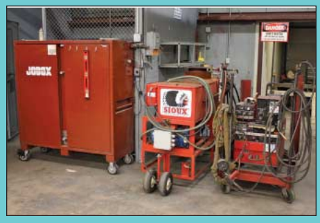
Partial View Miscellaneous Machinery Including Job Box. Steam Cleaner. and Welder

(50) 45"W X 48"L Plastic Collapsible Skids