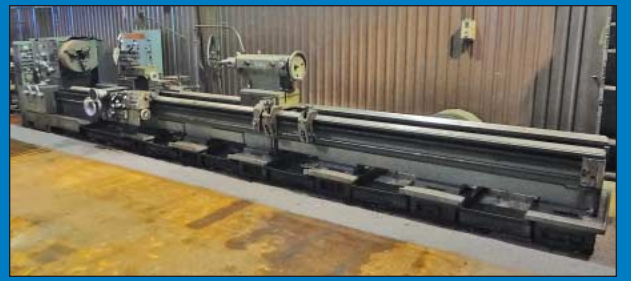
38"/46" X 240" Poreba Model TPK90A1/6 Heavy Duty Geared Head Engine