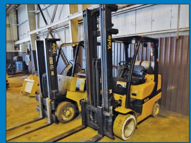
7,000 LB and 6,000 LB Yale LP Gas Lift Truck

INSPECTION: Monday, October 27th from 10:00 AM to 5:00 PM