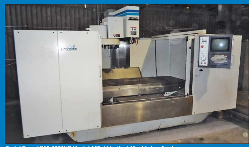
Fadal Type VMC-6030HT Model 907-1 Vertical Machining Center