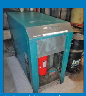
Curtis Model CDR300 Air Drver