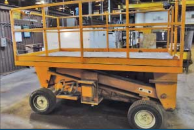
Fab Tech LP Gas Mounted V-24 Scissor Lift