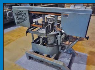
Ellis Model 1800 Horizontal Band Saw