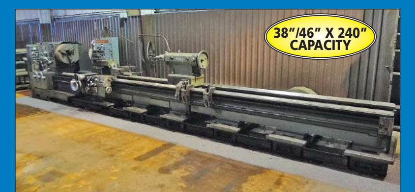
38"/46" X 240" Poreba Model TPK90A1/6 Heavy Duty Ceared Head Engine Lathe

Important Mail TO BE DIRECTED TO THE ATTENTION OF EXECUTIVE PERSONNEL