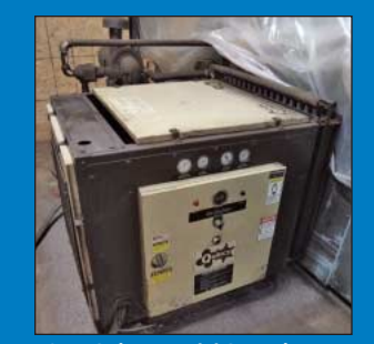
50 HP Quincy Model QMA Air Cooled Helicol Screw Air Compressor