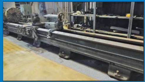
38" X 270" Niles Heavy Duty Geared Head Engine Lathe

RADIAL DRILL 6' Arm X 12" Col. Z-J Model Z-3050X161 Radial Arm Drill; S/N 2-3000A101 Kaulai Afili Drin, 5/18 60250135, Two Drill Boxes, Spindle Speeds: 25 - 2,000 RPM, Power Elevation SEE PHOTO