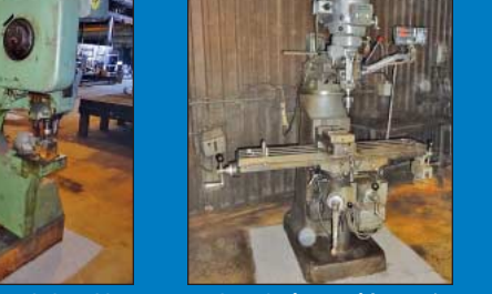
(4) 2 HP Series 1 Bridgeport Vertical Milling Machines