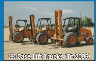
(3) Case Lift Trucks (To 2005)