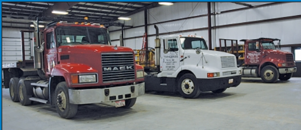
Partial View (3 of 5) Mack and International Semi Tractors