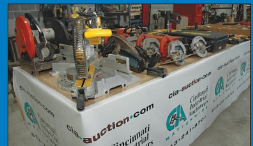
Partial View Large Quantity Late Model Hand and Power Tools