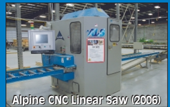
Alpine CNC Linear Saw (2006)