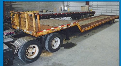
1996 - 48' Trail-Eze Model DLX-30-TC-48 Roll Back Trailer