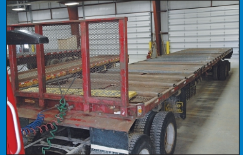
2000 - 48' Alloy Custom Products Model AE-70 Extending Bed Tilting Truss Trailer

Late Model Office Equipment Consisting of; HP Laser Jet Printers, Sharp ARC-260M Color Copier, HP Designjet 450c Wide Format Printer, Ricoh FW760 Large Size Copier, Sharp FO-4700 Fax Machine, (4) Dell Dimension XP587231 PCs, (2) Dell Dimension 8300 PCs w/ Flat Screen Monitors, Dell Dimension 9150 PC, Dell Dimension 8400 PC w/ Flatscreen Monitor, Dell Poweredge 600 SC Server, Cisco PIX501 Fire-Wall, Cisco SR224 24-Port Switch, (2) Vacuum Cleaners, (5) Microwave Ovens, (2) Refrigerators, (2) Televisions And Many Other Related Items