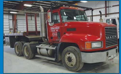
2001 Mack Model CH613 Max Cruise Semi Tractor

1994 Mack Model CH613 Semi Tractor; Vin No. 1M2AA13YORW030775, Missing Fifth Wheel, 608,254 Miles, Eaton Fuller 10-Speed Manual Transmission, 13' Diamond Van Body Box w/ Pull Out Ramp, 150 Gallon Fuel Tank w/ Tuthill Fillrite Electric Pump