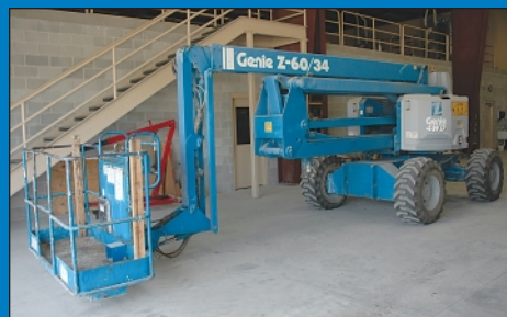
1998 Genie Model Z-60/34 Rough Terrain Dual Fuel Boom Type Manlift