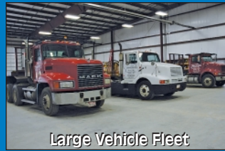
Large Vehicle Fleet