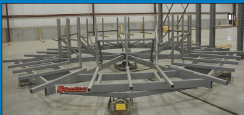
24' Diameter Expediter Motorized Supply Carousel