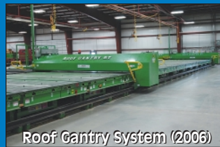
Roof Gantry System (2006)

2020 DUNLAP ST., CINCINNATI, OHIO 45214 PHONE (513) 241-9701 / FAX (513) 241-6760 INTERNET: cia-auction.com