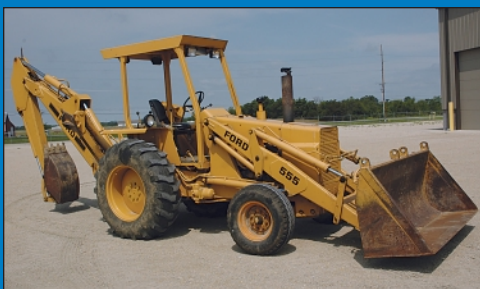
1980 Ford Model 555 Rubber Tire Diesel Loader Backhoe

IMPORTANT AUCTION NOTICE THIS AUCTION WILL BE CONDUCTED LIVE ONSITE ONLY Proxy Bids Will Be Accepted with Proper Deposit MORE PICTURES AVAILABLE ON WEBSITE