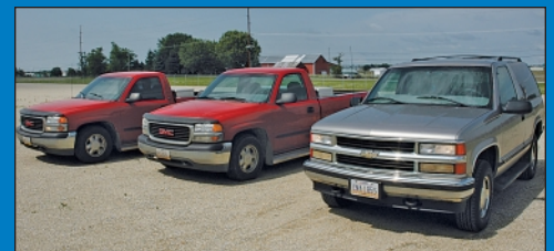
Partial View Late Model Passenger Vehicles Including Pick-Ups and SUVs

IMPORTANT AUCTION NOTICE THIS AUCTION WILL BE CONDUCTED LIVE ONSITE ONLY Proxy Bids Will Be Accepted with Proper Deposit MORE PICTURES AVAILABLE ON WEBSITE