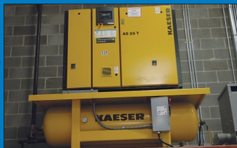
25 HP Kaeser Model AS25T Combination Air Compressor, Dryer & Holding Tank