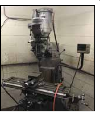
BRIDGEPORT 2-HP Mill