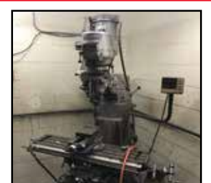
BRIDGEPORT 2-HP Mill