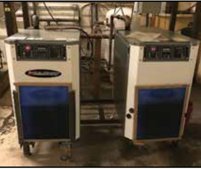
(2) AIRTEK Infiltration Air Treatment Packages