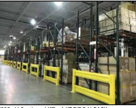
(225+/-) Sections 44"D x 14'T RIDG-U-RACK Pallet Racking