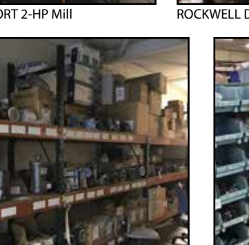
Gear Reducers, Air Lines & Conveyor Parts

Boom Jib • (25+/-) Manual Pallet Jacks • (20+/-) 2-Wheel Dollies