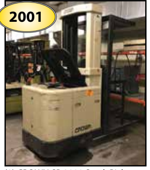
(2) CROWN SP 3000 Stock Pickers