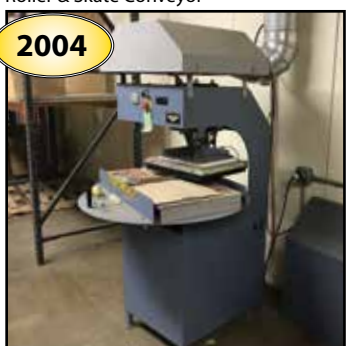
STARVIEW MP 2-14 18 Heat Press