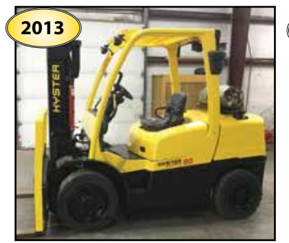
(3) HYSTER S80FTBCS 8,000-lb. Forklifts