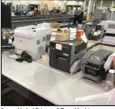
Several Label Printers & Tape Machines

(70) Sections Blue Flow Racking Several Skids Wire Decking