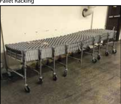
(8) Sections BEST FLEX & NESTAFLEX Accordion Roller & Skate Conveyor