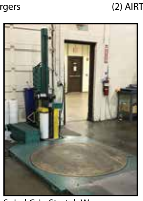
Spiral Grip Stretch Wrapper

ROCKWELL Drill Press · DEREX Drill DAYTON Double End Grinders CAROLINA H-Frame Press CRAFTSMAN Router WELLS Horizontal & POWERMATIC Vertical Band Saw (2) MEP WILTON & MILWAUKEE Chop aws w/Cart BALDOR Vertical Sander LINCOLN Bullet Welder (8) Small Arbor Presses