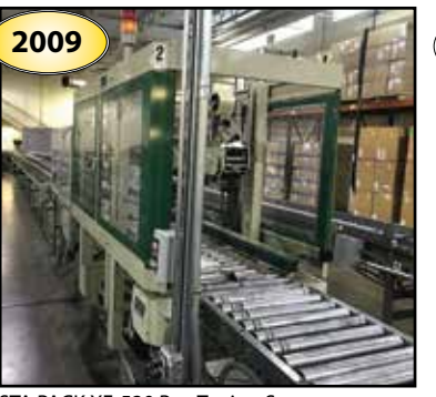
STA PACK XF-520 Box Taping System

Decking • (2) Sets Steel Stairs INTERLAKE 250' x 50' x 208''T Pick-to-light Module Consisting of (167) 36'' x 17' Uprights w/3'' x 3'' Posts • (576) 90'' x 90" Roller Shelves w/Powered XENOROL Conveyor w/Sick Barcode Scanner • (96) Sections Steel Shelving • (300) Beams • (100) Pieces Wire Mesh Decking • Bead Board Decking • (2) Sets Steel Stairs