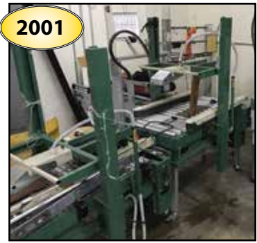
(2) STA PACK STA-FX50 Box Taping Systems

3500 Series, New As 2012, 210" Lift Height, 24V