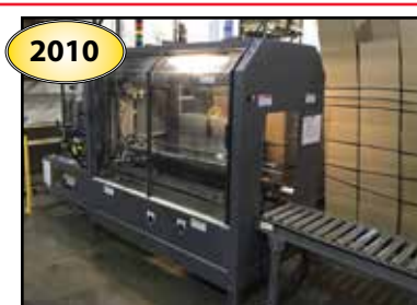
PEARSON Box Erector