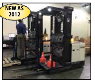
(8) CROWN & TOYOTA Stock & Order Pickers, New as 2012