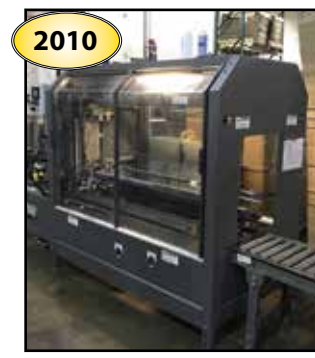
PEARSON Box Erector