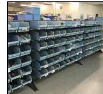
(31) Steel Rolling & Stationary Tote Holders

DORNER A-Frame Sorting System w/ Conveyor, DATA LOGIC Scanners, Control Panels, Motors, Gear Drives & Reducers 2010 PEARSON Box Erector 2004 STARVIEW MP 2-14 18 Heat Press (20+) SATO Label Printers Tape Machines: (10) BETTER PACK & SEKISUI TA • (1) 2009 STA PACK XF-520 Box Taping Systems • (2) 2001 STA PACK STA-FX50 Box Taping Systems (6) Spare Taping Heads Skid of the BEST PACK Carton Sealing Tape • (2) 3M & (2) STA Pack Case Sealers