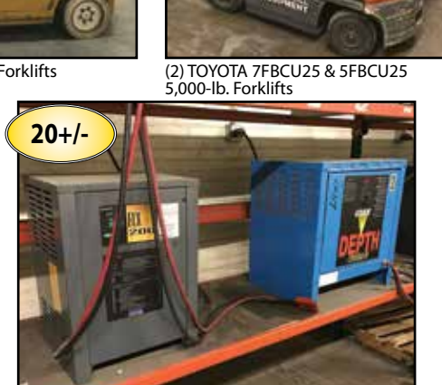
(20+/-) 36V & 24V Battery Chargers