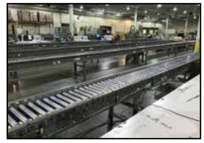
(2,000'+/-) BUSCHMAN Powered Conveyor

(775+/-) Sections 42"D x 17'T & 44"D x 14'T RIDG-U-RACK Pallet Racking