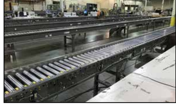
(2,000'+/-) BUSCHMAN Powered Conveyor