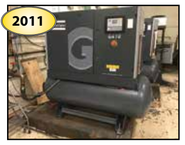
(3) ATLAS COPCO GA 18 Air Compressors