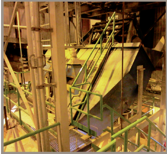
(1 OF 2) FERROTECH PAN GRANULATORS

COMPLETE ELEMENTAL SULPHUR GRANULATING & PACKAGING FACILITY – ALL EQUIPMENT INSTALLED 1998 OR NEWER