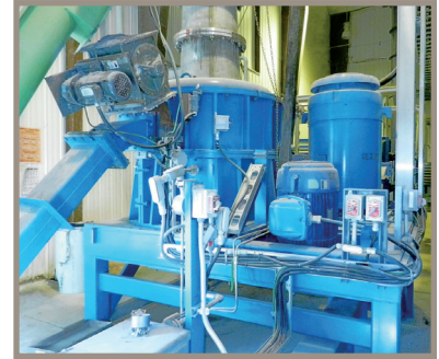
(1 OF 2) BLUETECH 250 HP GRINDERS