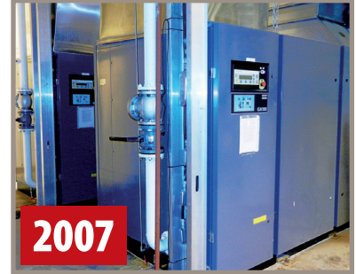
(1 OF 2) ATLAS COPCO 200 HP AIR COMPRESSORS

Sale Closing Date: Tuesday, December 3, 2013 at 2:00 PM MST Inspection: Monday, December 2, 2013 From 9:00 AM to 4:00 PM MST, or by Appointment Location: 9610654 Block 1, Lot 1 & 2, Irricana, Alberta, Canada