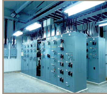
VIEW OF MOTOR CONTROLS AND SWITCH GEARS