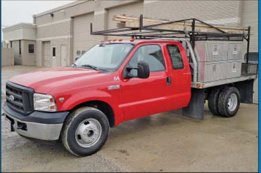
2006 Ford F-350XL Club Cab Stake Bed Truck

Pentium 4 Computers w/ Flat Screen Monitors, HP Ink Jet Printers, HP DesignJet 70 Large Print Printer, Copier, Printer, Swingline Electric Punch, Meridian NT5B01 Phone System