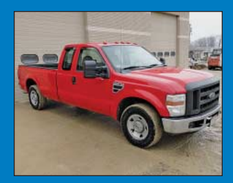
2008 Ford F-250 XL Super Duty Club Cab Pick-Up Truck