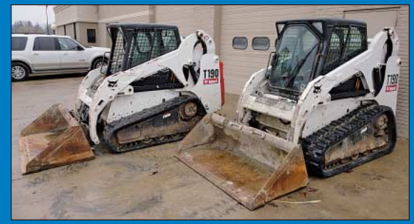
(2) 2008 Bobcat T-190 Rubber Track Front End Loaders