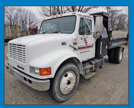
1999 International Single Axle Dump Truck