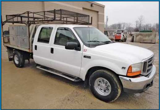
2002 Ford F-250 XLT Super Duty Crew Cab Stake Bed Truck