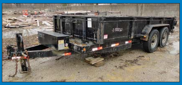
16' Millennium Model M6F16F Tandem-Axle Dump Trailer