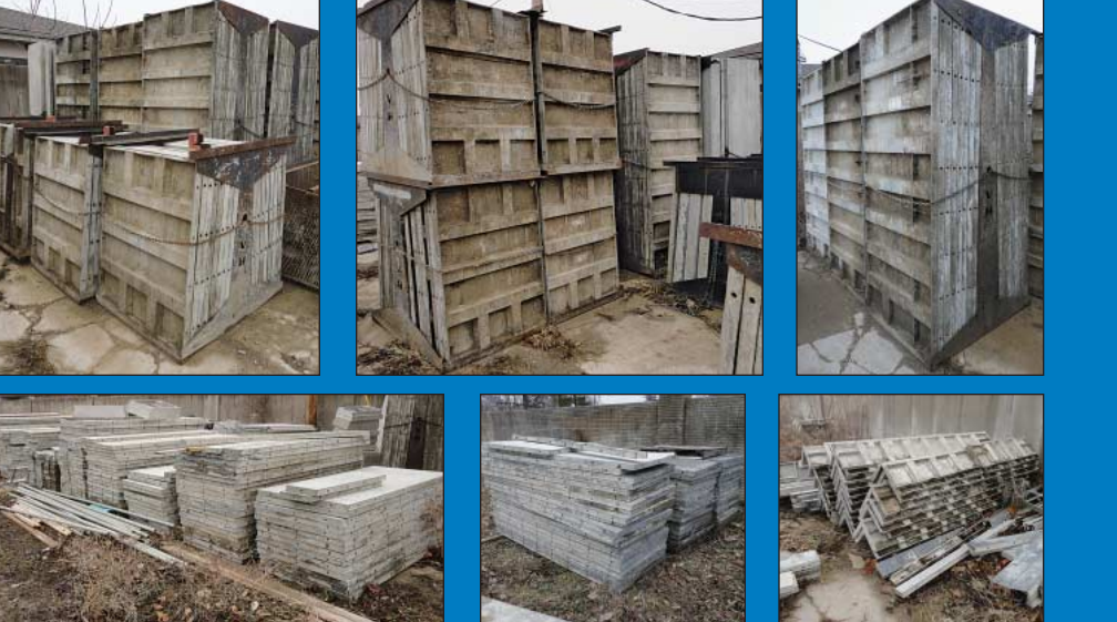
(1,000 +/-) Various Size and Style Concrete Forms