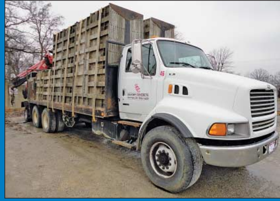
2000 Sterling Model LT9513 Tandem Axle Concrete Form Delivery Truck w/ Fassi Hydraulic Crane