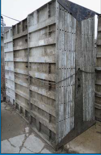
(1,000 +/-) Various Size and Style Concrete Forms

SALE UNDER THE MANAGEMENT OF ncinnati Industrial Auctioneers Inc. 2020 DUNLAP ST., CINCINNATI, OHIO 45214 PHONE (513) 241-9701 / FAX (513) 241-6760 INTERNET: cia-auction.com for printable brochures, catalog, terms and proxy-bidding