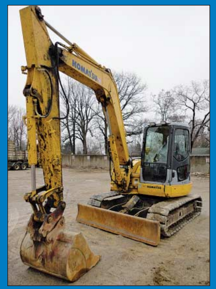
2006 Komatsu Model PC-78-MR6 Hydraulic Track Excavator

2006 Komatsu Model PC-78-MR6 Hydraulic Track Excavator; S/N RK5617, Hours: 4090, Heat / AC, Enclosed Cab, Rubber Tracks, Komatsu Engine, (3) Buckets 36°, 24° & 18°, Back Fill Blade SEE PHOTO