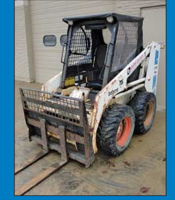
1984 Bobcat Model 743 Front End Loader

Sullair Model 185DPOJD Trailer Type Diesel Air Compressor; S/N 004-114098, 125 PSIG