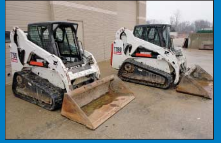
(2) 2008 Bobcat T-190 Rubber Track Front End Loaders