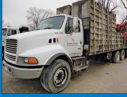
2000 Sterling Model LT9513 Tandem Axle Concrete Form Delivery Truck w/ Fassi Hydraulic Crane