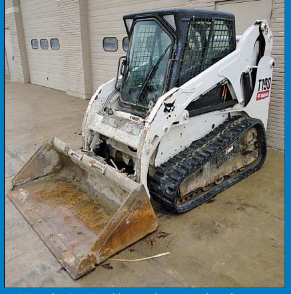
(2) 2008 Bobcat T-190 Rubber Track Front End Loaders