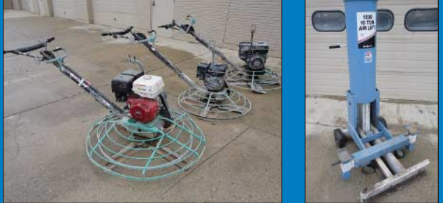
Large Quantity Contractors Tools and Equipment