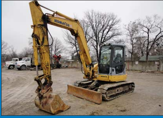
2006 Komatsu Model PC-78-MR6 Hydraulic Track Excavator