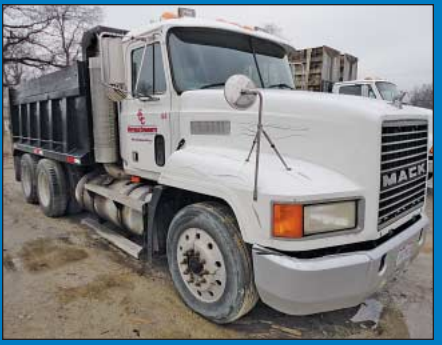
1998 Mack Model CH613 Tandem Axle Dump Truck