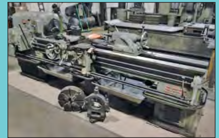
17" X 84" American Pacemaker Engine Lathe

Office Equipment Consisting of; (2) Dell Desk Top PC Systems, H.P. Office Jet 6500A Wireless Fax-Copier-Scanner, Sharp AL-1631 Laser Copier, Desks, Chairs, Tables, Book Cases and Other Related Items