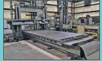
RARE OFFERING OF LARGE CAPACITY SURFACE GRINDERS