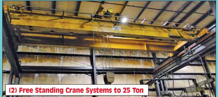
(2) Free Standing Crane Systems to 25 Ton