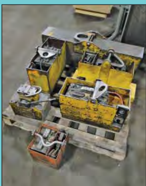
(8) Lifting Magnets from 2 to 5 Ton