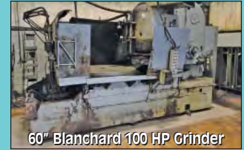
60" Blanchard 100 HP Grinder