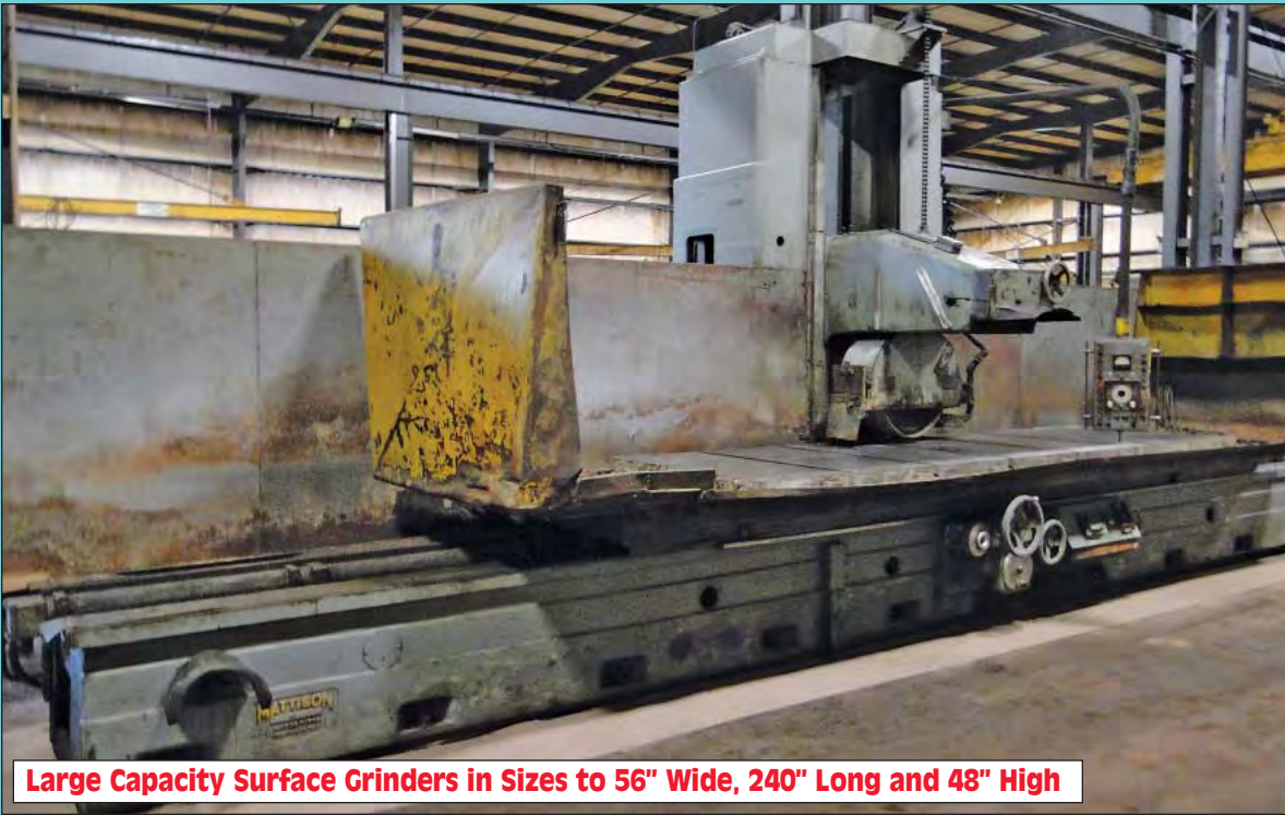
Large Capacity Surface Grinders in Sizes to 56" Wide, 240" Long and 48" High

INSPECTION: MONDAY, MARCH 4TH FROM 10:00 AM TO 4:00 PM