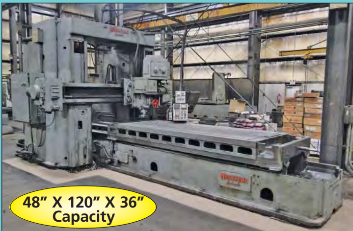
Gray "Wide Pattern" Double Housing Planer Mill