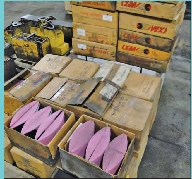
Several Hundred New and Used Segmented Grinding Wheels