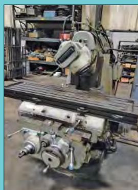
Cincinnati Model 215-16 Horizontal Mill