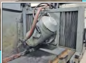
20" X 120" Thompson Hydraulic Surface Grinder