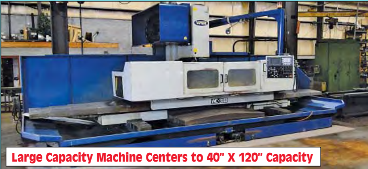
Large Capacity Machine Centers to 40" X 120" Capacity