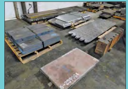
Partial View Steel Material