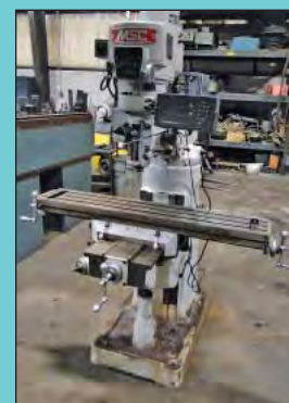
3 Hp Msc Vertical Ram Type Mill