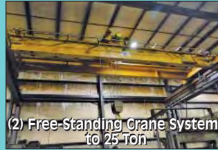
(2) Free-Standing Crane Systems to 25 Ton