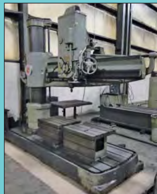
8' Arm X 16" Col. Cincinnati Bickford Radial Arm Drill

No. 4 Warner & Swasey Square Head Ram Type Turret Lathe; Complete w/ Chucks & Four-Way Toolpost