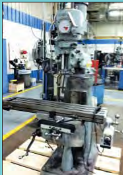
Bridgeport 1.5 HP