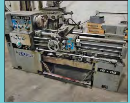
15" X 48" Acra Gap Bed Engine Lathe