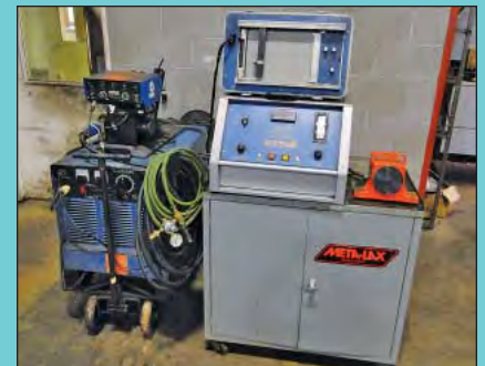
Meta-Lax and Miller Welding Systems