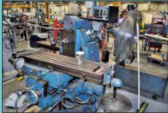
Cincinnati Cinova 80