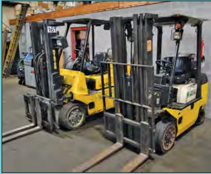
(2 OF 3) Lift Trucks to 8,000 LB Capacity