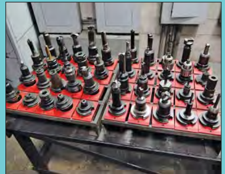
Approx. (100) No. 50 Taper Tool Holders