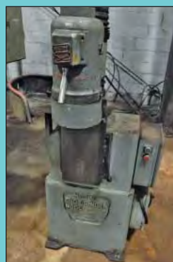
Medina Model B End Grinder