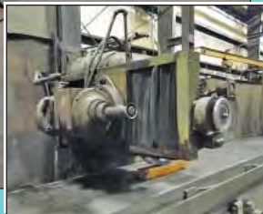
36" X 240" Thompson Hydraulic Surface Grinder