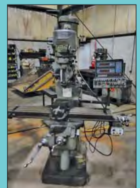
2 HP Bridgeport Vertical Mill