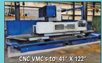
CNC VMC's to 41" X 122"