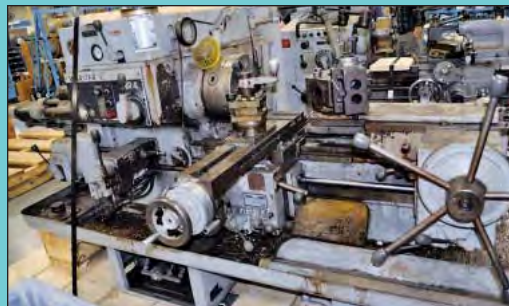
Warner & Swasey Turret Lathe