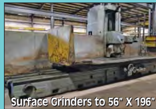
Surface Grinders to 56" X 196"

2020 DUNLAP ST., CINCINNATI, OHIO 45214 PHONE (513) 241-9701 / FAX (513) 241-6760 WEBSITE: cia-auction.com