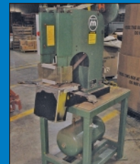
(2) Milford Model 57 Dual Head Riveters