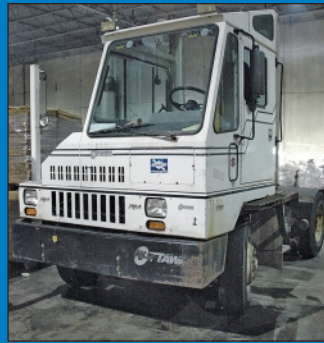
(2) 1999 Ottawa Model Commando 30 Single Axle Spotting Tractors