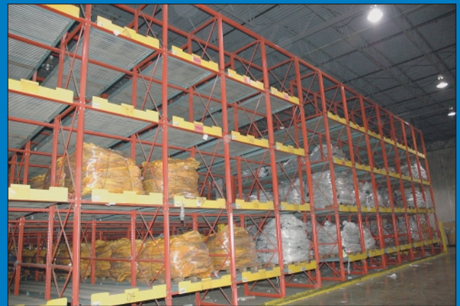
(1) 7-Bay & (1) 6-Bay Flow Rack Storage Systems

INSPECTION: Monday, February 1st from 10:00 AM to 4:00 PM