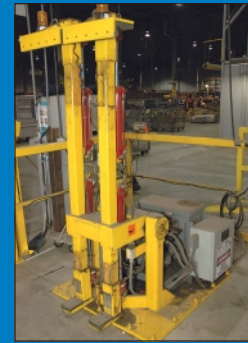
(2) 4,000 Lb Hayer Model LD 4000-MXD / Dump Master Electric / Hydraulic Gaylord Tipper