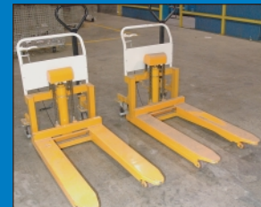
Partial View of Late Model Shop and Support Equipment