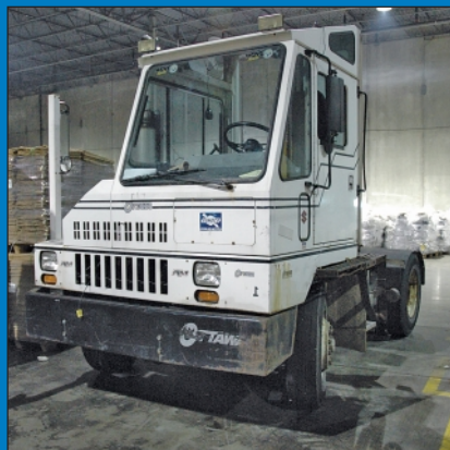
(2) 1999 Ottawa Model Commando 30 Single Axle Spotting Tractors