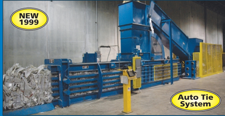
Harris / Selco Model HLO-128AT50-NB Open End Horizontal Hydraulic Baler

2020 DUNLAP ST., CINCINNATI, OHIO 45214 PHONE (513) 241-9701 / FAX (513) 241-6760 INTERNET: www.cia-auction.com