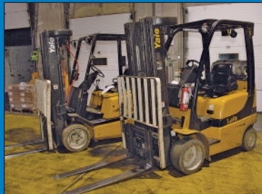
Partial View of Late Model Fork Lifts