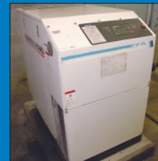
25 HP Ingersoll Rand Model SSR-EP25-SE Rotary Screw Air Compressor