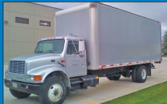
1999 International (4000 series) DT466E 24' Box Truck

Other Office Equipment and Furniture Including: Xerox Workcenter PE16 Copier, Sansung SCX-4725 Copier, Brother Fax Machine, H.D. 4250 Laser Printer Xerox 5664 Copier, (10) Cherry Finish Executive Desk Sets, File Cabinets, Training Room, Cafeteria Furniture and Many Other Related Items