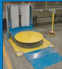
(2) 3,000 LB Bishman Model "EZ-Loader" Rotary Lift Tables