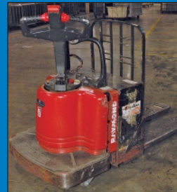
(3) 6,000 Lb Raymond Model 12TM-FRE60L Electric Walk-Behind Pallet Trucks