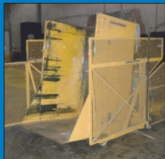
(5) New Breed Model MTEATER-003A Portable Electric Basket Tilter