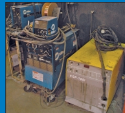
Partial View of Late Model Welders