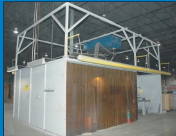
15' X 25' Bolt-Together Welding Enclosure