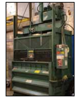
SELCO VS-6M Cardboard Baler