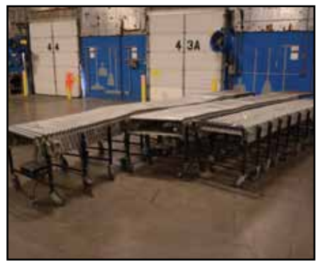
BEST FLEX Roller & Skate Conveyor