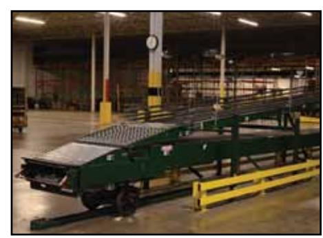
Approx. (20) RAPISTAN DEMATIC Trailer Loader Conveyors