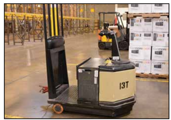
(6) CROWN TR3000 & TR3540-200 Tuggers

Inspection: Monday, Feb. 23rd from 9AM - 4PM