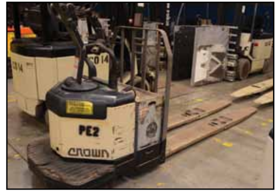
CROWN Electric Paller Jacks