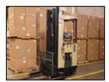
CROWN Stock Pickers, Reach Truck,