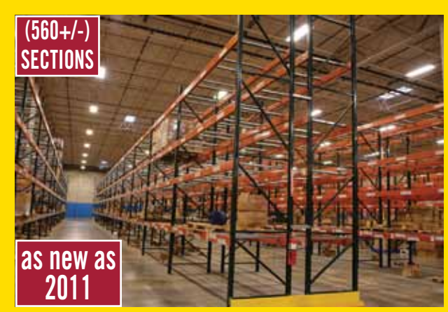
Approx. (560) Sections RIDG-U-RACK Pallet Racking, As New As 2011