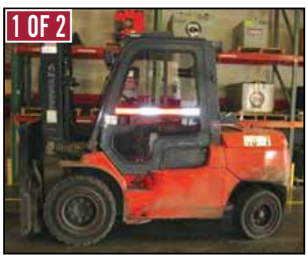
(2) 2009 TOYOTA 7FGCU45 10,000-lb. LPG Forklifts