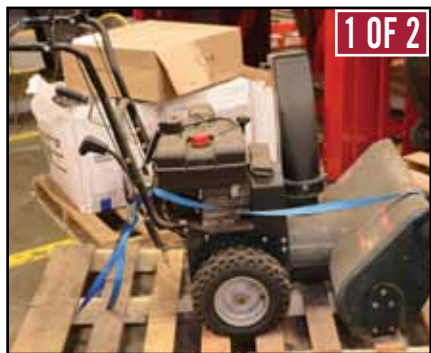
(2) CRAFTSMAN 26" Snow Blowers