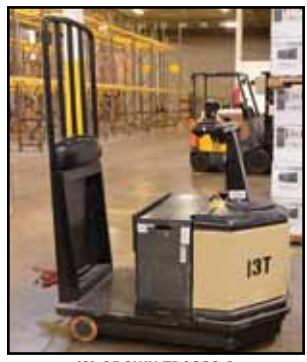
(6) CROWN TR3000 & TR3540-200 Tuggers