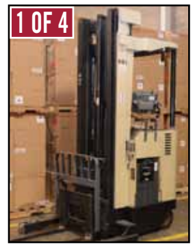
(4) CROWN 3000-lb Reach Truck & Stock Pickers