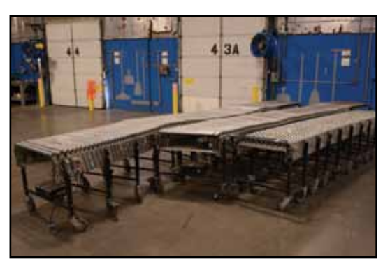
Several Sections of BEST FLEX Accordion/Flexible Conveyor