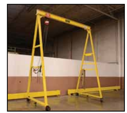
2-Ton Rolling A-Frame