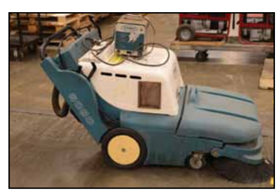
TENNANT 6080 Electric Floor Sweeper