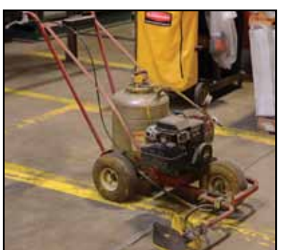
Gas Powered Line Striper