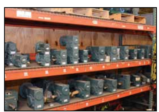
Conveyor Repair Parts Inventory

(3) CROWN 3,000-lb. Stock Pickers, Model SP3000, Electric, 240" Lift Height CROWN 3,000-lb. Reach Truck, Model RR3000, Electric, 218" Lift (7) CROWN Pallet End Riders, Model 3000-3500, Electric (6) CROWN Tuggers, Model TR3000 &