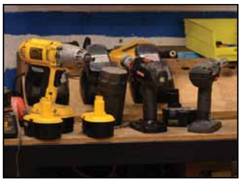
Assorted Cordless Power Tools