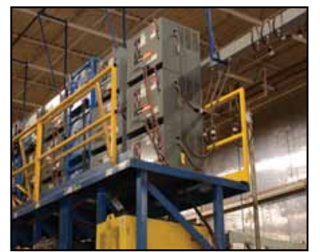
EXIDE & WORKHOG Forklift Battery Chargers To 48-Volt