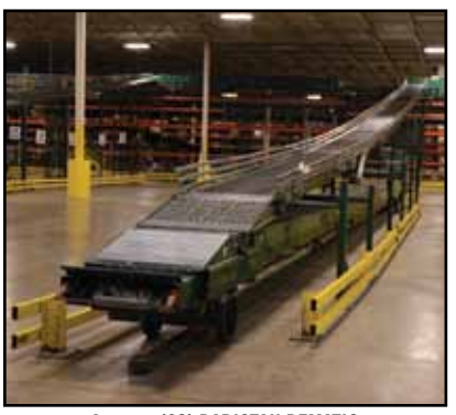
Approx. (20) RAPISTAN DEMATIC Trailer Loader Conveyors