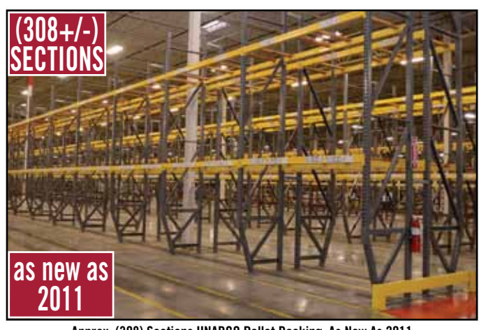
Approx. (308) Sections UNARCO Pallet Racking, As New As 2011