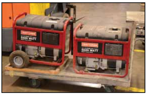
(2) CRAFTSMAN 5600 Watt Generators