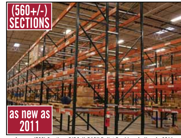
Approx. (560) Sections RIDG-U-RACK Pallet Racking, As New As 2011