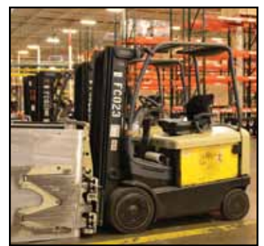
CROWN FC 4,775-lb. Forklift