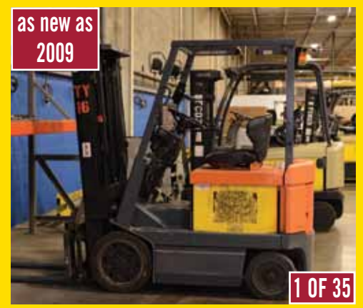
(35) TOYOTA, CROWN & HYSTER Forklifts to 10,000-lb. Capacity

Inspection: Monday, Feb. 23rd from 9AM - 4PM