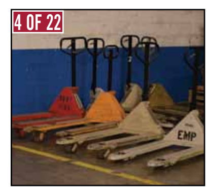
(22) CROWN Pallet Jacks