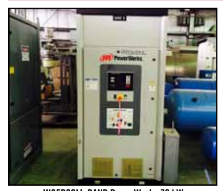
INGERSOLL-RAND PowerWorks 70 kW Microturbine / Peak Shaving Natural Gas Generator Set