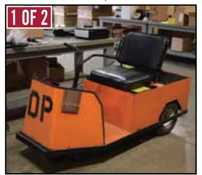
MOTREC E240 Electric Personnel Carriers