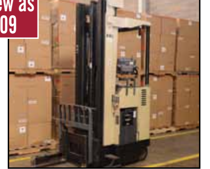
(35) TOYOTA, CROWN & HYSTER Forklifts to 10,000-lb. Capacity