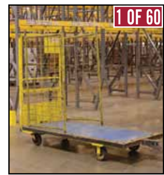
(60) Rolling Material Carts