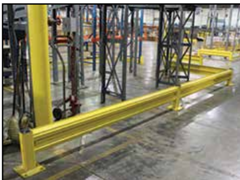
Lots of Yellow Guard Rail