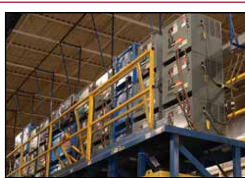
(50+/-) ACCU-CHARGER, WORKHOG & EXIDE Forklift Battery Chargers