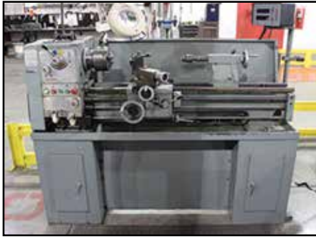
BIRMINGHAM CT-1440G Lathe