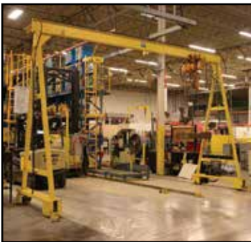
SACKETT 2-Ton Rolling A-Frame