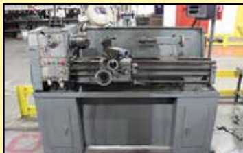
BIRMINGHAM CT-1440G Lathe