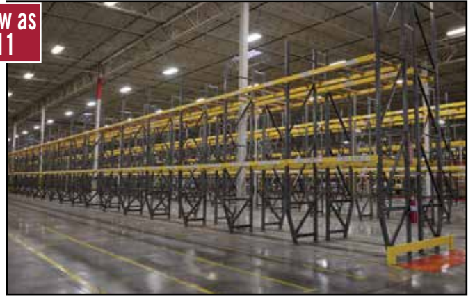
(2,000+/-) Sections RIDG-U-RACK, UNARCO & STURDI BILT Pallet Racking