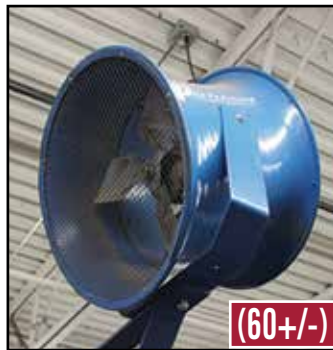
(60+/-) PATTERSON Turbo Fans