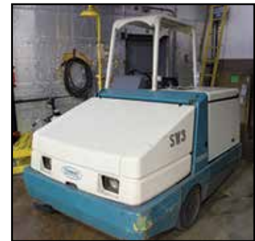
TENNANT 355E Floor Sweeper