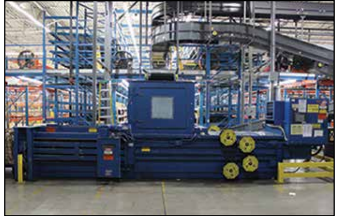
BALEMASTER AUTO TYER Horizontal Cardboard Baler

Inspection: Day prior to auction from 9AM - 4PM