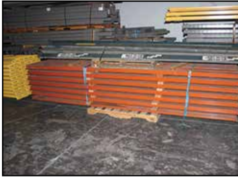
(300+/-) Beams for Teardrop Racking