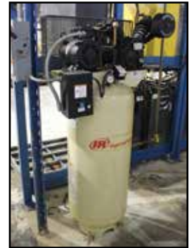
INGERSOLL RAND Air Compressor

Storage Cabinets & Contents • FREUHAUF 53' Storage Trailer (Salvage Only) • (7) CRAFTSMAN Rolling Toolboxes • Lots of Yellow Guard Rail • 100's of Nylon Straps • TEK 9000 48" x 48" Digital Scale • Assorted Manual Jacks CRAFTSMAN Salt Spreader • CRAFTSMAN 46" Mower w/Snow Plow, 20.5-HP, 6-Speed • CRAFTSMAN 2900 PSI Pressure Washer, Gas Powered • WILTON 8" Vice • (3) KENMORE Propane Grills • (2) PORT-A-COOL Fans • (60+/-) PATTERSON 24" Turbo Fans • Air Circulation Fans to 42" • WERNER Ladders to 12' • SERVICEMASTER & DYSON Floor Sweeper & Vacuums • Several Globe & Corner Mirrors Maintenance Crib including: Spare Conveyor Gear Drives, Motors, Steel Rollers,