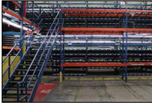
Approx. 50' x 620' UNARCO Pick Module System