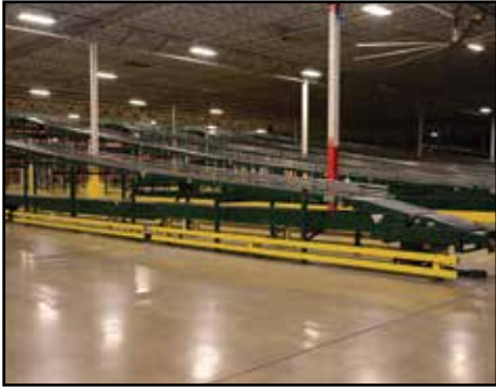
(20+/-) RAPISTAN DEMATIC Trailer Loader Conveyors