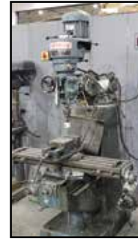
WELL-SETTING 3-HP Milling Machine

SALE STARTS AT 4000 LOCKBOURNE INDUSTRIAL PARKWAY