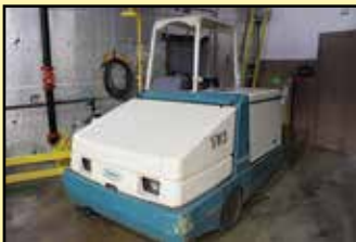
TENNANT 355E Floor Sweeper