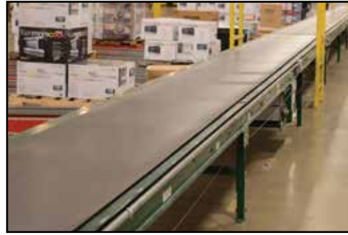
Over 8,000' RAPISTAN Conveyor