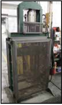
GREENLEE 30-Ton Hydraulic H-Frame Press