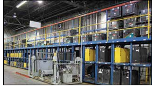
SACKETT SYSTEMS 56-Station Battery Charging Station