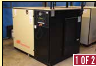
(2) 2007 INGERSOLL RAND 40-HP Air Compressors