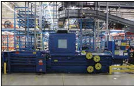
BALEMASTER AUTO TYER Horizontal Cardboard Baler

PRESORTED FIRST CLASS MAIL U.S. POSTAGE PAID CINCINNATI, OH PERMIT NO. 5714