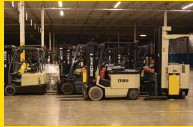
Approx. (35+/-) TOYOTA, CROWN & HYSTER Forklifts to 10,000-lb. Capacity