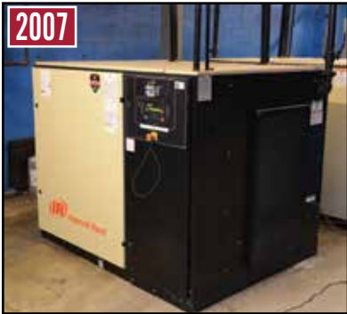
(2) 2007 INGERSOLL RAND 40-HP Air Compressors