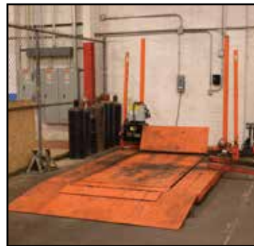
AUTOQUIP VR-PT-200-C 10-Ton Vehicle Lift