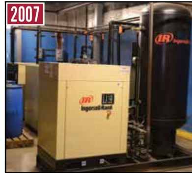
2007 INGERSOLL RAND TS2A Dryer