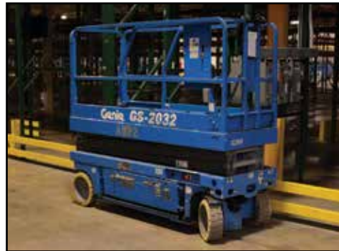
GENIE 2032 20' Electric Platform Scissor Lift