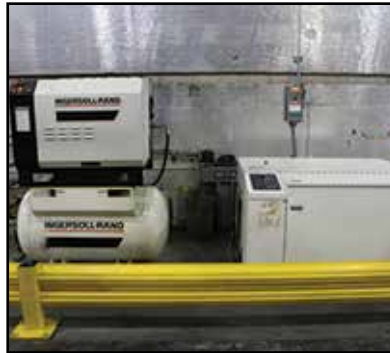
(2) INGERSOLL RAND 15- & 7.5-HP Air Compressors