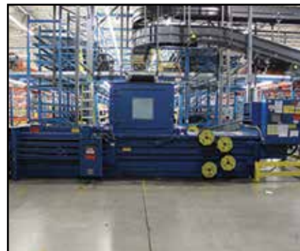
BALEMASTER AUTO TYER Horizontal Cardboard Baler

Desks • Chairs • File Cabinets • Lounge Tables • Plastic Storage Cabinets • Personal Lockers • Work Benches • Metal Shelving • EAGLE & SECURE-ALL Flammable Storage Cabinets NU-ERA 12-Drawer Modular Tool Cabinet (22) Bottle-Type Hot/Cold Water Dispensers