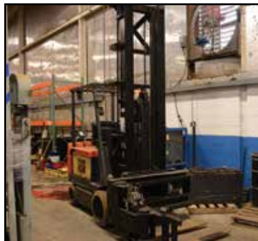
TOYOTA 5FBCU030 6,000-lb. Forklift