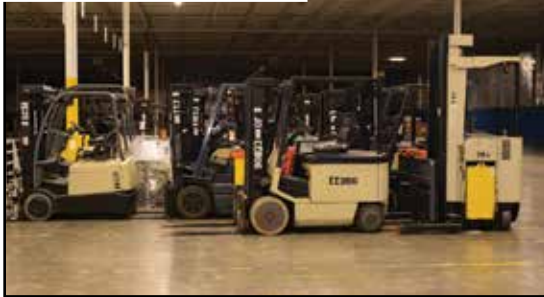
Approx. (35+/-) TOYOTA, CROWN & HYSTER Forklifts to 10,000-lb. Capacity