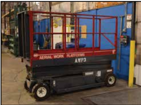
MEC 2034 HT 20' Electric Platform Scissor Lift