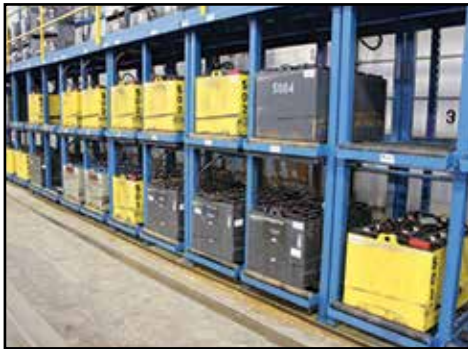
(60+/-) EXIDE & WORKHOG Forklift Batteries