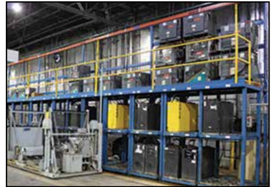
SACKETT SYSTEMS 56-Station Battery Charging Station