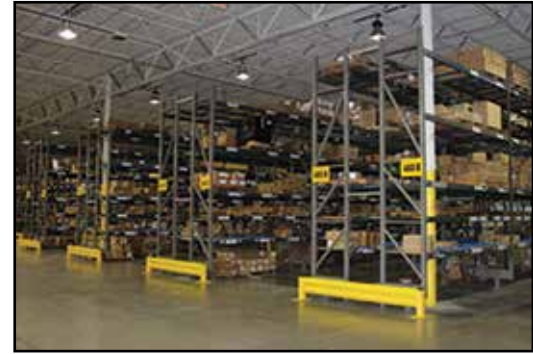
(500+/-) Sections STURDI BILT Pallet Racking