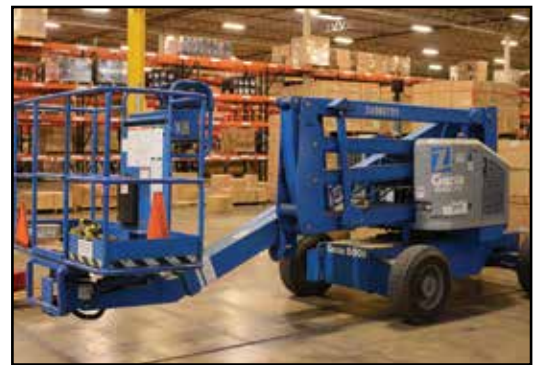
GENIE Z45-22 500-lb. Gas/LP Boom Lift