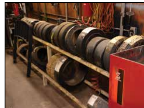
Forklift Repair Parts Inventory