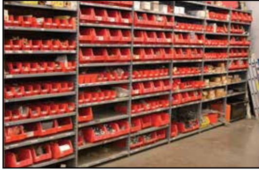
Miscellaneous Hardware & Cabinets