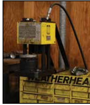
WEATHERHEAD T-400 Coll-O-Crimp Hose Crimper