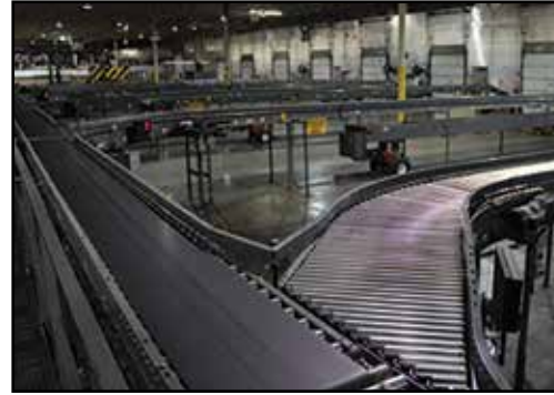
(500+/-) BUSCHMAN 20" - 28" Power/Roller Conveyor