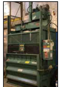
SELCO VS-6M 36" x 72" Cardboard Baler