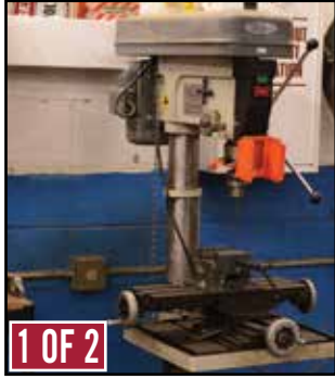
WILTON & CRAFTSMAN 20" Drill Presses

SALE STARTS AT 4000 LOCKBOURNE INDUSTRIAL PARKWAY