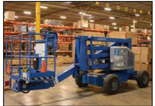
GENIE 245-22 500-lb. Gas/LP Boom Lift