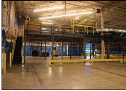
45' x 55' Mezzanine