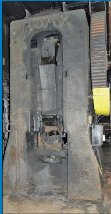
1,300 Ton Ajax Flywheel Type Forging Press