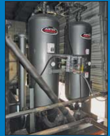
Airtek Model TW-800 Desiccant Type Air Dryer