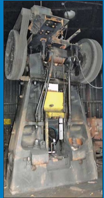
4,000 LB Chambersburg F-Frame Board Type Forging Hammer