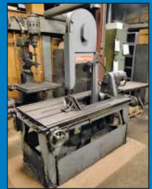
18" Marvel Series 8 Model 8MB Vertical Tilt Frame Band Saw