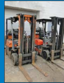
(2) 5,000 LB Toyota Model 5FGC25 LP Gas Solid Pneumatic Tire Lift Trucks