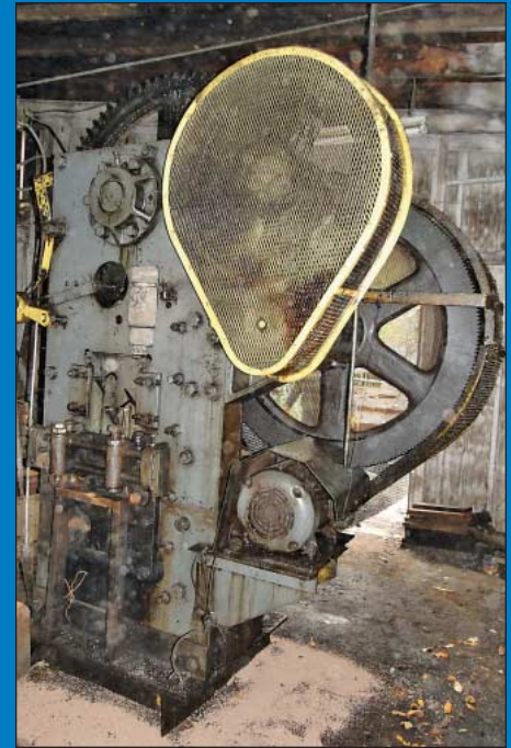
Buffalo Forge Co. Size 8X Spec-BC Mechanical Bar Shear

2 HP Bridgeport Series II Special Vertical Mill; S/N 133940, 9" X 42" Table, Power Table & Knee Feeds, Tru-Trace Attachment