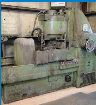
42" Hanchett Model 36 Rotary Surface Grinder