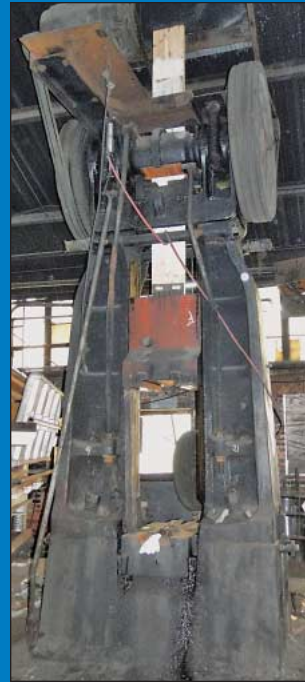
2,500 LB Chambersburg Model 25 Board Type Forging Hammer