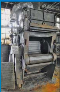
27" Dia. X 36" Wide American Wheelabrator Model 27X36 Steel Belt Abrasive Blast Machine