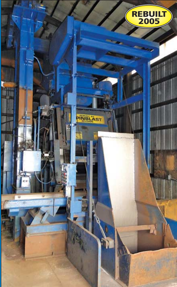
32" Dia. X 42" Wide Wheelabrator Tumblast Steel Belt Abrasive Blast Machine

Bidspotter.com™ To Become a Qualified Bidder on the Internet See Instructions on Page 2