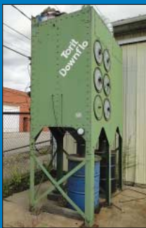
Torit Model DF3B-F6 Six-Cartridge Dust Collector