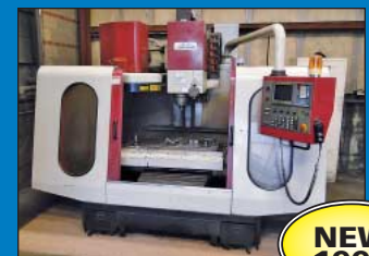
Johnford Model VMC-1024 CNC Vertical Machining Center