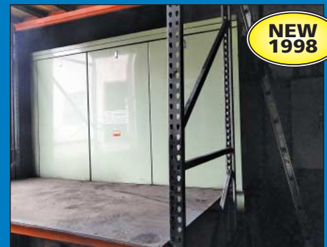
150 HP Sullair Model LS-20S-150L-ACAC Rotary Screw Cabinet Enclosed Air Compressor