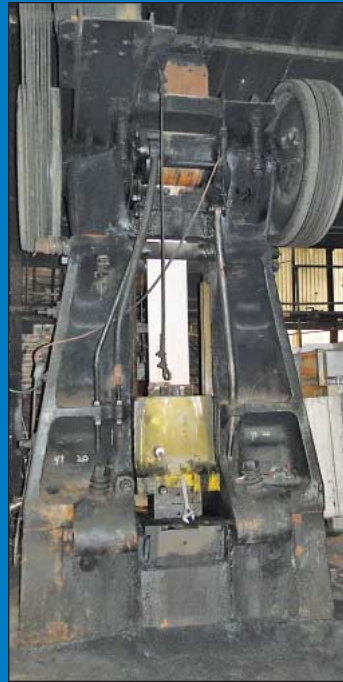
3,000 LB Chambersburg J-Frame Board Type Forging Hammer