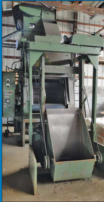
27" Dia. X 36" Wide Wheelabrator Tumblast Steel Belt Abrasive Blast Machine