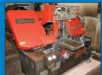
(2) 16" X 16" Amada Model HA400 Automatic Horizontal Band Saws