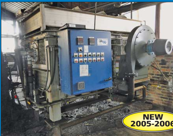
(2) 72" Wide The Furnace Works Gas Fired Slot Furnaces