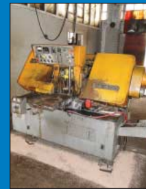
(2) 16" X 16" Amada Model HA400 Automatic Horizontal Band Saws

There Is A Large Amount Of Steel Weight In The Forging Hammer Anvil Bases Which will Possibly Be Sold For Scrap at the auction along with a Large Portion Of The Other Machinery.