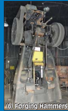
(6) Forging Hammers