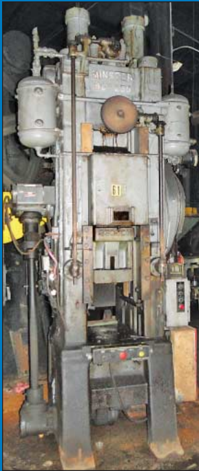
250 Ton Minster Model 90-250 Knuckle Press