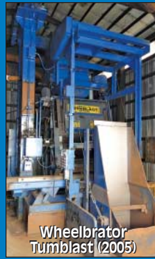
Wheelabrator Tumblast (2005)

2020 DUNLAP ST., CINCINNATI, OHIO 45214 PHONE (513) 241-9701 / FAX (513) 241-6760 WEBSITE: cia-auction.com