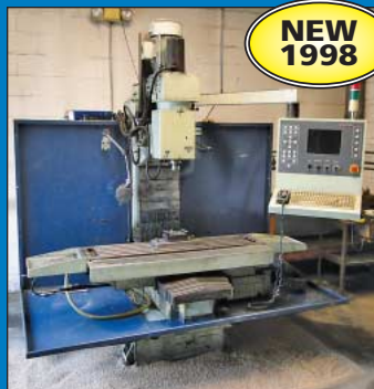
Sharnoa Model SD30 CNC Vertical Machining Center