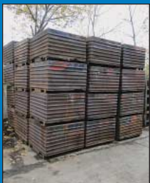
(250) Corrugated Tub and Wire Baskets