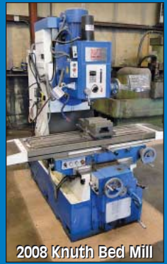
2008 Knuth Bed Mill