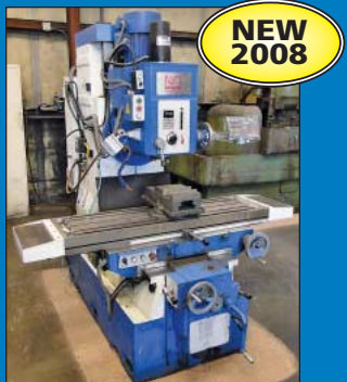
Knuth Model KB1400 Bed Type Vertical Milling Machine