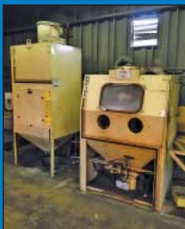
Empire Model PF-3648 Blast Cabinet