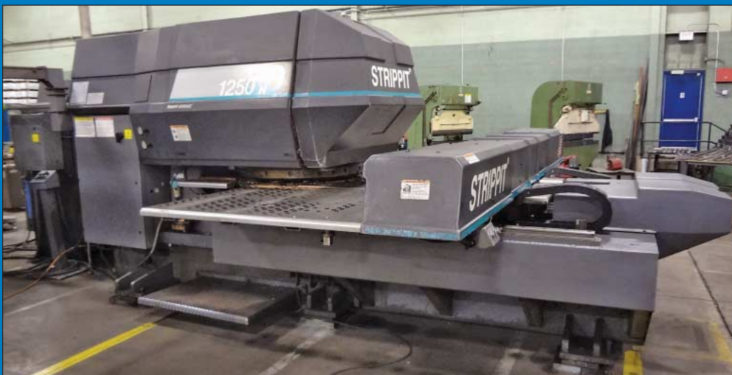
33 Ton LVD/Strippit Model FC1250-H/30C Thick Turret CNC Laser Punch Press