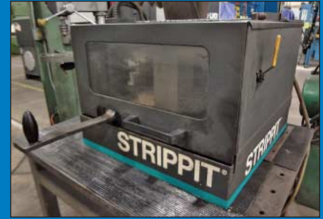
Stippit Model "Wet Grinder" Punch Grinder