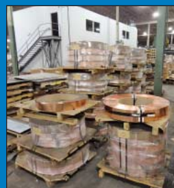
Large Quantity of Sheet Steel/Raw Inventory; Copper Coils, Stainless Steel Sheet Stock, Galvanized Sheet Stock