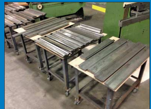
Large Quantity Press Brake Tooling