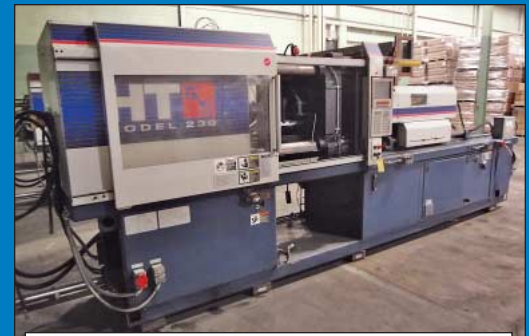
(2) 230 Ton X 10.9 Oz. Van Dorn Demag Model 230HT500 Hydraulic Toggle Clamp Plastic Injection Molding Machines