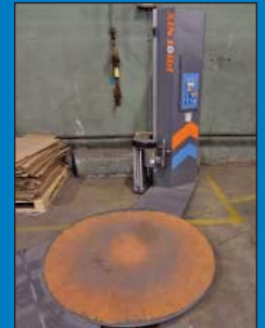
Phoenix Model PLP2150 Rotary Pallet Stretch Wrap Machine