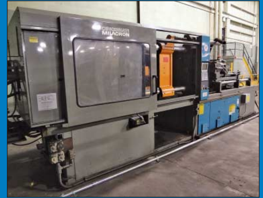
440 Ton X 29 Oz. Cincinnati Model VT440-29 Injection Molding Machine