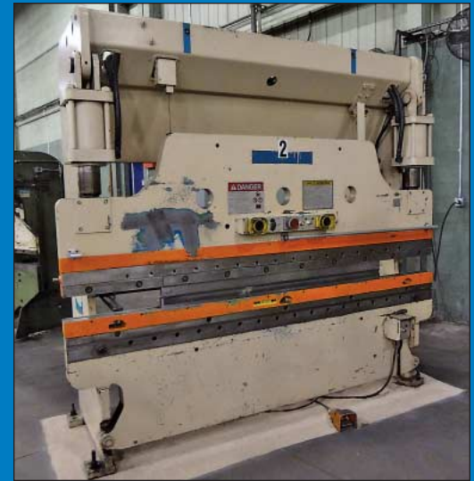
90 Ton x 10' Cincinnati Model 90CBX 8' Press Brake