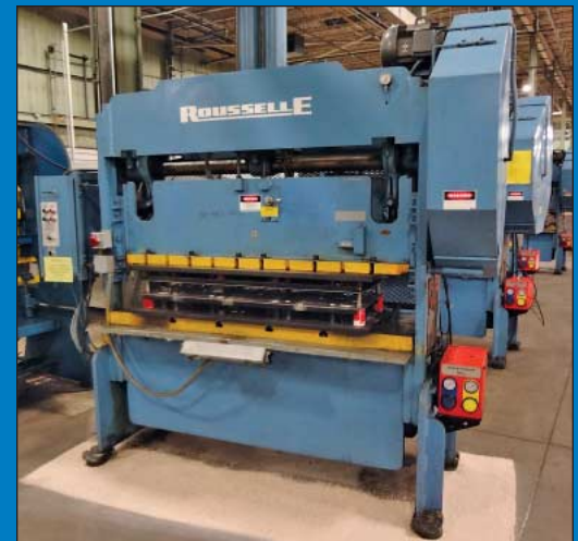
(4) 40 Ton Rousselle Model 4SS72 Straight Side Double Crank Presses

and Rams, 62" Between Side Frames; S/N 1094, Has Manual Back Gage