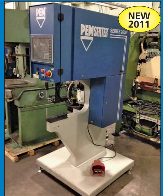
Penn Engineering / Pemseter 2000 Model 2019A-1444 Insertion Machine