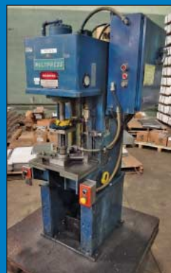
4 Ton Denison Multipress Hydraulic C-Frame Press