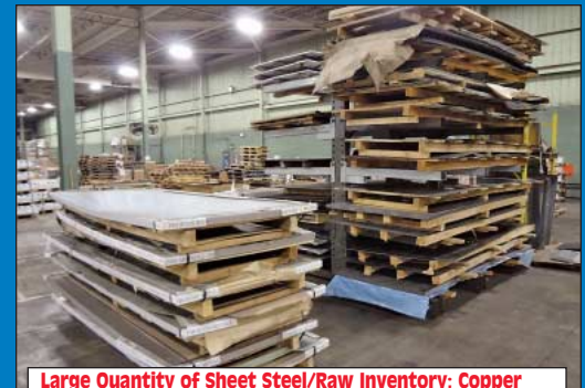
Large Quantity of Sheet Steel/Raw Inventory; Copper Coils, Stainless Steel Stock, Galvanized Sheet Stock