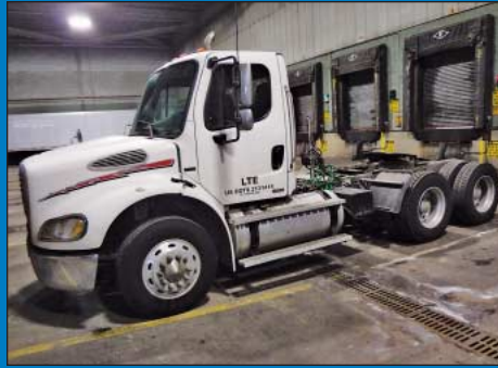
2005 Freightliner Tandem Axle Conventional Cab Road Tractor