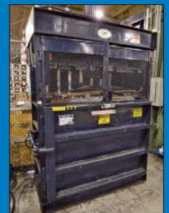
Cram-A-Lot Model 60 CONT-BO-RB Vertical Hydraulic Cardboard Baler