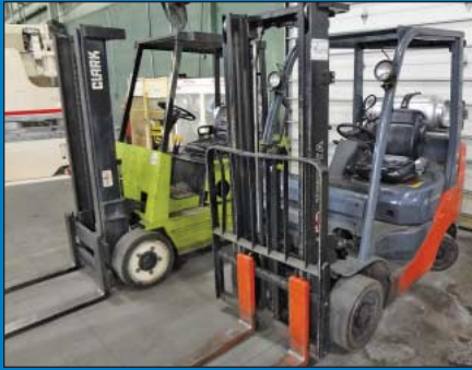
(3) Lift Trucks by Toyota, Clark and Mitsubishi Up to 3,000 Lb.