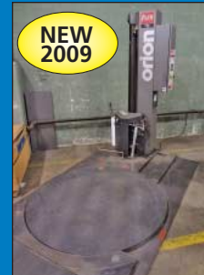
Orion Model LPD / Flex Series Rotary Pallet Stretch Wrap Machine