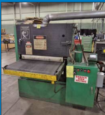
36" Timesaver Model 137-1HDM Single Top Belt Sander