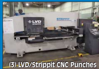
(3) LVD/Strippit CNC Punches

Contact Information 2020 Dunlap St. Cincinnati, Ohio 45214 Phone 513-241-9701 Fax 513-241-6760 www.cia-auction.com