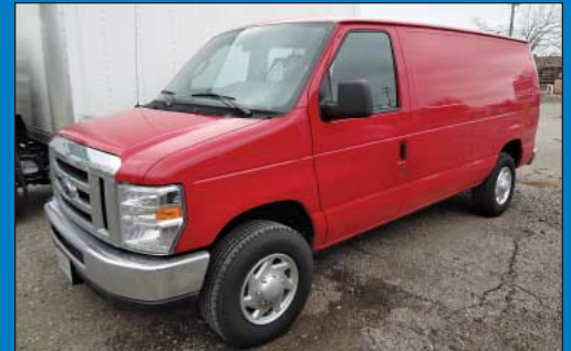
2013 Ford E250 Super Duty Advance Trac RSC Cargo Van

Late Model Office Furniture: (2) 4-Person Haworth Fabric Panel Cubicle Sets with Overhead Laterals, Letter Files, 44" Side Walls, (1) Haworth Reception Area Set, (7) 43" x 94" Maple Colored Conference Tables with (6) Grey Fabric Side Chairs by Loft, (3) Executive Office Sets with Desks, Credenza, Bookcases, Assorted Letter Files, Oxford Files, Office Chairs, (8) 96" Long Plastic Breakroom Tables with Folding Chairs and Other Related Items