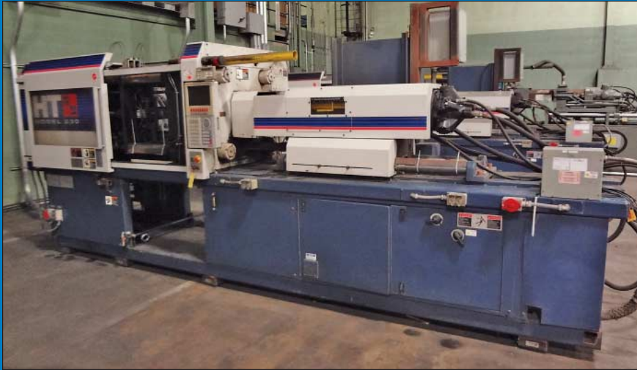
(2) 230 Ton X 10.9 Oz. Van Dorn Demag Model 230HT500 Hydraulic Toggle Clamp Plastic Injection Molding Machines