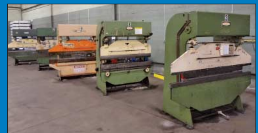
(12) Di-Acro Press Brakes from 35 Ton to 12 Ton