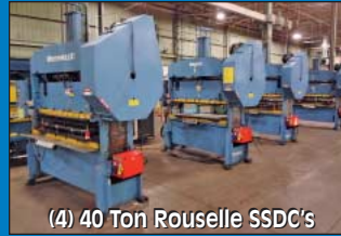
(4) 40 Ton Rouselle SSSC's