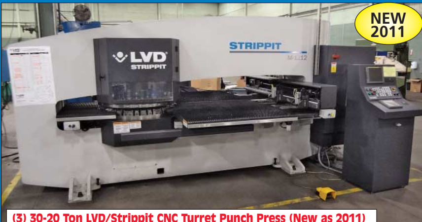
(3) 30-20 Ton LVD/Stripit CNC Turret Punch Press (New as 2011)

INSPECTION: TUESDAY, APRIL 28TH FROM 10:00 AM TO 4:00 PM