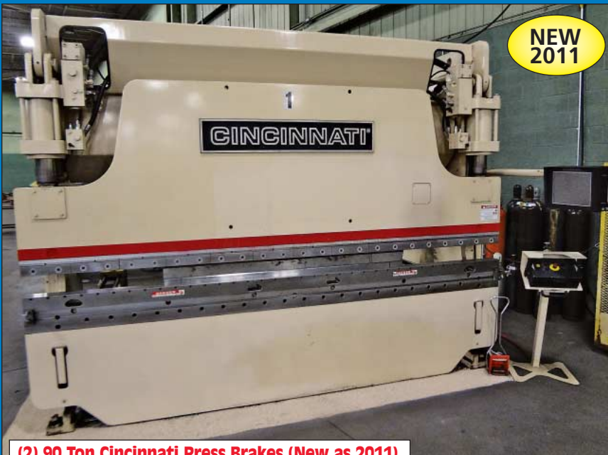
(2) 90 Ton Cincinnati Press Brakes (New as 2011)