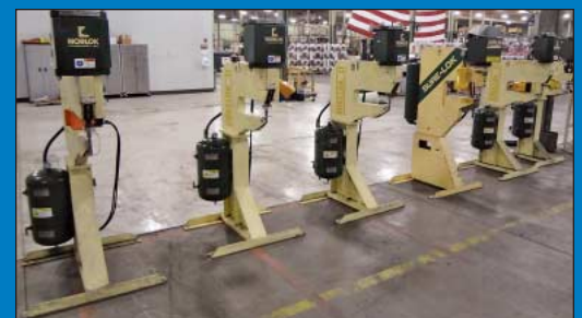
(6) Norlock Pneumatic Toggle Lock Clinching Machines

Parker Model ZDHH Air Dyer; S/N 3960658740004