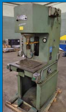
12 Ton Denison Model TL120C20 Hydraulic C-Frame Press