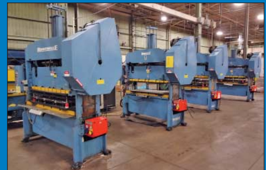
(4) 40 Ton Rousselle Model 4S572 Straight Side Double Crank Presses