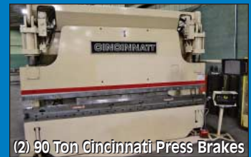
(2) 90 Ton Cincinnati Press Brakes