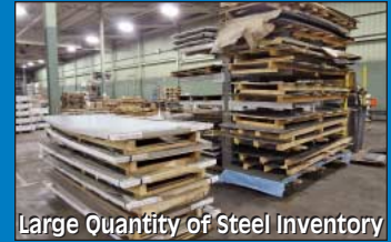
Large Quantity of Steel Inventory