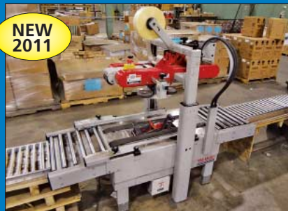
(2) 3M Model 700/A3 Automatic Top & Bottom Case Sealers