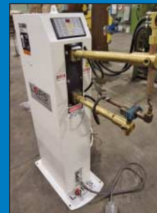
39 KVA Lors Model TE90 Mark II Rocker Arm Type Spot Welder