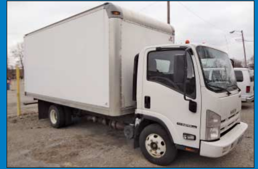
2008 Isuzu Model NPR-HD Single Axle Cab Over Box Van Truck