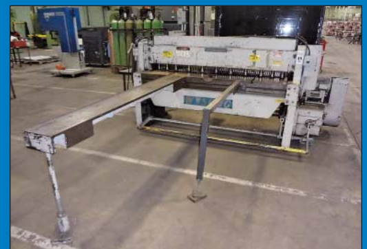
10 Ga. X 72" Wysong Model 1072 Mechanical Shear