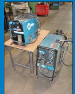
(2) Miller Mig & Tig Welders