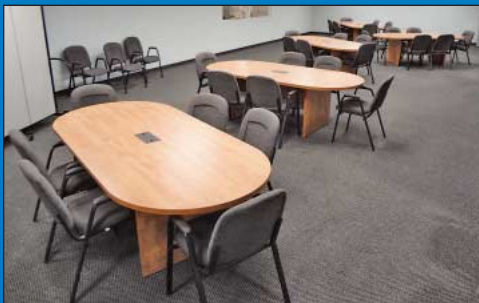
Large Quantity of Late Model Office Furniture