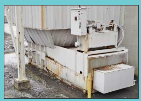
McClain Model E-Z Pack OCTA-11 Horizontal Hydraulic Trash Compactor