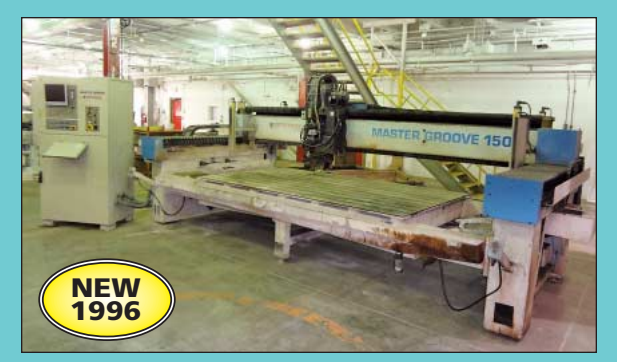
Gantry Type CNC Glass Grooving Machine

COMPLETE GLASS FABRICATING FACILITY INCLUDING CUTTERS, GROOVERS, BEVELLERS, TEMPRING FURNACES, WASHERS AND SUPPORT EQUIPMENT