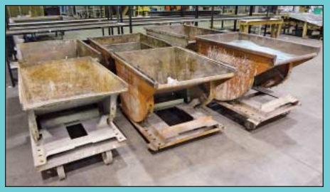
(15) Self Dumping Hoppers