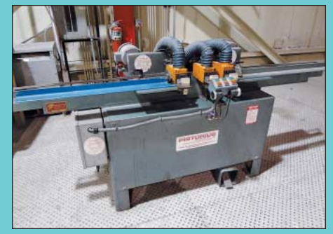
Pistorius Model S-Drill Three-Spindle Stile Drill

Roland Model CAMM-1 Pro Vinyl Cutter, 42" HP Model C770B Plotter, Desks, Credenzas, Bookshelves, File Cabinets, Lateral Files Cabinets, PC's, Monitors, & Other Related Items