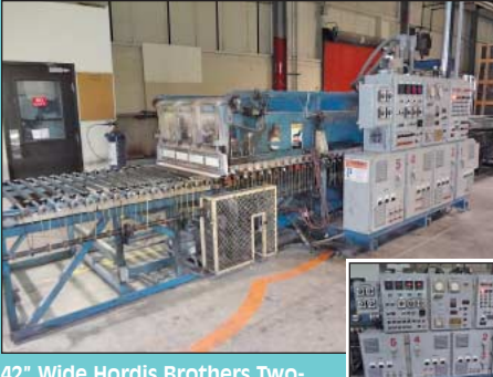
Wide Hordis Brothers Two-Zone Glass Tempering Furnace