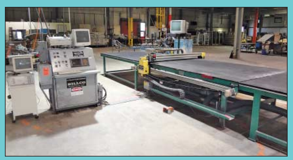
78" X 120" Billco Two-Axis Bridge Type CNC Glass Cutting Table