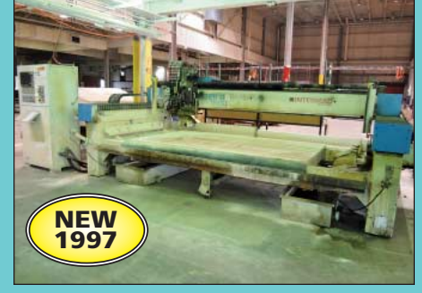
69" X 118" Intermac Model Master Groove 1500 Three-Axis Gantry Type CNC Glass Grooving