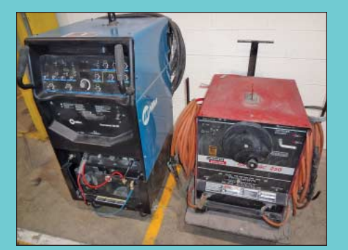
250 Amp Miller Syncoware 250 DX Tig Welders & 250 Amp Lincoln Idealarc 250 Welder