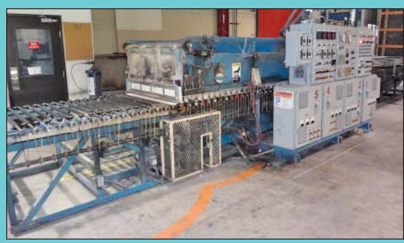
ide Hordis Brothers Two-Zone Glass Tempering Furnace