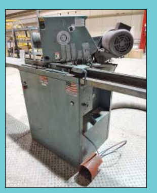
10" X 10" CTD Model D45X Double Mitre Saw