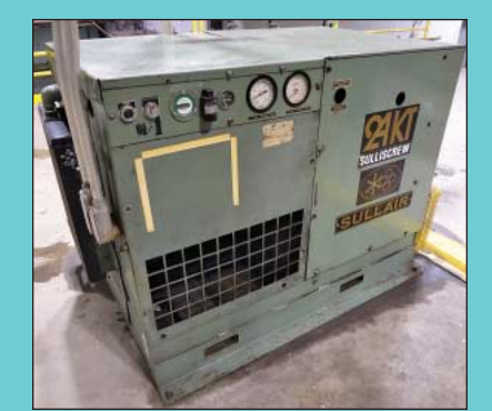
40 HP Sullair Model 10-40L Cabinet Enclosed Rotary Screw Air Compressor