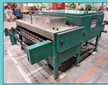
60" Wide Billco Swiggle Type Insulated Glass Electric Heated Roller Press