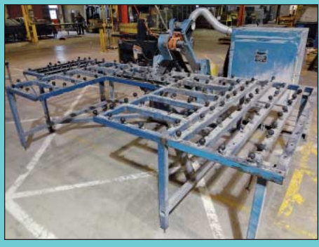
4" Wide Twin-Belt Glass Edge Polisher