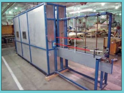
30" High Custom Built Vertical Continuous Feed Glass Panel Air Dryer

No Last Minute Registrations will be accepted. Make Sure to Register & Post Your Deposit No Later than 48-Hours Prior to the Start of the Auction.