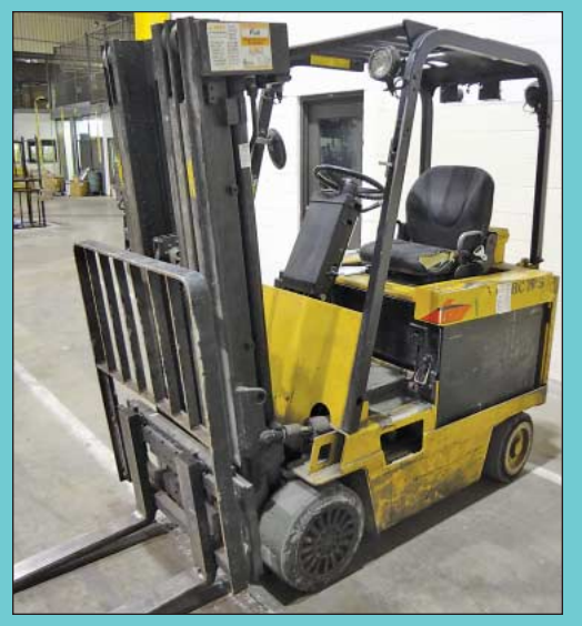
4,550 LB Daewoo Model BC25S Electric Lift Truck

Upcoming Sale Information Liquidation & Equipment Section Email Auction Notification Recent Auction Results Lot Catalog Listings Photo Galleries Downloadable Forms Complete Terms of Sale Staff Profiles Reference Information