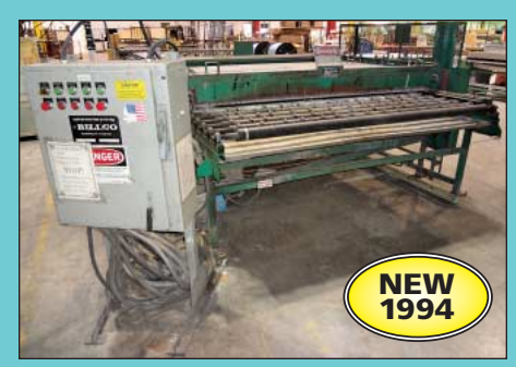
84" Wide Billco Pass-Thru Flat Glass Washer

X 120" Billco Two-Axis Bridge Type CNC Glass Cutting Table