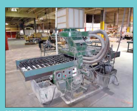
24" Wide Billco Pass-Thru Flat Glass Washer