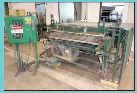
48" Wide Billco Pass-Thru Flat Glass Washer