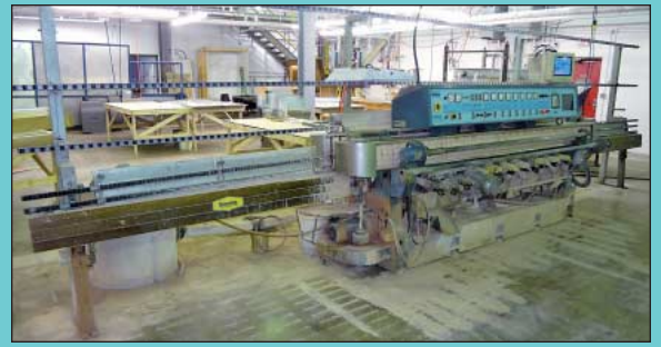
Bovone Electromeccanica Model Mini-Max 371 Pass-Thru Vertical Edge Glass Beveler