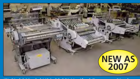
(3) Stahl Model VSA-66 26" Vertical Pressure Stackers