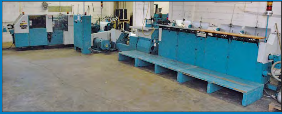
McCain Model LS-2000 Four-Pocket Saddle Stitcher