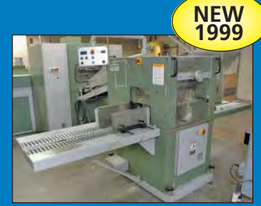
Muller Martini Model 3006 "Star Bind" Perfect Binding Line - Model Uno Type 1534 Stacker View

Muller Martini Merit "S" Type 3671 Three-Knife Trimmer; S/N 404-710-479950 w/ 12" wide x 8' Incline Scrap Conveyor (New 1999) SEE PHOTO