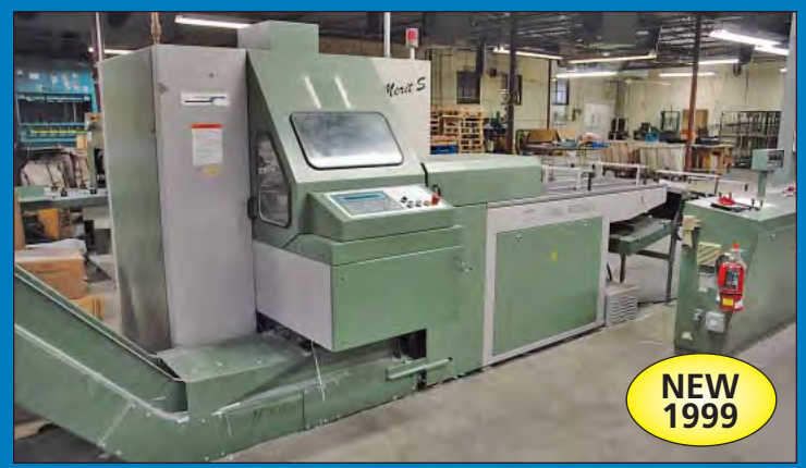
Muller Martini Model 3006 "Star Bind" Perfect Binding Line - Merit "S" Type 3671 Three-Knife Trimmer View