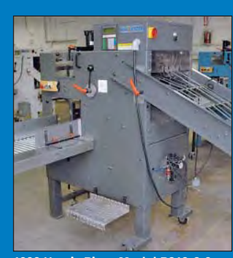
1996 Harris Rima Model RS10-S-9-1/4 Counter/Stacker