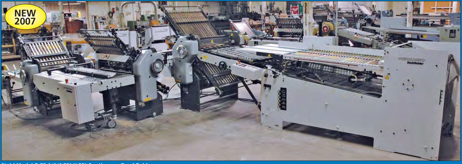
Stahl Model B-30 4/4/4 30" X 50" Continuous Feed Folder