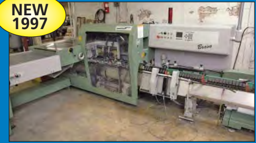
1997 Muller "Bravo" Six-Pocket Saddle Stitcher - Model 380 Stitcher View