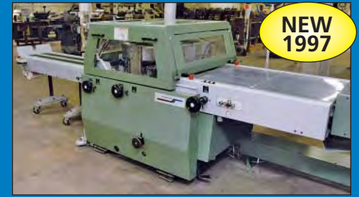
1997 Muller "Bravo" Six-Pocket Saddle Stitcher - Model 360 3-Knife Trimmer View