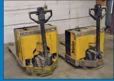
(2) 4,000 LB Yale Model MPBO40A Electric Pallet Trucks

Jay Squire (317) 730-1705 jay@jasgraphics.net