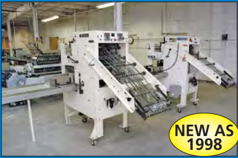
(2 of 4) Harris Rima Model RS10-S-9-1/4 Counter/Stackers