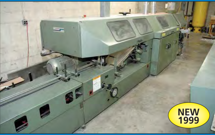
Muller Martini Model 3006 "Star Bind" Perfect Binding Line - 18-Clamp Model 3006-18 Rotary Perfect Binding Machine View