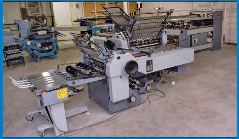
Stahl Model TF-66 4/4/4 26" X 40" Continuous Feed Folder