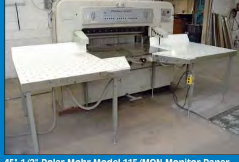
45" 1/2" Polar Mohr Model 115/MON Monitor Paper

Bostitch Model A Single Head Saddle Stitcher; S/N SS777334, 8" Throat, 6' x 24" Saddle Table