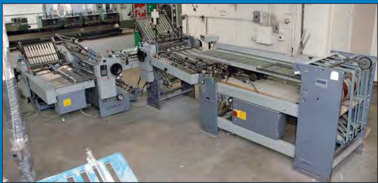
Stahl Model TF-66 4/4/4 26" X 40" Continuous Feed Folder