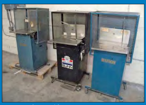
(3) Bunn Tying Machines