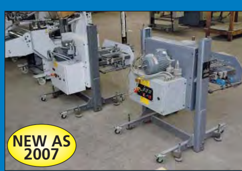
(2) Stahl Model VFZ-52 20" Knife Fold Unit