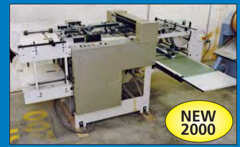
Speil Punchmaster Model 3120 Punch