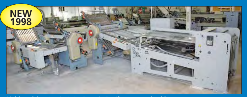
Stahl Model TD/B-30 4/4/4 30" X 50" Continuous Feed Folder