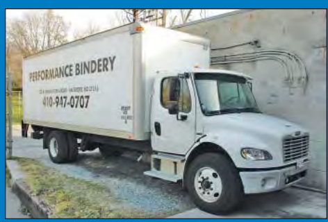
2004 Freightliner Model Business Class M2 Van Truck