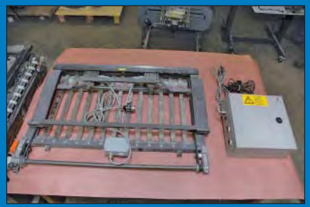
(1 of 3) Electronic Gatefold Attachments