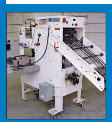
1998 Harris Rima Model RS10-S-9-1/4 Counter/Stacker

Harris Rima Model RS10-S-9-1/4 Counter/Stacker; S/N 602, Runs in Line w/ Saddle Stitcher up to 9-1/4" High Stacks