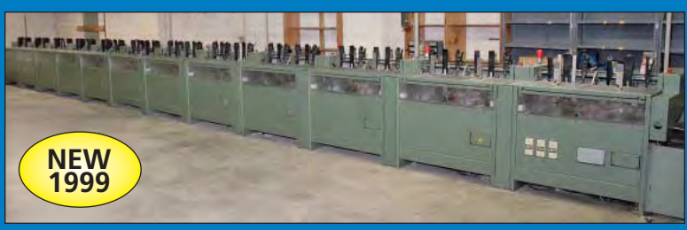
Muller Martini Model 3006 "Star Bind" Perfect Binding Line - 24-Station Type 1531 Signature Feeder View