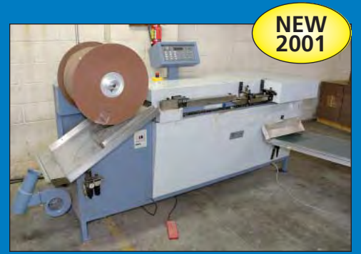
Rilecart Model TP-480 Wire Insertion Binding