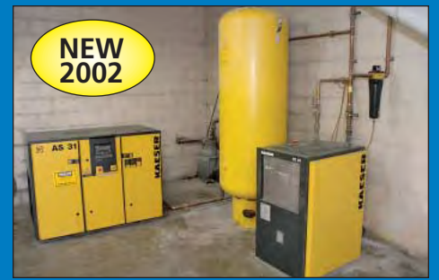
Overall View Air Compressor System Including 25 HP Kaeser Model AS31 Compressor, Dryer and Tank