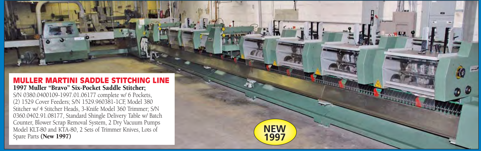
1997 Muller "Bravo" Six-Pocket Saddle Stitcher - Overall View