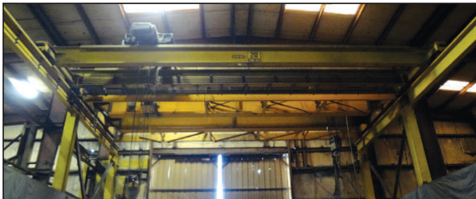
View of 20 & 30-Ton Bridge Cranes