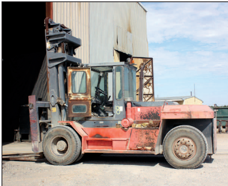
30,000 LB Toyota Mdl. 13000D Diesel Pneumatic Yard Tire Lift Truck