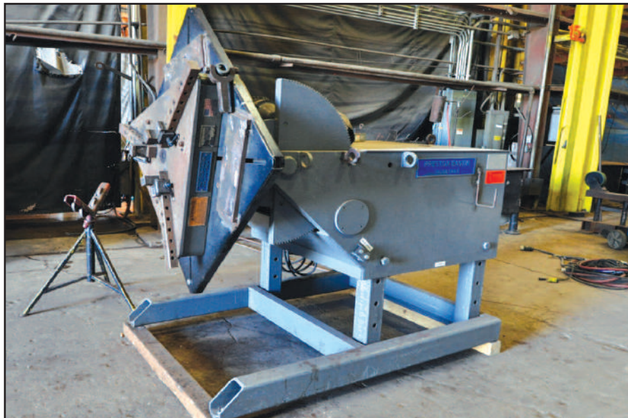
6,000 Lb. Preston Easton Mdl. PA60HD Welding Positioner