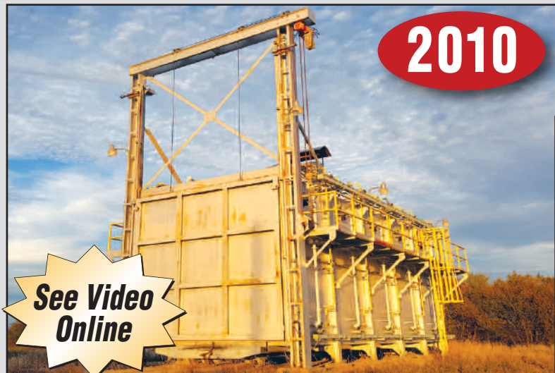
Car Bottom Furnace, 40'x 12'x 12', Range 1150° - 1700°