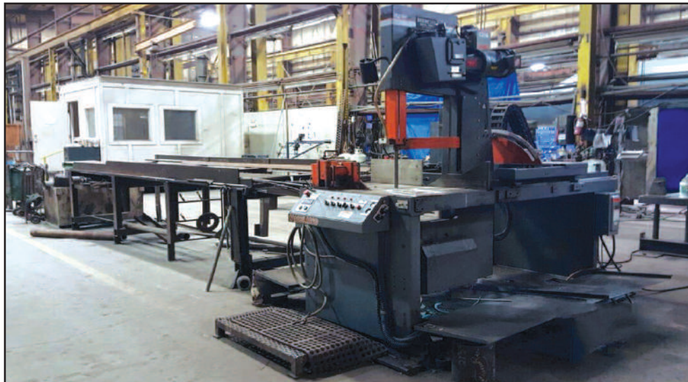
HEM Mdl. V100LM-60 Tilt Frame Vertical Band Saw