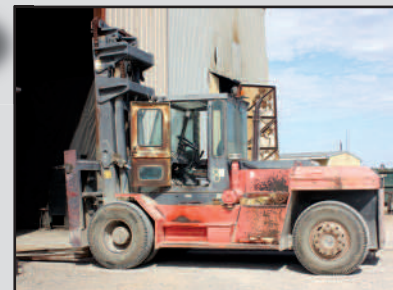
30,000 LB Toyota Mdl. 13000D Diesel Pneumatic Yard Tire Lift Truck

VISIT WEBSITE FOR DETAILS, PHOTOS & COMPLETE TERMS & CONDITIONS WWW.IRSAUCTION.COM