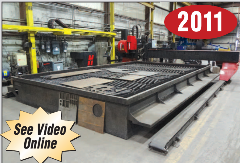
15' x 25' Kinetic Model K3000XMC Combo. CNC Drilling & Plasma/Torch Cutting Machine

Including: Heavy Plate and Pipe Fabricating Machinery, Car Bottom Furnace, Paint Booth, Weld Positioners, Tank Turning Rolls, Welders, HD Lift Trucks and Support Equipment