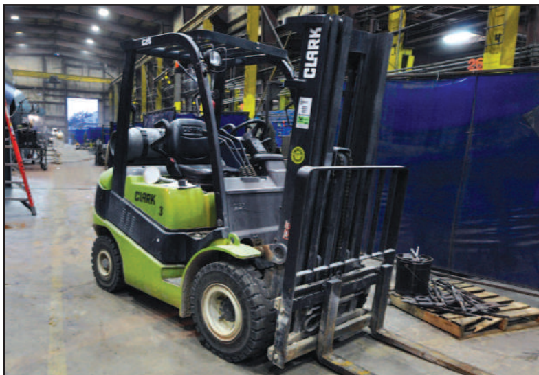
5,000 LB Clark Mdl. C25L LP Gas Pneumatic Yard Tire Lift Truck