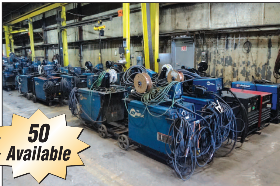
View of Welders