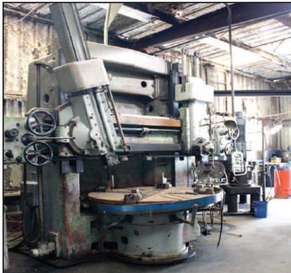
64" Taz Type SK16 Vertical Turret Lathe