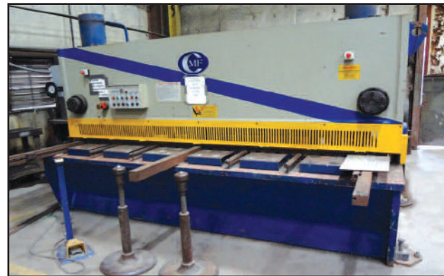
5/8" x 10' CMF Mdl. CS1630 Hydraulic Squaring Shear