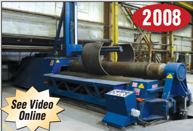
2.125" x 10' Faccin Model 4HEL Type 3154 Four-Roll Hydraulic Plate Bending Machine