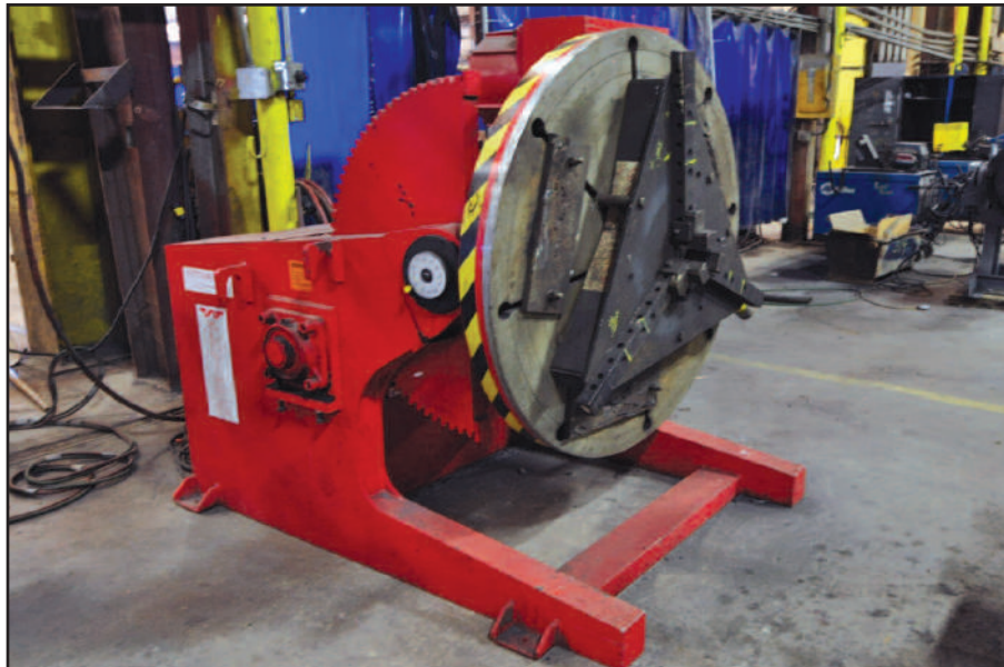
10,000 Lb. Weldwire Mdl. WPT-100 Welding Positioner