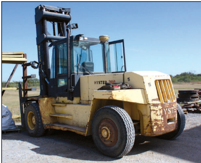
30,000 LB Hyster Mdl. 300XL Diesel Pneumatic Yard Tire