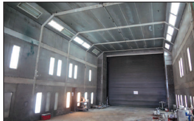
25' Wide x 47' Long x 25' H Col-Met Drive-Thru Paint Booth