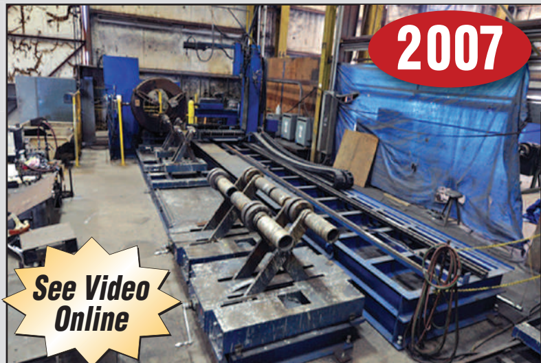
Pipe Coaster Model HID-1500MTS Six-Axis CNC Oxy Fuel / Plasma Pipe Profiling Machine