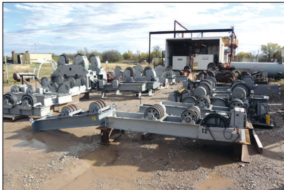
View of Tank Turning Rolls