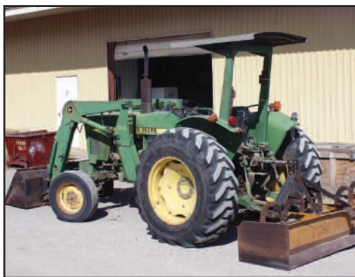
John Deere Tractor