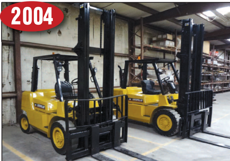
(2) 8,000 LB Caterpillar Model DP40K Diesel Pneumatic Tire Lift Trucks