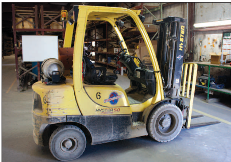
4,000 LB Hyster H40XL LP Gas Pneumatic Yard Tire Lift Truck