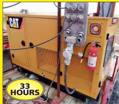
2007 Caterpillar Model D50-45 (45KVA-45KW) Generator Set