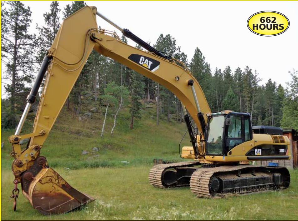
2008 Caterpillar Model 330D Excavator