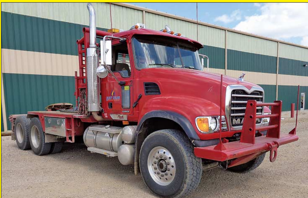
2005 Mack "Granite" Oilfield Winch/Vacuum Truck