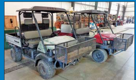
(6) Kawasaki Side by Sides and ATV's