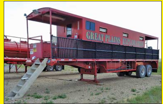
2007 Stanton Dynamics Model DT40 "Doghouse" Oilfield Trailer