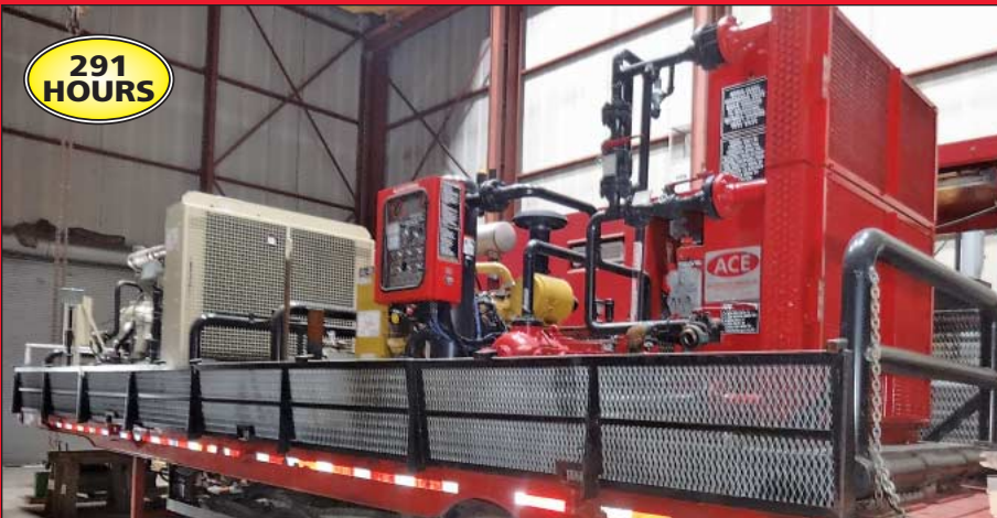
250 HP Ariel Model JGQ/2 Air Booster