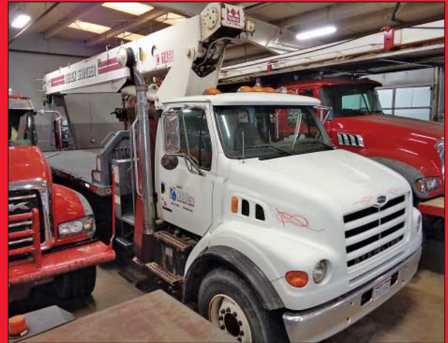
2000 Sterling Model LT7501 Crane Truck

Dickerson Model D35TLD Tandem Axle Trailer; VIN# 1D935TLD57R033612 48' Fontaine Tandem Axle Flat Bed Trailer; ID # 51520414