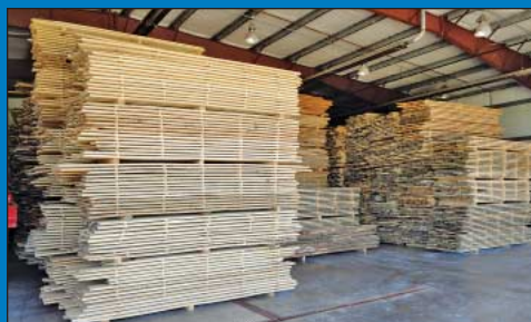
Large Offering of Premium Rough Sawed Red Oak, Beech, Ash, Maple, Locust, Hickory, Pine Lumber