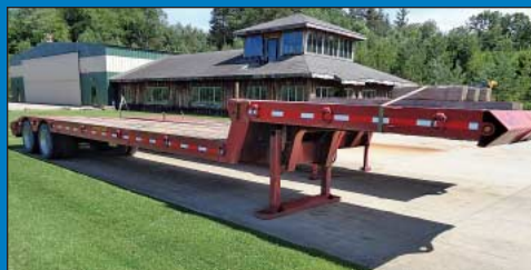
2008 Stanton Dynamics Model BTR43 Step Deck Tandem Axle Beaver Tail Trailer