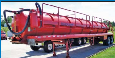
2008 Dragon Products 130 Barrel Tandem Axle Tanker Trailer

Large Offering of Premium Rough Sawed Red Oak, Beech, Ash, Maple, Locust, Hickory, Pine Lumber - This Lumber is Stickered Stacked in a Dry Controlled Building. This Lumber Covers Approx. 2,400 Square Feet of Floor Space at 14' High. It Has Been Estimated That There is Approx. 10,500 Pieces of Red Oak, Beech, Ash, Maple, Locust, Hickory, Pine Approx. 50% Being Red Oak Lumber with an Average Dimension of 10' Long X 8' Wide X 1" Thick.