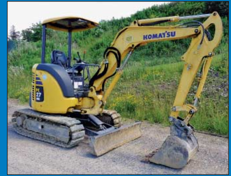
Komatsu Model PC27MR-3 Rubber Track Excavator