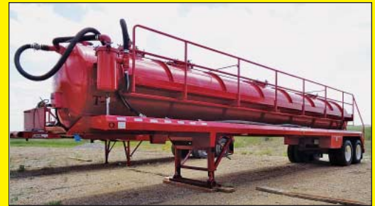
2007 Dragon 130 BBL/5960 Gallon Tanker Tandem Axle Trailer