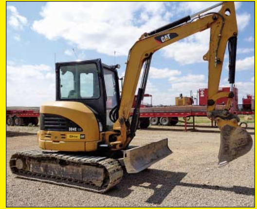
Caterpillar Model 304C/CR Rubber Track Excavator