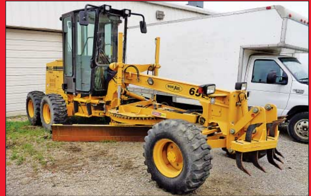
Nor-Am Weiler Model 65E Road Grader