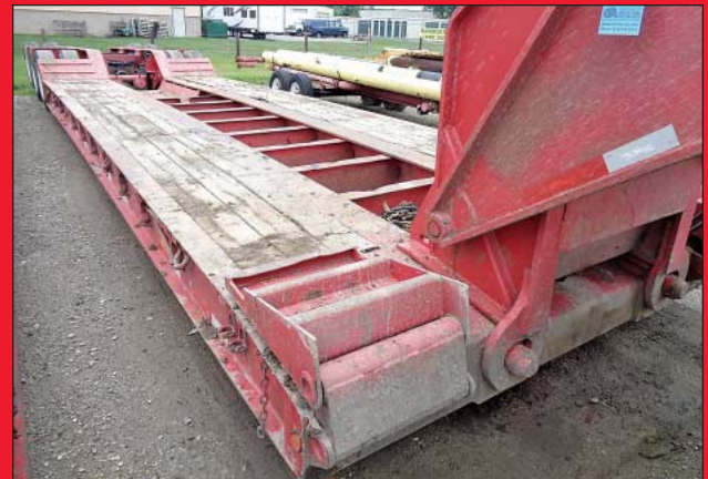
2008 - 50 Ton Talbert Tri-Axle Detachable Gooseneck Lowboy Trailer **Subject to Withdraw**