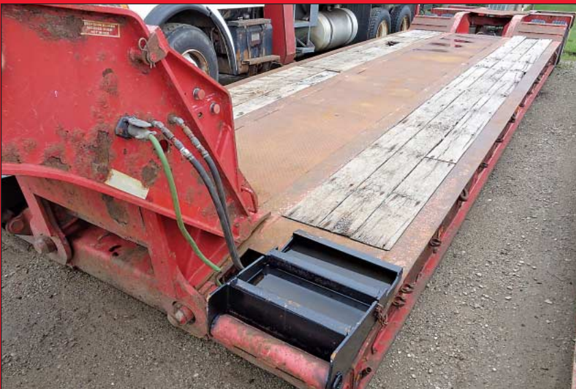
2003 - 35 Ton Talbert Tandem-Axle Detachable Gooseneck Lowboy Trailer **Subject to Withdraw**

Auction to be conducted at Tidioute, PA location. Items located at Painesville, Ohio & Winifred, Montana will be sold via photo at the Tidioute, Pennsylvania location.