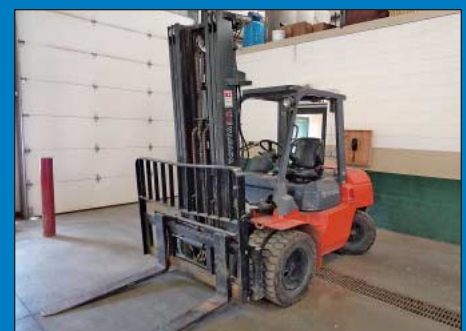
7,000 Lb. Toyota Model 7FDU35 Diesel Fuel Pneumatic Tire Lift Truck