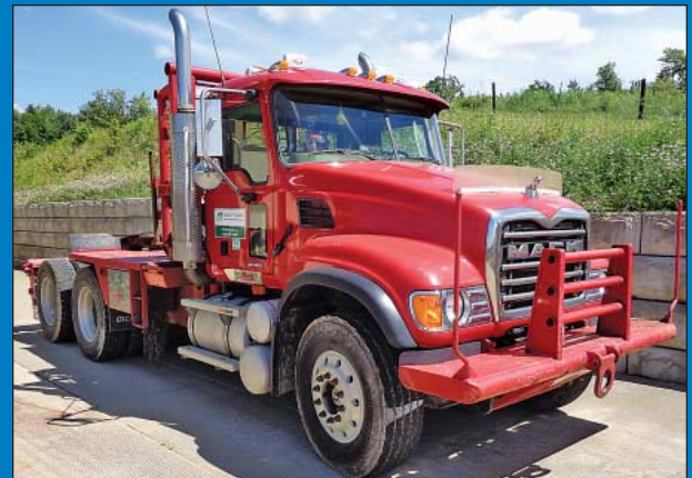
2006 Mack Winch / Vacuum Tandem Axle Oilfield Road Tractor

(2) Case Model 445-CT Incline Rubber Track Skid Steer; S/N N7M458832 (460 Hours), S/N N7M458819 (794 Hours), 81" Wide Bucket SEE PHOTO