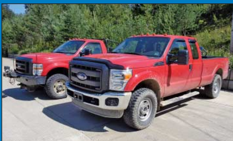
(4) Ford 4-Wheel Drive Pick-Up Trucks