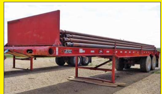
2007 Stanton Dynamics Model FF34 Tandem Axle Trailer