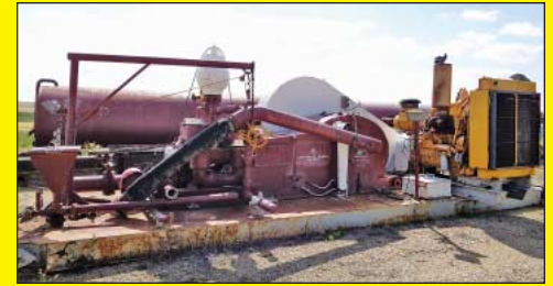
8" Continental Easco Model D-375 Skid Mounted Mud Pump

Montana Location: 138 Rose Creek Rd., Winifred, MT