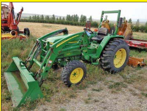
John Deere Model 4005 4-Wheel Drive Tractor