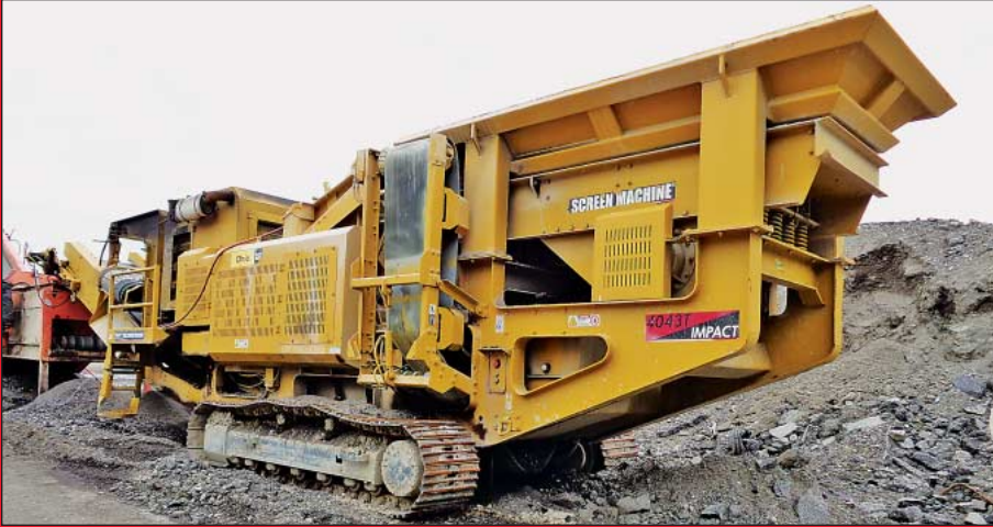
2007 Screen Machine Track Mounted Model 4043T Impact Crusher