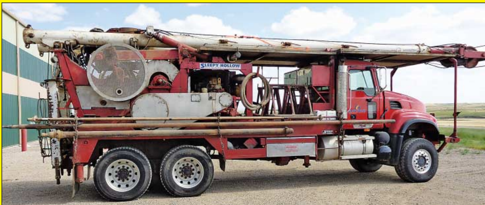
Dickerson Model SR60 Truck Mounted Service Rig on 2006 Mack Granite Model CV713 4-Wheel Drive Truck

2005 Mack "Granite" Oilfield Winch/Vacuum Truck; VIN# 1M2AG10Y76M040715, Dickerson Model MS30 Roller Tail Winch Body; S/N 4502, Maxitorque T318R/L21 Eighteen Speed Transmission, 460 HP Mack Model 5MKKH11.9V71 Engine; S/N 5L0255, (Rear Transmission Seal Leak), 84,651 Miles, 5670 HRS SEE PHOTO