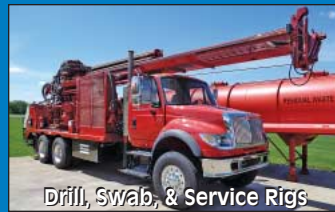
Drill, Swab, & Service Rigs

Contact Information 2020 Dunlap St. Cincinnati, Ohio 45214 Phone 513-241-9701 Fax 513-241-6760 www.cia-auction.com