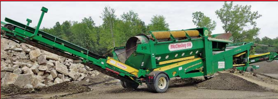
McCloskey Model 516RE Portable Trommel Screener