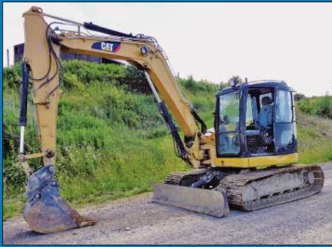
Caterpillar Model 308D-CR Excavator