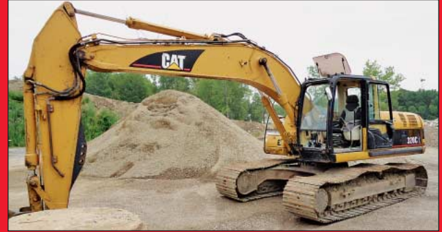
2007 Caterpillar Model 320CL Excavator