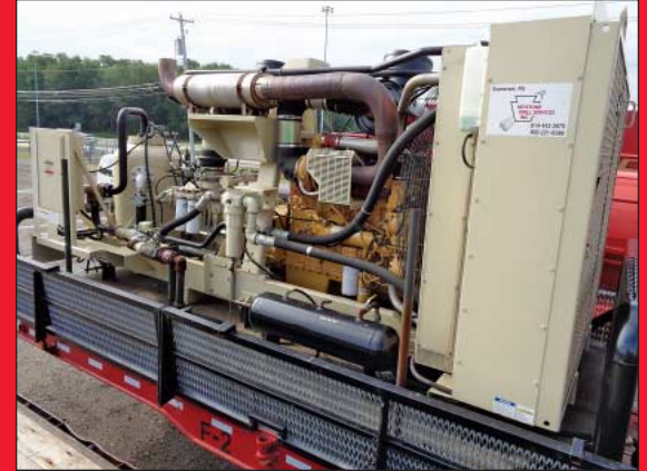
540 HP Ingersoll Rand Model XHP1170 Skip Type Air Compressor