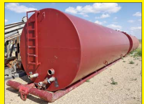
(2) 5,000 Gallon Skid Mounted Tanks