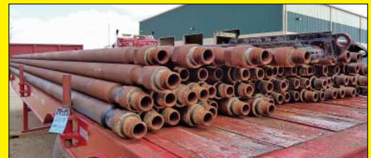
(150) Joints of 4" Diameter X 30' Long Thick Wall Drill Stem Pipe, (MT 8 and MT 10)