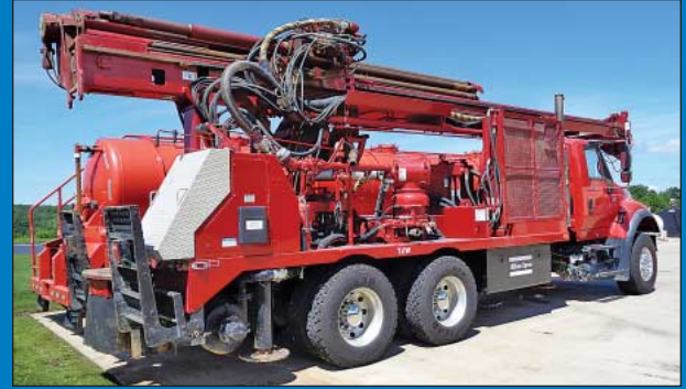
Alternate View of 2006 Atlas Copco Drill Rig

Pennsylvania Location: 225 Swede Road, Tidioute, PA 16531