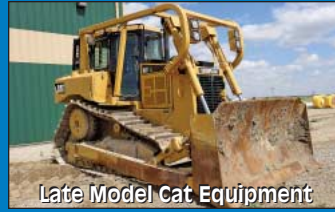
Late Model Cat Equipment