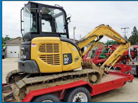
Komatsu Model PC50MR-2 Rubber Track Excavator