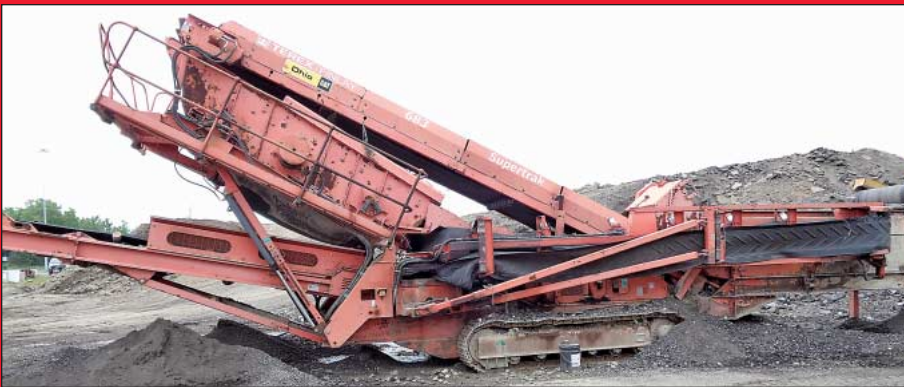
2008 Terex Finley Model 683 "Supertrak" Tracked Screening Plant