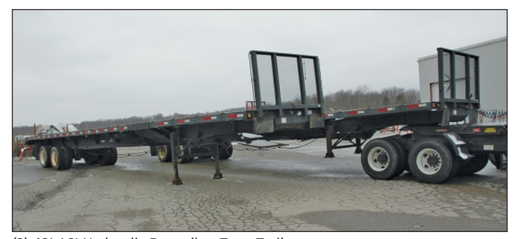
(2) 48' ASI Hydraulic Extending Truss Trailers