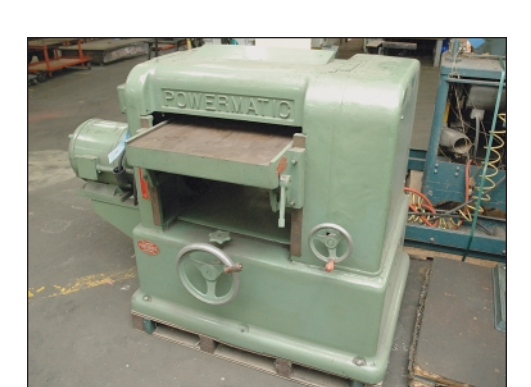
20" Powermatic Model 221 Wood Planer