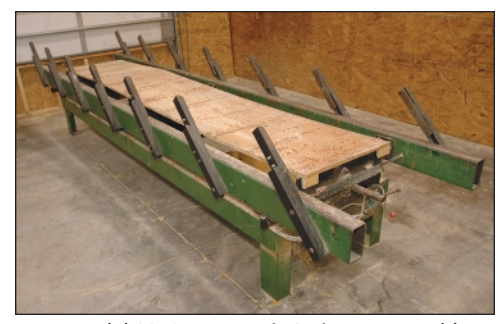
Ruvo Model 2210 Pneumatic Staircase Assembly Clamp