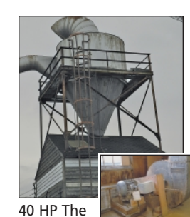
Kirk & Blum Manufacturing Dust Collector