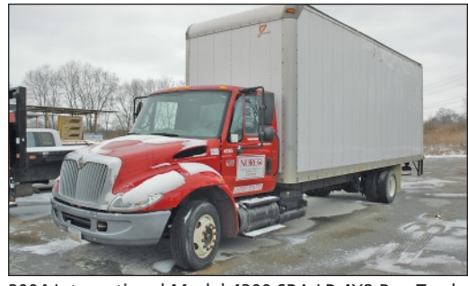
2004 International Model 4300 SBA LP-4X2 Box Truck