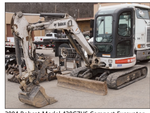
2004 Bobcat Model 430GZHS Compact Excavator