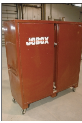
Partial View Various Style Job Boxes

25 HP Quincy Model QR5120EST Two-Stage Horizontal Tank Rotary Screw Air Compressor; SEE PHOTO S/N 5055860