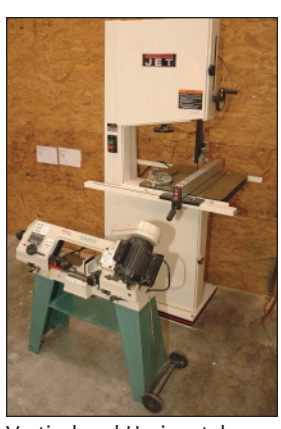
Vertical and Horizontal Band Saws

(5) 3' X 14' Autoset Pneumatic Power Setting Tables