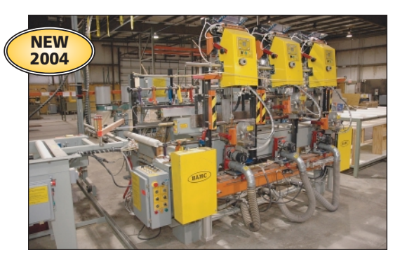
BAMC Builders Automation Machinery Co. Model 625/1550 REM Automatic Pre-Hung Door Machine