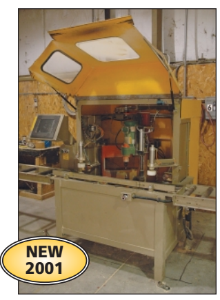
Merrick Triad Model SSR Smart Stair CNC Stair Router