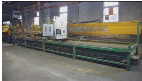
(2) Mitek Model 7000000/4000 CNC Truss Saws