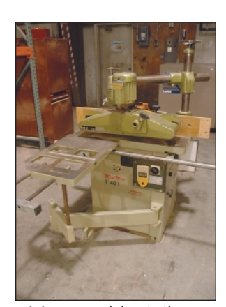
Mini Max Model T40I Shaper