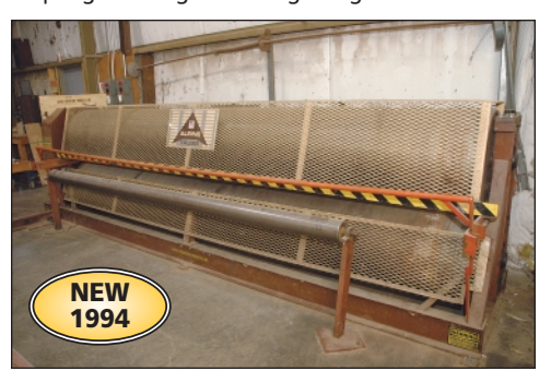
184" Wide Alpine Engineered Products Model 724 Roller Press