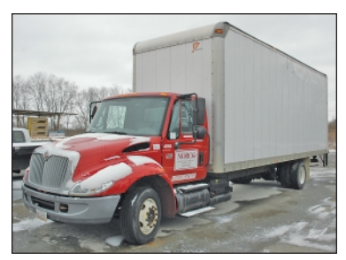
2004 International Model 4300 SBA LP-4X2 Box Truck