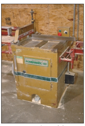
14" Powermatic Model MMM Upacting Cut-Off Saw