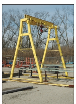
1/4 Ton X 11' Wide Mfg. Unknown A-Frame Gantry Crane