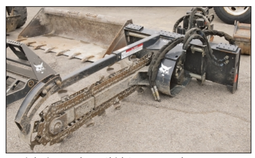
Partial View Bobcat Skid Steer Attachments