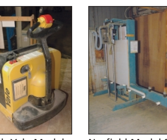
4,000 Lb Yale Model Norfield Model 3600 MPB040-ENZ4T2748 Vertical Door Cut Off Electric Walk Behind Machine Pallet Truck

8" Standard Model 24BA Double End Bench Grinder; S/N G14630