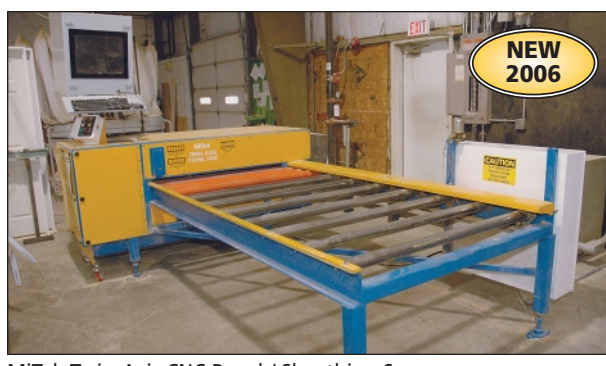
MiTek Twin-Axis CNC Panel / Sheathing Saw