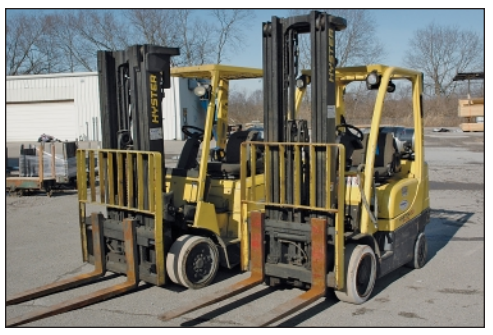
Bank View Late Model Hyster LP Gas Lift Trucks