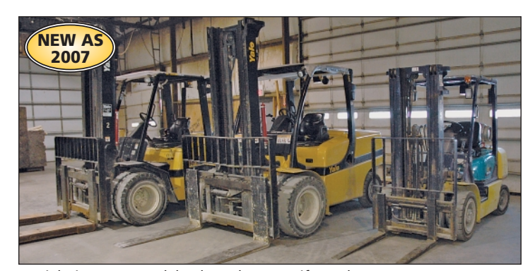
Partial View Late Model Yale and Hyster Lift Trucks