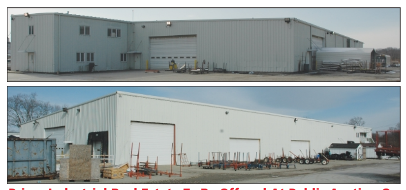
Prime Industrial Real Estate To Be Offered At Public Auction On Wednesday, March 10th at 11:00 AM

Monday, March 8th from 10:00 AM to 4:00 PM at Both Locations & Tuesday, March 9th at Day Two Location