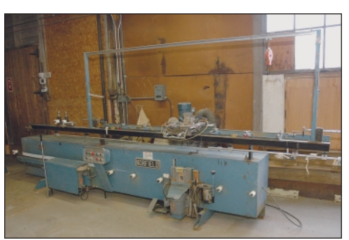
Norfield Model Pro Door Edging & Routing