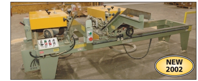
Ruvo Triad Model 855 Fully Automatic Hopper Feed Casing, Mitre & Kerf Saw