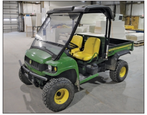
John Deere Model HPX 4 X 4 Gator