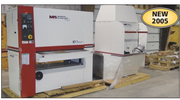
52" Midwest Sandrite Model P15275M Belt Sander