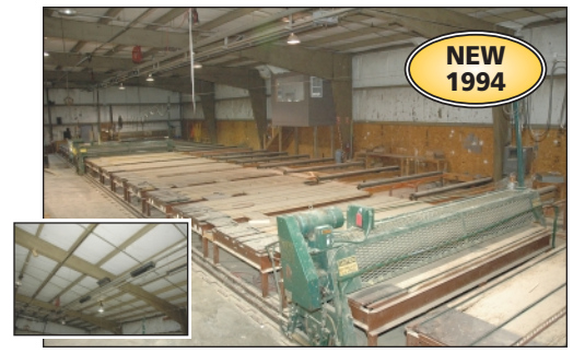
(2) 184" Wide Alpine Engineered Products Model Roll Master Roller Presses