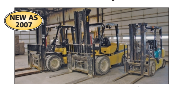
Partial View Late Model Yale and Hyster Lift Trucks