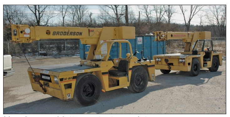
(2) Broderson Model IC801B LP Gas Carry Deck Cranes