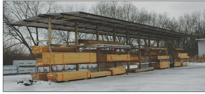
(2) 100' Long X 24' Wide X 17' High Modular T-Sheds