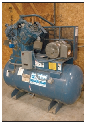
25 HP Quincy Model QR5120EST Two-Stage Horizontal Tank Rotary Screw Air Compressor