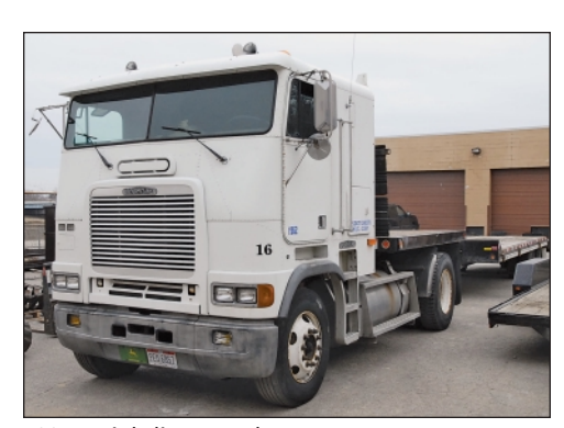
1995 Freightliner Road Tractor