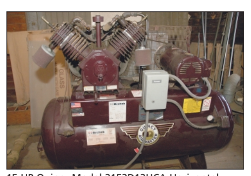
15 HP Quincy Model 2153D12HCA Horizontal Tank Two-Stage Air Compressor