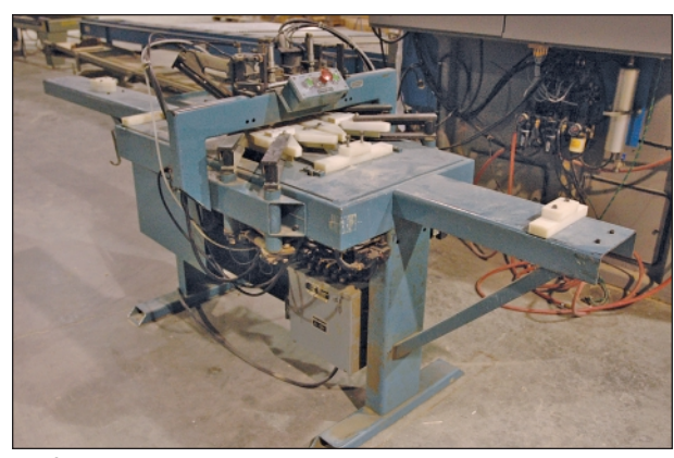
Norfield Model 450 Jamb Stitching System