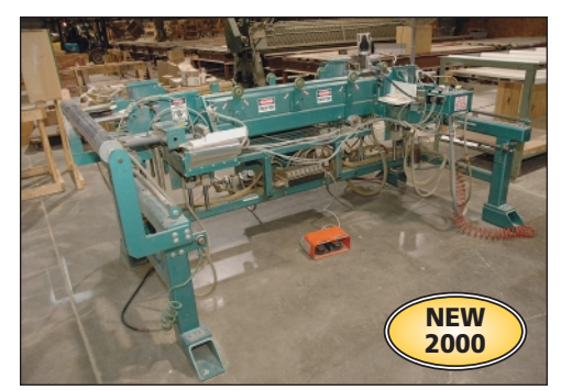
KVAL Model 700-C Door Assembly Machine