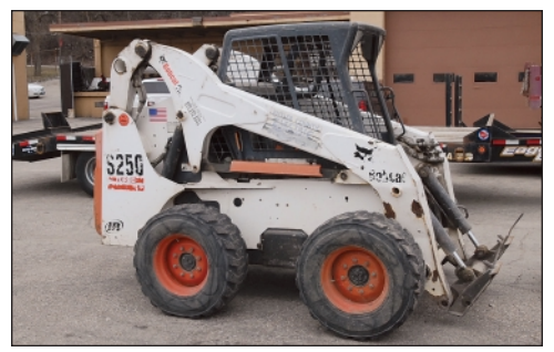
2002 Bobcat 5250 Turbo Skid Steer