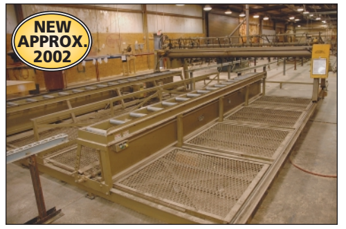
Triad Ruvo Model G25R Wall / Floor Panel Stapling / Nailing Sheathing Bridge