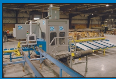
(2) Alpine Linear Saws To 2007

PRE-SORT FIRST CLASS U.S. POSTAGE PAID CINCINNATI, OHIO PERMIT NO. 3593