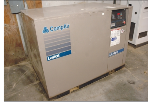
40 HP LeRoi Model Compair CL40SS Cabinet Type Rotary Screw Air Compressor