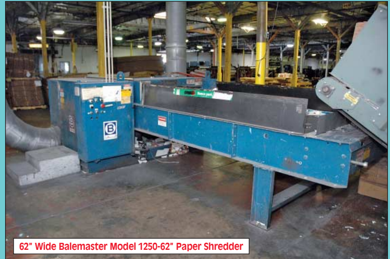
62" Wide Balemaster Model 1250-62" Paper Shredder