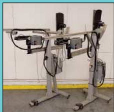
(2) Engineered Automation of Maine Model FG-24 Mini-ST Tabber