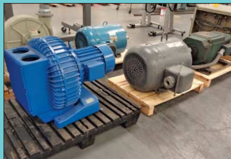
Partial View Press Parts Including; (20) Various Size Vacuum Pumps, Control Cabinets, Wire, and More

Jay Squire, (317)782-0517 jay@jasgraphics.net