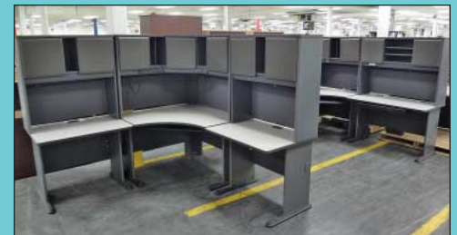
Large Quantity of Office Furniture Including; Modern Modular Office Furniture, File Cabinets, Bookcases and Related