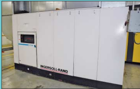
250 HP Ingersoll-Rand Model SSR-EP250 Cabinet Enclosed Rotary Screw Air Compressor