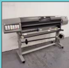
48" HP Designjet 5500 Large Print Copier