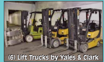
(6) Lift Trucks by Yales & Clark