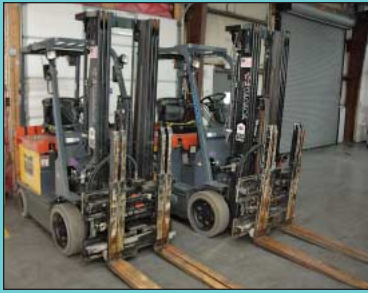
(2) 3,500 Lb. Toyota Model 7FBCU25 Solid Tire Electric Lift Truck