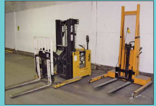
3,000 LB Yale MRW030 Electric Stacker & 2,000 LB Lift-Rite Electric Die Lift