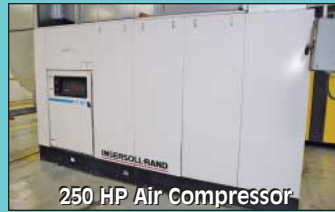
250 HP Air Compressor