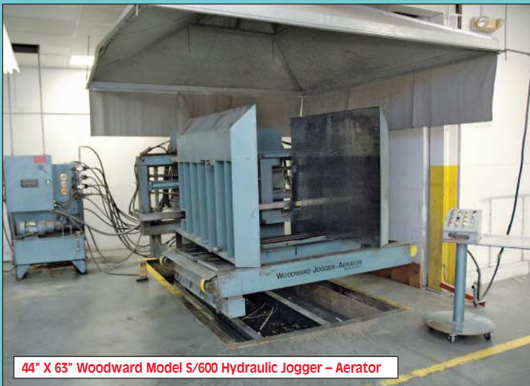
44" X 63" Woodward Model S/600 Hydraulic Jogger – Aerator