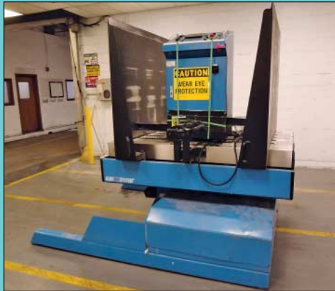
42" X 63" Albo Paper System Model Pile Turner PT1500AP Paper Jogger