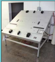
70" X 54" Nela Tarnes Model Electronic Pneumatic Plate Punch