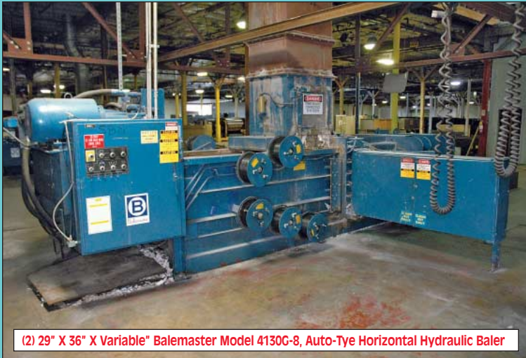
(2) 29" X 36" X Variable" Balemaster Model 4130C-8, Auto-Tye Horizontal Hydraulic Baler

INSPECTION: MONDAY, FEBRUARY 17TH, FROM 10:00 AM TO 4:00 PM