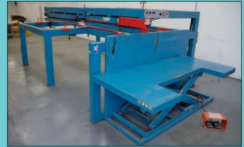
84" Wide Haire Model GL III-240 CNC Box Gluer

19" Challenge Model Diamond Paper Cutter; S/N 1730, Size 193, Backgage, Pedal Control