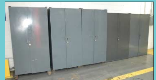
(10) Strong Hold and H.D. Steels Parts Cabinets