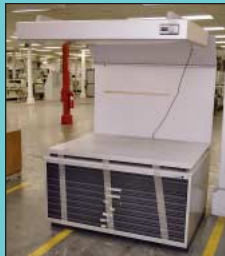
48" X 63" Just Normlight Proofing Light Table