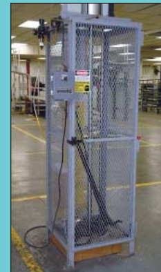
13" Diameter X 70" High Krestrel Corematic Pneumatic Core Splitter