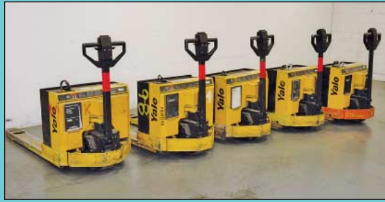
(9) Electric Walk-Behind Pallet Trucks by Yale & Clark Up to 6,000 LB