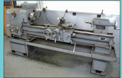
15" X 54" Cincinnati Tray-Top Geared Head Engine Lathe

Office Furniture Consisting of; Modern Modular Office Furniture, (80) Various Size File Cabinets, (40) Lateral File Cabinets, Steel Bookcases, Steel Desks, Office Partitions, (14) Cafeteria Booths, Kitchen Cabinets