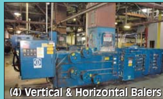
(4) Vertical & Horizontal Balers

Contact Information 2020 Dunlap St. Cincinnati, Ohio 45214 Phone 513-241-9701 Fax 513-241-6760 www.cia-auction.com