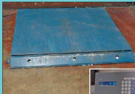
5,000 Lb. Mettler Toledo Model ES-45-5K Digital Platform Scale