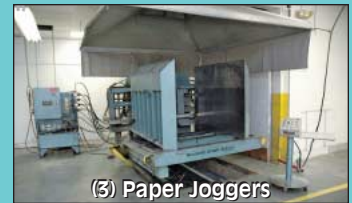
(3) Paper Jiggers