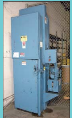
55 Gallon Accurate Ind. Barrel Compactor