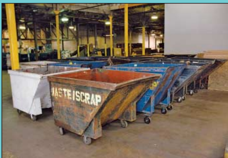
(38) 28" X 60" X 34" High Portable Steel Trash Hoppers