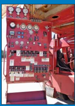
2008 Schramm Model T130XD Rota Drill Truck Mounted Drill Rig