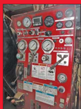
**2006 Atlas Copco Model RD20 III Tridem Top Head Drive Rotary Drilling Rig