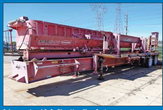
Schramm Load Safe Pipe Handling System