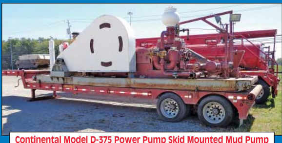
Continental Model D-375 Power Pump Skid Mounted Mud Pump