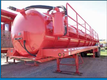
2008 / 130-Barrel Dragon Tandem Axle Water Trailer