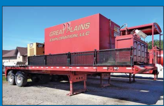
2008 Stanton Dynamics Model FF34 Tandem Axle Trailer

2,000 Gallon (Approx.) Trailer Mounted Fuel Tank with Electric Pump