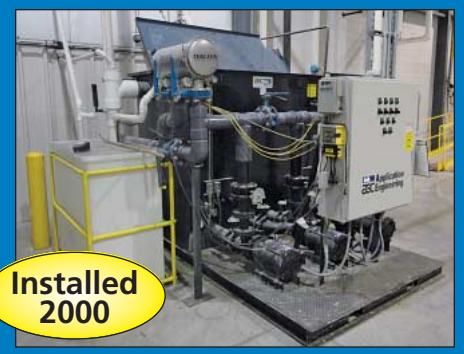
Application Engineering Company Model T1100D