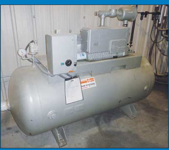
(5) 10 HP Bush Model RA0250C4461001 Horizontal Tank Mounted Vacuum Pumps