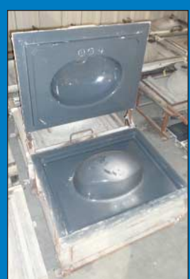
(30) Various Clamshell Type Sink Molds