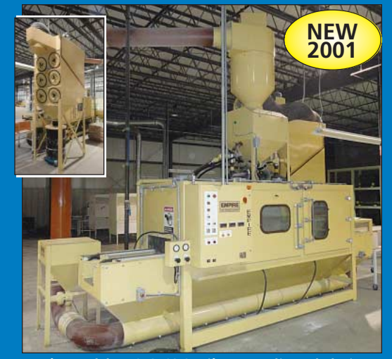
Empire Model IL-481CRS2 Continuous Belt Feed Blast Cabinet