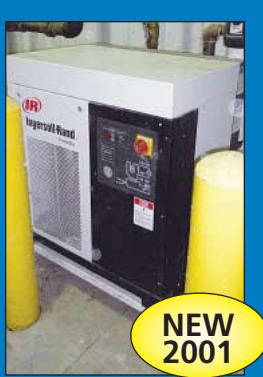
Ingersoll Rand Model TS500 Refrigerated Compressed Air Dryer