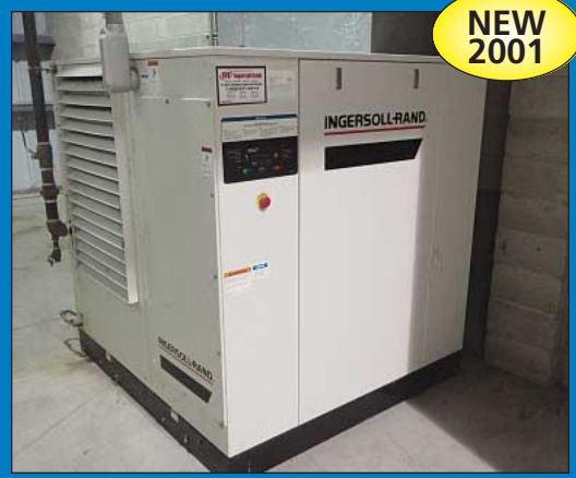
100 HP Ingersoll Rand Model SSREP-100 Rotary Screw Air Cooled Air Compressor