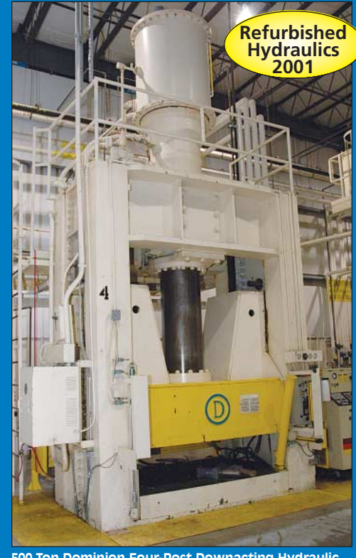
500 Ton Dominion Four-Post Downacting Hydraulic