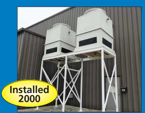
(2) AEC Model FG-2003 Fiberglass Cooling