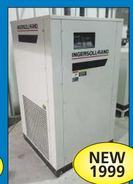
Ingersoll Rand Model DXR425 Refrigerated Compressed Air Dryer