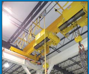
10 Ton & 15 Ton X 25' Span X 30' Long P&H Top Running Free-Standing Overhead Bridge Crane System