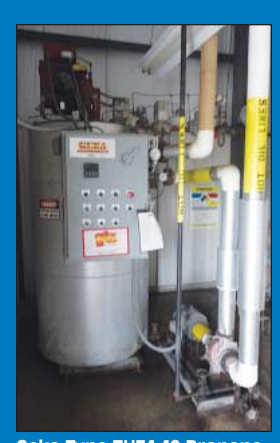
Geka Type THZ4.40 Propane Gas Fired Hot Oil Heater