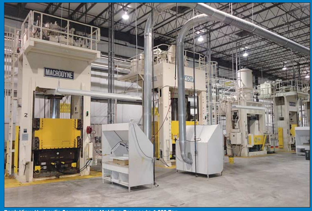
Bank View Hydraulic Compression Molding Presses to 1,000 Ton