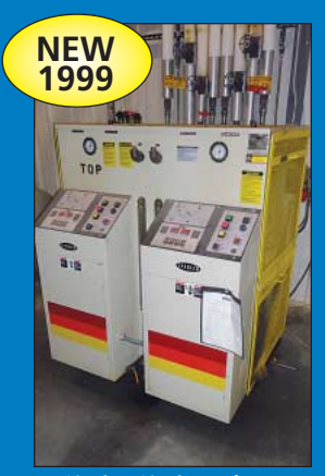
(5) Sterico Steri-Tronic Model M2B9026-J1 Dual Oil Temperature Control Units

HOT OIL HEATER Geka Type THZ4.40 Propane Gas Fired Hot Oil Heater; Job. No. 3D03, Natural or Propane Gas Fired, 1,500,000 BTU Burner Capacity, 1,000 Gallon Expansion Tank, 150 PSIG Max, 572 Degree Max Temperature, 84 GPM Flow, 70 Gallon Capacity, 2 HP & 10 HP Circulation Pumps SEE PHOTO & 10 HP Circulation Pumps