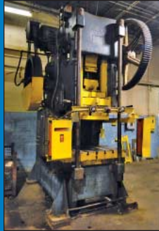
190 Ton Verson OBI Press