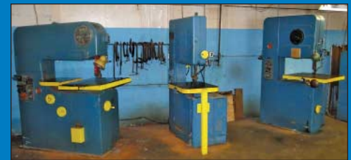
(3) Vertical Band Saws To 36" Throat