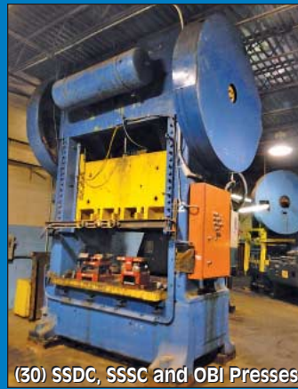
(30) SSDC, SSSC and OBI Presses

Contact Information 2020 Dunlap St. Cincinnati, Ohio 45214 Phone 513-241-9701 Fax 513-241-6760 www.cia-auction.com