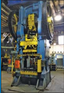
1,080 Ton Hamilton Model 4819 SSSC Press