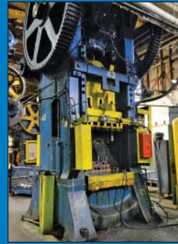
500 Ton Cleveland Model 21-5 SSSC Press