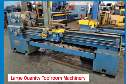
Large Quantity Toolroom Machinery