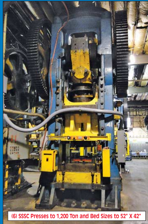
(6) SSSC Presses to 1,200 Ton and Bed Sizes to 52" X 42"