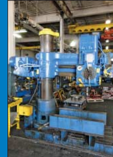
4' Arm X 15" Col. Carlton Radial Arm Drill

Carolina Model HV-20 Horizontal Band Saw; S/N 3872, Without Saw Blade