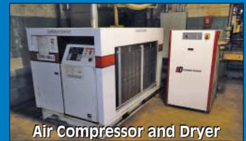
Air Compressor and Dryer