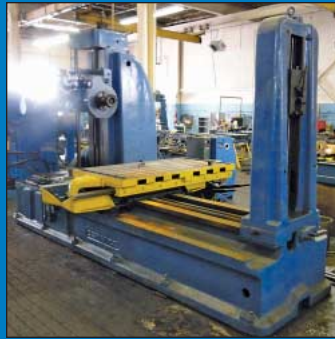
Defiance Model 25CMILL Horizontal Boring Mill