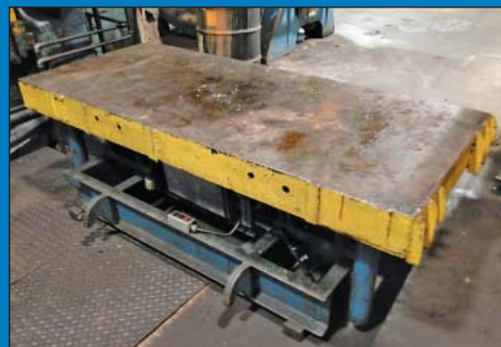
(2) Hamilton Style H.D. Motorized Die Flippers