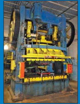
300 Ton Bliss Model 7-1/2-96 SSSC Press