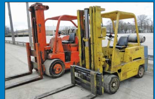
(4) Lift Trucks to 20,000 Lb. Capacity

HUGE SCRAP OPPORTUNITY A large amount of these presses will be sold for scrap at the auction