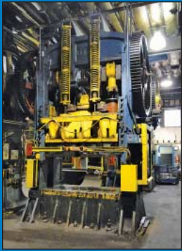
300 Ton Bliss Model 8C SSSC Press