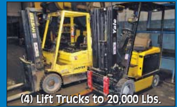
(4) Lift Trucks to 20,000 Lbs.