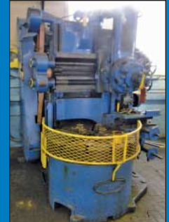
42" Bullard Vertical Turret Lathe