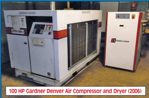
100 HP Gardner Denver Air Compressor and Dryer (2006)