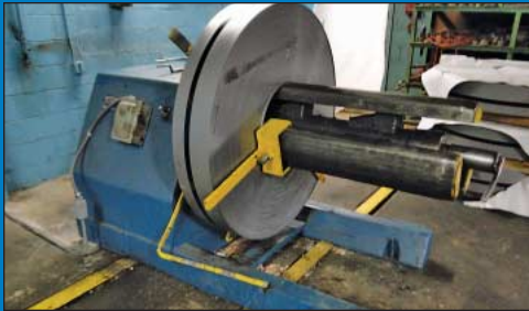
(3) American Steel Line Motorized Uncoilers To 10,000 LB