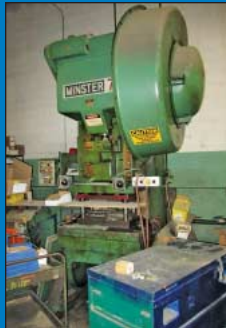
70 Ton Minster #7 Flywheel Press