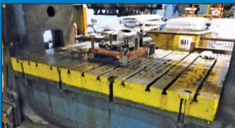
Bolster Plates To Be Sold Separate In Sizes To 60" X 96"