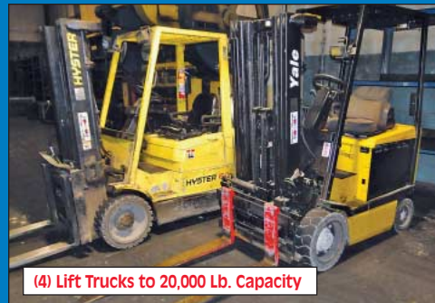
(4) Lift Trucks to 20,000 Lb. Capacity