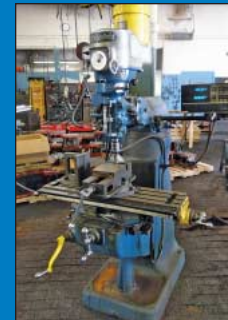
1-1/2 HP Bridgeport Vertical Mill