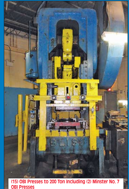
(15) OBI Presses to 200 Ton Including (2) Minster No. 7 OBI Presses