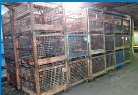
(100) 42" X 52" X 30" Deep Stackable Wire Baskets w/ Flip Down Door