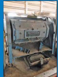
40" Dia. X 68" White Roth Model Burr Master Rotary Type De-Burring Machine