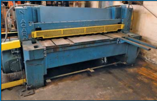
1/4" X 72" Niagara Model 76B Mechanical Squaring Shear