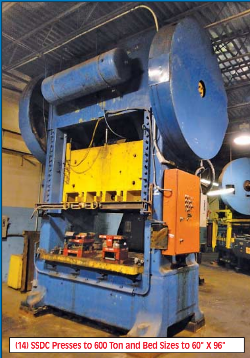
(14) SSDC Presses to 600 Ton and Bed Sizes to 60" X 96"

INSPECTION: WEDNESDAY, JUNE 4TH, FROM 10:00 AM TO 4:00 PM