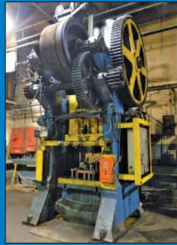
500 Ton Cleveland Model 21-S SSSC Press