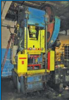
(15) OBI Presses to 200 Ton Including (2) Minster No. 7 OBI Presses