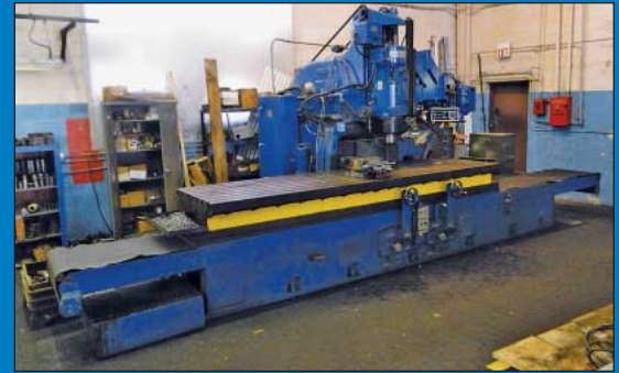
Cincinnati Model Hydro-Tel Vertical Mill

3' Arm X 10" Col. Csepl Type PF20 Radial Arm Drill; S/N 65033, 45 - 2000 RPM