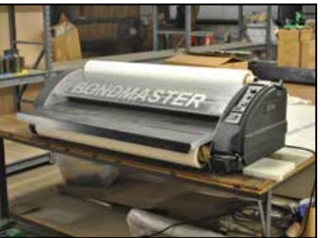
BONDMASTER GT40 40"W Top-Loading Hot Laminator