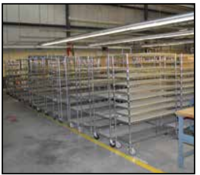
(85±) 20" x 48" x 66"H Wire Rack Carts