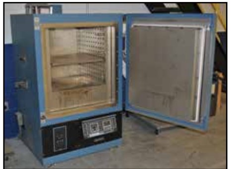
BLUE M Electric Oven