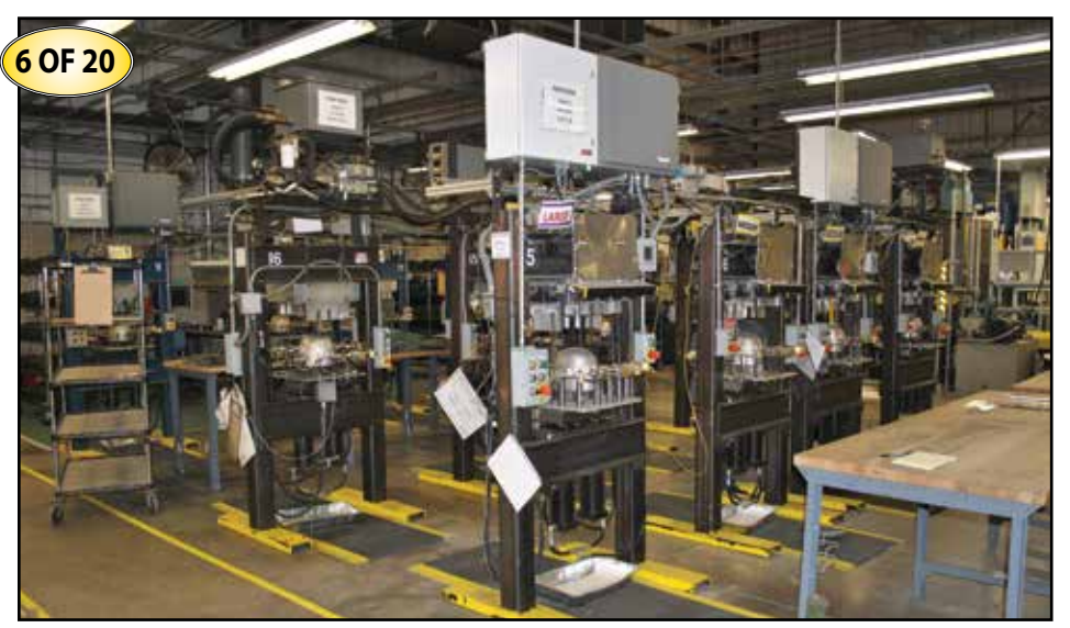
(20) Hydraulic Preform Presses

INSPECTION: DAY PRIOR TO AUCTION FROM 9AM - 4PM