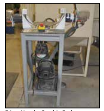
Edge Abrader Double End Buffer Wheels