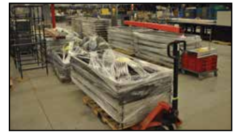
(2) Disassembled Air Flow Table Cutting Units