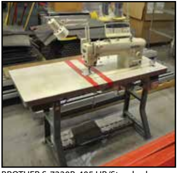
BROTHER S-7220B-405 HB/Standard Single Needle Sewing Machine