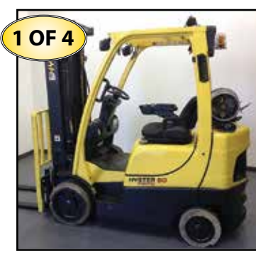
(4) HYSTER S50FT 5000-lb. Forklifts, New as 2010