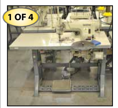
(4) BROTHER T-8722V-405 Double Needle Binders