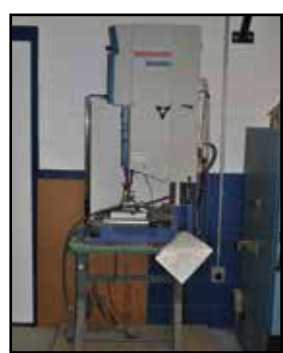
BRANSON 2000 IW Sonic Welder