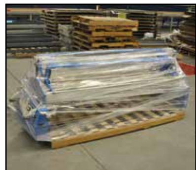
APEX 72"W Manual Spreader