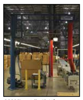
GORBEL 150-lb. Jib Lifter