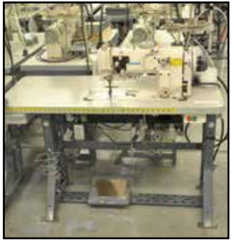
JUKI LU-221ON-7 Single Needle Sewing Machine