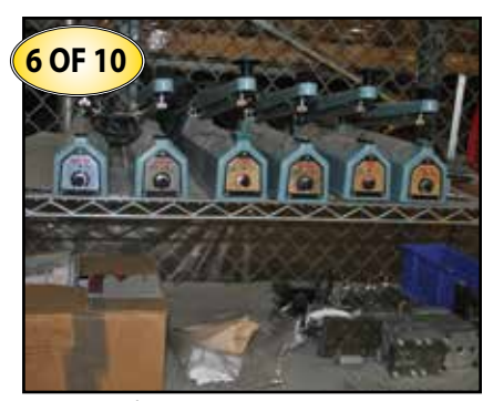
(10) Bag Sealers