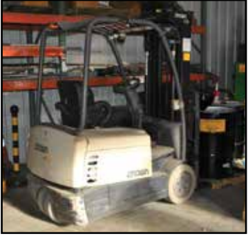
CROWN 4,500-lb. Forklift