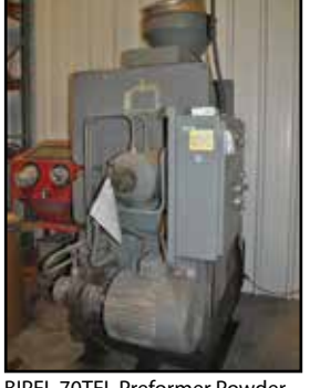
BIPEL 70TEL Preformer Powder Compaction Press