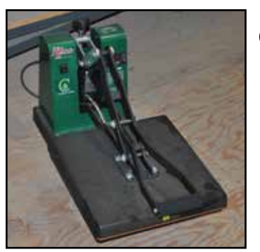
HIX HT400P Heat Transfer Press