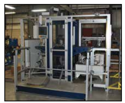
CD&F Hydraulic Automatic Preformer