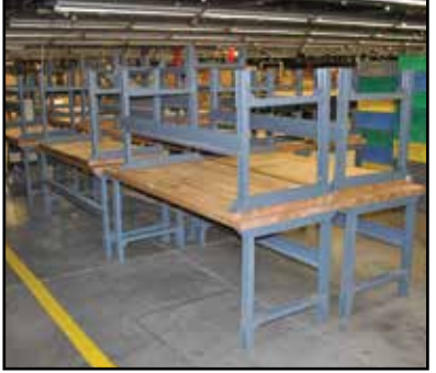
(30) Maple Top Work Tables