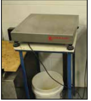
OHAUS CD-11 Digital Scale