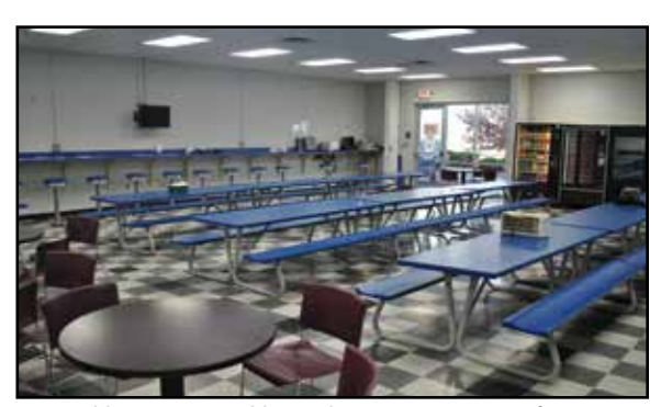
Picnic Tables • (2) Bistro Tables w/Chairs • Microwaves • Refrigerators • Chrome Stools