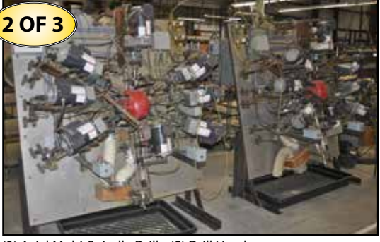
(3) Axial Multi-Spindle Drills, (5) Drill Heads