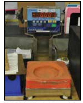
FAIRBANKS FB5050 Nexweigh Digital Scale