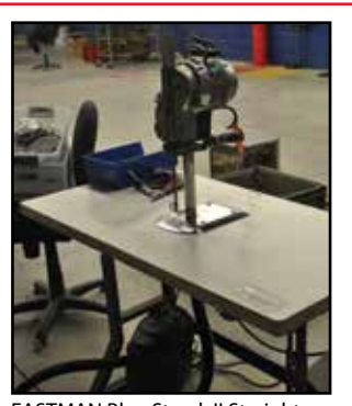
EASTMAN Blue Streak II Straight Knife Fabric Cutter