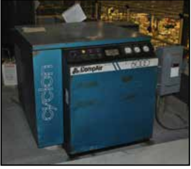
COMPAIR 6000 30-HP Rotary Screw