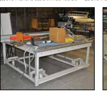
GERBER 96" x 96" Spreader Transfer Table