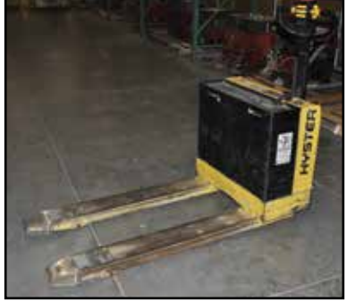
HYSTER W40XT Electric Pallet Jack