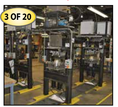
(20) Hydraulic Preform Presses