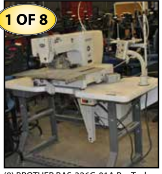
(8) BROTHER BAS-326G-01A Bar Tackers