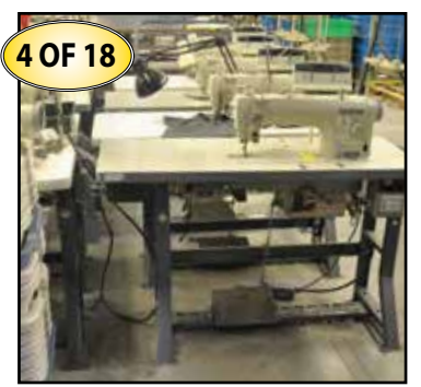
(18) BROTHER S-7220B-405 Single Needle Sewing Machines