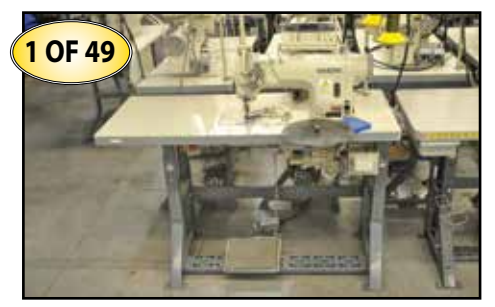
(49) BROTHER, JUKI, MITSUBISHI & SINGER Programmable Sewing Machines