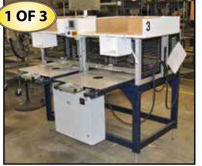
(3) 24" x 24" Single Station Heat Tackers