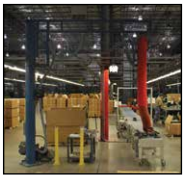
GORBEL 150-lb. Jib Lifter w/10' Arm