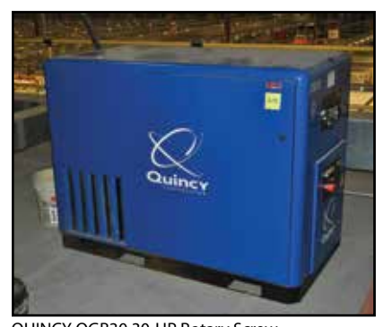
QUINCY QGB30 30-HP Rotary Screw Air Compressor