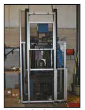
50-Ton (Est.) Hydraulic 4-Post Up-Acting Press