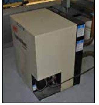
INGERSOLL RAND Thermostar Air Dryer