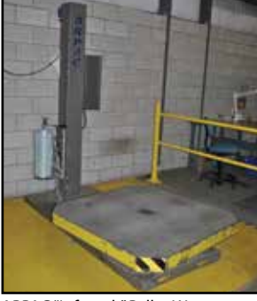
ARPAC "Infrapak" Pallet Wrapper