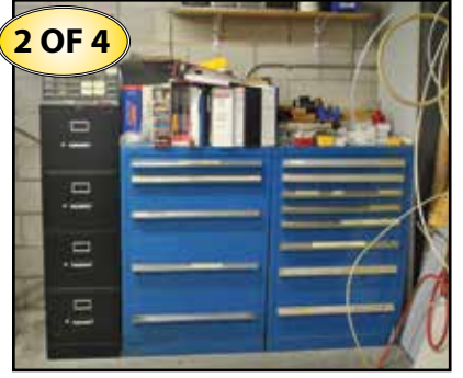
(4) STANLEY VIDMAR 6 & 12-Drawer Cabinets