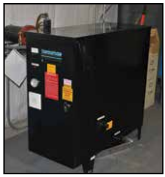
THERMA PHASE TP-6-88 Oil/Water Separator