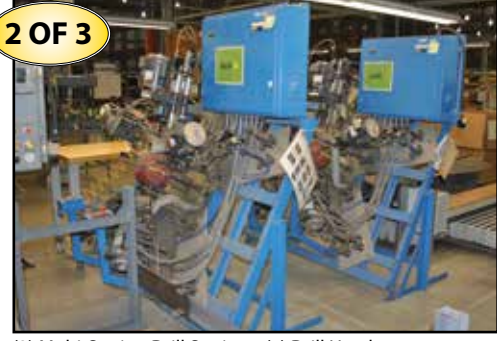
(3) Multi-Station Drill Stations, (5) Drill Heads