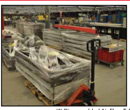
(2) Disassembled Air Flow Table Cutting Units