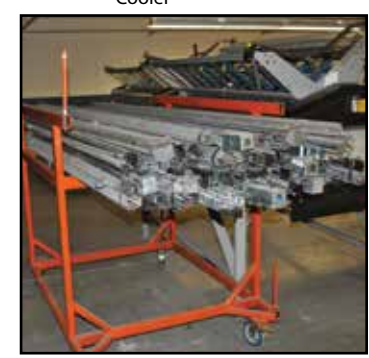
1,000'± 4-Pole Buss Bar Sections