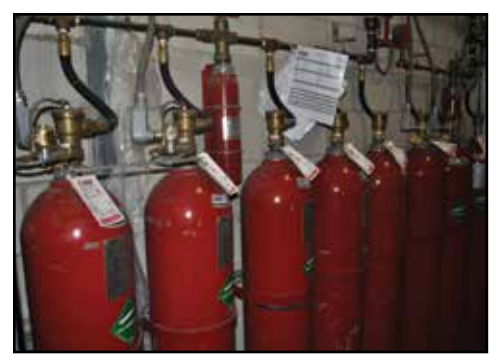
FIKE SHP-Pro CO2 Fire Suppression System