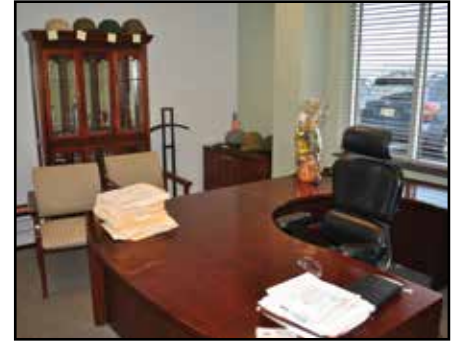
(3) Executive Offices