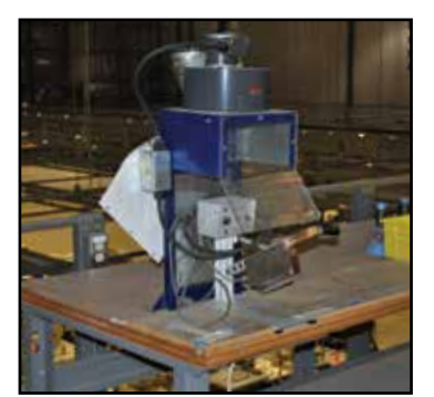
NOVA TECH RX-80 "The Webcutter" Hot Knife Cutter