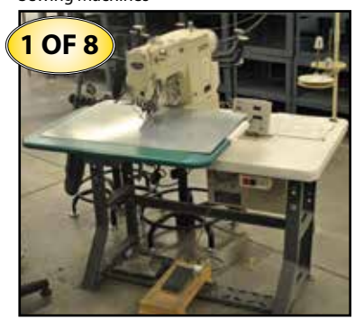
(8) BROTHER KE-430D-02 Bar Tackers