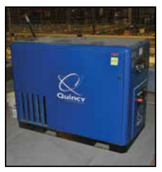
QUINCY QGB30 30-HP Rotary Screw Air Compressor