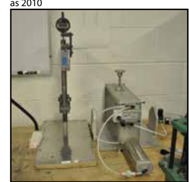
Compression Tester w/Digital Height Gage