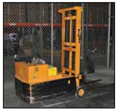
BIG JOE 2,000-lb. Lift Truck