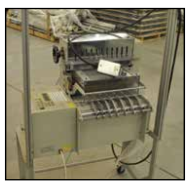
CUTEX Cold Cut Webbing Cutter