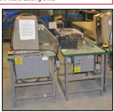
(2) Ace Hot Strip Webbing Cutters