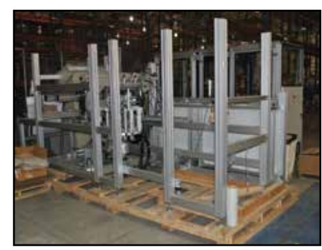
CD&F Automatic Heat Tacker Machine