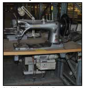
SINGER 7-31 Single Needle Sewing Machine