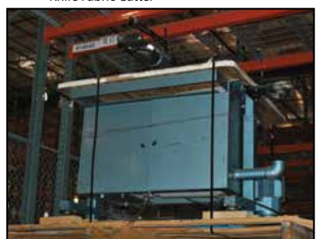
Pants Turner Vacuum Machine