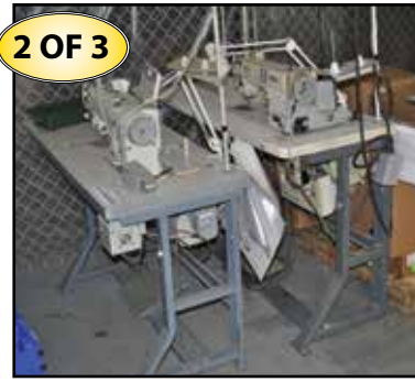
(3) BROTHER DB2-B737-413, Single Needle Sewing Machines