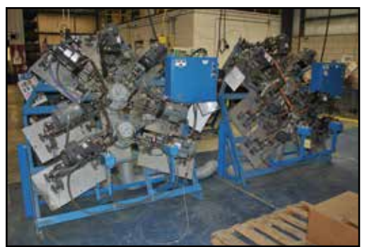
(2) Axial Multi-Spindle Drills w/(7) Drill Heads