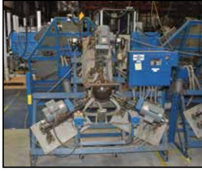
Axial Multi-Spindle Drill w/(3) Drill Heads