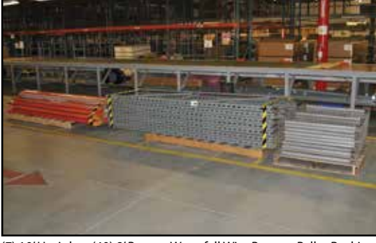
(7) 10' Uprights, (40) 8' Beams, Waterfall Wire Bottom Pallet Racking