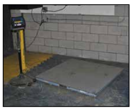
FAIRBANKS FB2250 Digital Floor Scale