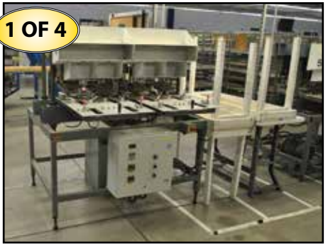
(4) 24" x 24" 2-Station Heat Tackers