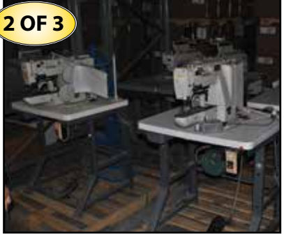
(3) BROTHER LK3-B434 Bar Tackers