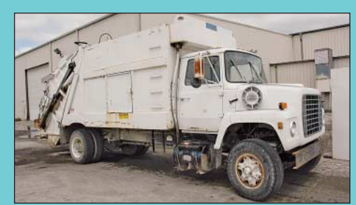
1983 Ford 800 Garbage Truck