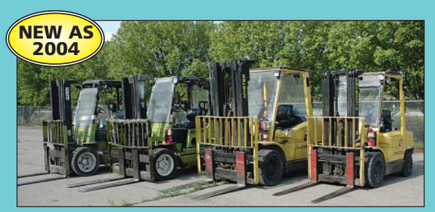
Partial View (4 of 7) Solid Pneumatic tire Lift trucks To 8,000 Lb.