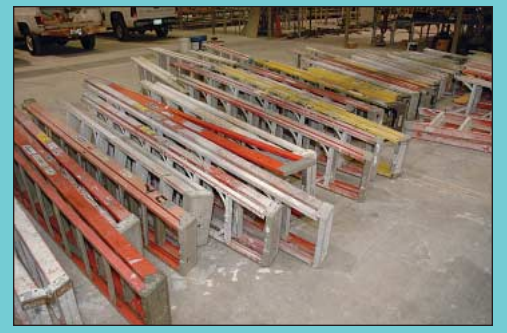
Large quantity Shop Equipment to Suppot a 120,000 Sq. Ft. Facility Including (75) Ladders