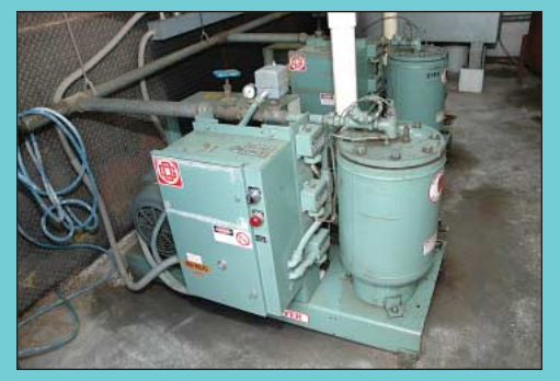
(2) 25 HP Gardner Denver Model EBEQFB Electric Saver II Skid Mount Air Compressors