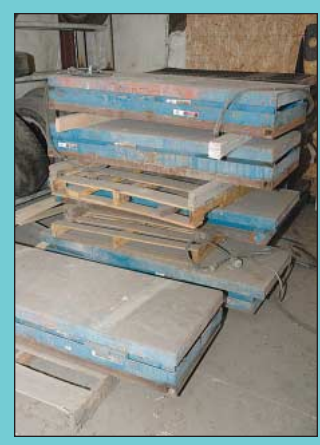
(9) 6,000 LB Advance Lift Model P-6048 Electric Scissor Lifts