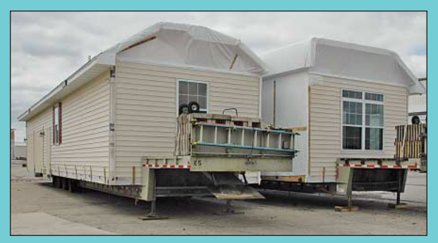
1988 & 1989 – 40'/60' Jamco Three-Axle Extending Modular Home Transporting Trailers