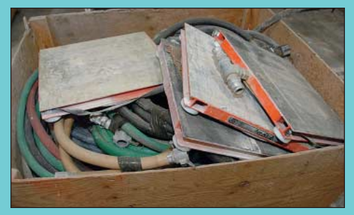
Aerogo Pneumatic Air Float Dolly System