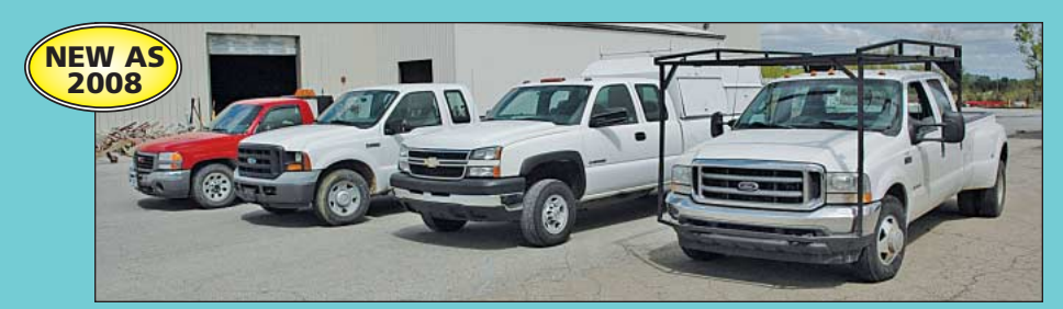
Partial View (4 of 10) Pick-Up Trucks By Chevy, Ford and GMC