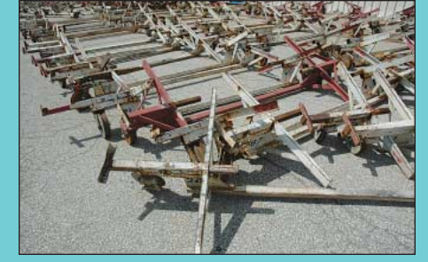
Approx. (100) 144"W Track Traveling Manual In Plant House Transfer Dollies