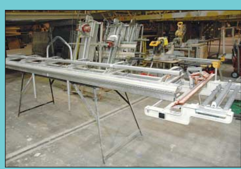
Sidewinder Gutter Brake