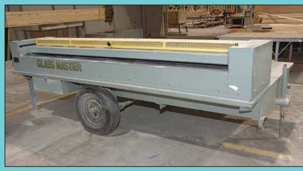
Glass Master Model 215-3BT Grooy-Master Duct Board Machine