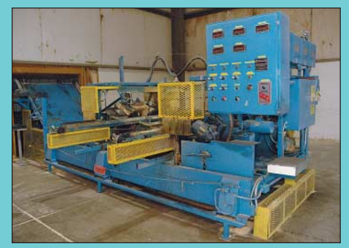
Clary Master Model 329 Four-Blade Component Saw