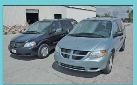
(2) 2006 Dodge Grand Caravan Min Vans