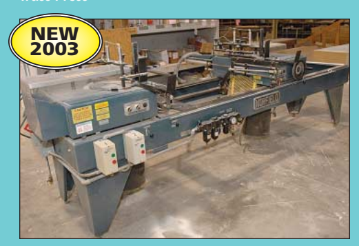
Northfield Model 1020 Double End Door Trim Saw