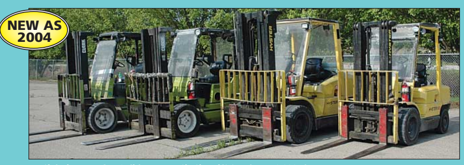
Partial View (4 of 7) Solid Pneumatic tire Lift trucks To 8,000 Lb.

2006 Ford F-250XL Super Duty Extended Cab Pick-Up Truck; Vin #1FTSX20576EB07683, Miles: 109204, 5.4 Liter 3V Triton Gasoline Engine, Automatic Transmission