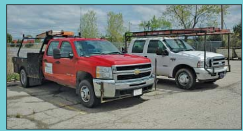
2008 Chevrolet 3500 Flat Bed and 2006 Ford F350 Dually Pick-Up

1995 Ottawa Model 30 Spotting Tractor; S/N 72063, Hours: 9632 SEE PHOTO