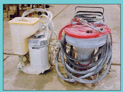
(2) Texture Spray Systems