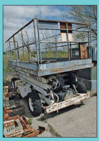
60"W X 12'L Marklift Gasoline Powered Scissor Lift