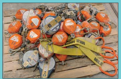
Large Quantity Tool Balancers and Safety Harnesses