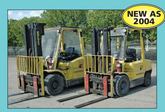
8,000 and 6,000 Lb. Hyster Solid Pneumatic Tire Lift Trucks