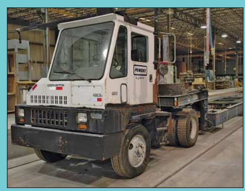
1995 Ottawa Model 30 Spotting Tractor