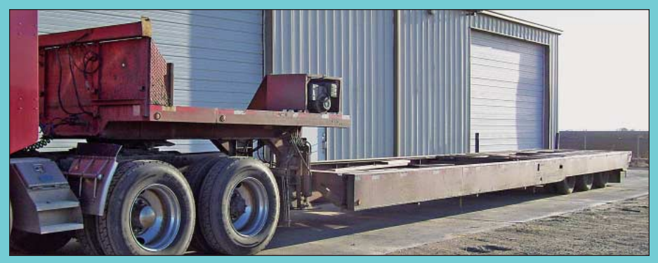
(2) 40'/60' Mfg. Unk. Three-Axle Extending Modular Home Transporting Trailer