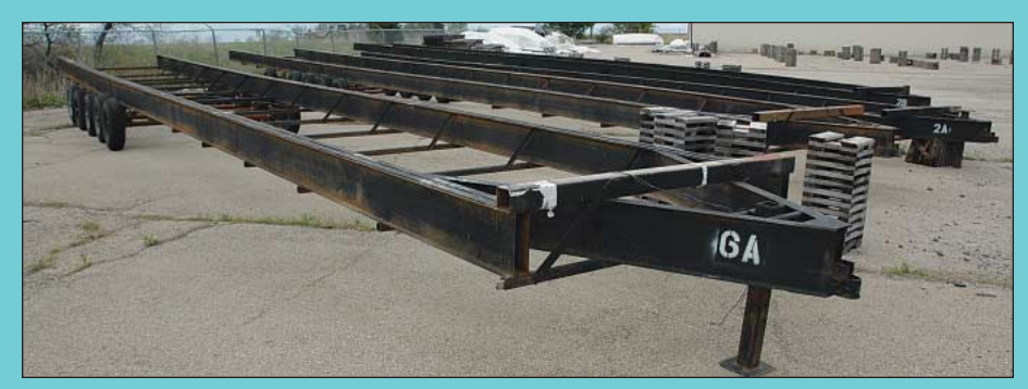
(25) Five and Seven Axle Manufactured Home Transport Trailors To 75' Lon