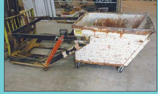
Mfg. Unknown Hydraulic Dump Hopper Dumper Forklift Attachment