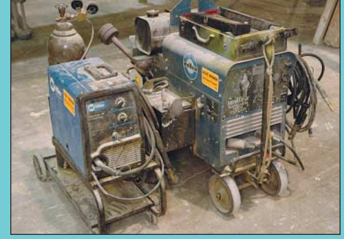
Partial View (2 of 6) Welders