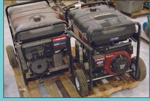
(2) 8,000 Watt Troy Bilt 15 HP Gasoline Generator Sets

Large Quantity New Drywall Consisting of; (93) 4 X 8 X 1/2", (160) 4 X 10 X 1/2", (125) 4 X 12 X 1/2", (148) 4 X 14 X 1/2", (62) 4 X 8 X 1/2" Moisture Res., (45) 4 X 10 X 1/2" Moisture Res., (45) 4 X 8 X 5/8" Moisture Res., (196) 4 X 8 X 5/8" Fire Rated, (90) 4 X 10 X 5/8", (99) 4 X 14 X 5/8", (63) 4 X 16 X 5/8" & (78) 54" X 14 X 1/2"