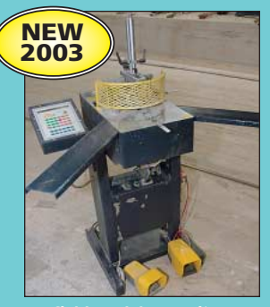
Might V Nailer