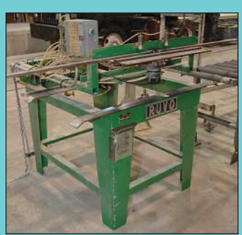
Ruvo Model 950 Latch & Strike Plate Mortising Machine

Clary Model 485 Door Clamping Machine; S\!\!\!/\!N 485773