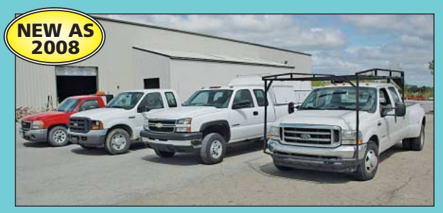
Partial View (4 of 10) Pick-Up Trucks By Chevy, Ford and GMC