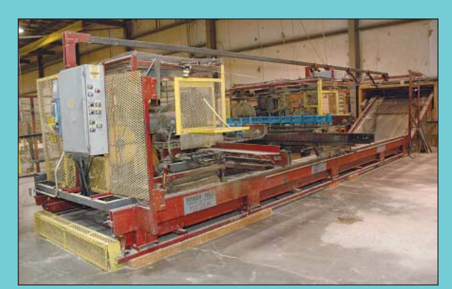
Timber Mill Model 6-20E Six-Blade Component Saw

Featuring: (7) Hydraulic Extending Low Boy and (25) Yard Type Modular Home Transport Trailers, (12) Trucks & Vans as New as 2008 Truck Maintenance Garage, (7) Lift Trucks to 8,000 Lb. Cap., Timber Mill 6-20E Six-Blade Component Saw, Alpine 47-TW Roller Press, 50 Ton Gang Nail Mark V Press, Ruvo 900 Door Machine, Glass Master 215-3BT Duct Board Machine, Norfield VN4 Nailer, Midwest Automation CS5236-16 Postforming Saw, Unisul V34-E2-A Insulation Blowing Machine, Building Supply Inventory, Structure Lifting Equipment, Paint Booths, Mezzanines, Saws, Welders, Air Compressors, Contractors Hand Tools, Huge Quantity Shop, Office and Support Equipment