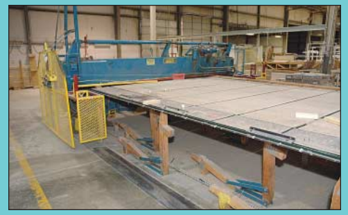
50 Ton Gang Nail Model Mark V Automatic Moving Truss Press