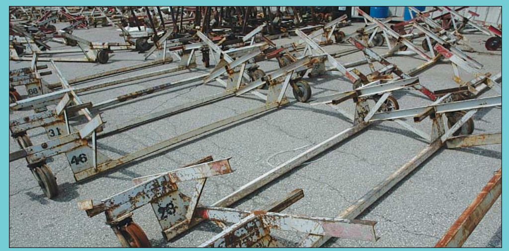
Approx. (100) 144"W Track Traveling Manual In Plant House Transfer Dollies

21'W X 16'D X 8'H Mfg. Unknown Bolt Together Rear Exhaust Galvanized Steel Paint Booth; S/N N/A, Dryer Mark II Model 25 Manometer, Overhead Lighting