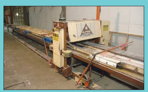
Alpine Model 47-TW Roller Press