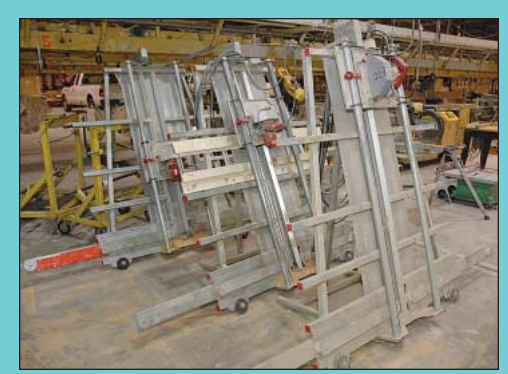
(3) 8" Milwaukee Vertical Panel Saws