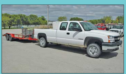
(2) 2006 Chevrolet 2500 HD Extended Cab Pick-Up