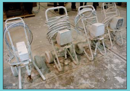
(5) Graco Airless Print Spravers