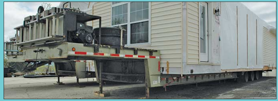
1988 & 1989 – 40'/60' Jamco Three-Axle Extending Modular Home Transporting Trailers