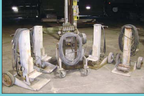
(4) 12 Ton Hydraulic House Jacks w/ 7-1/2 HP Electric Hydraulic Power Unit