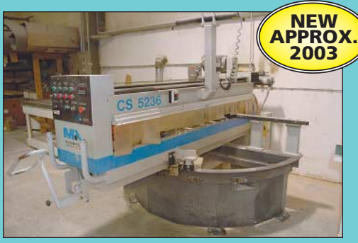
Midwest Automation Model CS5236-16 Cutting Station Postforming Saw