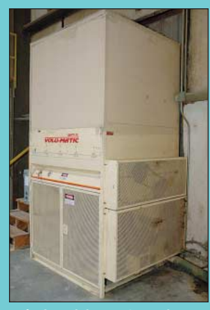
Unisul Model V34-E2-A Volu-Matic Insulation Blowing Machine