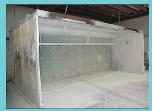
21'W X 8'D X 11'H Mfg. Unknown Bolt Together Rear Exhaust Calvanized Steel Paint Booth