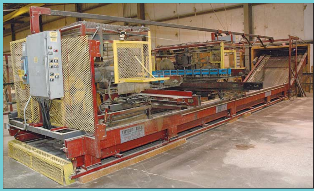
imber Mill Model 6-20E Six-Blade Component Saw