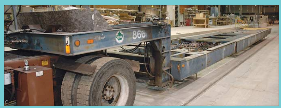
40'/60' Holland Equipment Ltd Three-Axle Extending Modular Home Transporting Trailer