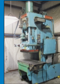
75 Ton Niagara Model E-75 OBI Press