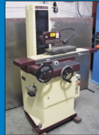
6" X 18" Chevalier Model FSG-618M Hand Feed Surface Grinder