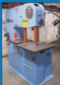
36" DoAll Model 3618-1 Vertical Metal Cutting Band Saw

Special Removal Notice: Time is of the essence with regards to the removal of the equipment from the premises. All items must be removed by December 30th at 4:00 pm. Any items remaining after this time will be considered abandoned and will be scrapped.