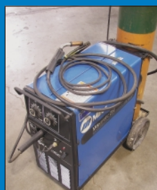
250 Amp Miller Millermatic 250 AC/DC Welder