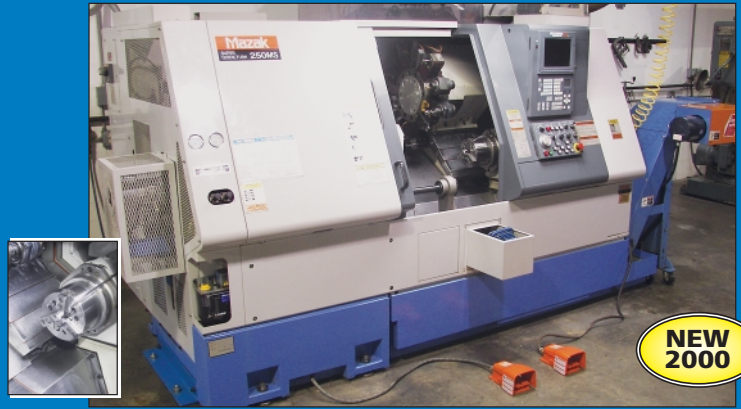
Mazak Model SQT-250MS CNC Turning / Milling Center