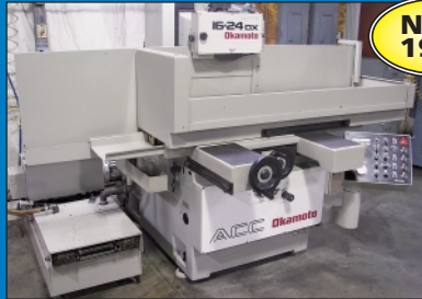
16" X 24" Okamoto Model ACC-16-24DX Automatic Hydraulic Surface Grinder