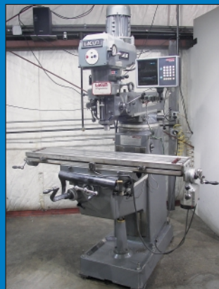
2 HP Lagun Model FTV-2 Dovetail Ram Vertical Milling Machine