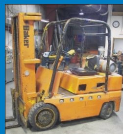
8,000 LB Baker Model 9790 Solid Tire LP Gas Lift Truck