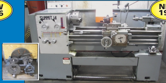
14" X 40" Summit Model 14 Gap Bed Geared Head Engine Lathe