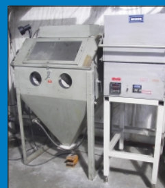
Partial View Very Clean Miscellaneous Machinery