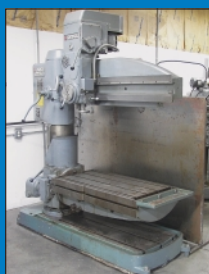
3" Arm X 11" Column Fostick Sensitive Radial Arm Drill