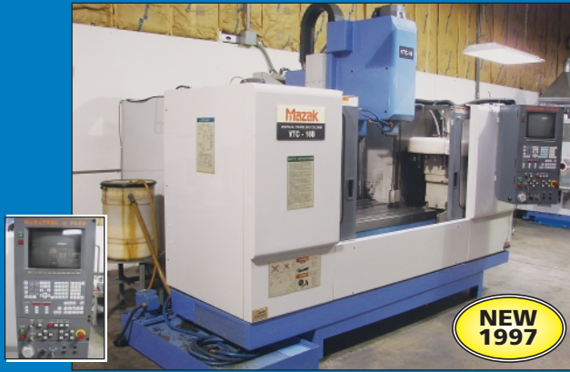
Mazak Model VTC-16B CNC Vertical Machining Center