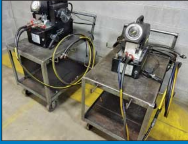
(2) Torcup Model 7750008 and EP4000 Hydraulic Torque Wrenches