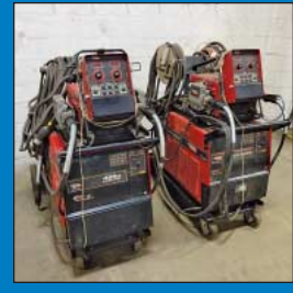
(2) 450 Amp Lincoln Powerwave 455M Welders