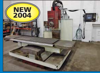
Fryer Model HR-60 Three-Axis CNC Bed Type Horizontal Milling Machine

(5) Self Dumping Hoppers (100+) Pipe Stands (40) Rigid Tristands (25+) Step Ladders - 3' to 12' (10+) HD Electric Grinders, Hand Tools, C-Clamps, Magnetic Levels, Metal Plate Stock Racks, (10+) Shop Pedestal Fans, (20+) Sections Pallet Racking with Contents