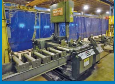
18" x 20" Marvel Model 81A Tilt Frame Automatic Vertical Band Saw