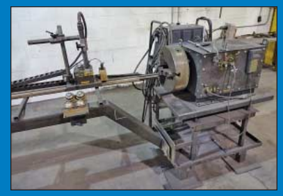
Bug-O Model SEC-1590-E Saddle and Elbow Plasma Pipe Beveling Machine