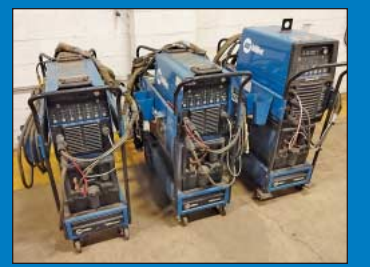
(3) 300 Amp Miller Tigrunner Dynasty 300 Tig Welders