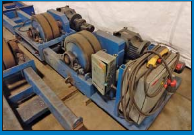
60 Ton IRCO Model 60TON Motorized Tank Turning Roll Set w/ Idler