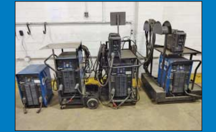
(4) 450 Amp Miller Pipe Pro 450RFC Welders w/ Model Pipe Pro 12RC Suitcase Wire Feeds