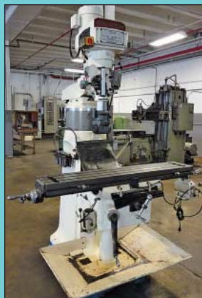
3 HP Ganesh Model GMV-2 Vertical Milling Machine

3 HP Ganesh Model GMV-2 Vertical Milling Machine; S/N 1516, 9" X 49" T-Slotted Table, R8 Spindle, Power Table, Spindle Speeds to 4,200 RPM, Sargon Model 663 DRO