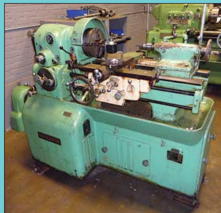
10" X 20" Monarch Model 10EE Geared Head Engine Lathe