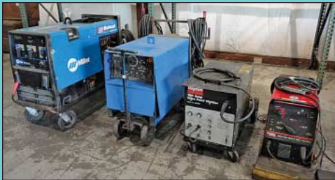
Partial View Various Style Welders of All Types