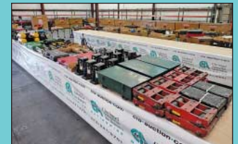
Large Quantity Rigging Tools Including Hoists, Lifting Eyes, Skates and Related