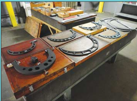
Partial View Large Quantity Inspection Tools Including Large Capacity O.D. Mics