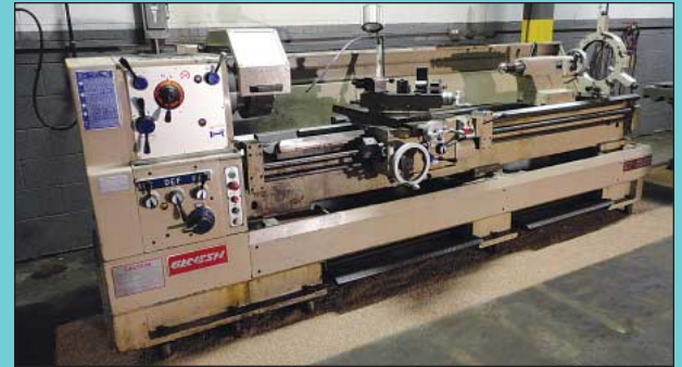
22" X 100" Ganesh Model GT-22100 Geared Head Engine Lathe

Machine Accessories Consisting of; (53) No. 50 Toolholders, (15) No. 40 Toolholders, (13) 6" Kurt Mill Vises, 6" Wilton Swivel Base Mill Vise, 8" Vertex 3-Jaw Super Spacer, 12" Kamakura Rotary Table, Large Quantity R-8 Collets, Hold Downs, Adjustable Boring Heads, Huot Drill Indexes, Keyless Chucks, Right Angle Mill Attachment, 5-C Collets, Angle Plates & Many Other Related Items