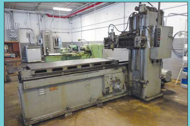
28" X 72" X 24"H Rockford Hydraulic Open Side Planer Mill