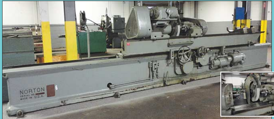
14"/26" X 144" Norton Gap Bed Plain O.D. Cylindrical Grinder

30" X 182" Ryman Plain O.D. Cylindrical Polisher Grinder; S/N N/A, 3.5" Ryman Model 517-6 Belt Sanding Head, 20" Dia. X 2" Wide Grinding Wheel, 7.5 HP Grinding Motor, 5 HP Workhead Motor, (2) Steady Rests, (5) Workrests, 3 HP Hydraulic, Unit PB Control, Coolant System, Barnes Drill Coolant Filtration System SEE PHOTO