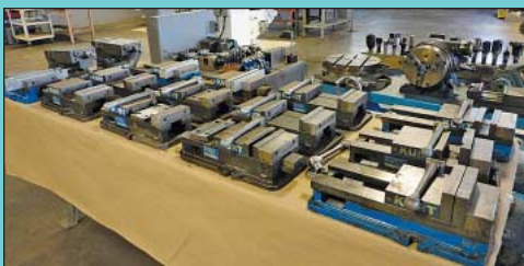
Partial View Large Quantity Machine Accessories Including (13) 6" Kurt Vises