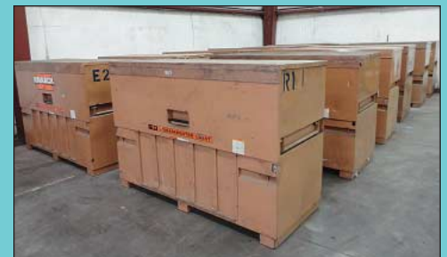
(25) +/- Job Boxes Of All Styles By Knaack and Others