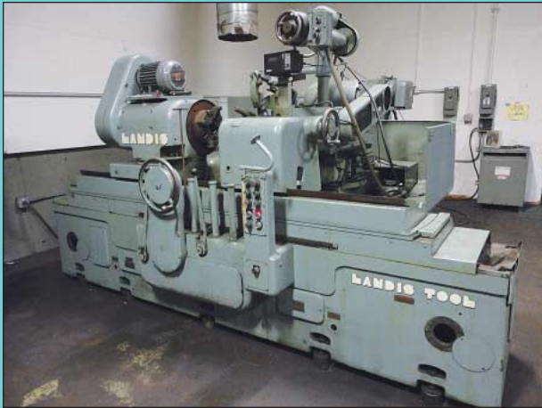
30" X 48" Landis Type CHW Universal O.D. Grinder