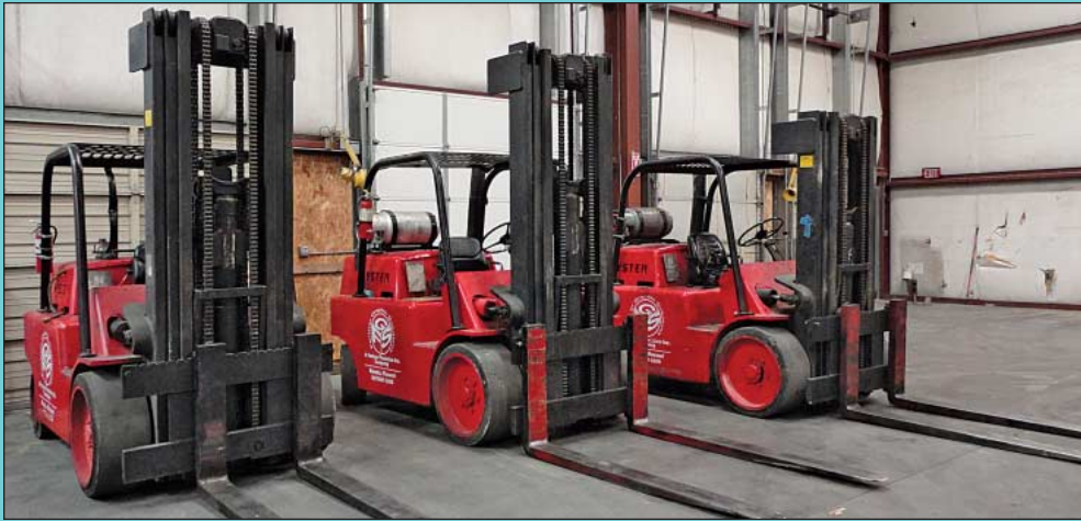
Bank View (3) 15,000 Lb. Hyster Model S150A LP Gas Lift Trucks