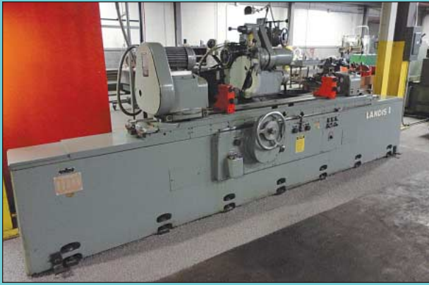
14" X 72" Landis Type 3RH Universal O.D. Cylindrical Grinder