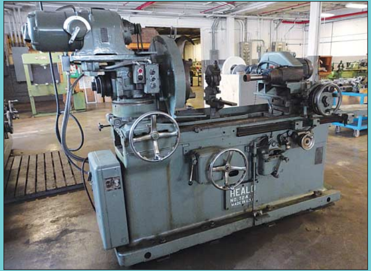
26" Heald Model 72-A I.D. Grinder