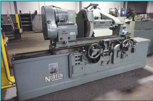
14" X 36" Norton Plain O.D. Cylindrical Grinder