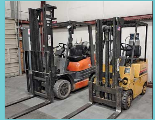
Partial View (2 of 3) Other Lift Trucks To 12,000 Lb. Capacity