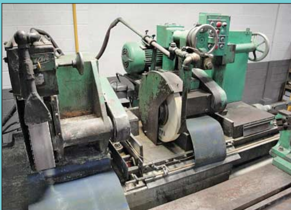
Close-Up View 30" X 182" Ryman Wheel Head