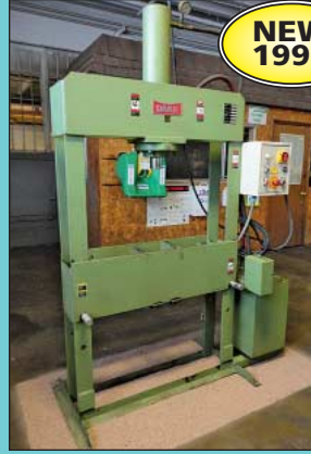
40 Ton Dake Model P55 Electric Hydraulic H-Frame Press