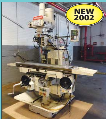
5 HP Ganesh Model Deluxe GMV-5 KR-V30005L Vertical Milling Machine