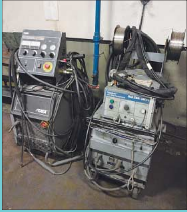
Bank View Sulzer Metco and Tafa Thermal Arc Spray Welders