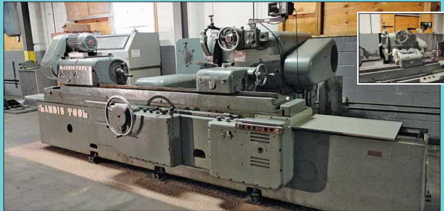
16" X 72" Landis Type F Plain O.D. Cylindrical Grinder