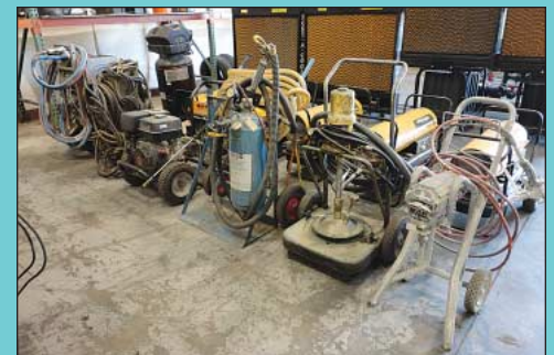
Partial View Large Quantity Contractors Tools and Equipment