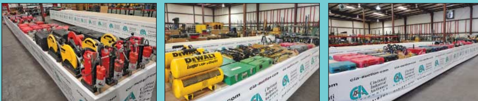
Large Quantity Power Tools Including Drills, Saws, Grinders and Related