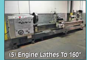
(5) Engine Lathes To 160"