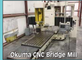
Okuma CNC Bridge Mill