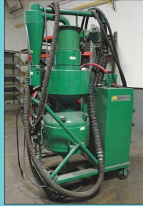
Alpheus Cleaning Technologies Econoblast CO2 Mobile Sandblaster