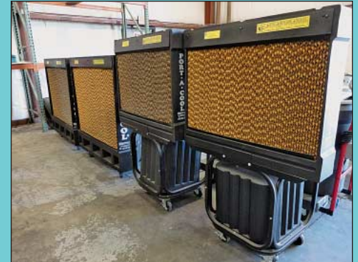
Partial View Large Quantity Shop Equipment Including Port-A-Cool Fans