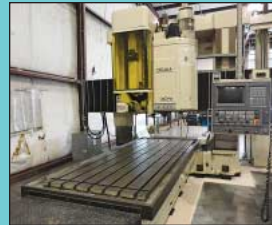
Okuma Model MCV16A Double Column CNC Bridge Mill