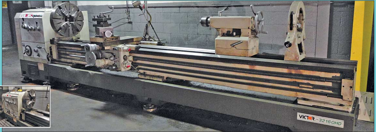
32" X 160" Victor Model 32160 HD Geared Head Engine Lathe