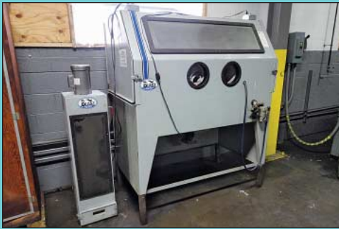
34" X 60" X 28" Deep Skat Blast Abrasive Blast Cabinet w/ Dust Collector