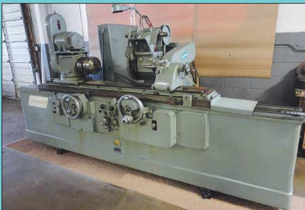
14" X 52" Norton Universal O.D. Cylindrical Grinder