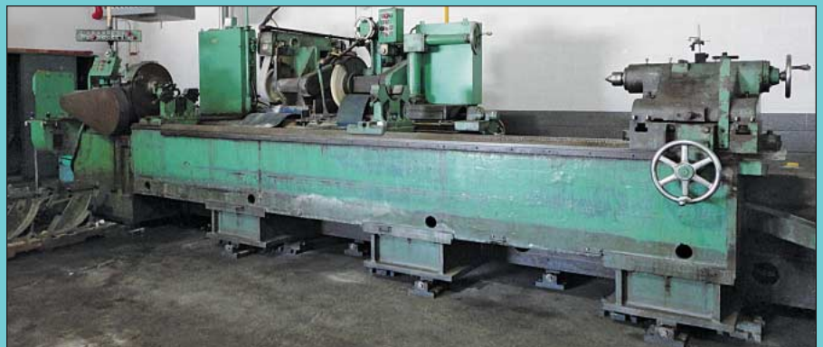
30" X 182" Ryman Plain O.D. Cylindrical Polisher Grinder