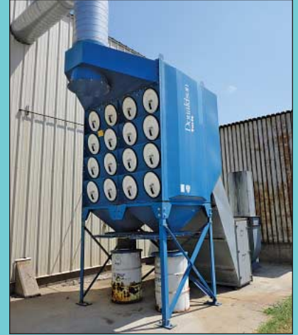
30 HP Donaldson Torit Model DF04-32 Cartridge Type Dust Collector