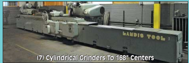
(7) Cylindrical Grinders To 168" Centers

2020 DUNLAP ST., CINCINNATI, OHIO 45214 PHONE (513) 241-9701 / FAX (513) 241-6760 INTERNET: cia-auction.com