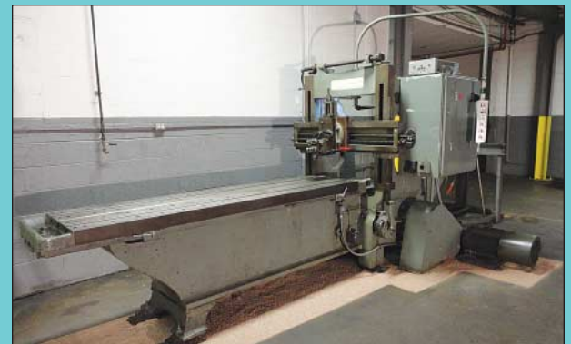
24" X 96" X 24"H G.A. Gray Co. Planer Mill