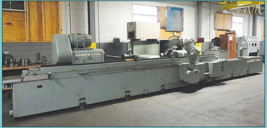
14" X 168" Landis Type F Plain O.D. Cylindrical Grinder