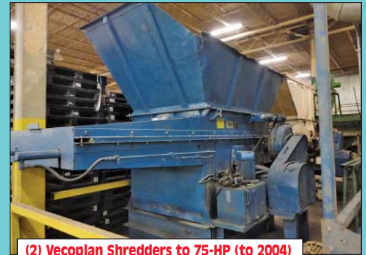
(2) Vecoplan Shredders to 75-HP (to 2004)