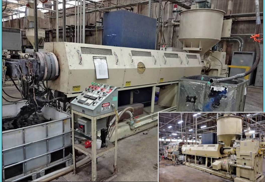
6.0" PTI Model 6.0-400 Extruder