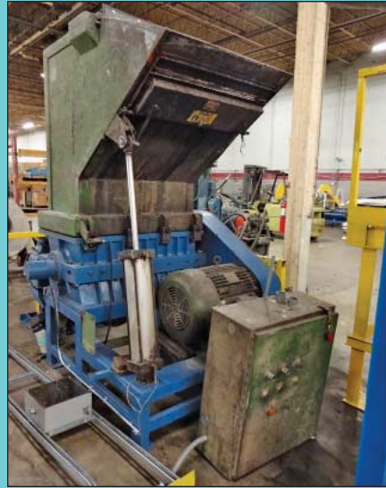
Approx. 125-HP Rapid Model 2442 Central Grinder