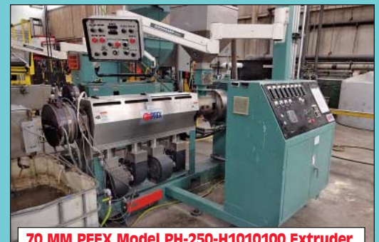
70 MM PFX Model PH-250-H1010100 Extruder

CINCINNATI INDUSTRIAL AUCTIONEERS auctioneers | appraisers | since 1961