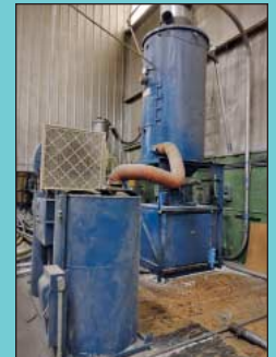
(2) Large Whitlock Central Dryers