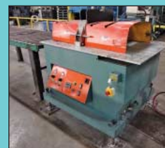
(15) Upacting Saws