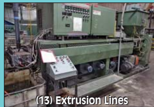
(13) Extrusion Lines

Contact Information 2020 Dunlap St. Cincinnati, Ohio 45214 Phone 513-241-9701 Fax 513-241-6760 www.cia-auction.com