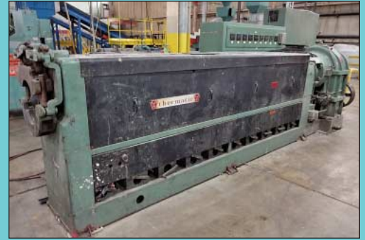
6" Davis Standard Thermatic 60T Extruder