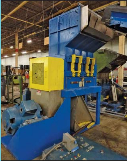
150-HP AM Industries Model 1128A200 Central Grinder