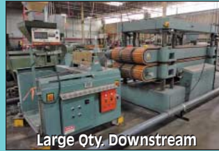
Large Qty. Downstream