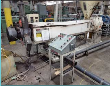
3.5" HPM Model 3.5TMC-30 Extruder