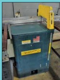
Whirlwind Automatic Upacting Saw