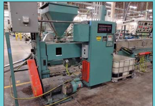
2.5" NRM Extruder