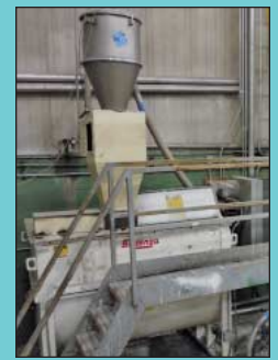
48" X 48" X 72" Sudenga Stainless Steel Ribbon Blender