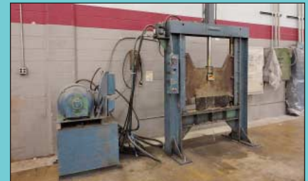
36" Wide Custom Built Guillotine with 15 HP Hydraulic Unit