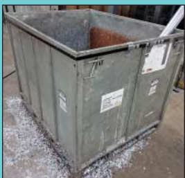
(50) 44" X 56" X 36" Deep Collapsible Side Stacking Material Bins

Maintenance Equipment and Parts Consisting of; Vertical Band Saws, Hydraulic Presses, D.E. Grinders, Drills, Tools, Motors, Breakers, Electrics, Hydraulics and Related