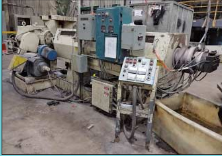
4.5" PTI Model 4.5-200 Extruder