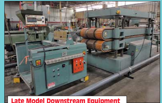
Late Model Downstream Equipment