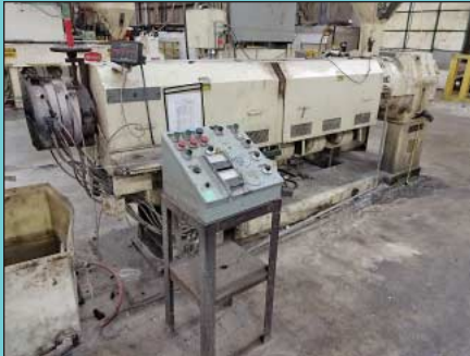
3.5" Sterling Model 3-1/2 30:1 Extruder