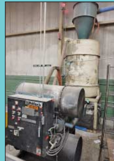
(2) Large Whitlock Central Dryers