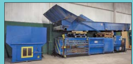
4' X 4' X 6' Compac Specialties Hydraulic Horizontal Cardboard Baler