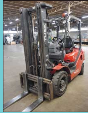
5,000 Lb. Tusk Model 500PG-16 LP Gas Pneumatic Tire Truck Lift Truck