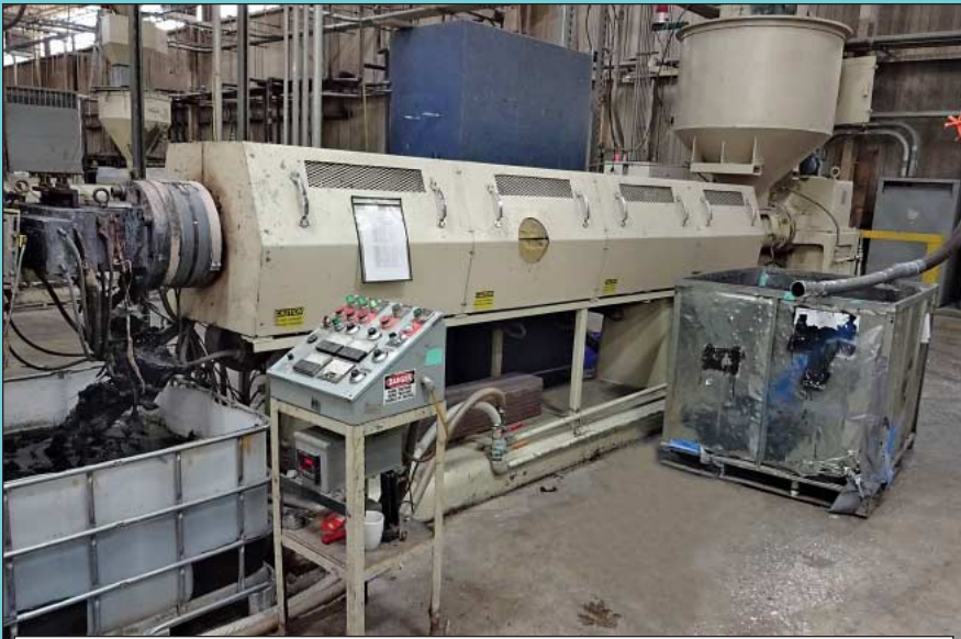
(13) Extrusion Lines from 6" to 2-1/2" and 400-HP by PTI, Davis, NRM and Others

INSPECTION: WEDNESDAY, MAY 27TH FROM 10:00 AM TO 4:00 PM