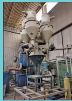
Hydra-Color 4-Component Material Blender