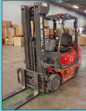
3,000 Lb. Kalmar Model C30AXPS LP Gas Solid Tire Lift Truck