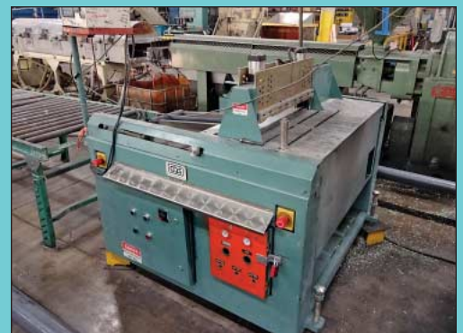
CDS Model CTS-4-24-14 Automatic Upacting Saw