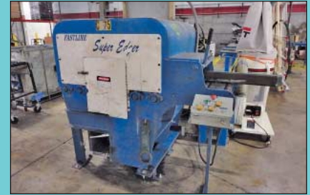
Fast Line Model FLE Super Edger Pass-Thru Rip Saw