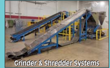
Grinder & Shredder Systems