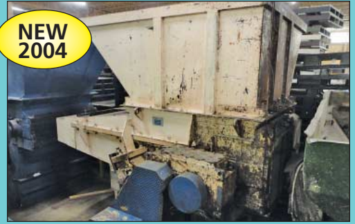
75-HP Vecoplan Type RG-52/75/SPK Central Shredder