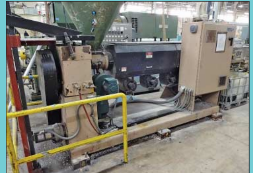
3.5" Berlyn Model 3-1/2 Ext 30:1 Extruder