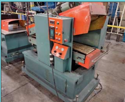
(3) Late Model Conair Cleated Belt Pullers