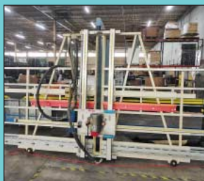
6' X 12' SSC Panel Saw