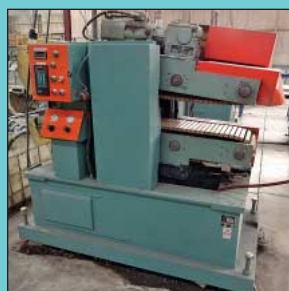
(13) Cleated Belt Pullers To 10' W X 60' L