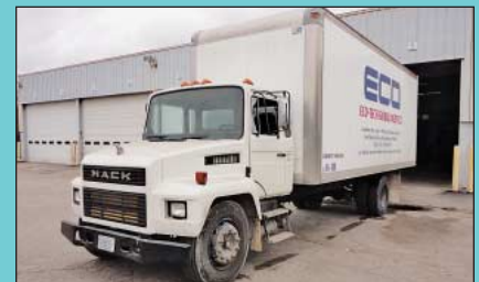
1988 Mack 24' Box Truck w/ 400,000 Miles