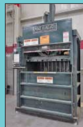
Fox Model 60 Hydraulic Baler