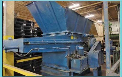
50-HP Vecoplan Type VAZ-200 Central Shredder