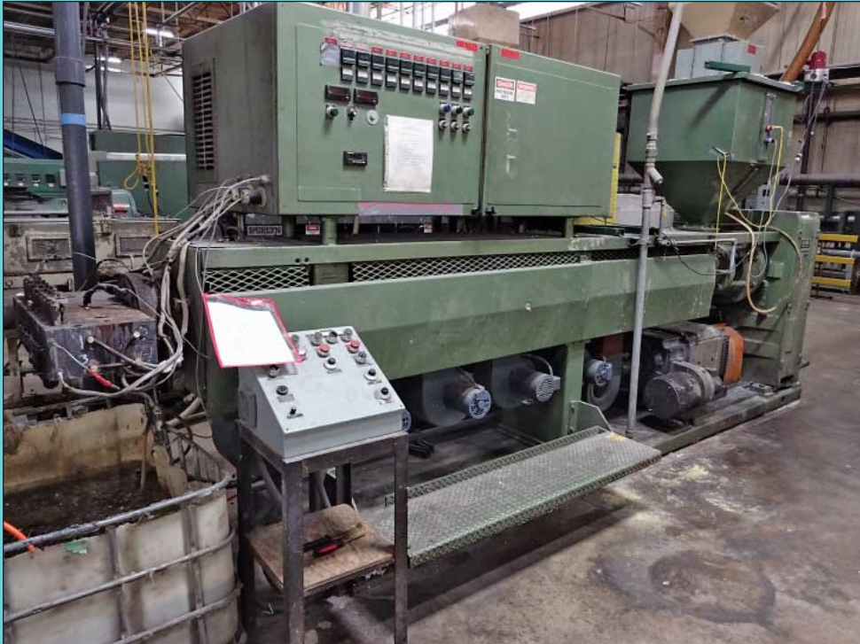
4.5" NRM Model 4-1/2-PMIII Extruder