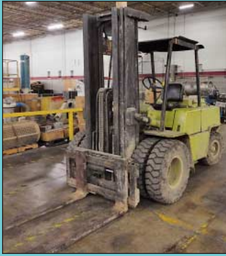
8,000 Lb. Clark Model C500-Y100 LP Gas Pneumatic Tire Lift Truck