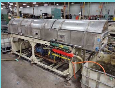
(10) Conair Gatto 12' Vacuum Sizing Tanks