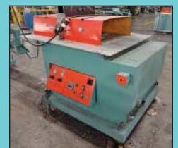
(5) Late Model Conair Upacting Saws