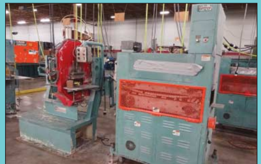
(10) Conair Gatto Pullers & (3) Brabor Saws