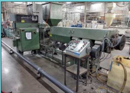
3.5" PTI Model 3.5-100 Extruder