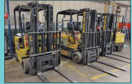
(5) 5,000 Lb. Hyster Model E50XL Sit-Down Electric Lift Trucks