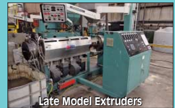
Late Model Extruders