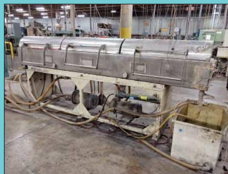
(13) Vacuum Sizing Tanks To 24" W X 20" L