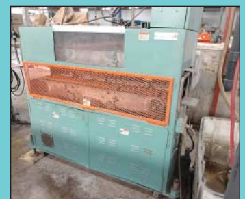
(7) Conair Gatto Cleated Belt Pullers