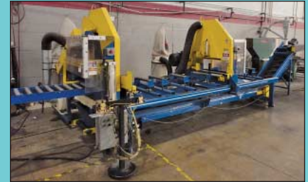
144" Wide Heartland Fab and Machine Adjustable Head Saw