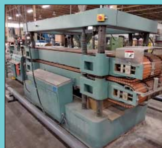
10" x 11' Royal Model 089 3-Lane Cleated Belt Puller