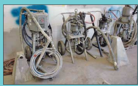
Large Quantity of Contractors Equipment Including Paint Sparyers, Steam Cleaners, Gensets, Texture Sprayers and More