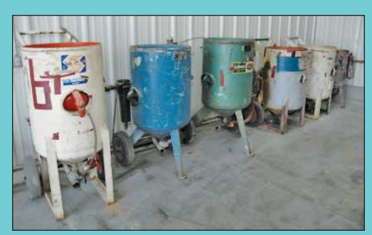
(6) Misc. Blast Pressure Pots