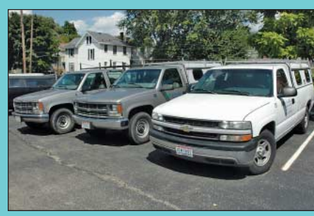
(9) Pick Up Trucks, Cargo Van and SUV