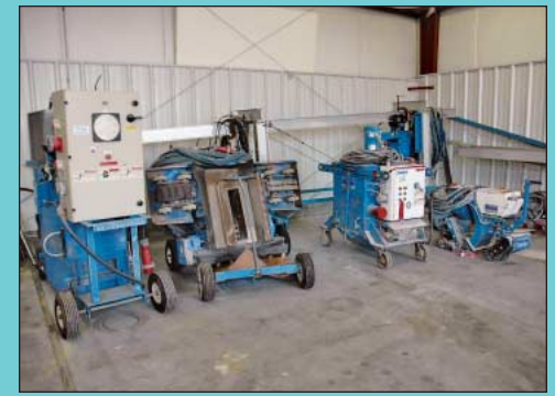
U.S. Filter Model "Porta Wheel" Vertical Shot Blast Cleaning System & U.S. Filter Blastrac 10DS Portable Floor Shot Blast Machine