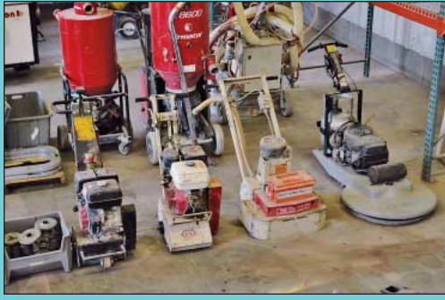
Bank View of Floor Burnisher. Grinder. Scarifiers

Office Equipment Including; (6) Hon Office Cubicles, File Cabinets, Lateral File Cabinets, Executive Office Furniture, Chairs, Drafting Tables, Conference Tables & Other Related Items