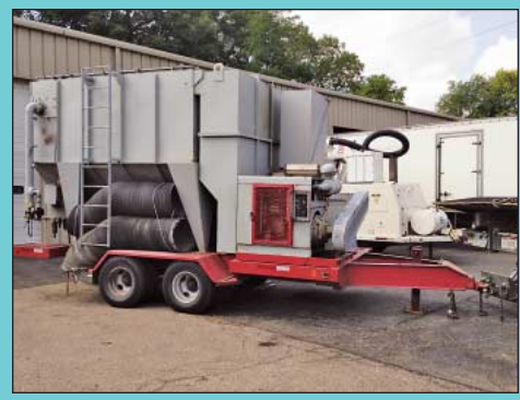
20,000 CFM Eagle Industries Model Jet-Clean 20-D Trailer Mounted 22-Cartridge Dust Collector