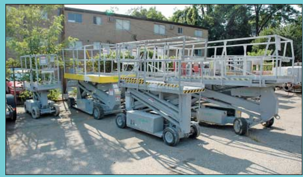
(8) Electric Scissor Lifts By Stratos and Hefty Herman