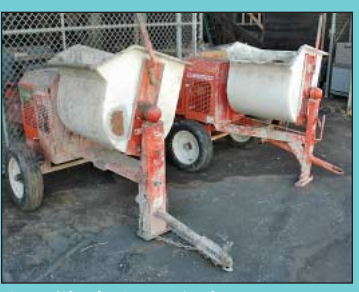
(2) Multiquip Cement Mixers