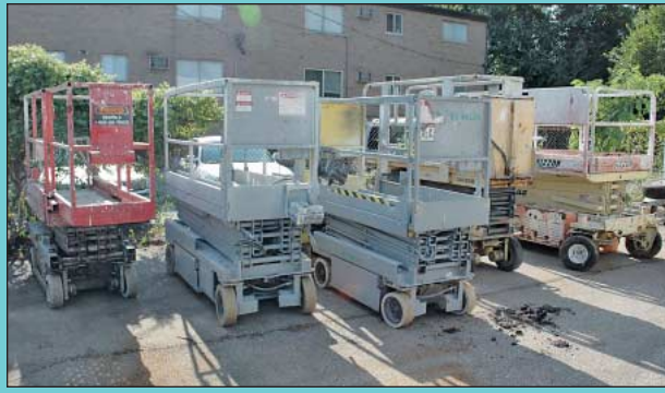
Electric Scissor Lifts By JLG and Grove

5,000 LB Daewoo Model G255 LP Gas Pneumatic Tire Lift Truck; S/N 12-07600, 173" Max Lift, Side Shift, Three-Stage Mast, Hours: 9441 SEE PHOTO