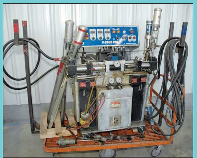
raco Model H35 Pro Plural Component Proportioner Pump