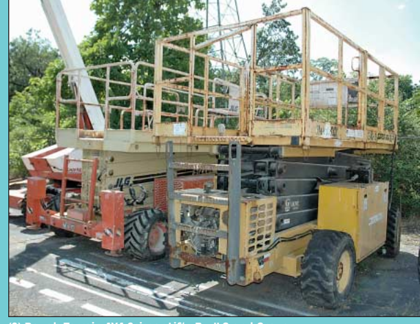
(2) Rough Terrain 4X4 Scissor Lifts By JLG and Grov