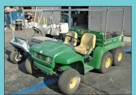
John Deere Gator 6X4 Gasoline Side by Side