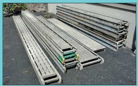
Huge Quantity of Scaffolding, Ladders, and Walk Boards