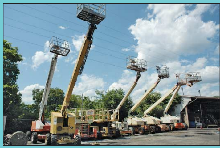
(6) Boom Lifts By JLG, Grove and Snorkellift up to 66