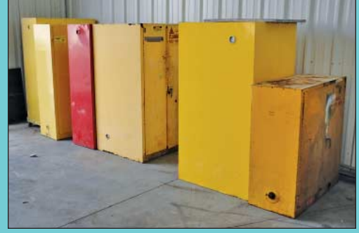
(6) Fireproof Cabinets