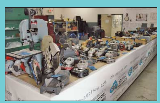
Partial View of Table Lots Including Electric Hand Tools