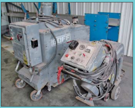
13" Coff Model 15E13 Portable Floor Shot Blast