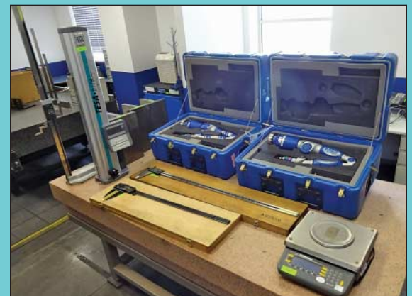
Inspection Equipment Consisting of (2) Faro Arms, Tesa Height Gauge, Digital Calipers, & More