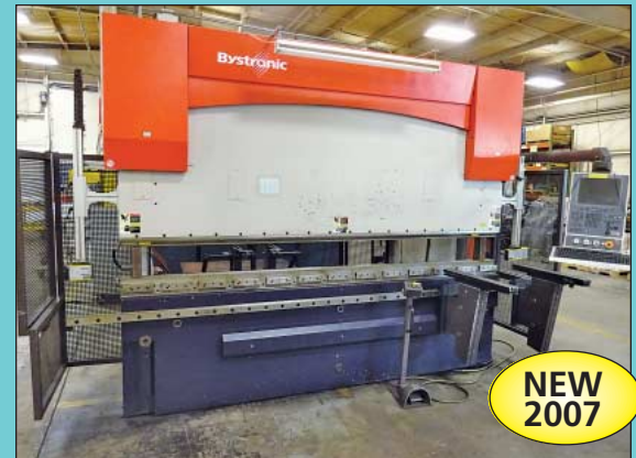
165 Ton X 10' Bystronic Model PR150X3100 Press Brake