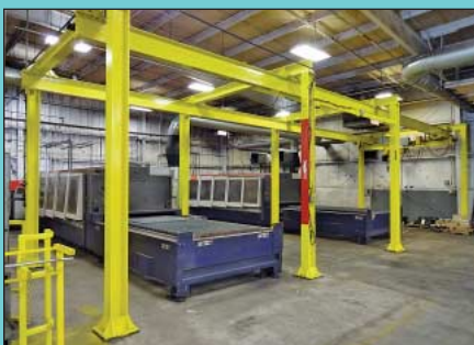
2 Ton X 12' Span X 50' Long Contrx Free-Standing Underhung Bridge Crane