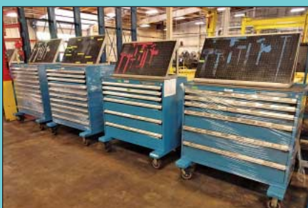
(5) Vidmar Cabinets Loaded w/ Wilson & Wila Press Brake Dies

82" Yellow Jack Model 110 Horizontal Rotary Bundle Wrapper; S/N 000269-0905, 22" Wide Stretch Wrap Roll, 56" Travel SEE PHOTO