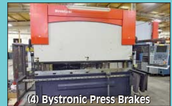
(4) Bystronic Press Brakes