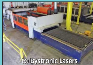
(3) Bystronic Lasers

Contact Information 2020 Dunlap St. Cincinnati, Ohio 45214 Phone 513-241-9701 Fax 513-241-6760 www.cia-auction.com