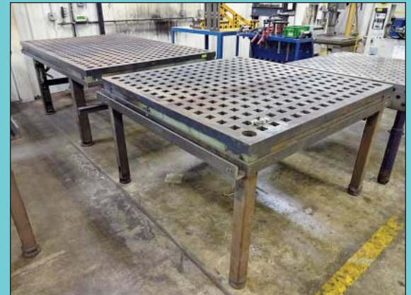
(3) 5' X 5' Acorn Tables