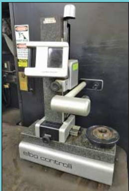
Elbo Controlli Model WASP Tool Presetter