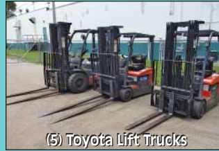
(5) Toyota Lift Trucks