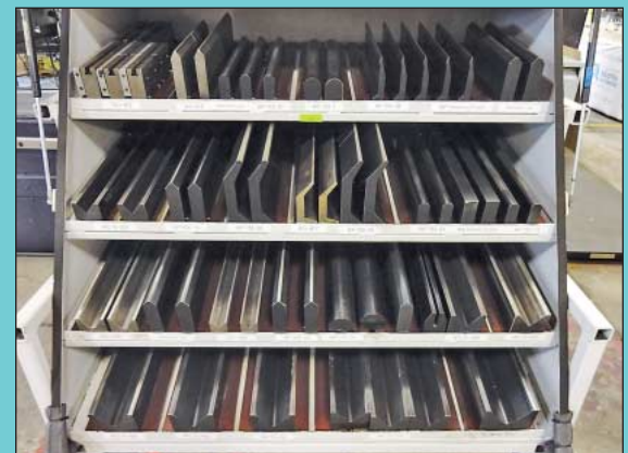
Large Quantity of Various Press Brake Dies by Wilson Tool and Wila