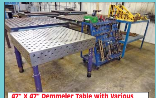
47' X 47' Demmeler Table with Various Tooling