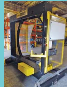
82" Yellow Jack Model 110 Horizontal Rotary Bundle Wrapper