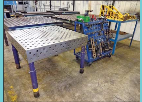
47" X 47" Demmeler Table with Various Tooling