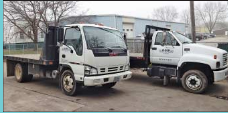
2006 & 2003 GMC Stake Bed Trucks