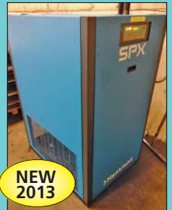
Hankison SPX Model HPRP500 Air Dryer