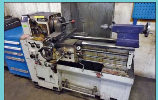
14" X 22" YAM Model 1422 Lathe