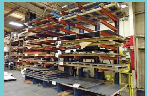
(4) Cantilever Racks; 60" Arm Length