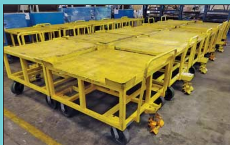
(25) 4' X 4' Topper Industrial H.D. Steel Portable Carts