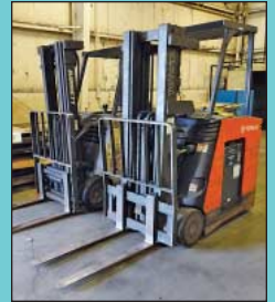
3,500 LB Toyota & 3,000 LB Barrett Stand-Up Electric Lift Truck