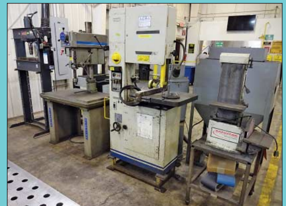
Miscellaneous Equipment Including H-Frame Press, Drill, Vertical Band Saw, Sander