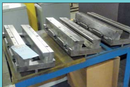
(3) Rolla-V Model RVPVP3 Press Brake Dies