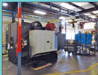
1/2 Ton X 12' Span X 32' Long Gorbelt Free-Standing Bridge Crane