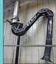
(7) Air Flow EZ Arm Fume Extraction Systems

200 Gallon Steel Receiving Tank Hankison SPX Model HPRP500 Air Dryer; S/N RH0B35004A2E15010, 232 PSIG (New 2013) SEE PHOTO