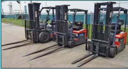
(2) Toyota LP Gas & Electric Lift Trucks Up to 6,000 LB