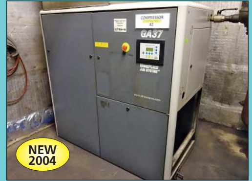
(2) 50 HP Atlas Copco Model GA37 Elektronic II Cabinet Enclosed Air Compressor