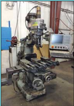
2 HP Bridgeport Three-Axis CNC Mill