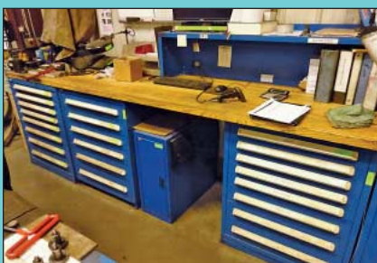
(3) 5' Vidmar Maple Top Bench with 6-Drawer Cabinet