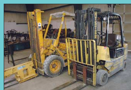
Bank View 5,000 Lb. Clark and 5,000 Lb. Hyster Lift