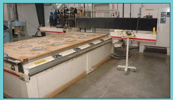
Thermwood Model C50 CNC Router