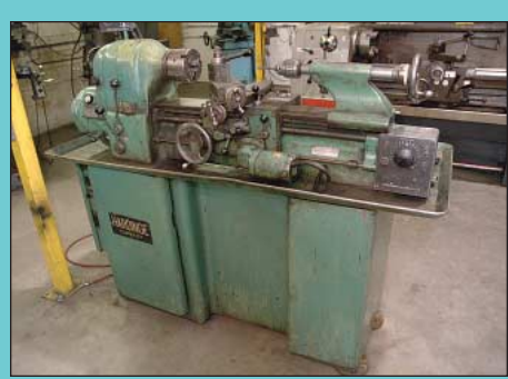
Hardinge HLV Precision Toolroom Lathe