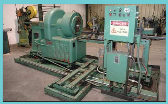
Abbey Etna Model 158 Swager