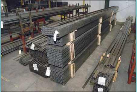
Partial View Steel Tube Inventory