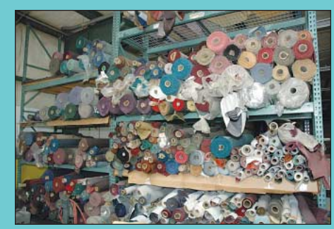
Aprrox. (500) 54" Wide Rolls of Various Styles &