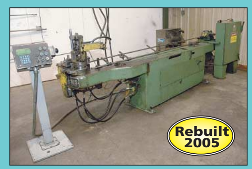
3/4" Pines Horizontal Hydraulic Tube Bender