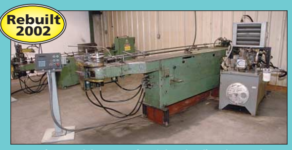
1-1/4" Pines Model No. 1 Horizontal Hydraulic Tube Bender