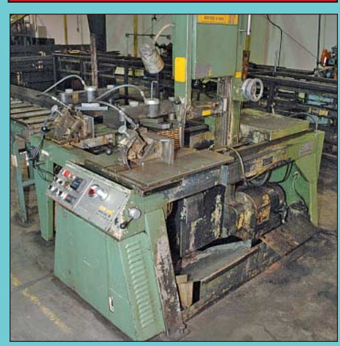
Marvel Model V-10A Tilt Frame Vertical Band Saw

INTANGIBLE ASSETS FOR MANUFACTURING OF COMMERCIAL TABLES AND SEATING