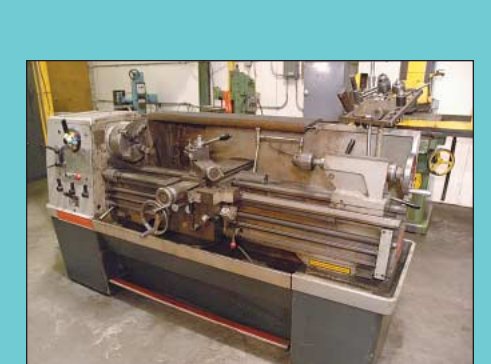
Partial View Late Model Welders