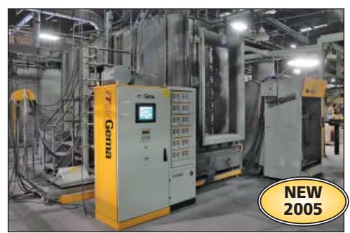
ITW Gema Optimatic 12-Gun Poly Upper Pass-Thru Automatic Powder Coat Booth

(2) Latour Robomac Model 310 CNC 3D Wire Benders