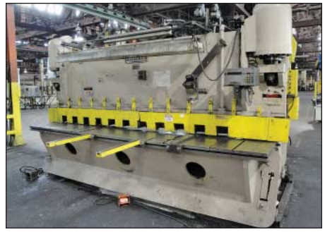
3/8" X 12' Pacific Model 875HD12 Hydraulic Power Squaring Shear