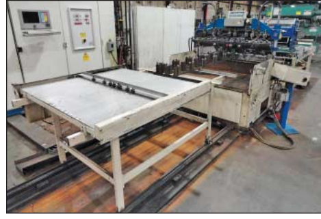
Schlatter Model MG12.4/4C Wire Mesh Welder