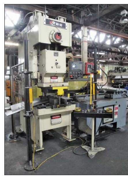
80 Ton Niagara Model Bison BN-80-OBS Variable Speed Gap Frame Press

INSPECTION: MONDAY, OCTOBER 15TH FROM 10:00 AM TO 4:00 PM