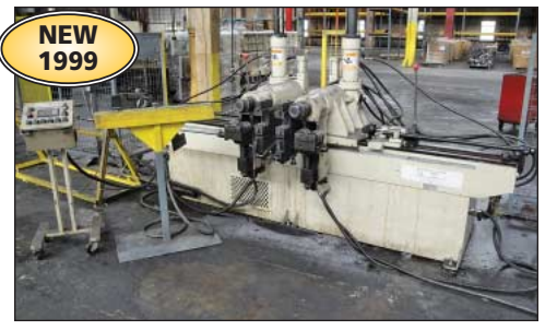
S&S FSD Model F50 Adjustable Dual Head Vertical Tube Bender

75 Ton Aida Model PC-7(2) Single Crank Gap Frame Press