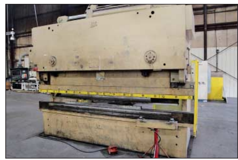
150 Ton X 12' HTC Model 150G Hydraulic Power Press Brake