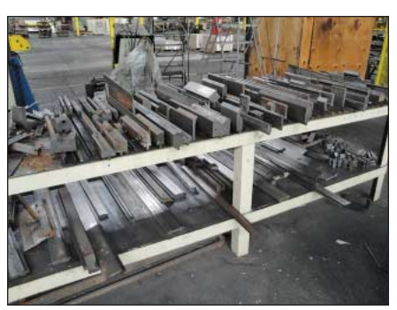
Partial View Large Quantity Press Brake Tooling