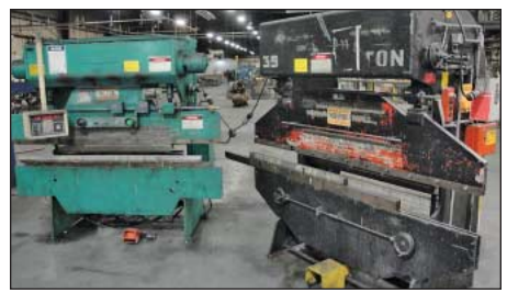
(3) 14 Ga. X 6' Diacro Hydra-Power Model 14-72 Mechanical Power Press Brakes