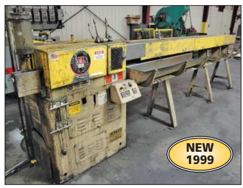
F.E. Lewis Model 2SV5 Automatic Wire Straight & Cut Machine