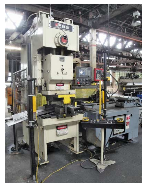
80 Ton Niagara Model Bison BN-80-OBS Variable Speed Gap Frame Press