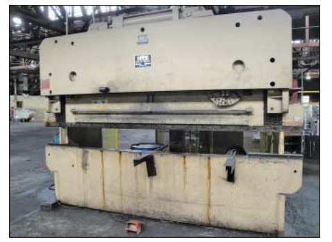
155 Ton X 12' HTC Model 155-12H Hydraulic Power Press Brake