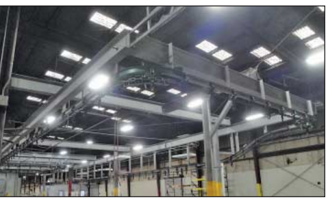
Approx. 600' Chain Type Overhead Conveyor