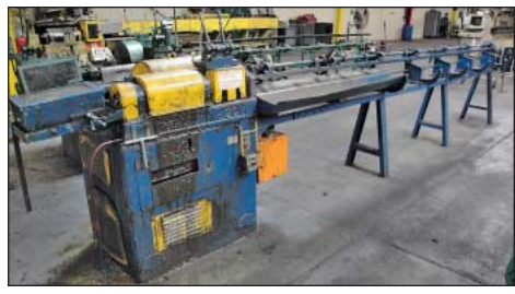
Lewis Model 2CV4 Automatic Wire Straight & Cut Machine