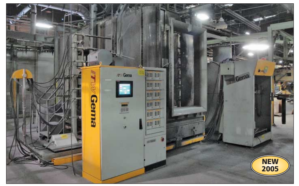
ITW Gema Optimatic 12-Gun Poly Upper Pass-Thru Automatic Powder Coat Booth

Lewis Model 2C Automatic Wire Straight & Cut Machine; S/N N/A, Wire Dia. Range: .093" To .250", 10' Runout Track, 150 FPM, Manual Pay-Off