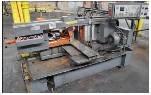
12" X 16" HEM Model Sidewinder Auto-4 Mitre Head Automatic Horizontal Band Saw