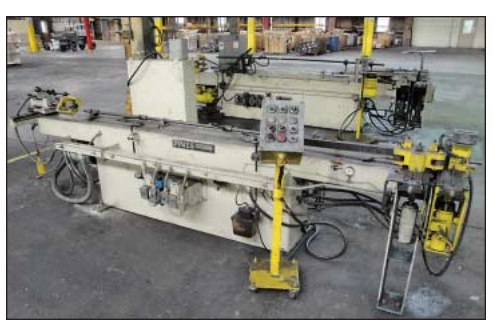
Pines Model 1 Horizontal Tube Bender