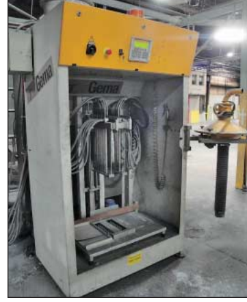
ITW Gema Type VZ01-14 Powder Mixing Station