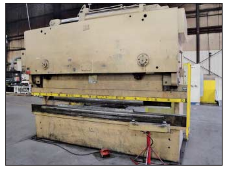
150 Ton X 12' HTC Model 150G Hydraulic Power Press Brake