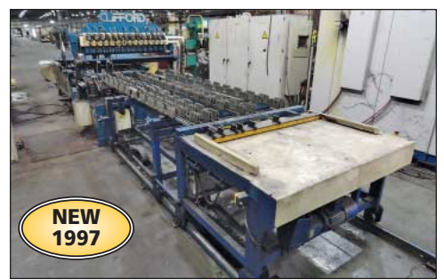
Clifford Model CWL EEZiWeld CNC Programmable Wire Mesh Welder