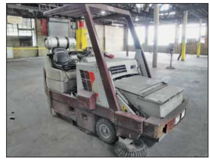
Powerboss Model TSS82/HD Rider Type LP Gas Floor Sweeper

Red-O-Arc EX300 Contractor Mig Welder w/ Miller Wire Feeds (10) Linde VI-253 Mig Welders w/ Wire Feeds