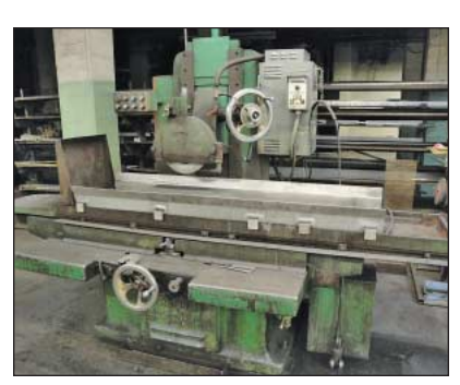
14" X 36" Gallmexer and Livingson No. 65A Hydraulic Surface Grinder w/ Electric Chuck