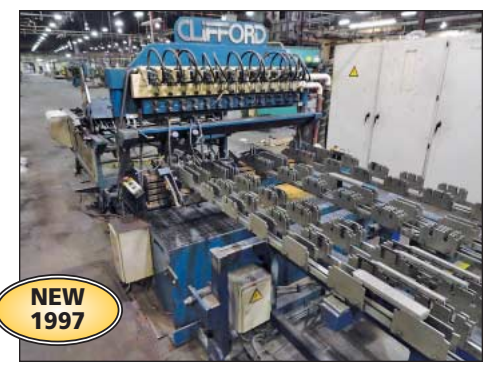
Clifford Model CWL EEZiWeld CNC Programmable Wire Mesh Welder