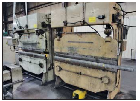
16 Ga. X 8' Diacro Hydra-Power Model 16-96 Mechanical Power Press Brake