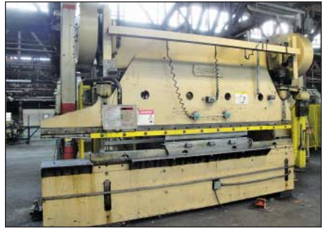
130 / 225 Approx. Ton X 14' Cincinnati Series 130X10 Mechanical Power Press Brake