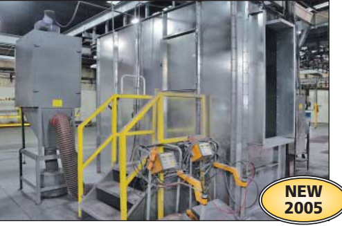
GFS Global Finishing Solutions Modular Galvanized Panel Pass-Thru Touch Up Booth