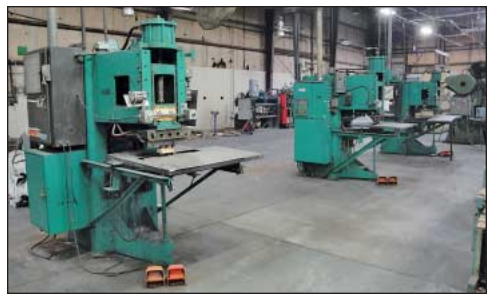
(3) 300 KVA Federal Type P3-24A Press Type Spot Welders