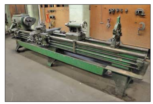
24" X 120" Leblond Geared Head Engine Lathe