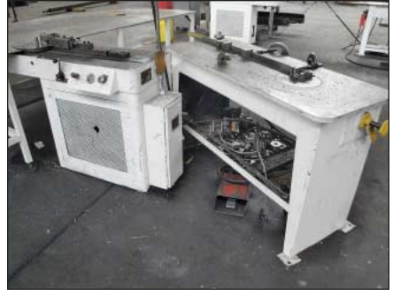
Partial View Lubow and Di-Acro Benders