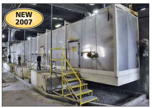
Col-Met Three-Stage Stainless Steel Pass-Thru Tunnel Type Parts Washer