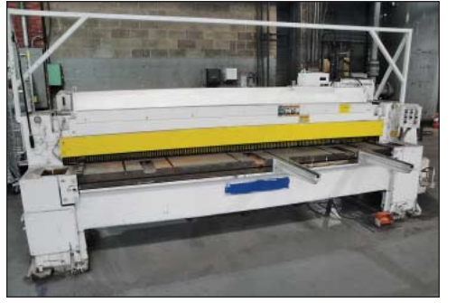
1/4" X 10' Wysong Model 1025 Mechanical Power Squaring Shear

14 Ga. X 52" Wysong Hydraulic Power Squaring Shear