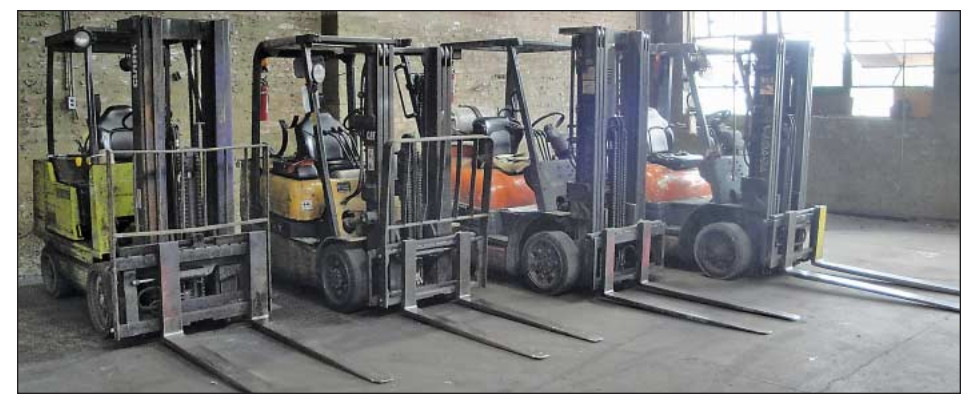
Partial View (4 of 11) Lift Trucks To 20,000 Lb. Capacity