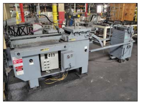
Partial View Late Model Feed Equipment