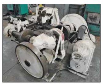
Nilson Type S-3 Four-Slide Machine