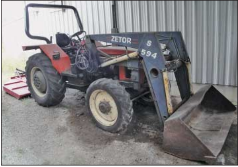
Zetor Model S594 Farm Tractor w/ Bucket Attachment