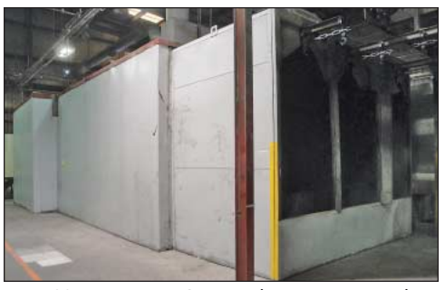
14' X 32' Approx. JR Greene Three-Pass Natural Gas Fired Combination Dry-Off and Cure Oven