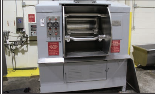
PEERLESS 600LB ROLLER BAR