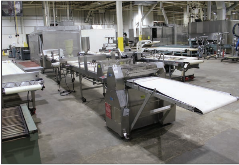
MOLINE PASTRY MAKEUP LINE & SHEETING