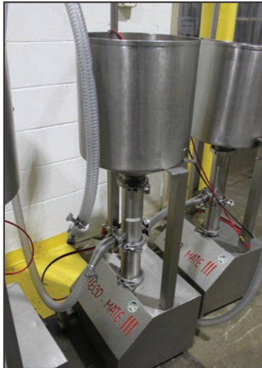
UNIFILLER DECOMATE III