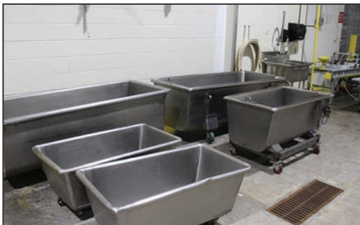
SS DOUGH & ICING TROUGHS