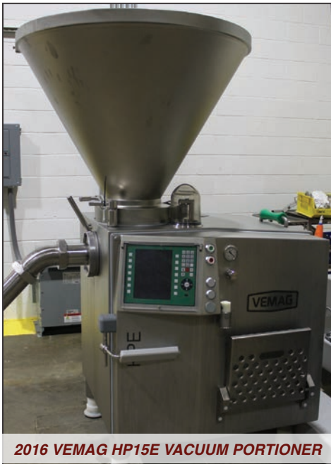
2016 VEMAG HP15E VACUUM PORTIONER