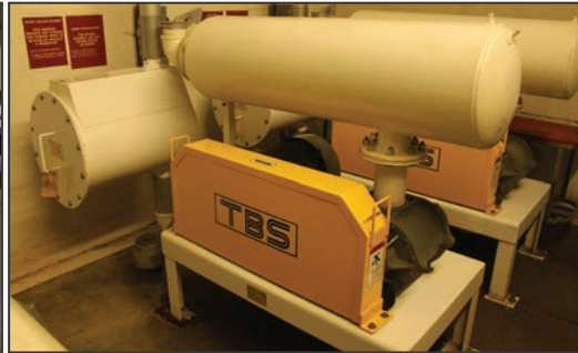
TBS 10 & 20 HP BLOWER PACKAGES