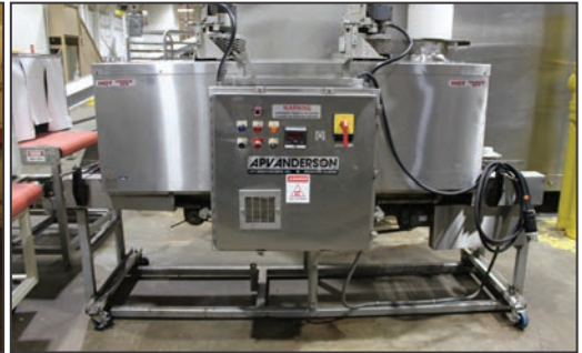
ALL SS SHRINK TUNNEL