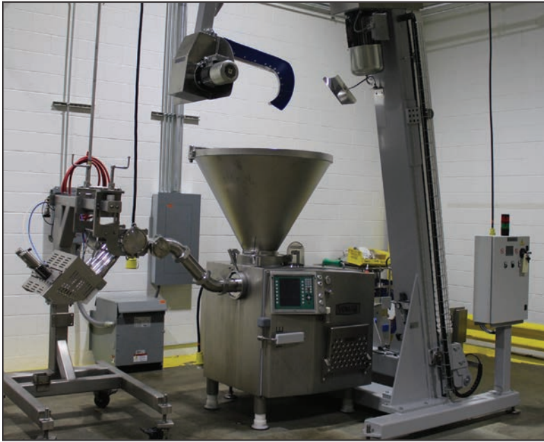
2016 VEMAG HP15E WITH WATER WHEEL & BOWL LIFT