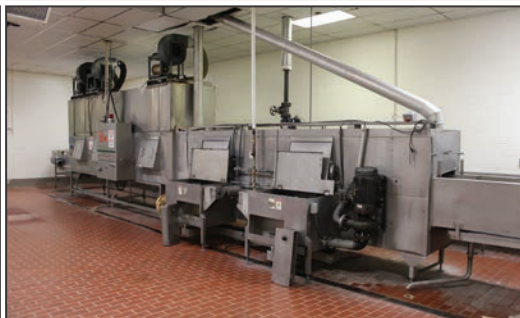
GOBEL SS PAN WASHING SYSTEM