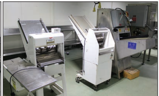
MULTIPLE BAND SLICERS