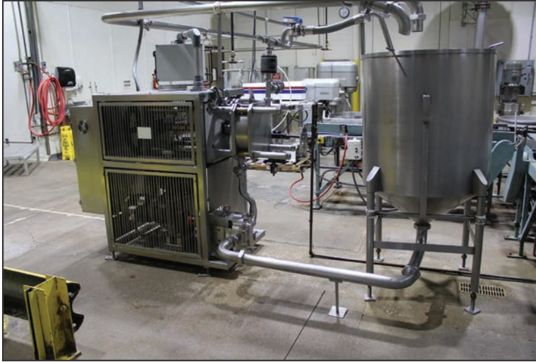
FEDCO FM-50 CONTINUOUS MIXING SYSTEM