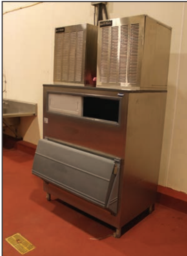
ICE-O-MATIC ICE MACHINE