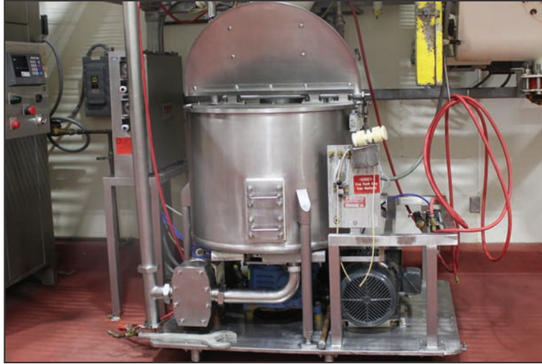
FEDCO SM600 465-LITER BATTER MIXING SKID