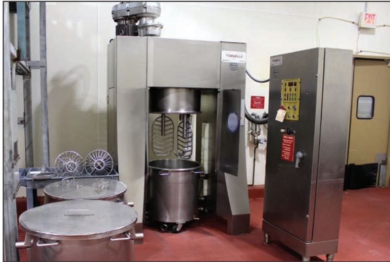
TONELLI 200 LITER MIXING SYSTEM