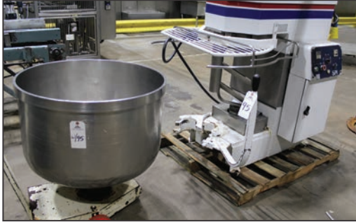
VMI 270 QUART MIXER - (3) BOWLS