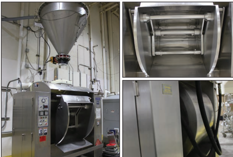
PEERLESS 800LB ROLLER BAR • HS8HD