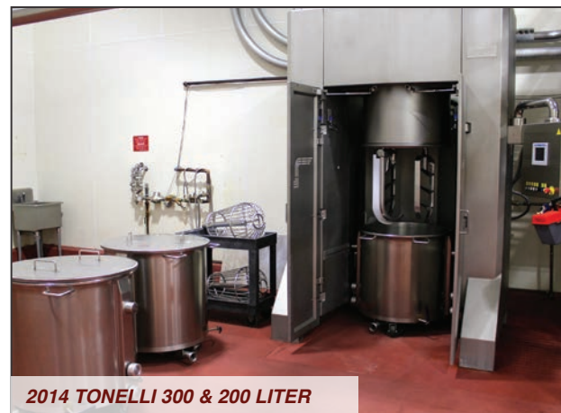
2014 TONELLI 300 & 200 LITER