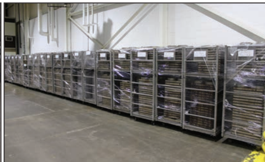
HUGE PAN INVENTORY - 5,000+