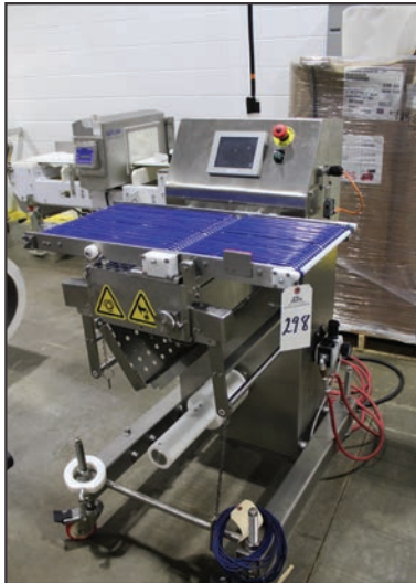
2016 PACKPRO INTERLEAVER