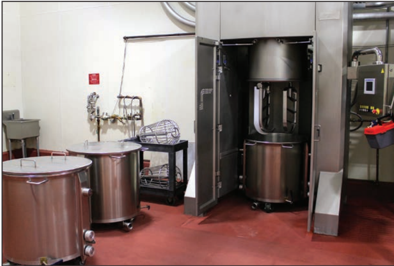
2014 TONELLI 300 LITER MIXING SYSTEM