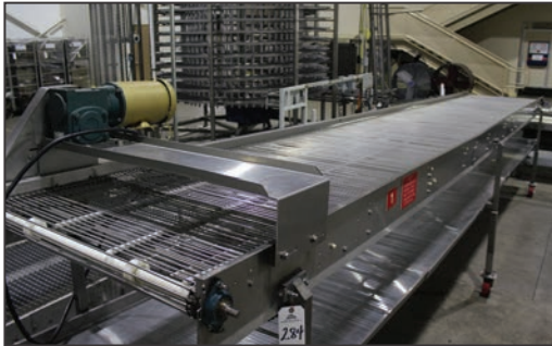
MULTIPLE SS COOLING CONVEYORS