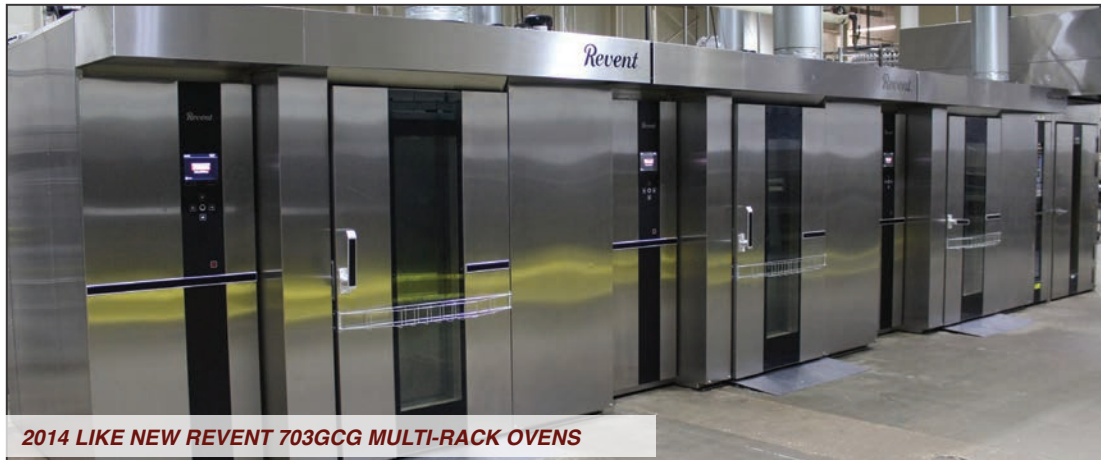
2014 LIKE NEW REVENT 703GCG MULTI-RACK OVENS