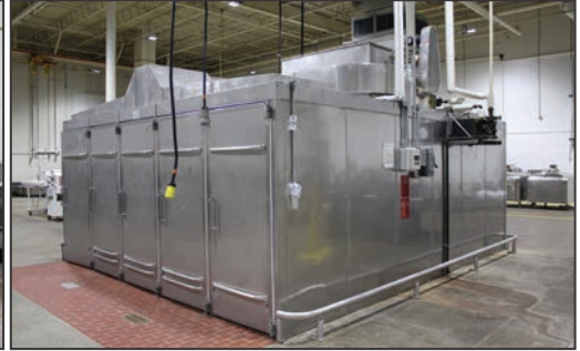
PFENING 5-BAY RACK PROOF BOX