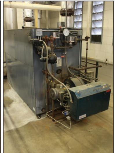
(2) GAS FIRED BOILERS