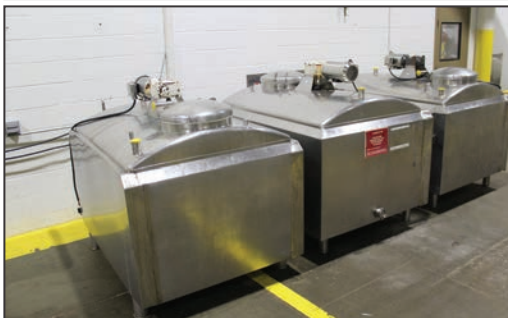
STAINLESS STEEL FLAVOR TANKS