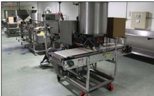
FEDCO ICING DEPOSITOR