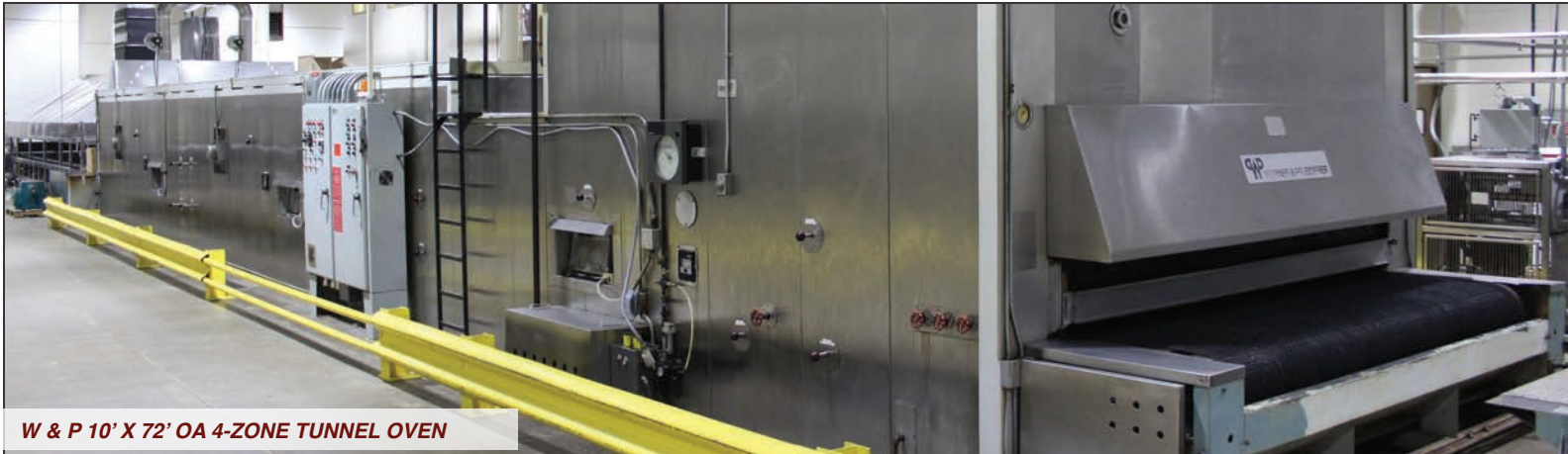
W & P 10' X 72' OA 4-ZONE TUNNEL OVEN

500 LOTS OF SUPER LATE MODEL CAKE & BAKERY PRODUCT PRODUCTION EQUIPMENT