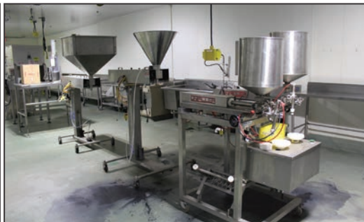
UNIFILLER PISTON DEPOSITORS