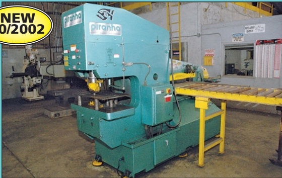
140 Ton Piranha Model PII-140 Hydraulic Power Ironworker