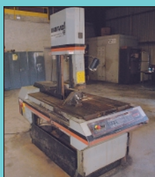
(2) 18" Marvel Armstrong Blum Series 8 Mark II Tilt Frame Vertical Band Saws