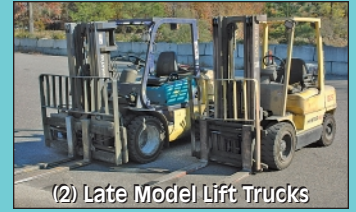
(2) Late Model Lift Trucks