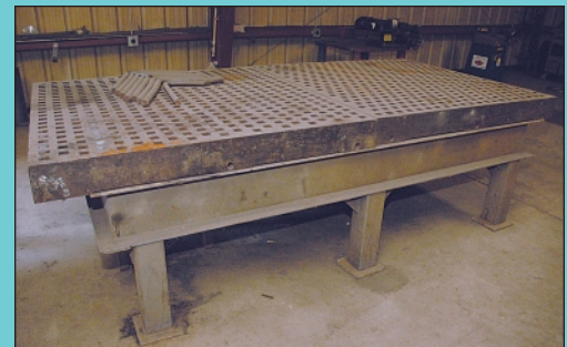
(2) 5' X 10' Heavy Duty Cast Iron Acorn Style Welding Tables