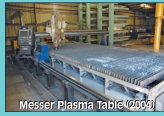
Messer Plasma Table (2004)

2020 DUNLAP ST., CINCINNATI, OHIO 45214 PHONE (513) 241-9701 / FAX (513) 241-6760 INTERNET: cia-auction.com