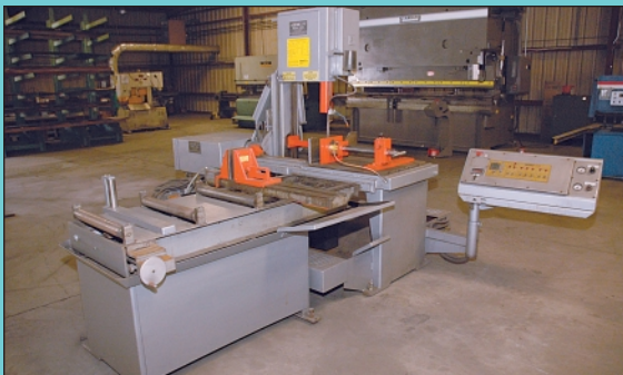
18" Hem Saw Model V100LA-2 Auto Feed Tilt Frame Vertical Band Saw

Featuring: 8' X 20' Messer Edgemate CNC Plasma Cutting Table (2004), 325 Ton X 12' Standard Hydraulic Press Brake (2007), Piranha PII-140 Ironworker (2002), Geka HYD-70/A Ironworker, Ercolina TB60 Tube Bender (2002), 1/4' X 10' Adira Hydraulic Shear, Roundo AB Type IP110/4 Power Bending Rolls, 18" Hem Saw V100LA-2 Auto Tilt Frame Band Saw, (2) Marvel Tilt Frame Band Saws, Storage Canopies, Lift Trucks, Jib Cranes, Toolroom, Welding, Shop & Office Equipment