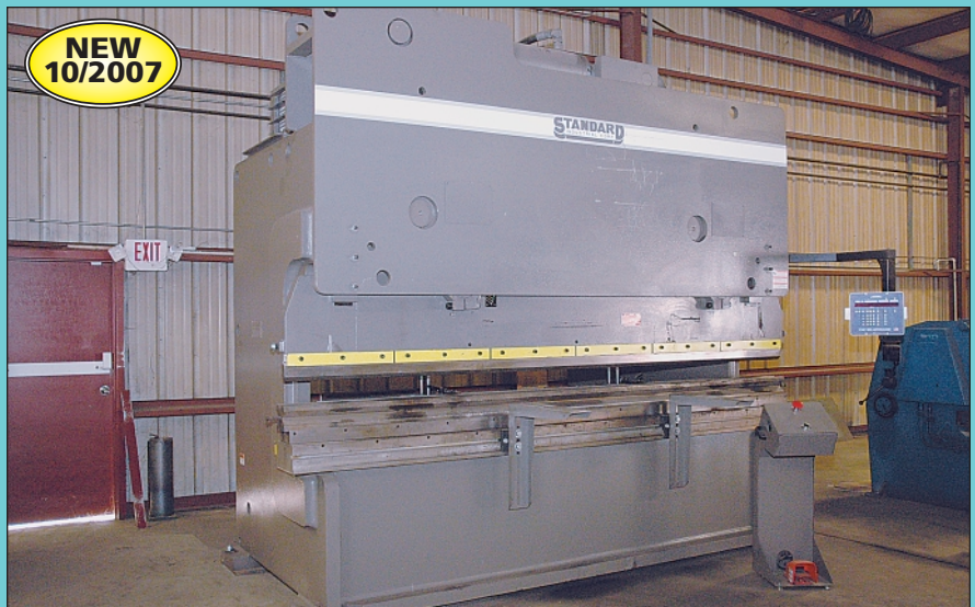
325 Ton X 12' Standard Industrial Model AB325-12 Hydraulic Power Press Brake w/ CNC Back Gauge