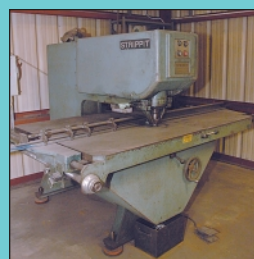
Strippit Super 30/30 Single End Punch