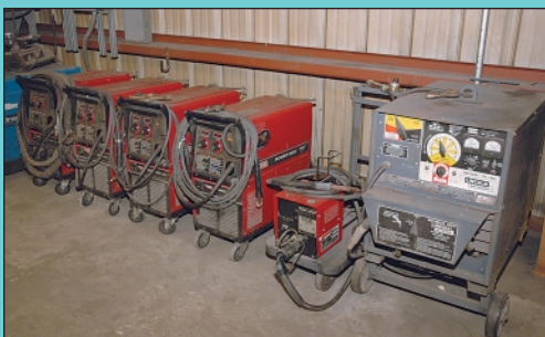
Partial View Late Model Lincoln Welders