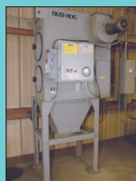
United Air Specialists Model FJL2-SD Fume Hog Dust Collector