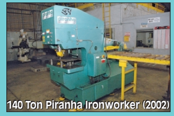
140 Ton Piranha Ironworker (2002)