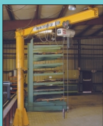
1/4 Ton X 8' Arm Handling Systems Floor Mounted Jib Crane

Office Furniture & Computer Equipment Consisting of; (3) Desks, (4) Chairs, Four-Drawer Files, (2) Two-Drawer Files, (2) Two-Drawer Lateral Files, Brother Fax Machine, Canon Image Class 2300 Copier, Channel Vision 8 Channel Security Camera System, Microwave, GE Refrigerator, Dell Desktop w/ Lexwork E210 Printer, Lian Li Desktop w/ Magic Color Printer, HP Desktop & Other Related Items