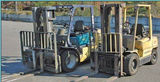
8,000 Komatsu and 6,000 Lb. Hyster Pneumatic Tire Lift Trucks