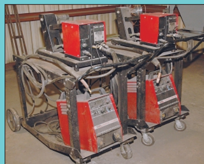
(3) 300 Amp Lincoln Model Invertec V300-Pro Inverter Welding Power Sources

No Last Minute Registrations will be accepted. Make Sure to Register & Post Your Deposit No Later than 48-Hours Prior to the Start of the Auction.