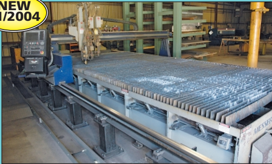
Messer Model Edgemate EM-100 CNC Plasma Cutting Table