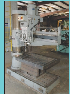
30" Arm X 12" Col. Sharp Model RD-1230 Radial Arm Drill