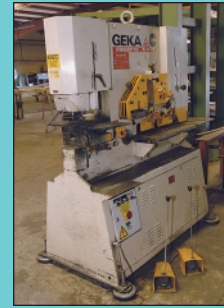
70 Ton Geka Hydracrop Model HYD-70/A Hydraulic Power Ironworker