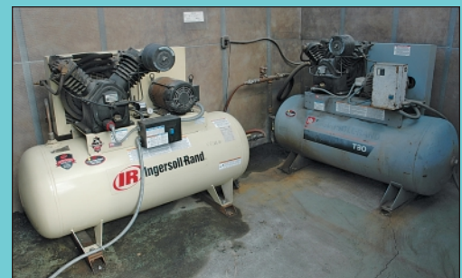
(2) 10 HP Ingersoll Rand Model 2545 Two-Stage Horizontal Tank Air Compressors