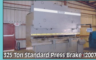
325 Ton Standard Press Brake (2007)