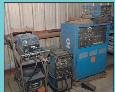
Partial View Late Model Miller Welders