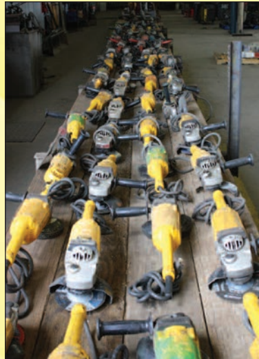
VIEW OF GRINDERS