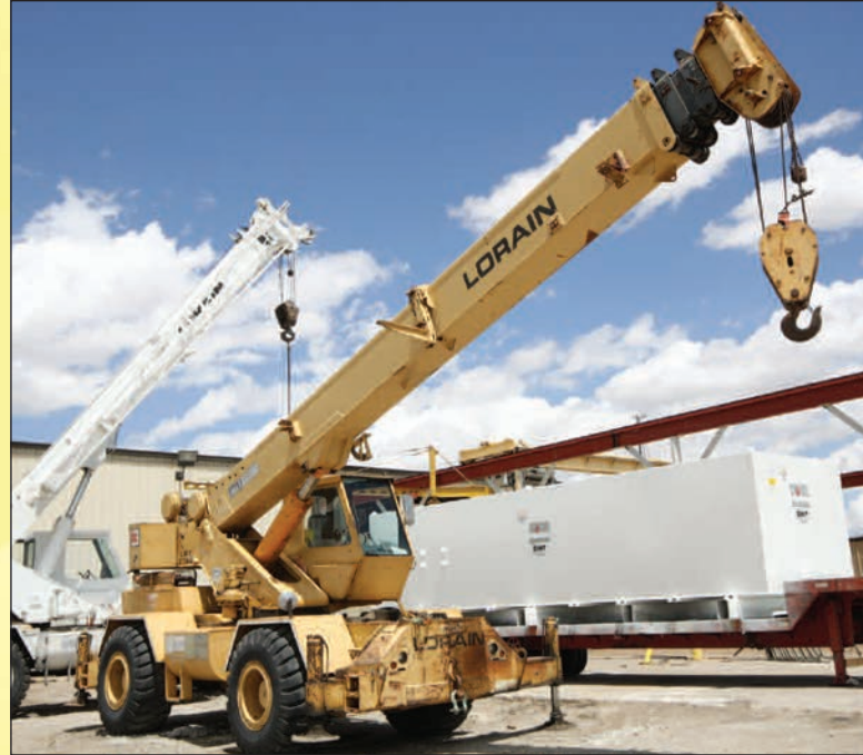
LORAIN ROUGH TERRAIN CRANE, MDL. LRT-275D