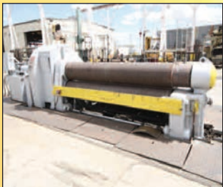
WEBB PLATE BENDING ROLL

2-DAY AUCTION: June 24 & 25 @ 9:00 AM MDT INSPECTION: June 22 & 23, 8:00 am to 4:00 pm MDT QUESTIONS: (847) 499-7049 REGISTER & BID AT www.hyperams.com LOCATION: 8301 Broadway Blvd. SE, Albuquerque, NM