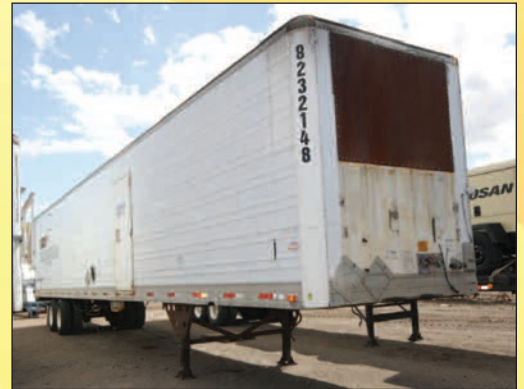
STRICK VAN TRAILER