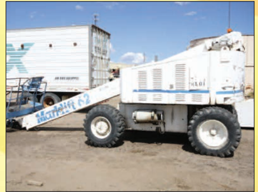
MARKLIFT SELF PROPELLED AERIAL LIFT 62