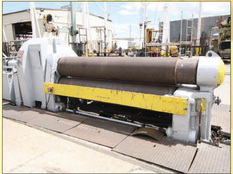
WEBB PLATE BENDING ROLL, MDL. 18L