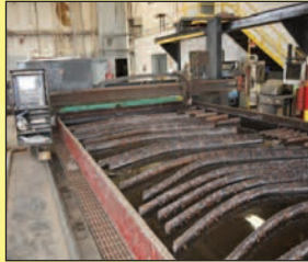
CNC PLASMA SHAPE CUTTING SYSTEM