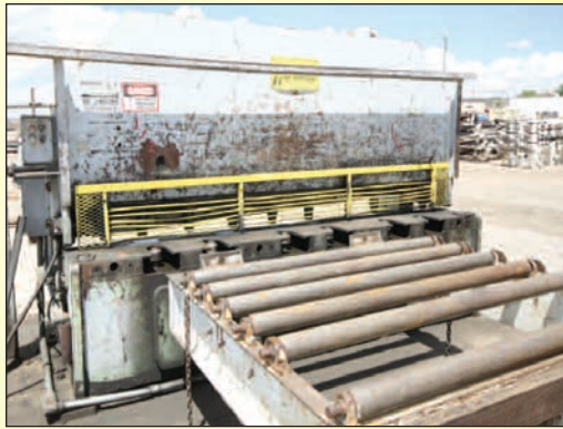
HERCULES HYDRAULIC POWER SHEAR, MDL. 500-120