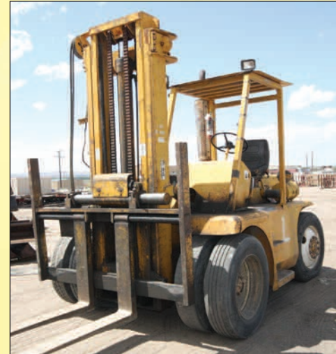
CATERPILLAR 18,000 LB. CAP. TOWMOTOR LIFT