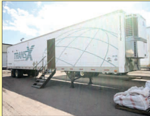
REFRIGERATED VAN TRAILER