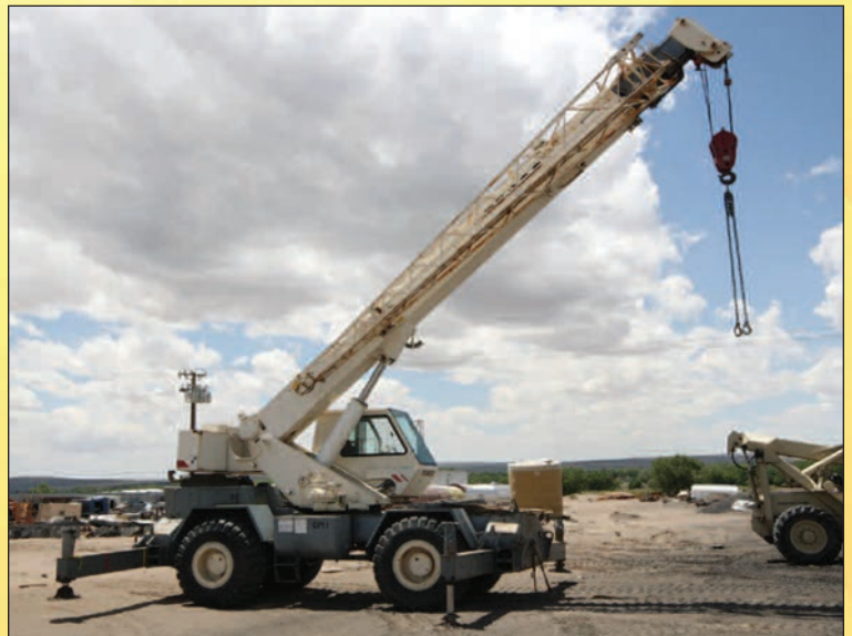
(2) TEREX ROUGH TERRAIN CRANES, MDL. RT-230