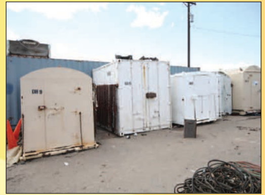
VIEW OF STORAGE CONTAINERS