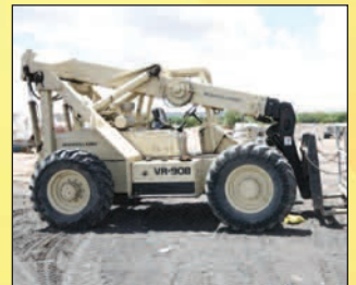
IR ROUGH TERRAIN LIFT TRUCK

2-DAY AUCTION: June 24 & 25 @ 9:00 AM MDT INSPECTION: June 22 & 23, 8:00 am to 4:00 pm MDT QUESTIONS: (847) 499-7049 REGISTER & BID AT www.hyperams.com LOCATION: 8301 Broadway Blvd. SE, Albuquerque, NM