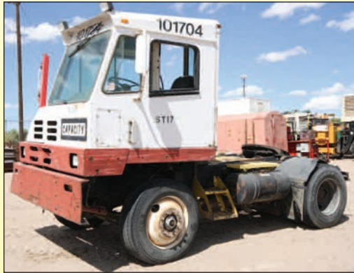
CAPACITY YARD SPOTTER, MDL. TJ5000