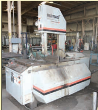
MARVEL VERTICAL BAND SAW, MDL 8-MARK-III