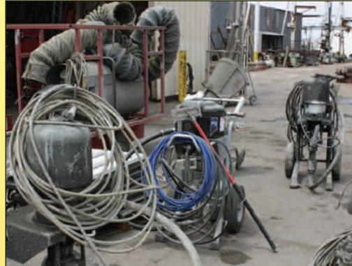
LARGE QUANTITY OF SHOT BLAST TANKS AND SPRAYERS