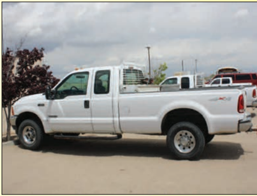
FORD F350 PICKUP TRUCK