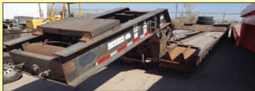
DETACHABLE GOOSENECK LOWBOY TRAILER, 50 TON