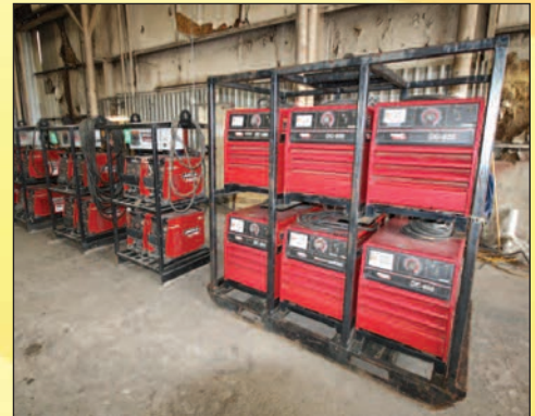
OVERVIEW OF WELDERS