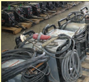
VIEW OF PLASMA CUTTERS