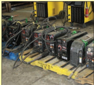
(25) LINCOLN SUITCASE WIRE FEEDERS