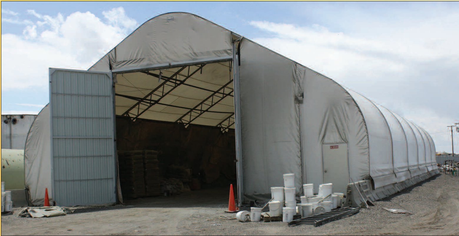
2012 HANSEN PAINTING TENT SYSTEM