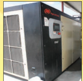
LATE MODEL IR AIR COMPRESSORS