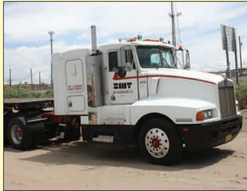
KENWORTH TANDEM AXLE TRUCK TRACTOR, MDL. T600