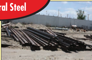
VIEW OF I BEAMS