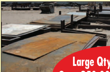
VIEW OF STEEL PLATES