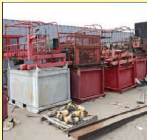
OGDEN 3 O'CLOCK WELDERS