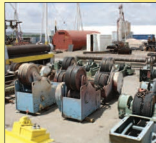
TANK TURNING ROLL SET