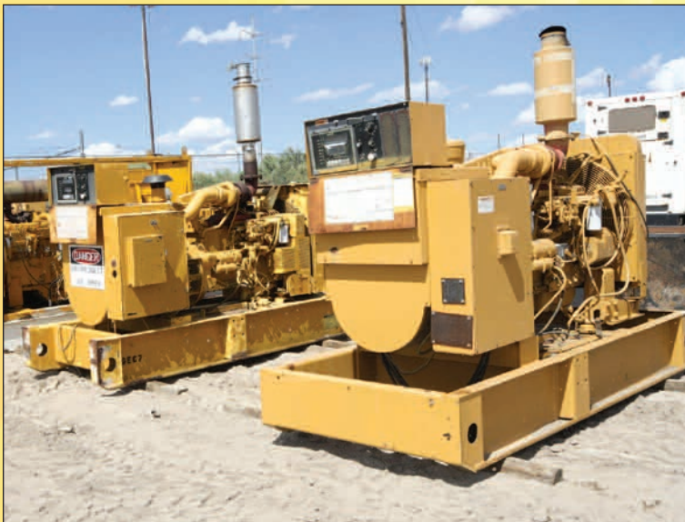
VIEW OF GENERATORS