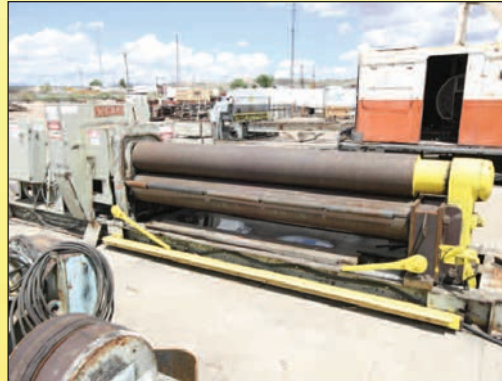
WEBB PLATE BENDING ROLL, MDL. 9L-1310, 5/8" X 10'