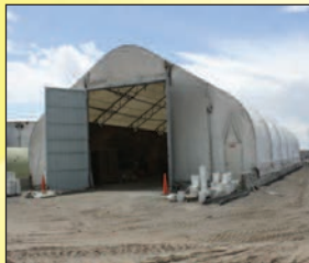
HANSEN PAINTING TENT SYSTEM

HYPERAMS asset maximization services 1501 Michael Dr., Wood Dale, IL 60191