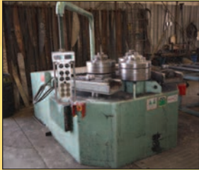
ROUND ANGLE ROLL

BROWN-MINNEAPOLIS TANK ENGINEERS - FABRICATORS - CONSTRUCTORS