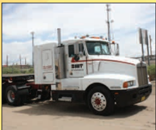
KENWORTH TANDEM AXLE TRUCK TRACTOR

Additional Information: Register & Bid at hyperams.com For Machinery Questions, contact: Burdette (314) 616-8422 Removal: June 26 to July 10, 8:00 am to 4:00 pm MDT See website for terms of sale and accepted payment. Sales tax and buyers premium of 18% online/15% onsite will be added to all invoices.