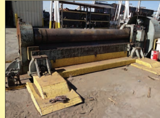
BERTSCH PLATE BENDING ROLL, MDL. 14, 3/4" X 12'