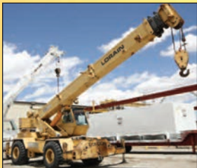
LORAIN ROUGH TERRAIN CRANE