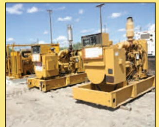
VIEW OF GENERATORS

Additional Information: Register & Bid at hyperams.com For Machinery Questions, contact: Burdette (314) 616-8422 Removal: June 26 to July 10, 8:00 am to 4:00 pm MDT See website for terms of sale and accepted payment. Sales tax and buyers premium of 18% online/15% onsite will be added to all invoices.