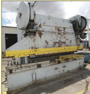
CINNATI MECHANICAL PRESS BRAKE, SERIES 21