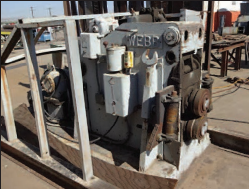
WEBB FLANGER BENDING ROLL, MDL. M5