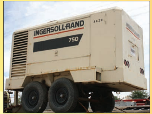
INGERSOLL-RAND PORTABLE DIESEL AIR COMPRESSOR