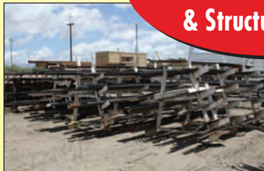
VIEW OF STEEL STOCK