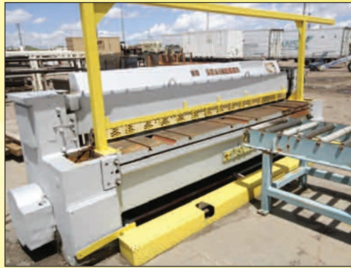
WYSONG HYDRAULIC POWER SHEAR, MDL. 1025