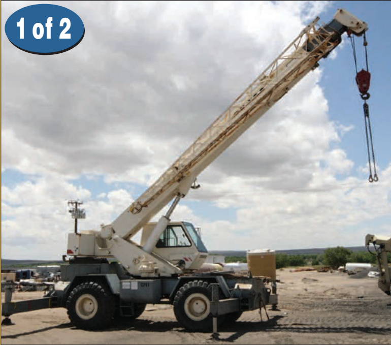
(2) TEREX ROUGH TERRAIN CRANES, MDL. RT-230