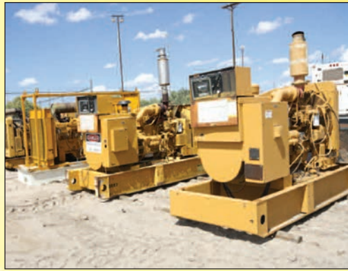
VIEW OF GENERATORS