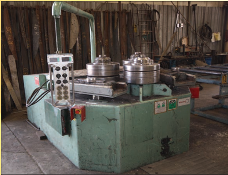
ROUND O ANGLE ROLL, MDL. R-52-S

FOR MACHINERY QUESTIONS, CONTACT: Burdette (314) 616-8422