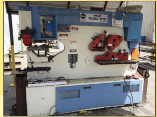
2004 MUBEA HYDRAULIC IRONWORKER, MDL. HIW 1000/610