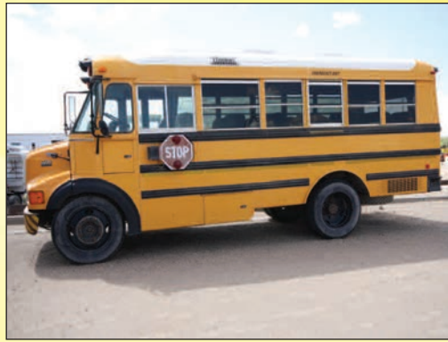
THOMAS/INTERNATIONAL SCHOOL BUS, 26-PASSENGER