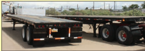
(17) FLATBED TRAILERS-ASSORTED MAKES AND SIZES