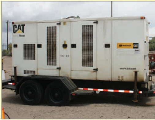
CATERPILLAR DIESEL GENERATOR