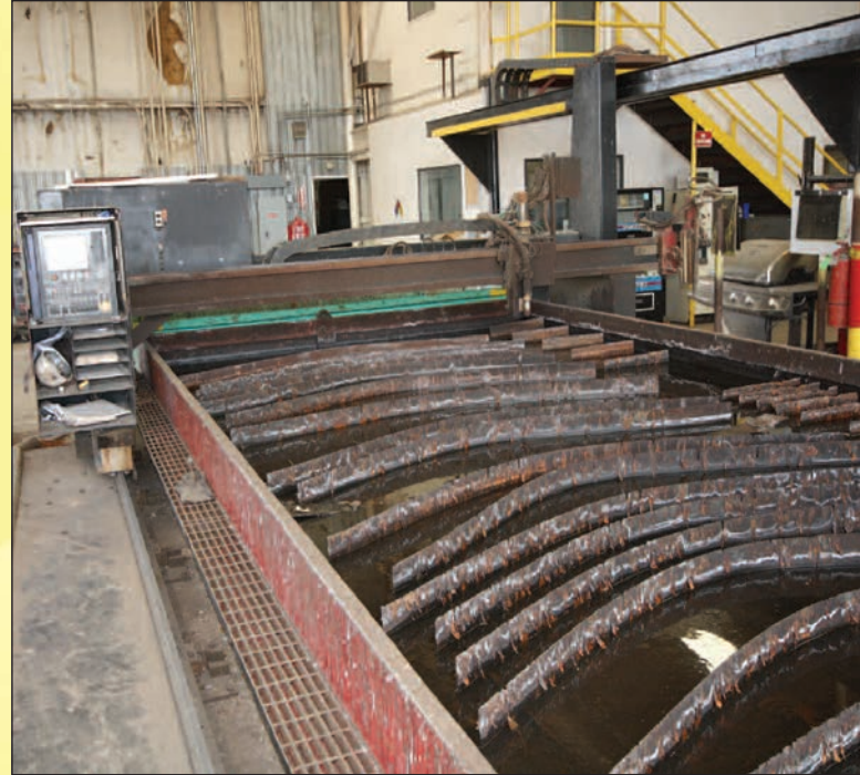
ESAB/LINDE CNC PLASMA SHAPE CUTTING SYSTEM, MDL. CM-350