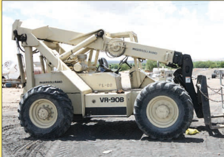
INGERSOLL-RAND ROUGH TERRAIN LIFT TRUCK