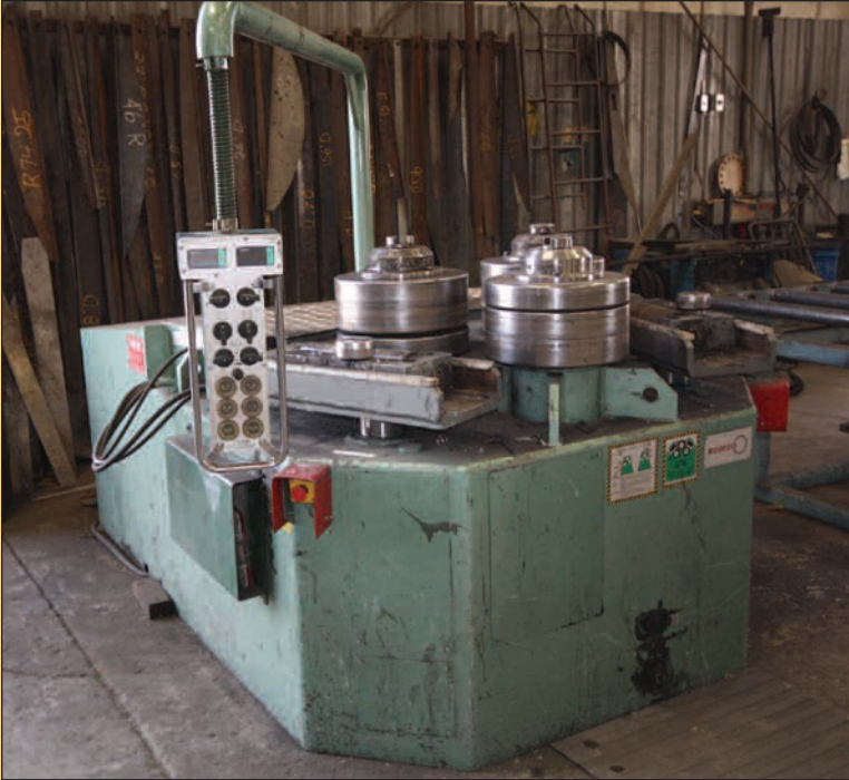
ROUND O ANGLE ROLL, MDL. R-52-S