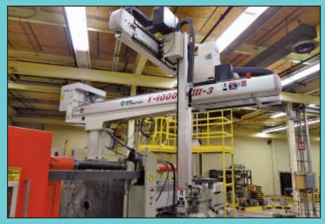
(5) Star Automation Rectilinear Motion Robots