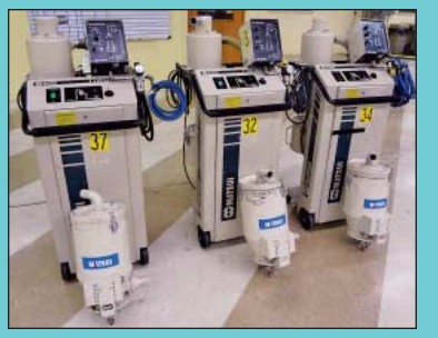
(5) Matsui Model JL4VC Jet Loader Vacuum Loading Systems

10" x 12" Nelmor Model G1012P1 Plastic Granulator; S/N 95E00436, 10 HP, 240 Volts, 3-Phase, Sound Enclosure (New 1995) SEE PHOTO