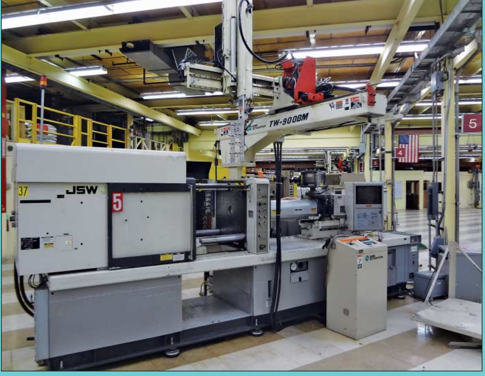
(2) 165 Ton x 11.8 Oz. JSW Model J165E-C5 Horizontal Toggle Clamp Plastic Injection Molding Machines