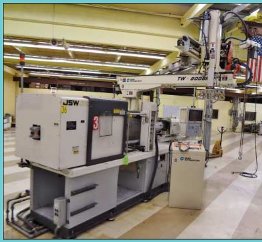
110 Ton x 5.6 Oz. JSW Model J110E-C5 Horizontal Toggle Clamp Plastic Injection Molding Machine