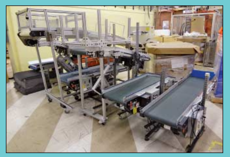
(16) Assorted 8"-12" Wide x 8'-9' Long Horizontal and Inclined Belt Type Conveyors