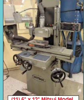
(11) 6" x 12" Mitsui Model MSG-200MH Hand Feed Surface Grinders