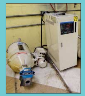
(3) Matsui Model DMZ-80 Dehumidifying Dryers