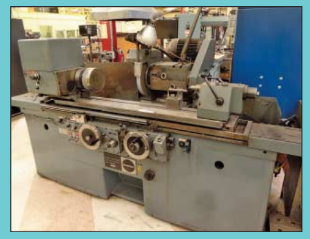
12" x 36" Karsten Series A Cylindrical OD Grinder