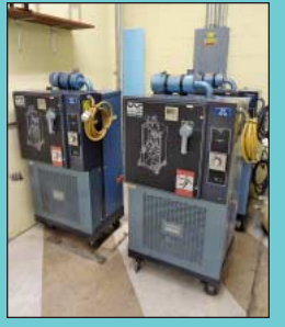
(3) Whitlock Mode SB100RT Dryers