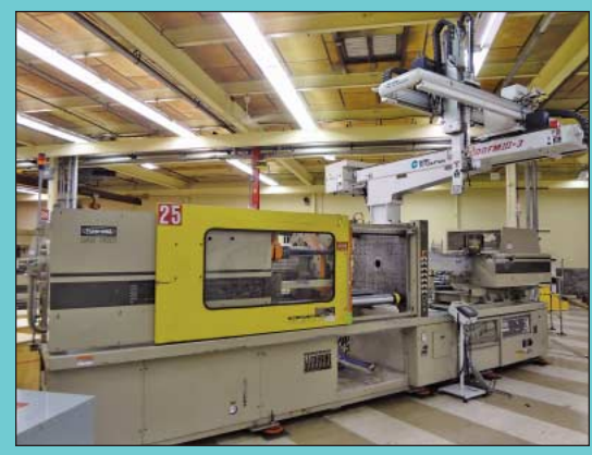
390 Ton x 41 Oz. Toshiba Model ISE390-17B Horizontal Hydraulic Clamp Plastic Injection Molding Machine