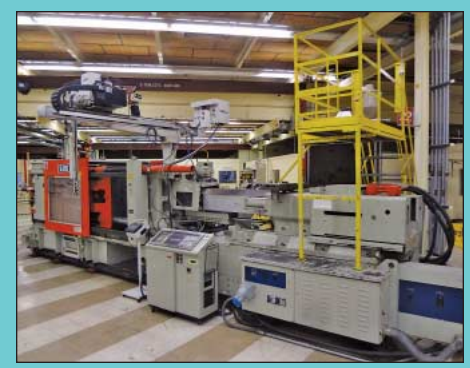
530 Ton x 66.9 Oz. Kawaguchi Model K-480-I Horizontal Toggle Clamp Plastic Injection Molding Machine