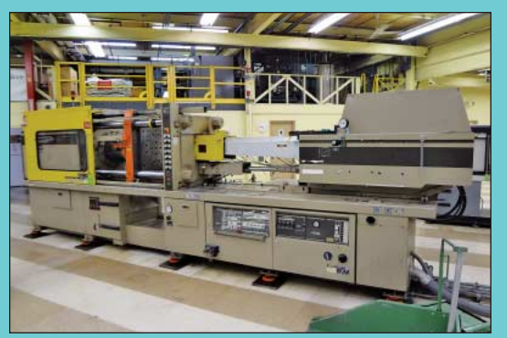
310 Ton x 41 Oz. Toshiba Model ISE310-17B Horizontal Hydraulic Clamp Plastic Injection Molding Machine