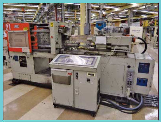
88 Ton x 4.5 Oz. Kawaguchi Model K-80-I Horizontal Toggle Clamp Plastic Injection Molding Machine