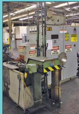
64 KVA Cycle-Dyne Model C-300 Induction Hardening Machine