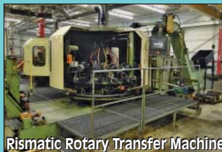
Rismatic Rotary Transfer Machine

2020 DUNLAP ST., CINCINNATI, OHIO 45214 PHONE (513) 241-9701 / FAX (513) 241-6760 WEBSITE: cia-auction.com