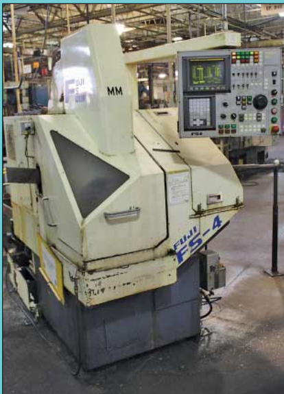
(4) Fuji Model FS4 Two-Axis CNC Chuckers

SURPLUS FROM MICHIGAN FACILITY TO BE SOLD AT ONLINE ONLY AUCTION ENDING SOMETIME JANUARY, 2012