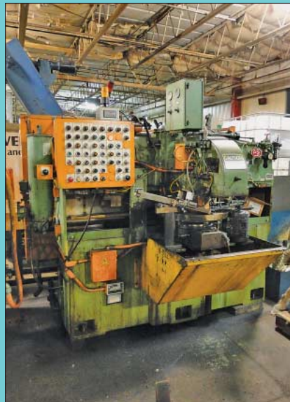
Anderson Cook Model M3305 Spline Rolling Machine