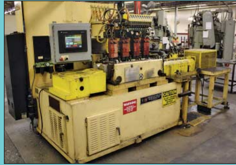
(2) Thielenhaus Microfinish Corp. Model SF125-H8A Eight-Station Super Finish Honing Machines