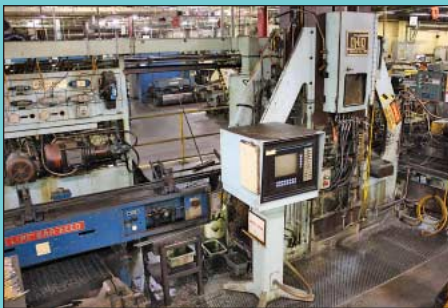
Ohio Broach & Machine Co. Model XDRVS-7558X Vertical Broach