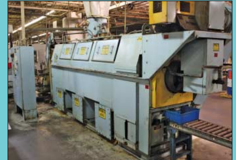
Acme Fab Three-Stage Rotary Barrel Parts Washer