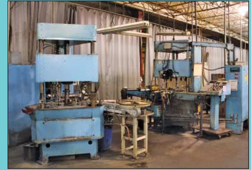
(3) Engis Model VBM3030 Ten-Station Vertical Bore Finishing Machines