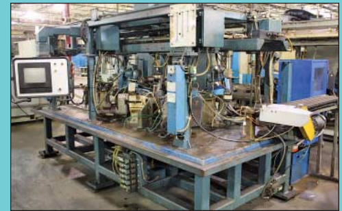
(5) Advanced Kiffer Systems Specialty Drilling Machines