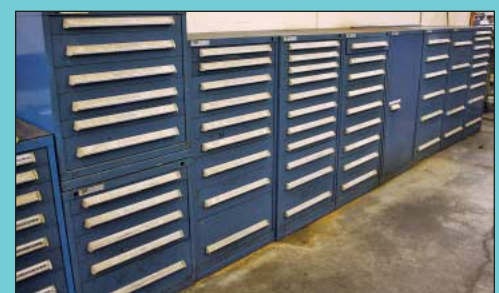
(25) Vidmar Storage Cabinets