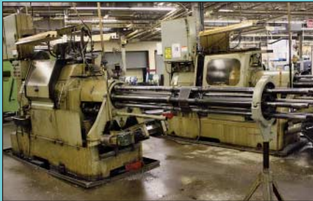
1-1/4" Acme Gridley Model RA-6 Six-Spindle Automatic Bar Machine