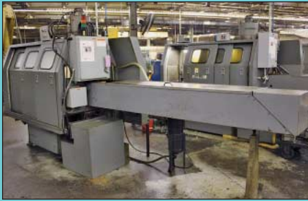
Davenport Model B Five-Spindle Screw Machine