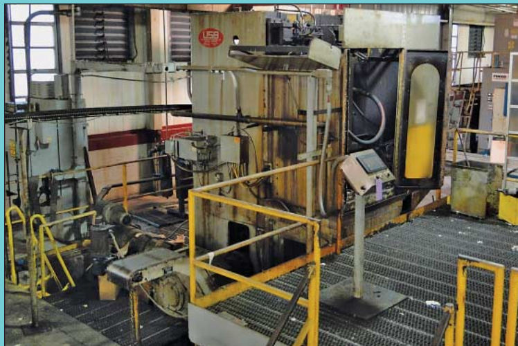
25 Ton X 60" Stroke U.S. Broach & Machine Co. Model VMP-25TX60 Vertical Broach

114 KVA Thermonic Model C5000 Induction Hardening Machine; S/N 7743, Three-Phase, 460-Volts, 50 KW Power Output, Set up with Conveyorized Feed Through, Heating Fixtures, Tanks, Pumps, Torit Collector (HT-26 & HT-13)