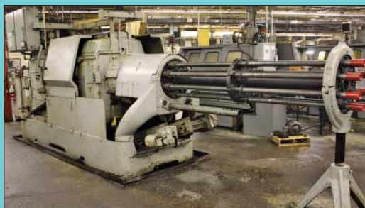
1-5/8" Acme Gridley Model RB-8 Eight-Spindle Automatic Bar Machine