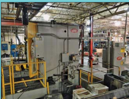
25 Ton X 72" Stroke U.S. Broach & Machine Co. Model VPD-25TX72 Vertical Broach