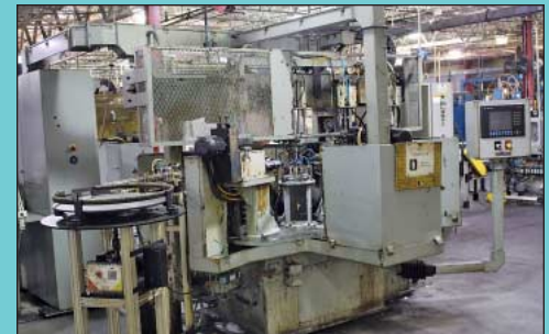
(2) Universal Automatic Corp. Model AM-6 Specialty Drilling & Milling Machines