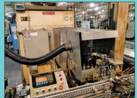
207 KVA Tocco Model SEC805 Induction Hardening Machine