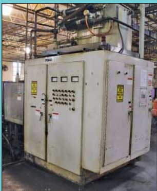
207 KVA Tocco Model SEC805 Induction Hardening Machine