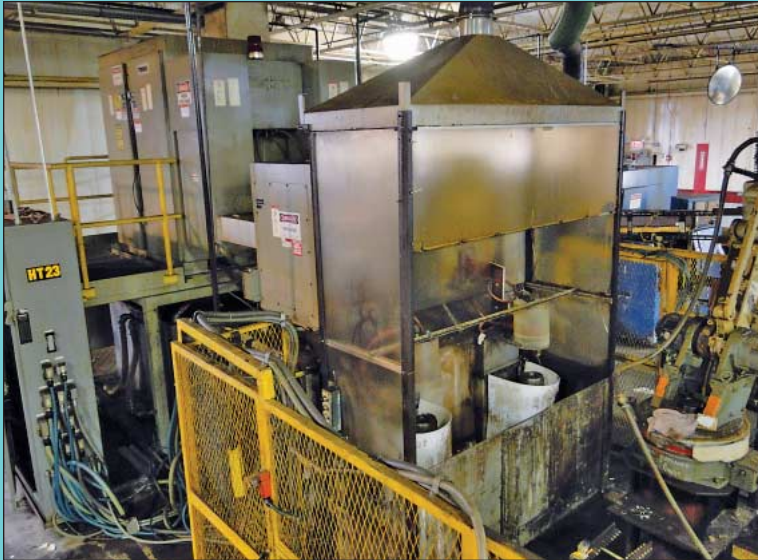
Robotic Load Induction Hardening System w/ Tocco Power Supplies