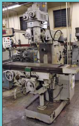
Dahil Model DL-GH2200 Vertical / Horizontal Milling Machine