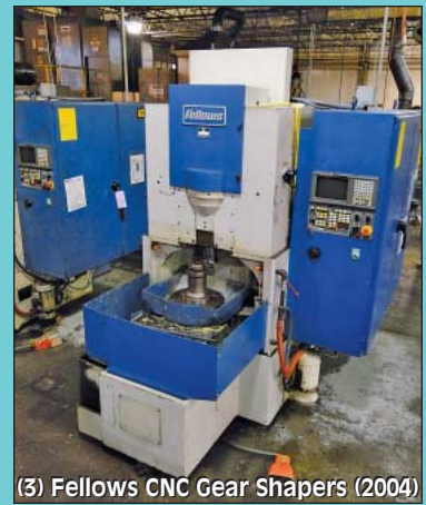
(3) Fellows CNC Gear Shapers (2004)