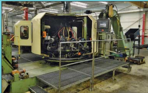
RIS Type Rismatic Model 154C-16 F35 Sixteen-Station Rotary Transfer Machine