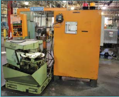
(2) AE Bishop Model Mark XI Slot Generating Machines