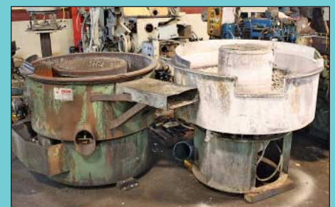
Bank View Sweco and Vibra Vibratory Finishing Bowls