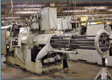
1-5/8" Acme Gridley Model RB-8 Eight-Spindle Automatic Bar Machine