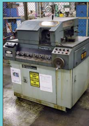
Giddings & Lewis Model Winslomatic HR Automatic Drill Grinder