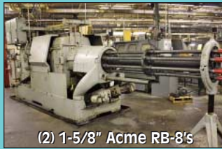
(2) 1-5/8" Acme RB-8's