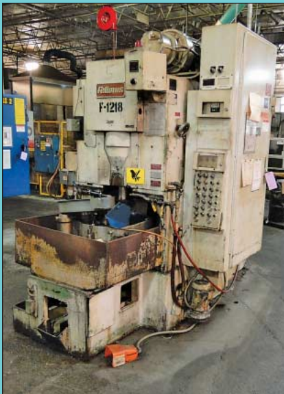
Fellows Model 10-2 Conventional Gear Shaper

Nalle Automation Eight-Station Rotary Parts Inspection Machine; S/N 122040A, Machine Set Up to Check for Proper Threading, Hex & Spline Machining, No. DT01F