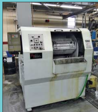
Richwood Industries Controlled Velocity Model C.V.2000SA Barrel Type Rotary Parts Finishing Machine