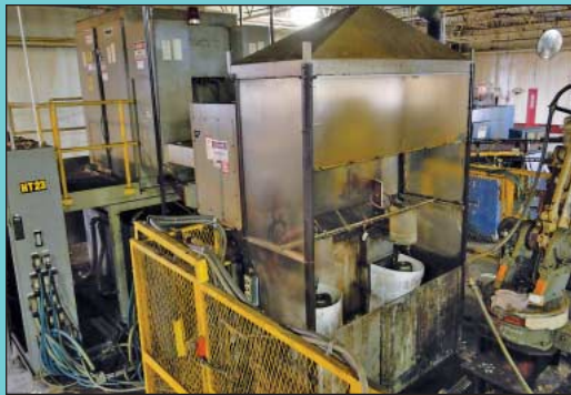
Robotic Load Induction Hardening System w/ Tocco Power Supplies

8229 Tyler Blvd. – Mentor, Ohio 44060 30 Miles Northeast of Downtown Cleveland