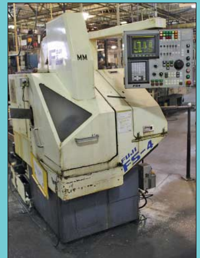
(4) Fuji Model FS4 Two-Axis CNC Chuckers