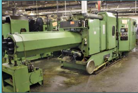
(2) 1-1/4" Schutte Type AF32 Eight-Spindle Automatic Bar Machines