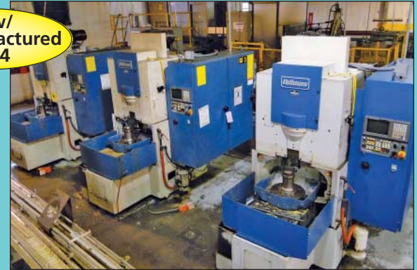
(3) Fellows Model 10-2 CNC Gear Shapers