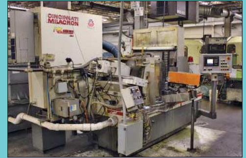
(2) Cincinnati Milacron Model 220-8 Series RK Programmable Centerless Grinders