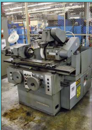
10" X 16" Cincinnati Model R-55 Universal Cylindrical Grinder