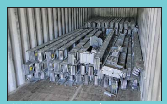
(100) 10' Sect. 600 Amp Square D I-Line II Bussway Sections