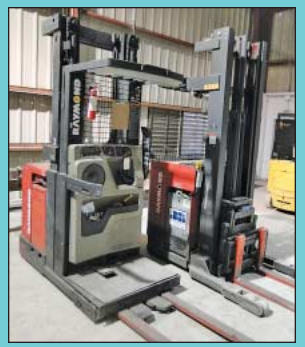
Raymond Electric Stand-Up Reach Truck and Order Picker