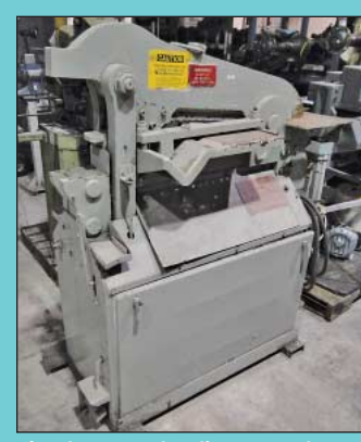
Piranha P5 Hydraulic Ironworke