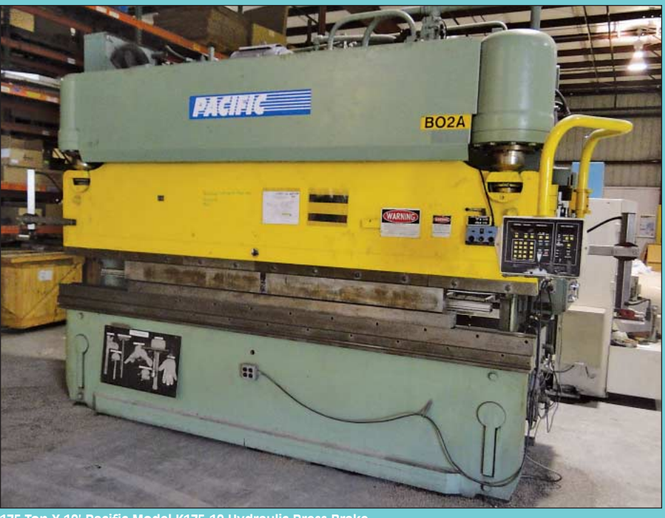
175 Ton X 10' Pacific Model K175-10 Hydraulic Press Brak