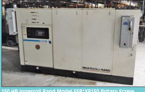
150 HP Ingersoll Rand Model SSR*XF150 Rotary Screw Cabinet Type Air Compressor