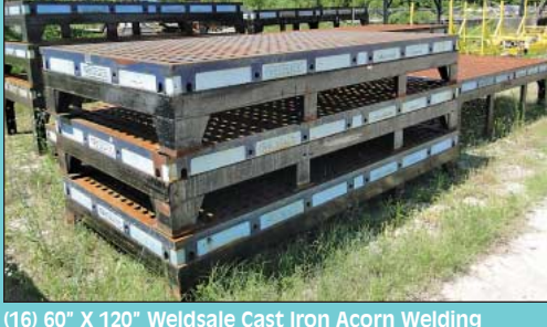
(16) 60" X 120" Weldsale Cast Iron Acorn Welding Tables, Complete With Stands