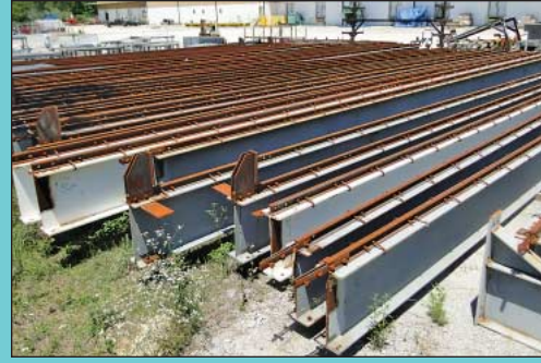
(60) Pieces of Assorted Size I-Beam Crane Rail Webs from 10" to 24", Flanges from 9" to 12"

Hotsy Model S5735-3 Steam Cleaner Graco 55 Gallon Drum Pneumatic Paint Pump