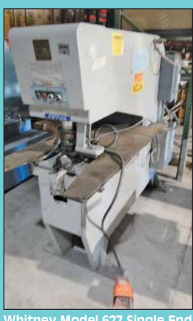
Whitney Model 627 Single End Hydraulic Punch