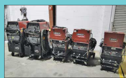
(10) Lincoln Square Wave Tig Welders