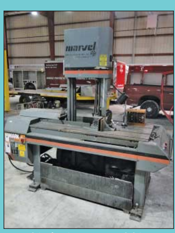
Marvel Series 8MARK II Model 8MARKII Tile Frame Vertical Band Saw