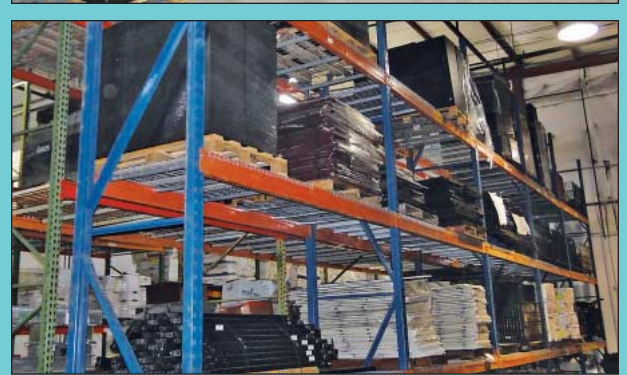
Huge Quantity Approx. (150) Skids Steelcase Modular Office Furniture