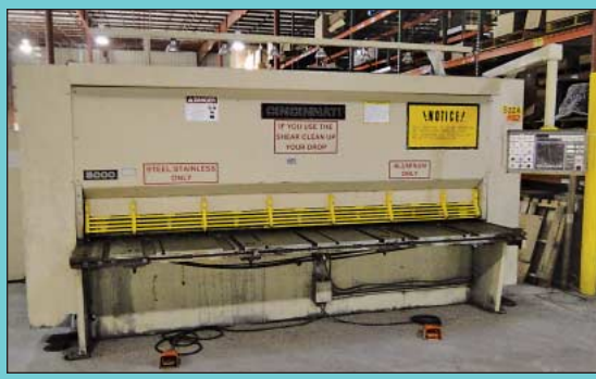
1/2" X 12' Cincinnati Model 5000 Hydraulic Power Squaring Shear