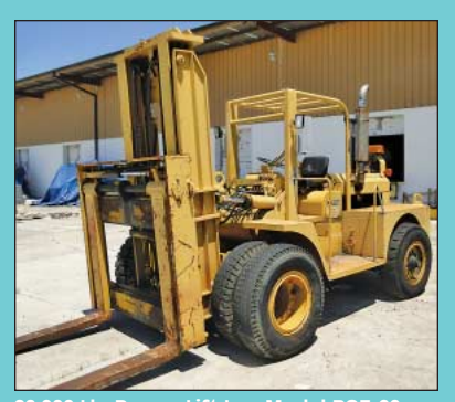
Diesel Power Pneumatic Tire Lift Truck