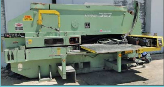
33 Ton Amada Model Vipros 367 CNC Turret Punch