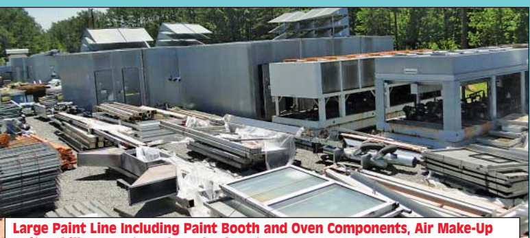
Units, Chillers, Duct Work, and Exhaust Fans