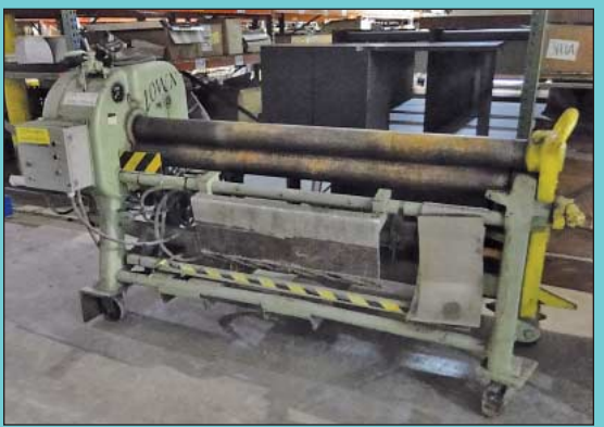
72" Lown Model G500 Initial Pinch Plate Bending Roll