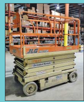
Self Traveling Scissor Lift