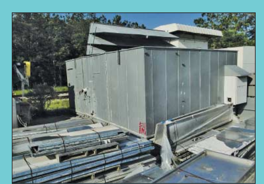
Close-Up View (1 of 5) Air Make-Up Units