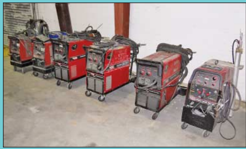
(25) 300 Amp Lincoln Model CU-300 Mig Welders