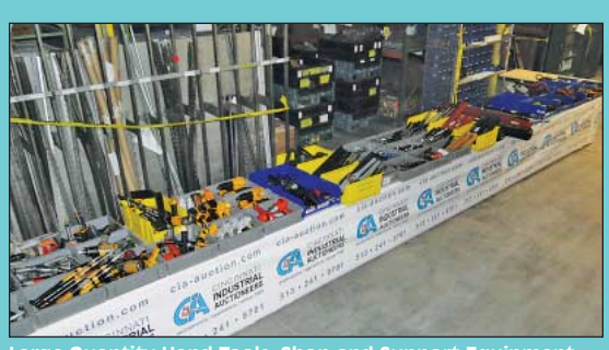
Large Quantity Hand Tools, Shop and Support Equipment