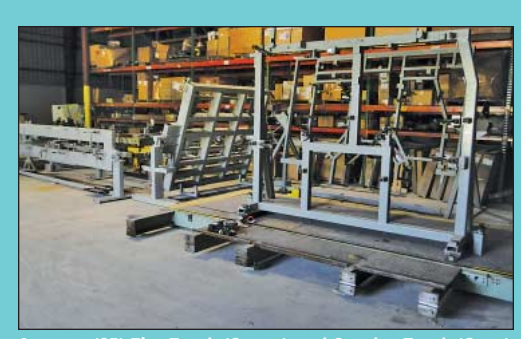
Approx. (25) Fire Truck (Green) and Condor Truck (Grey) Truck Cab Positioner Fixtures