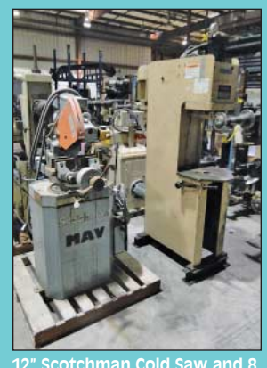
Scotchman Cold Saw and 8