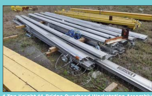
1 Ton Knight 11-Bridge Overhead Workstation Assembly

Time is of the essence with regards to the removal of the equipment from the premises. All items must be removed by June 25th at 4:00 pm. Any items remaining after this time will be considered abandoned and will be scrapped.