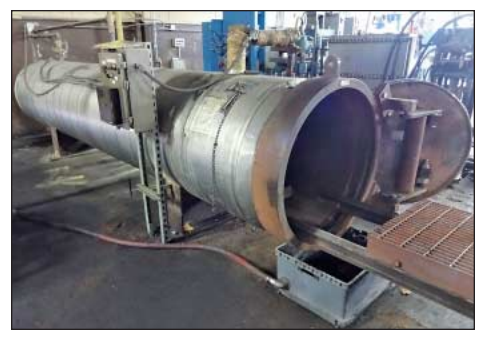
32" Dia. x 15' GD Closure Systems Steam