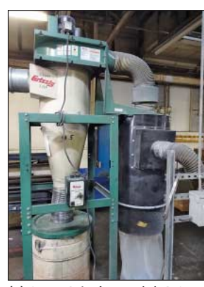
(5) 3 HP Grizzly Model G-0441 Cyclone Type Dust Collectors