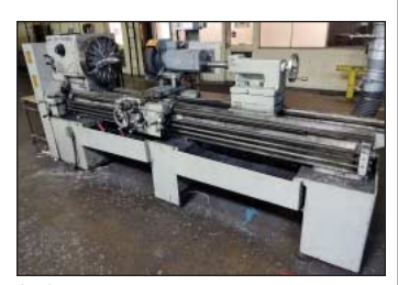
(20) Lathes to 30'

Cincinnati Industrial Auctioneers Inc. 2020 DUNLAP STREET CINCINNATI, OHIO 45214