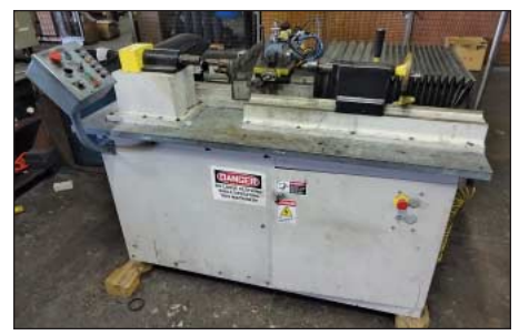
Electro-Cut Precision Rubber Cutting Machine