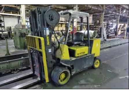
12,000 Lb. Hyster Model S120XLS LP Gas Lift Truck

All Internet bidders must Post a Deposit of Approx. 25% of Your Planned Spending Budget or $5,000.00 Minimum with Cincinnati Industrial Auctioneers in Order to be approved to Bid. Those who do Not Post the Deposit Will Not be Approved. Period.