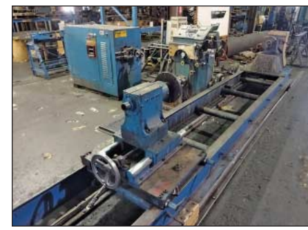
42" x 186" Remco Rollmaster Model USB120x120 Universal Strip Builder