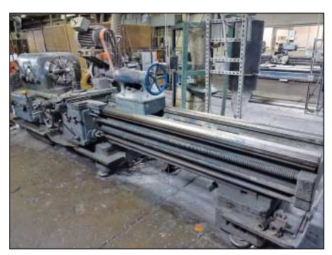
26" x 102" VDF Engine Lathe w/ Approx. 10 HP Grinding Spindle