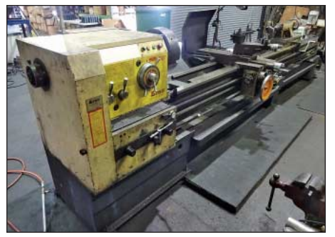
24"/36" x 162" Lyon Type 10T Gap Bed Engine Lathe