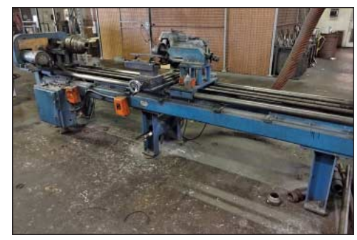
28" x 102" Remco Rollmaster Model G120x106 Polishing Lathe