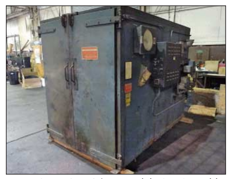
5' W x 6' H x 6' D Grieve Model B2-450 Double Door Gas Oven