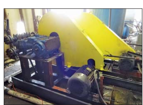
(2) 25-HP High Pressure Pumps