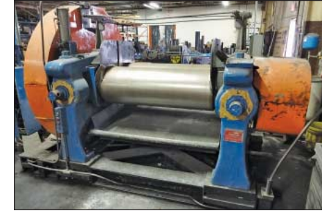
41" x 17" Approx. Farrell Two-Roll Rubber Mill