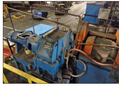
4-1/2" NRM Model 4-1/2-P/M-70-RH-TRA Rubber Extruder