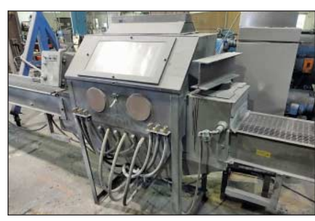
24" x 36" Econoline Blast Cabinet w/ 12" Belt Thru Feed Conveyor and Reclaim