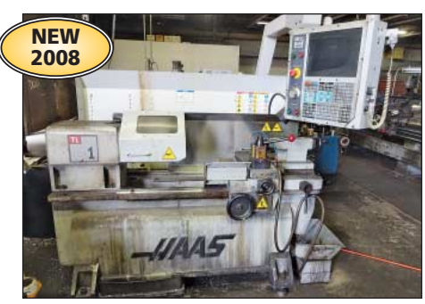
Haas Model TL1 CNC Toolroom Lathe