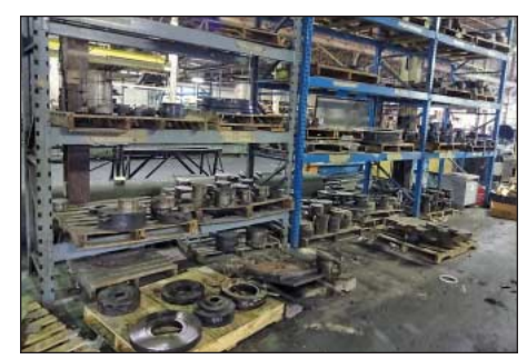
Large Quantity Extruder Dies & Tooling