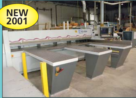
10' Wide Holzma Model Optimat HPP-82/38 CNC Panel Saw