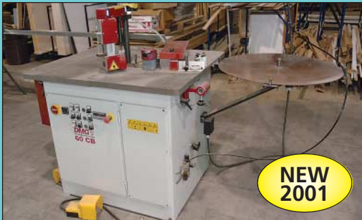
Delmac Machinery Group DMG 60CB Model A16 Contour Edge Bander