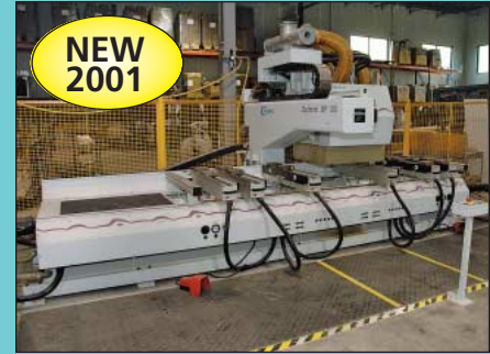
Weeke Model Optimat BP100 CNC Point-to-Point Boring and Machining Center