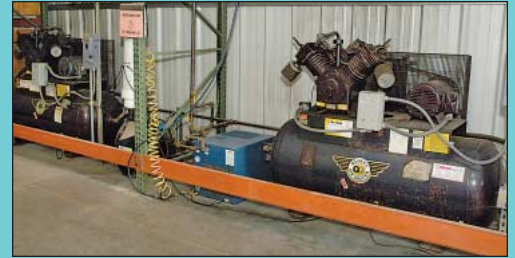
(2) 15 HP Quincy Model QT-15 Two-Stage Horizontal Tank Air Compressors