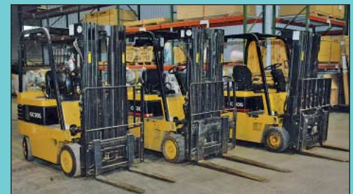
(3) Daewoo Solid Tire LP Gas Lift Trucks