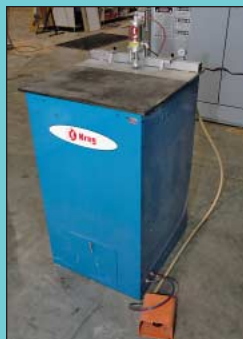
Kreg Tool Model DK-1100FP Automatic Pneumatic Pocket Hole Boring Machine