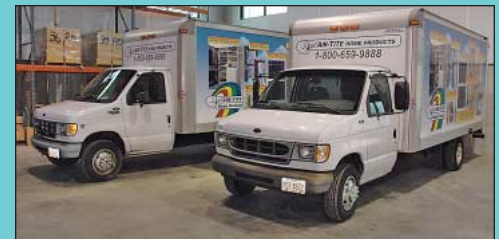
(2) 1999 Ford E-350 Super Duty Diesel 16' Box Trucks

Large Quantity Late Model Office Equipment Including; Neo Post SI-68 Folder / Inserter Machiner; S/N 02-6358, Rena DA-608 Injet Address / Barcode Envelope Imaging System, 30" Roland SP-300 Versa Cam Printer / Cutter, Dell & HP PCs, Inkjet & Laser Printers, HP & Brother Fax Machines, Zebra Label Printers, Scanners, Folders / Insert Machine, Amcat Dialer System w/ Servers & Headsets, Telcor VSI Phone System w/ (46) Phones, (5) Toshiba TV/VCRs, Paper Shredders, (3) Refrigerators, (5) Microwaves, Time Clocks And Many Other Related Items