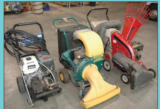
Partial View Late Model Shop and Support Equipment