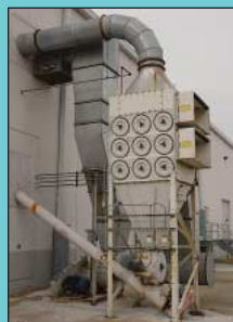
50 HP Donaldson Torit Model DF73-13 Nine-Cartridge Dust Collector