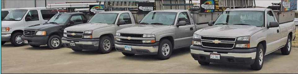
Partial View Vehicle Fleet Including (8) Pick-Ups and (10) Vans