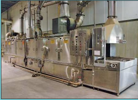
23" Wide Douglas Model WRBO-2500-HLTW Stainless Steel Three-Stage Continuous Belt Type Tote / Parts Washer w/ Hot Air Blow Off