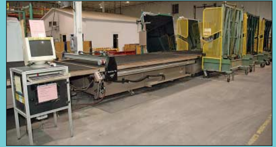
Perfect Tinning Corp. PTC Model Aculite Basic Plus CNC Glass Cutting Table