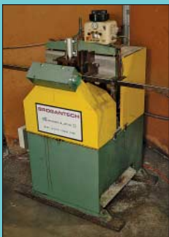
Brogantech Vinyl Window Machine