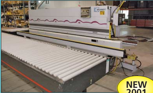
Brandt Optimat KD-67-C Edge Bander