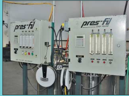
(2) Pres-Fil Model T-4 Argon Gas Stations