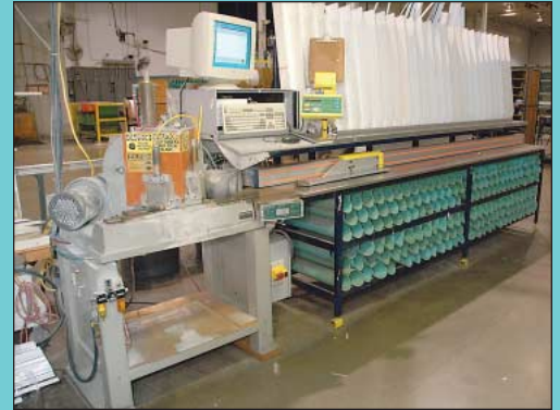
Overall View 12" Sampson Saw and 12' Tiger Stop