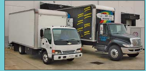
Partial View (2 of 5) Box Trucks To 24' and 2003