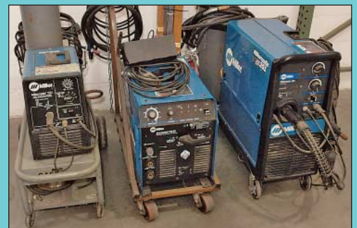
Partial View Late Model Welding Equipment