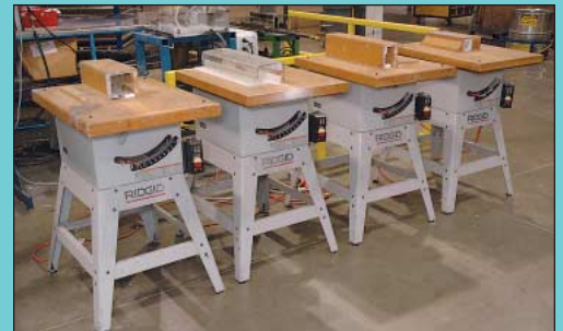
(4) 10" Ridgid Model TS2412-1 Table Saws