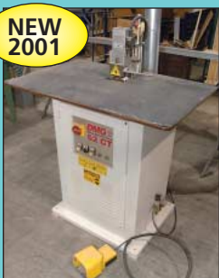
Delmac Machinery Group DMG 62CT Model AZ/2 Laminate Trimmer