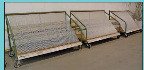
Large Quantity of Harp Carts