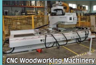
CNC Woodworking Machinery