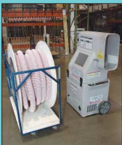
Atticat Portable Expanding Blown-In Insulation System

"Time is of the Essence." All items must be removed by March 29th at 4:00 pm. The Auctioneer and Air-Tite Home Products will lose control of the premises at this time. Any items remaining after this time may be subject to rent and access fees from landlord or considered abandoned and scrapped.