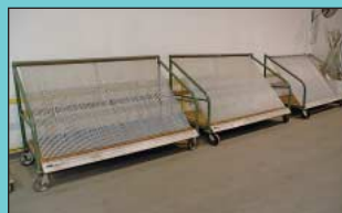
Large Quantity Window Component and Building Material Inventory and Racks and Carts