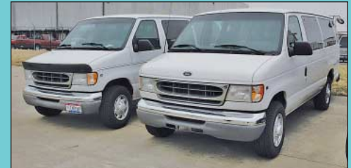
Partial View (2 of 7) Ford Vans