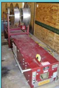
5" KMW Gutterman Panther Seamless Rollformer