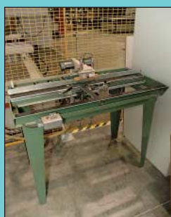
Hurst Engineering Dual Under Table Shelf Router