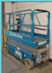
800 LB Genie Model GS-2032 Self-Propelled Electric Scissor Lift