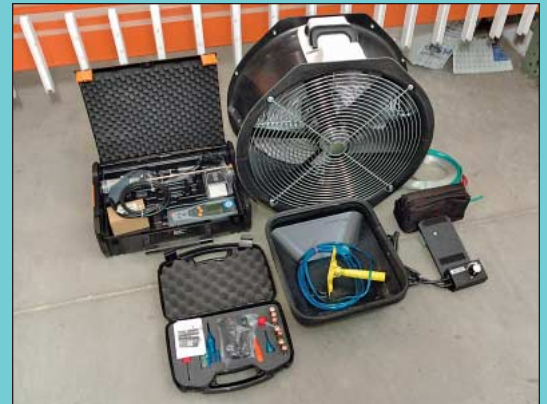
New Never Used Home Energy Loss Inspection System