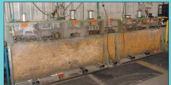
(10) Pneumatic Punching Stations