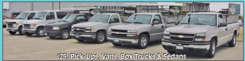
(25) Pick-Ups, Vans, Box Trucks & Sedans

2020 DUNLAP ST., CINCINNATI, OHIO 45214 PHONE (513) 241-9701 / FAX (513) 241-6760 WEBSITE: cia-auction.com