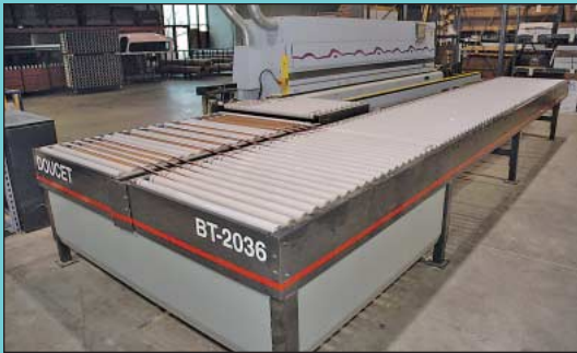
Doucet Model BT-2036 Powered Roller Conveyor