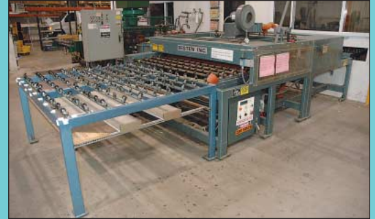
60" Bilco Pass Thru Glass Washer / Dryer Machine