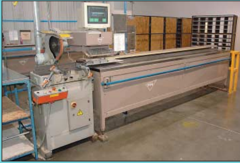
Overall View (4) 14" Elumatec Saws and (2) PTC Programmable Stops