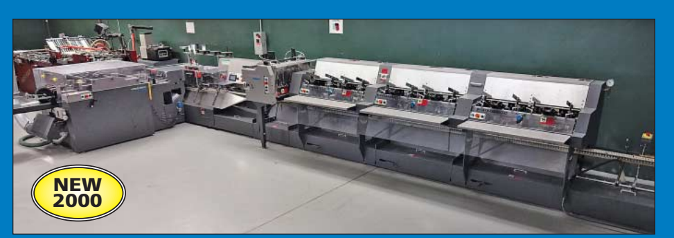
Heidelberg Prosetter Model SP455-S Six-Pocket Saddle Stitching Line w/ Three-Knife Trimmer