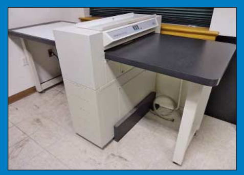
30" Dupont Model WPL-C2 Waterproof Color Proofing Laminator