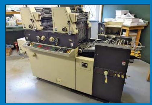
13" X 17" Itek Model 3985T Two-Color Offset Printing Press

Model PL3344-C Plate Punch, X-Rite il Pro Color Management Kit, X-Rite 341 Densitometer, X-Rite 501 Spectrodensitometer X-Rite DTP70