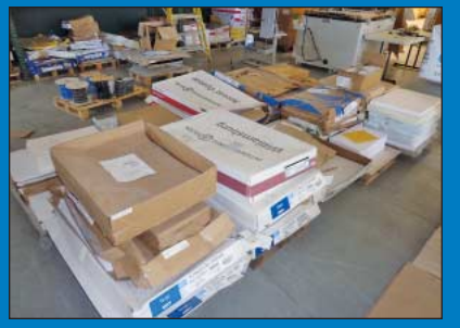
Large Quantity of Various Size Paper Stock, Hundreds of Boxes of Envelopes