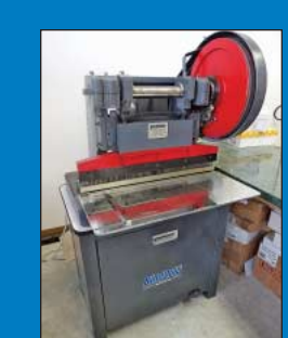
24" BinQuip Model AFP-24 Double Loop Wire Bind Punch