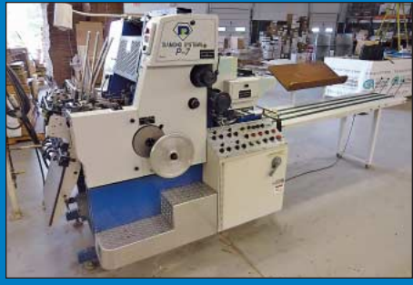
13.5" X 20" Diamond Model P-7-13 Two-Color Perfecting Envelope Printing Press