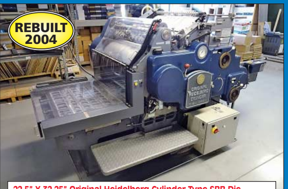
22.5" X 32.25" Original Heidelberg Cylinder Type SBB Die Cutting Press (Rebuilt 2004 By Whittenburg)