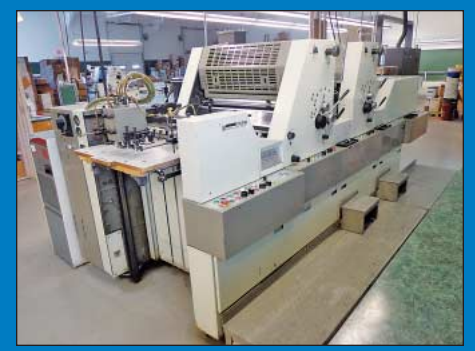
19" X 26" Adast Model Dominant 725 P/AV Two- Color Offset Printing Press