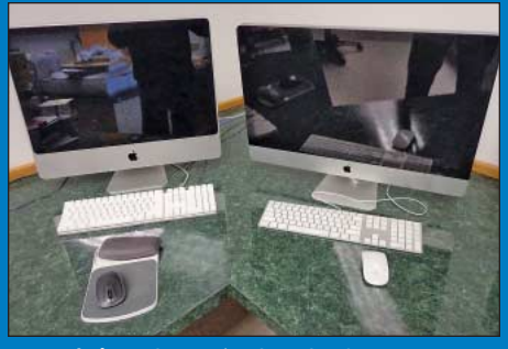
(4) Apple iMac Computer 24" - 27" Screens