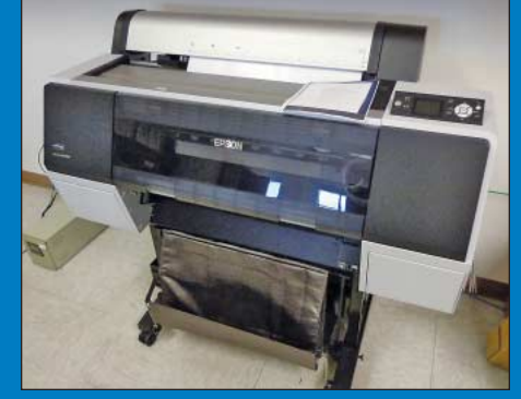
24" Epson Stylus Pro 7890 Plotter

Office Furniture Including; Oak Conference Table with Chairs, (2) 6' X 6' Modular Office Cubicles, File Cabinets, Desks, Chairs, Bookcases, Time Clock