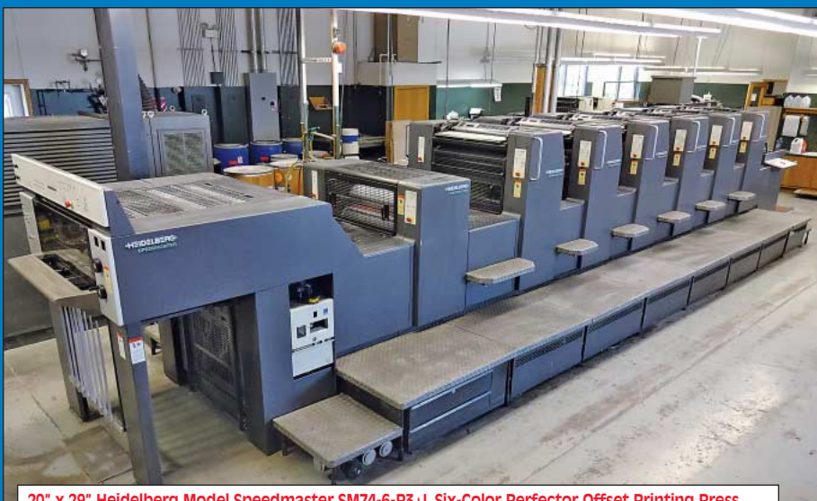
20" x 29" Heidelberg Model Speedmaster SM74-6-P3+L Six-Color Perfector Offset Printing Press w/Coating Tower