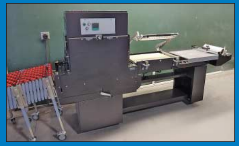
16" X 22" Preferred Packaging Model PP 1622MK-COMBO L-Sealer w/Heat Shrink Tunnel