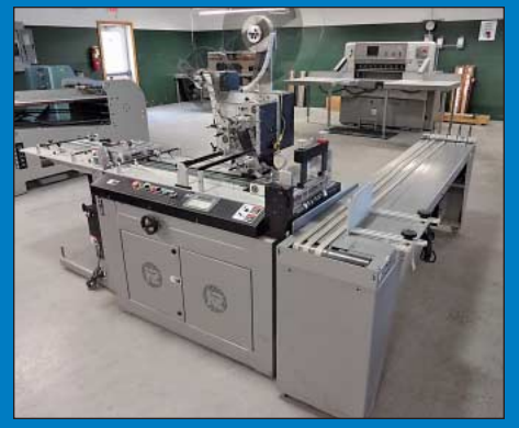
Kirk-Rudy Model KR 535-CS Single Head Tabbing Machine

Creo Model Trendsetter 400 Quantum TS 8 Computer to Plate Machine