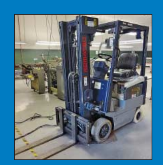
3,500 Lb. Komatsu Model FB18SH6 Electric Lift Truck