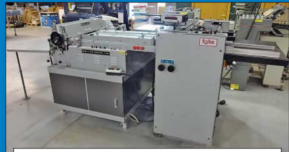
30" Rollem Model TR30 Die / Score System, Perforating /Scoring /Creasing /Slitting Machine

Sale Under The Management Of Cincinnati Industrial Auctioneers 2020 Dunlap St., Cincinnati, Ohio 45214 Phone 513-241-9701 Fax 513-241-6760