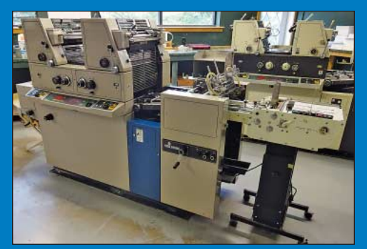
13" X 17" Ryobi Model 3302M Two-Color Offset Printing Press

$5,000.00 Minimum with Cincinnati Industrial Auctioneers in Order to be approved to Bid. Those who do Not Post the Deposit Will Not be Approved. Period.