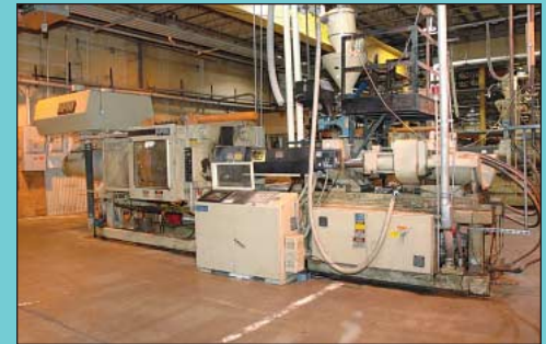
500 Ton X 80 Oz. HPM Model H500-MK-III-80-C Hydraulic Clamp Injection Molding Machine

700 Ton X 120 Oz. Farrel Model 700III120 Hydraulic Clamp Injection Molding Machine; S/N 77WH-2037, 51" X 51" Platens, 35" Between Tie Bars, 44" Daylight, No. 18, Out of Service