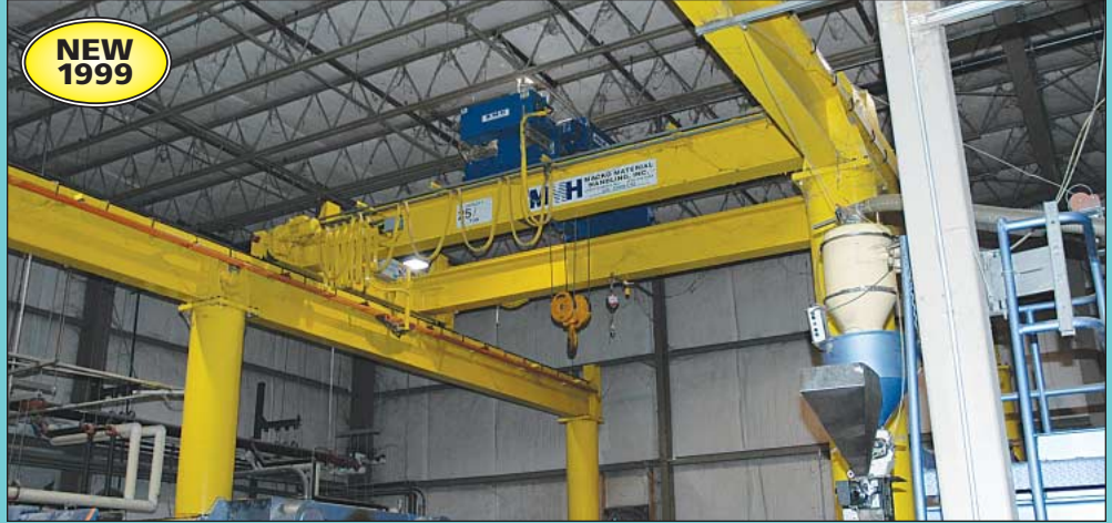
25 Ton X 25' Approx. Span X 120' Approx. Long Macko Material Handling Free-Standing Overhead Bridge Crane