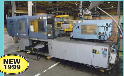
185 Ton X 14 Oz. HPM Model T185-900-A-55M Hydraulic Toggle Clamp Injection Molding Machine

30 Ton Newburg Model H130S Toggle Clamp Injection Molding Machine; S/N 121161305-66, 12" X 12" Platens, 8" Between Tie Bars