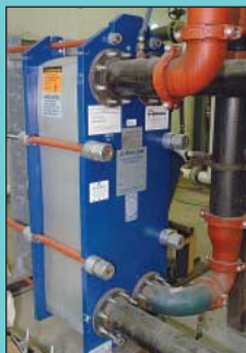
Advantage Model M15GFC Heat Exchanger