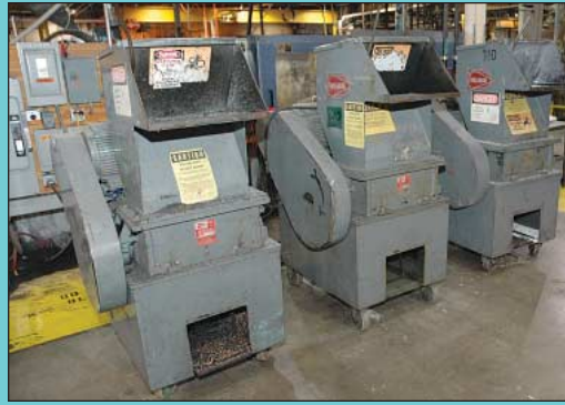
(4) 12" X 20" Nelmor Model G1220 M1/15 HP Plastic Granulators