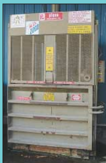
Piqua Model HD2200 Hydraulic Vertical Cardboard Baler