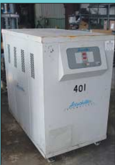
Thermal Care Model Custom Control Cooling Tower Control Panel