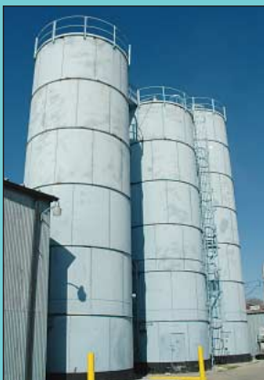
15' X 56' & (2) 15' X 45' Bolt Together Steel Storage Silos