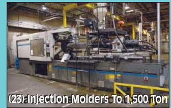
(23) Injection Molders To 1,500 Ton