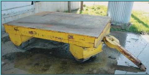
40,000 LB X 6' X 8' Mfg. Unk. Solid Tire Heavy Duty Mold Transfer Cart