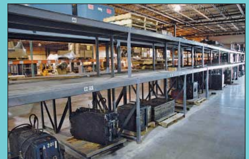
(25) 4' X 10' X 8' H Heavy Duty Mold Racks