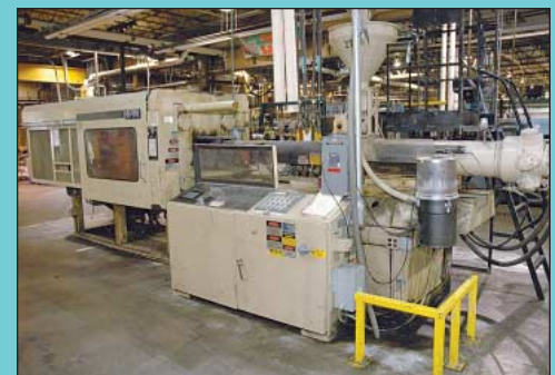
300 Ton X 32 Oz. HPM Model T300-MK-III-32 Hydraulic Toggle Clamp Injection Molding Machine