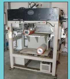
Kensol Model K165H Hot Foil Stamper