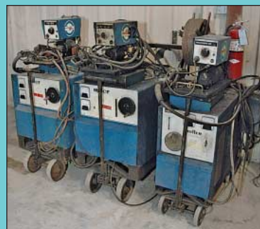
(8) Various Mig Welders