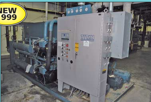
Advantage Model T1-100W-435RX Central Water Chiller

Featuring: (23) Plastic Injection Molding Machines to 1,500 Ton and 260 Oz. by Cincinnati Milacron, Van Dorn and HPM (New as 1999), Large Quantity Plastic Auxiliary Equipment Including Dryers, Granulators, Blenders, Mold Temp Controllers, Chillers and Related, (15) Free Standing Bridge Crane and Monorail Systems to 25 Ton (New as 2004), (6) Silos to 15' X 56', Material Handling System, (8) Air Compressors to 100 HP, Chiller and Cooling Tower Systems w/ Tanks (New as 2000), Toolroom Machinery, Misc. Machinery, Packaging Equipment, Inspection Equipment, (11) Lift Trucks to 20,000 Lb Cap., Large Quantity Shop and Support Equipment