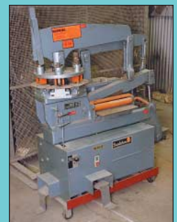
40 Ton Scotchman Model 4014T Hydraulic Turret Punch