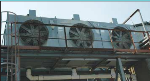
(3) Marley Model Aquatower Pedestal Mounted Cooling Towers