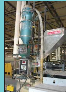
(7) Colomate Equalizer Color Feeders