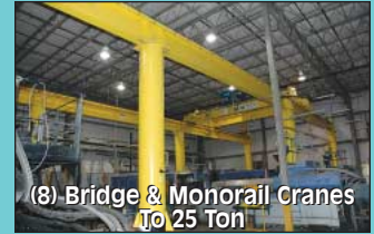
(8) Bridge & Monorail Cranes To 25 Ton