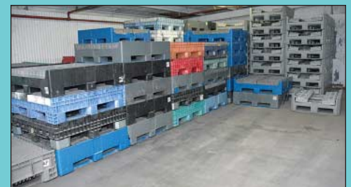
(150) 42" X 44" X 28" Approx. Collapsible Stacking Plastic Tubs