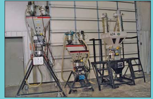
Partial View Maguire & Sterling Weigh Scale Blenders