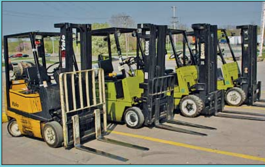
Partial View (11) Lift Trucks From 3,000 Lb. To 20,000 Lb. Capacity