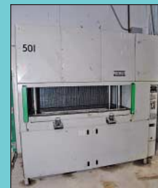
24" X 60" Vinton Hydroweld w/ Branson Digital Controls