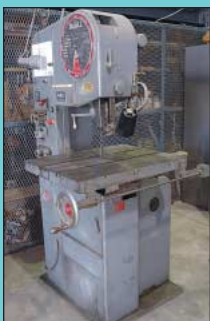
(5) Vertical & Horizontal Band Saws