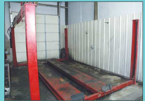
12,000 LB Amco Hennessy Model B4120LW Drive-On Vehicle Lift

Time is of the essence with regards to the removal of the equipment from the premises. All items must be removed by May 31st at 4:00 pm. Any items remaining after this time will be removed and stored at the expense of the buyer, subject to rent / access fees or considered abandoned and scrapped.