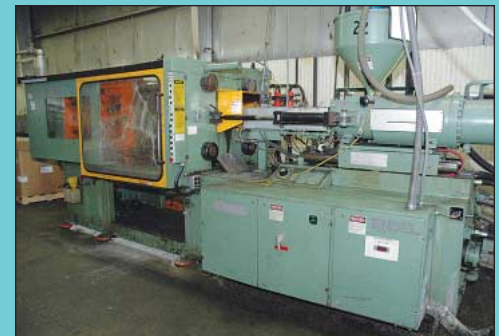
300 Ton X 20 Oz. Engel Model ES1300/300 Toggle Clamp Injection Molding Machine

HUGE SCRAP OPPORTUNITY A lot of the Injection Molding Machines will be sold for scrap at the auction.