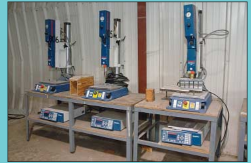
(5) Branson Model 200AE Ultrasonic Welders

Lawson Model MVC Printer Silk Screen Machine; S/N L02821201144