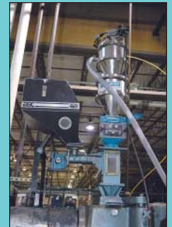
(7) Whitlock Accumeter Color Feeders