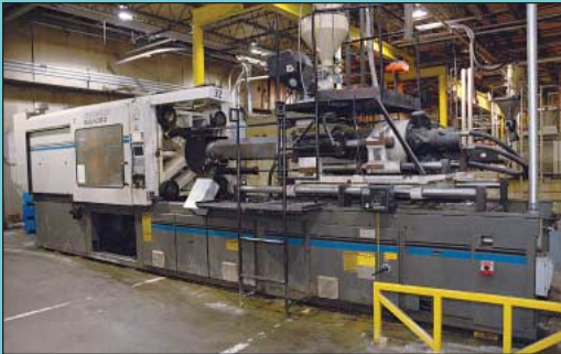
500 Ton X 76 Oz. Cincinnati Milacron Model VH500/76 Hydraulic Clamp Injection Molding Machine