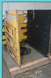
Mfg. Unk. Box Clamp Attachment