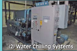
(2) Water Chilling Systems