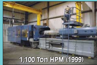
1,100 Ton HPM (1999)

2020 DUNLAP ST., CINCINNATI, OHIO 45214 PHONE (513) 241-9701 / FAX (513) 241-6760 INTERNET: cia-auction.com