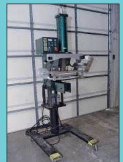
Trekk Foil Hot Stamping Machine