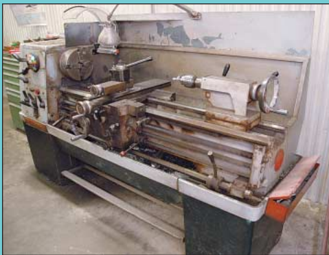
15" X 40" Clausing Colchester Geared Head Engine Lathe