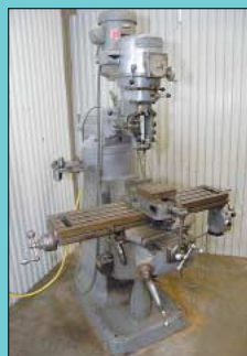
(2) 1-1/2 HP Bridgeport Variable Speed Vertical Mills