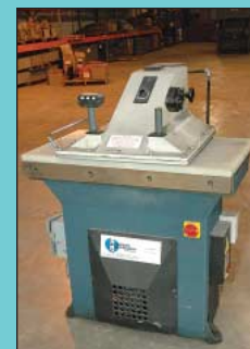
Hudson Machinery Model SL999/5 Hydraulic Clicker Press