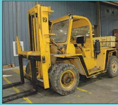
20,000 LB Clark Gasoline Power Pneumatic Tire Lift Truck