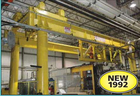
25 Ton X 13' Approx. Span X 45' Approx. Long ACE Engineering Free-Standing Overhead Bridge Crane