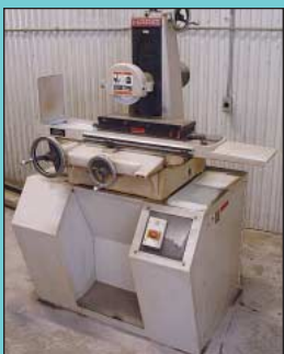
6" X 18" Harig Model 618 Hand Feed Surface Grinder