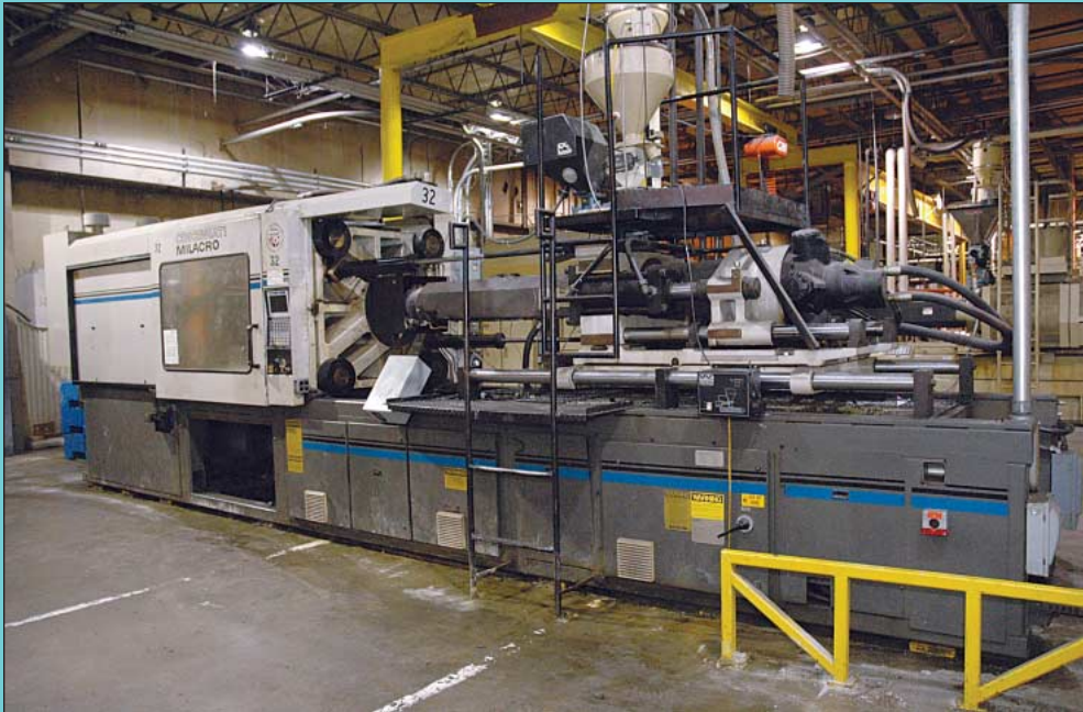
500 Ton X 76 Oz. Cincinnati Milacron Model VH500/76 Hydraulic Clamp Injection Molding Machine