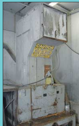
50 HP Cumberland Size 80 Central Granulator