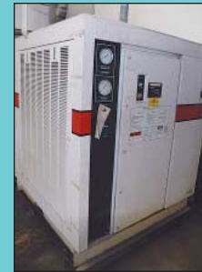
100 HP Gardner Denver Model EAPOMG Cabinet Enclosed Rotary Screw Air Compressor

Large Quantity of Shop Equipment Consisting of; (25) Sections 48" Wide X 10' Long X 90" High H.D. Two-Shelf Die Storage Racks, (30) Sections 42" X 144" X 14" High Pallet Rack, (50) Sections 42" X 103" X 14" High Pallet Rack, H.D. Steel Die Repair Benches, Self Dumping Hoppers, (10) Hydraulic Pallet Trucks, Acetylene Outfits, 5,000 LB Hydraulic Lift Table, Shop Carts, Steel Cabinets, Shelving, Shop Fans, Electric Motors, Injection Molding Repair Parts, Electrical and Plumbing Accessories, Buss Duct And Many Other Related Items