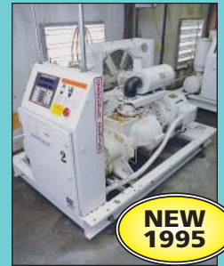
(3) 40 HP Gardner Denver Model EBHQHB Skid Mount Rotary Screw Air Compressors