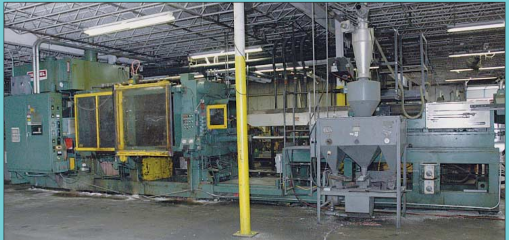
1,000 Ton X 170 Oz. Farrel Model M1000H170 Hydraulic Clamp Injection Molding Machine

(7) Colormate Equalizer Color Feeders; Most w/ Vacuum Loaders, Hoppers and Bunting Magnets SEE PHOTO