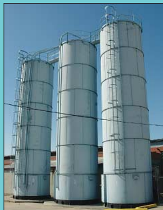
(3) 12-1/2' Dia. X 48' High Butler Steel Bolt Together Storage Silos