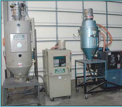
Conair & Whitlock Dehumidifying Dryer & Hopper systems