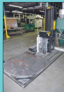
(2) IPM Rotary Pallet Stretch Wrap Machines