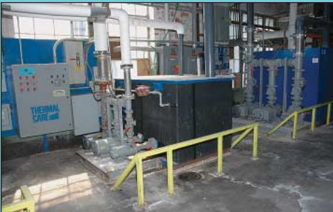
(2) Approx. 1,500 Gallon Steel Water Holding Tanks