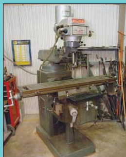
3 HP Acra Model CK4H Variable Speed Vertical Mill