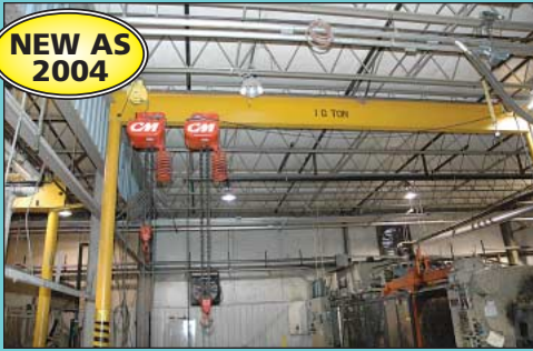
(7) Free-Standing Monorail Crane Systems To 15 Ton