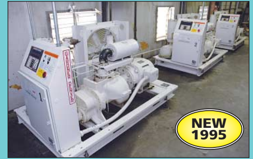
(3) 40 HP Gardner Denver Model EBHQHB Skid Mount Rotary Screw Air Compressors

Approx. 50 Ton x 8' Chicago Mechanical Press Brake 36" Pexto Hand Slip Rolls