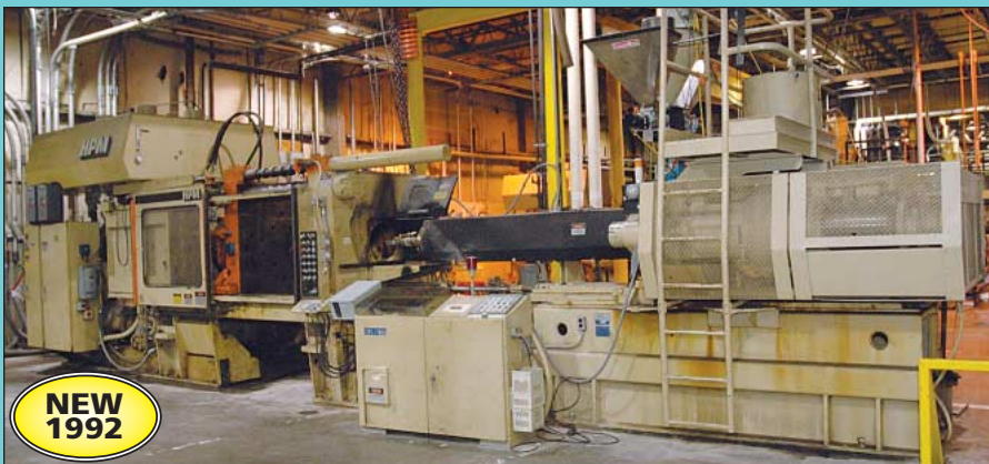
1,000 Ton X 260 Oz. HPM Model 1000-MK-II-260 Hydraulic Clamp Injection Molding Machine