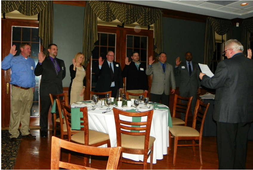
(left) - 2016 Board being sworn in.

Held on January 30, 2016 @ Pebble Creek Event Center