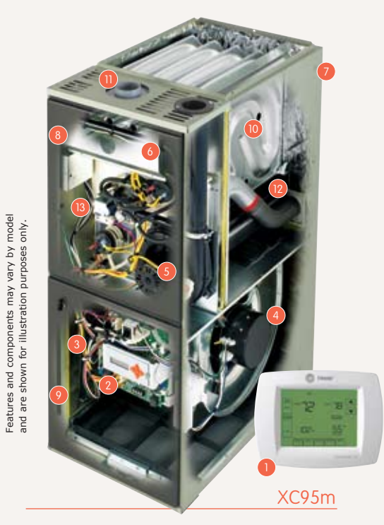
As part of our continuous product improvement, Trane reserves the right to change specifications and design without notice.